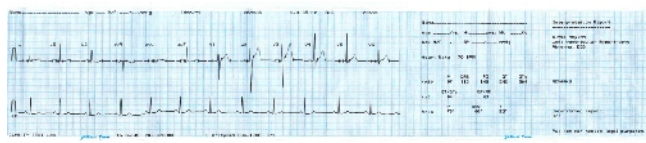
3 Ch ECG Report with Average Complexes, Quantitative Analysis and complete Interpretation