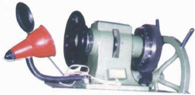
ERICHSEN TESTING MACHINE

S. S. S. Instruments reserves rights of change in the above specification due to constant improvement in design. The dimensions given above are all approximate.