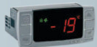
Digital temperature control