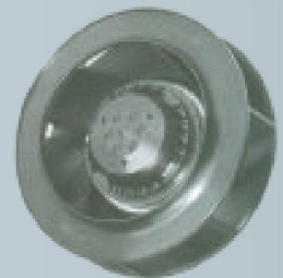
Backward curve blower

Specifications are subject to change without notification