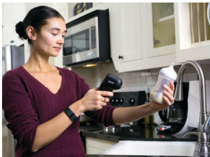
Make sure food is stored and served at a safe temperature