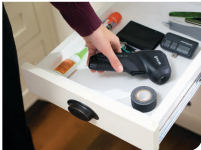
Lightweight and portable, just grab and go