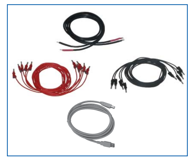
TD 1000 PLUS - Standard cable kit

The kit includes cables for any kind of connection.