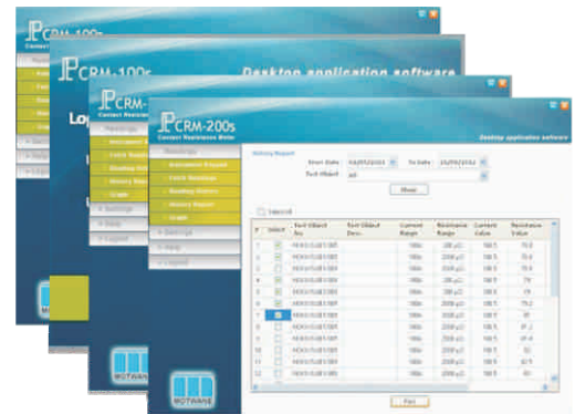
Sample Software Template

Trending of data can reveal vital information about deterioration, the enables user to take informed decision regarding maintenance.