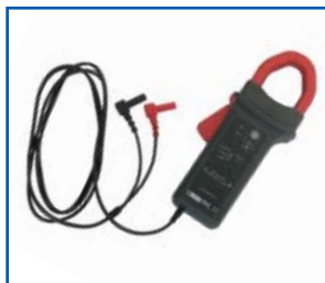
Testing cables and current clamp