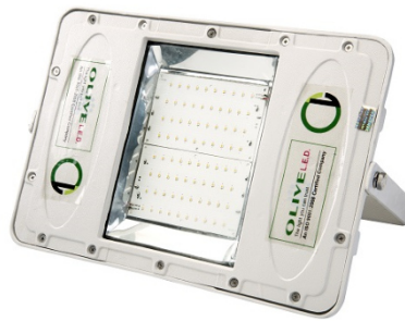
Model No. BLOL-50-100 'MIRA'

Unique Features: Designed and die casted with high class LM-06 grade aluminium supported with all SS 304 grade accessories, toughened glass and equipped with LM 80 certified LEDs and electronic component to perform and give best possible results.