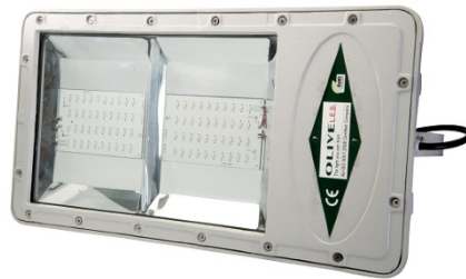
Model No. BLOL-150-200 'TEJA'

Unique Features: Designed and die casted with high class LM-06 grade aluminium supported with all SS 304 grade accessories, toughened glass and equipped with LM 80 certified LEDs and electronic component to perform and give best possible results.