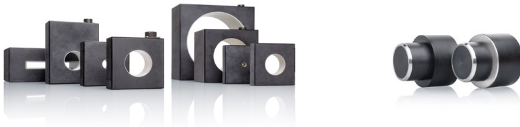
Fig 3: Test sensors and probes

All current coils (HF and NF) as well as probes (HF and NF) can be used with the MAGNATEST ECM.