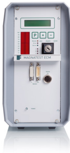
Fig 2: MAGNATEST ECM