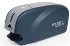
Rewritable ID CARD PRINTER SOLID-310R