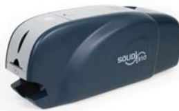
Dual sided ID CARD PRINTER SOLID-310D