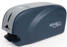
Single sided ID CARD PRINTER SOLID-310S