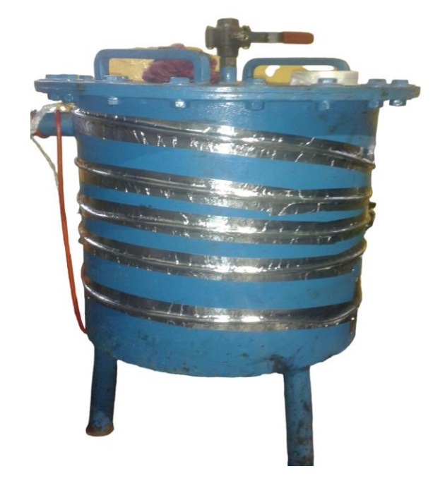
Temperature maintain in Tank