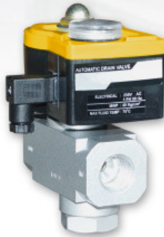
EDV X SS40