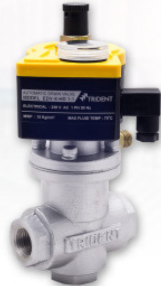
EDV X HD11