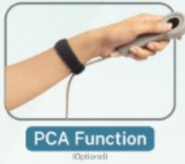
PCA Function (Optional)