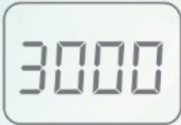
High Flow Rates