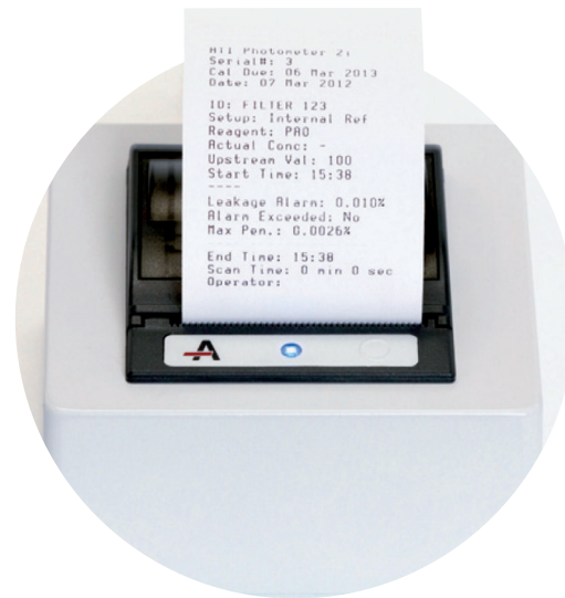
Optional Printer & Sample Report

Three unique report functions are now available with the 2i through the USB or optional thermal printer interface. Continuous mode offers the same output as ATI's legacy photometers to ensure backward compatibility. Monitoring mode provides the ability to collect data at user defined intervals for long term sampling. Summary mode, which gives discrete reporting capability for individual filter locations, can output to the thermal printer to meet customer documentation requirements.