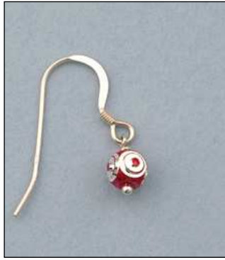
JE102092D6MMF WT: 1.18 gm