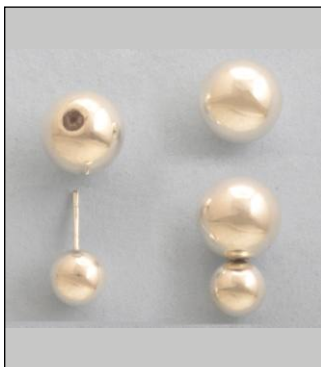
JE180534SL WT: 7.55 gm