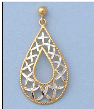
JE1321232T WT: 4.25 gm