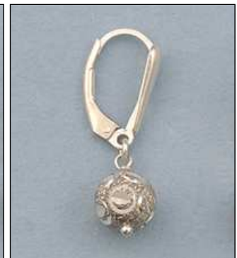
JE1020603T WT: 2.4 gm