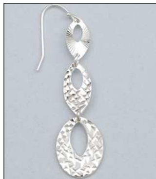
JE100653DC WT: 5.1 gm