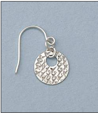
JE101459DC WT: 1.29 gm