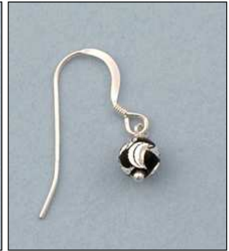
JE102090D6MMF WT: 1.26 gm