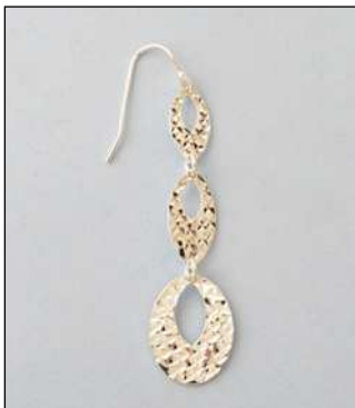
JE181135DC WT: 4.9 gm