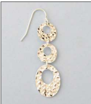
JE181133DC WT: 5.2 gm