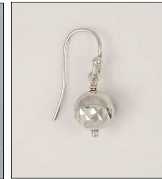
ER181637S8MDC WT: 1.95 gm