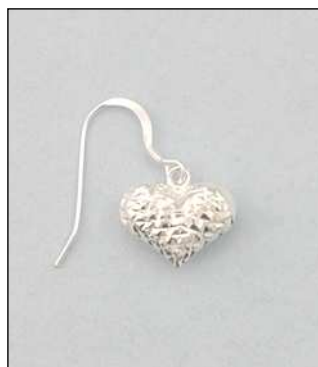
JE180068DC WT: 2.3 gm