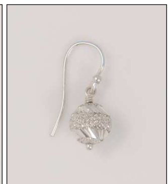
ER181634S8M3T WT: 2 gm