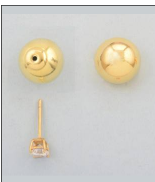
JE180784A18HMG WT: 6.55 gm