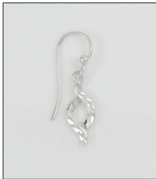
ER181738DC WT: 1.45 gm