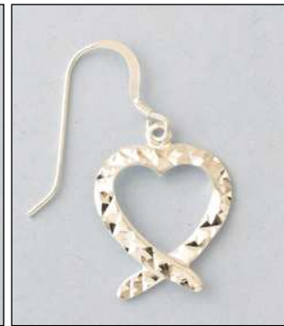
JE181143DC WT: 2.05 gm