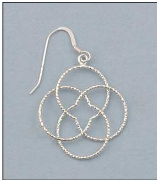
JE102071DC WT: 2.05 gm