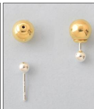
JE1810742T WT: 2.52 gm