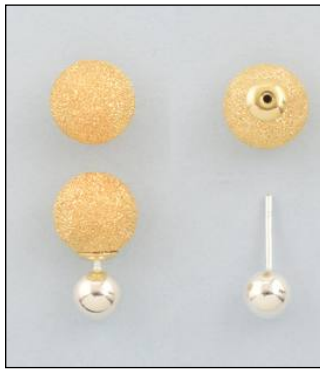
JME1470233T WT: 4.6 gm