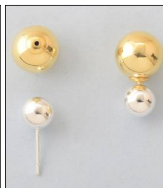
JE1809152T WT: 7.61 gm