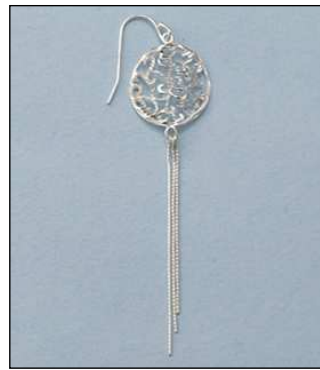
JE102722DC WT: 3 gm