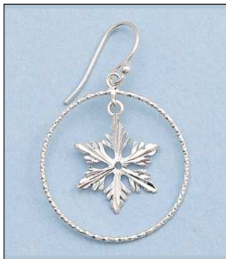
JE101695DC WT: 2.45 gm