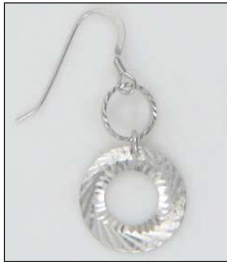
JE1812812T WT: 1.5 gm