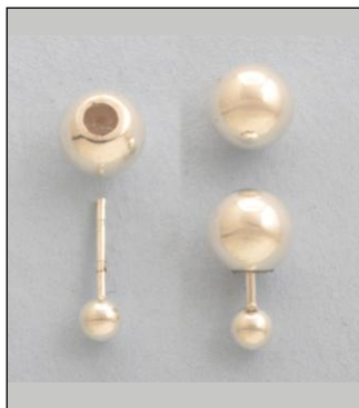
JE180533SL WT: 2.4 gm