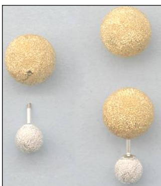
JE1024993T WT: 7.4 gm