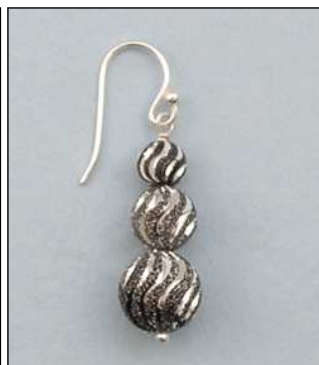
UJE102435MF WT: 5.42 gm