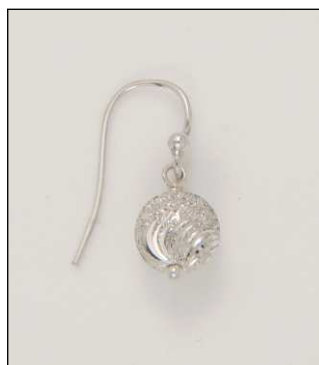
ER181636S8M3T WT: 2.1 gm