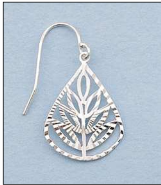
JE101669DC WT: 1.9 gm