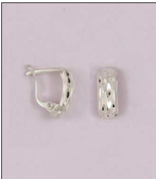
ER182070DC WT: 2.7 gm