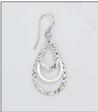
ER181731DC WT: 3.35 gm