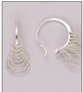
ER182118DC WT: 3.5 gm