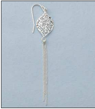
JE102726DC WT: 1.95 gm