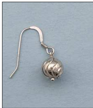
JE1020112T WT: 1.72 gm