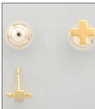
JE1809302T WT: 5 gm