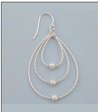
JE1020213T WT: 3.7 gm