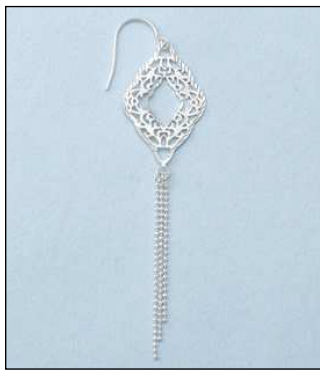
JE102741DC WT: 2.8 gm