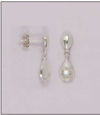
ER181916DC WT: 1.6 gm