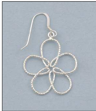
JE102072DC WT: 2 gm