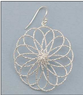
JE102070DC WT: 7.55 gm