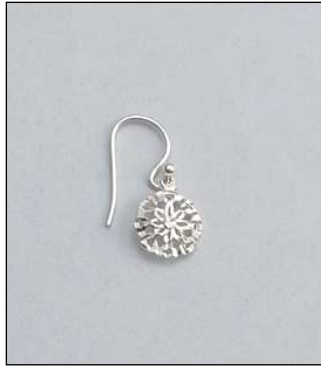
JE100562DC WT: 1.33 gm