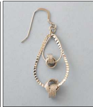
JE1811552T WT: 4.05 gm