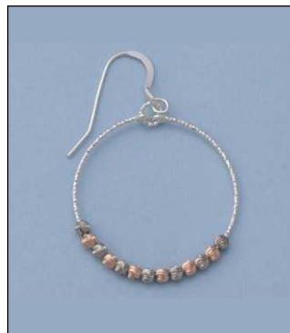
JE101552D32MMF WT: 3.1 gm