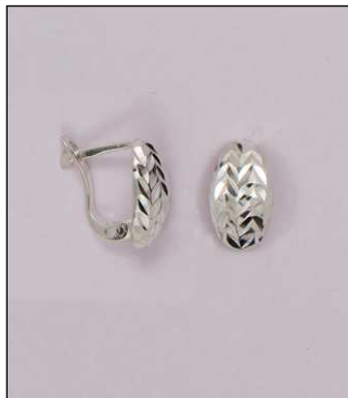
ER182071DC WT: 2.3 gm