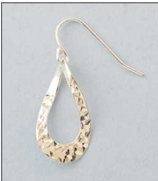
JE181182DC WT: 1.6 gm