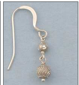
JE1020463T WT: 1.52 gm