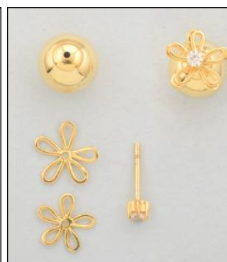
JE180932A18FG WT: 4.85 gm