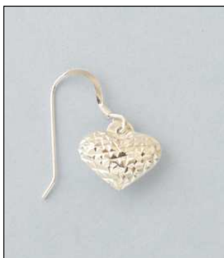
JE181186DC WT: 1.2 gm