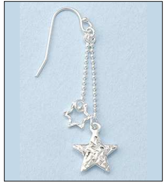
JE102733DC WT: 2.4 gm