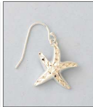
JE181136DC WT: 5.1 gm