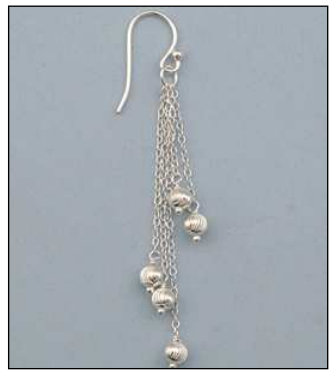
JE1029123T WT: 2 gm