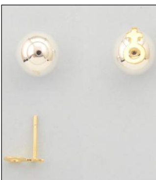
JE1809132T WT: 4.35 gm