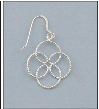
JE102069DC WT: 1.85 gm