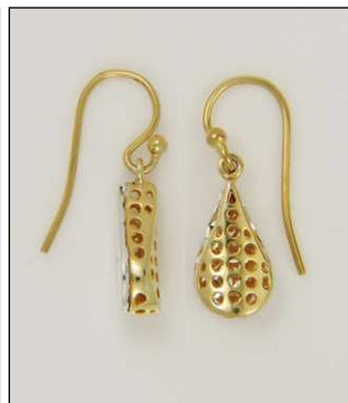
LZER1821943T WT: 2.4 gm