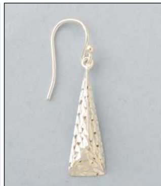
JE181164DC WT: 3.95 gm