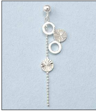
JE102730DC WT: 2.5 gm