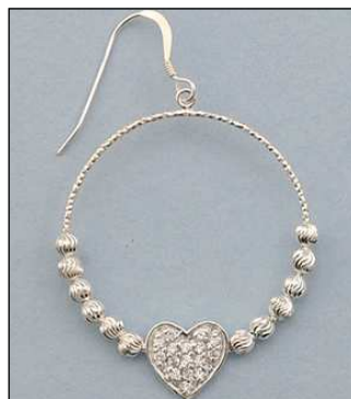
JE104345D30MA18DC WT: 0.18/3.5 gm