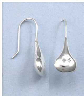
JE100815DC WT: 2.4 gm