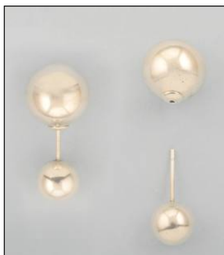
JE180914SL WT: 9 gm