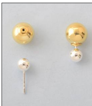
JE1809162T WT: 4.66 gm