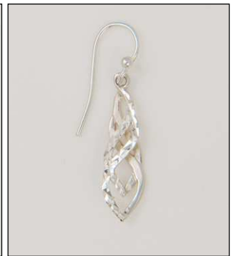
ER181921DC WT: 1.5 gm