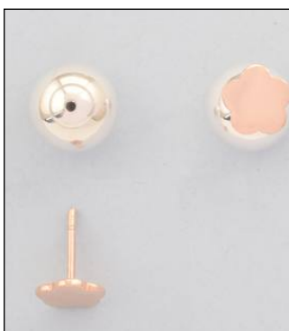
JE1809112T WT: 5.1 gm