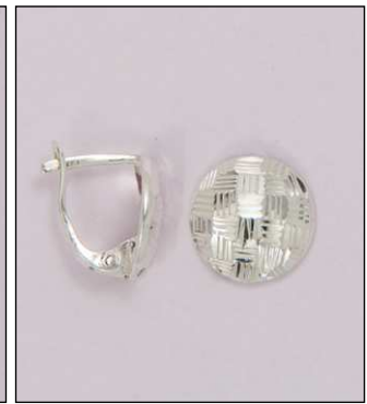
ER182075DC WT: 2.95 gm