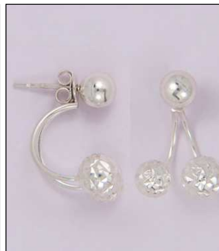
ER181999DC WT: 3.3 gm