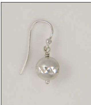
ER181631S8M3T WT: 2.05 gm