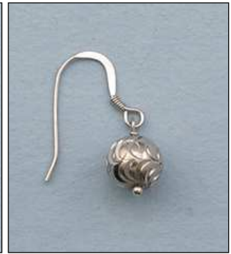
JE1020092T WT: 1.72 gm