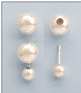
JE180547SL WT: 4.65 gm