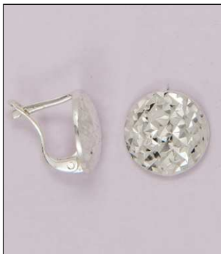
ER182076DC WT: 3.05 gm