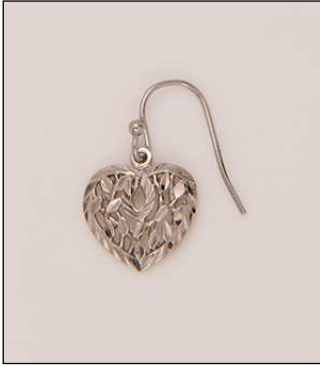
ER1825832T WT: 2.55 gm