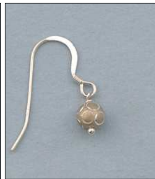
JE1020413T WT: 1.24 gm