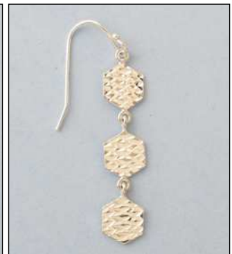
JE181166DC WT: 2.8 gm