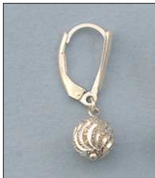
JE1020613T WT: 2.4 gm