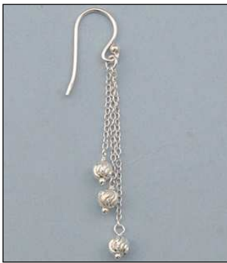
JE1029093T WT: 1.3 gm