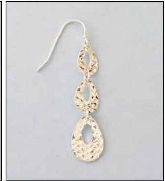
JE181132DC WT: 3.5 gm