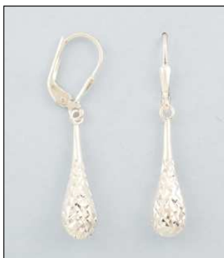
JE181070DC WT: 1.95 gm