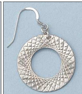
JE1014052T WT: 4.95 gm