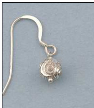
JE1020573T WT: 1.53 gm