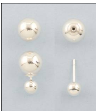
JME147022SL WT: 4.6 gm