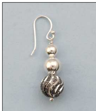
UJE102434MF WT: 5.57 gm