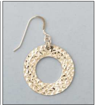
JE181165DC WT: 4.8 gm