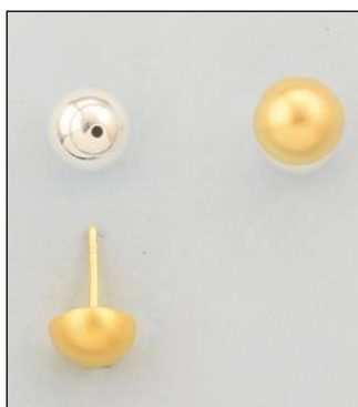
JE1809103T WT: 4.2 gm