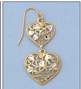
JE1321242T WT: 4.3 gm