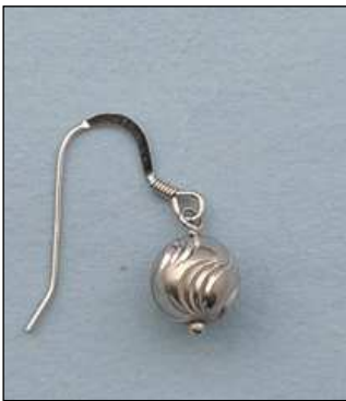
JE1020102T WT: 1.85 gm