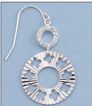
JE101616A18DC WT: 0.11/3.49 gm