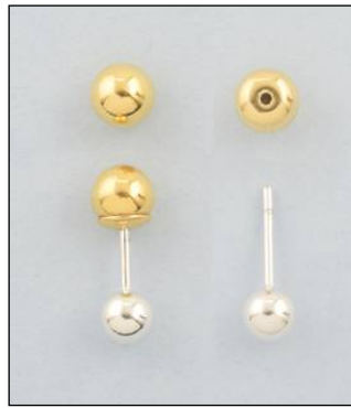
JME1470242T WT: 1.65 gm