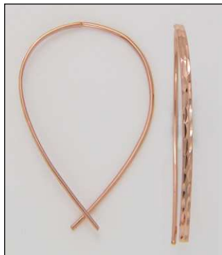
ER1815232T WT: 2.4 gm