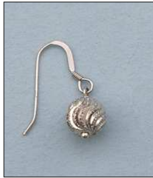
JE1020082T WT: 1.65 gm