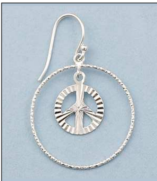
JE101691DC WT: 2.55 gm