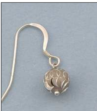
JE1020553T WT: 1.9 gm