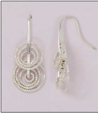
ER182119DC WT: 3.05 gm