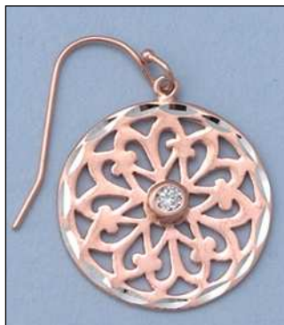
JE101537A182T WT: 0.09/4.61 gm