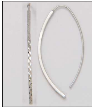
AF18532T WT: 1.75 gm