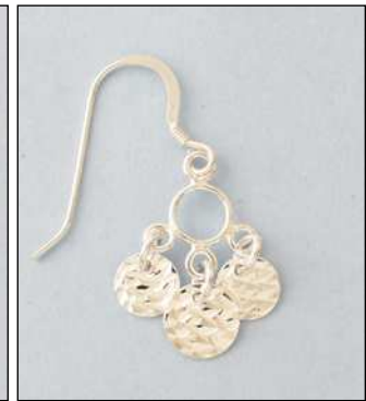
JE181167DC WT: 1.7 gm