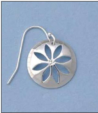
JE101575DC WT: 2.45 gm