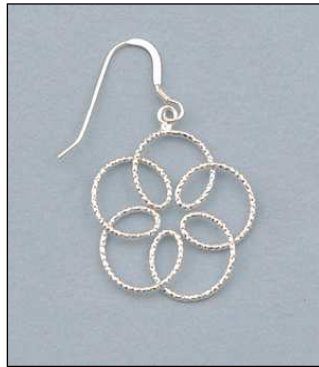
JE102068DC WT: 2.2 gm