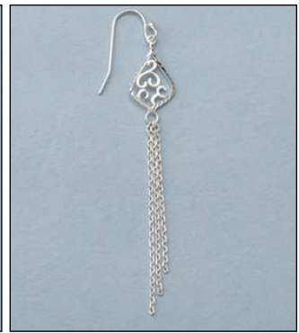
JE102725DC WT: 2.1 gm