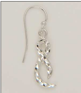
ER181972DC WT: 2.25 gm