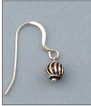
JE102093D6MMF WT: 1.8 gm