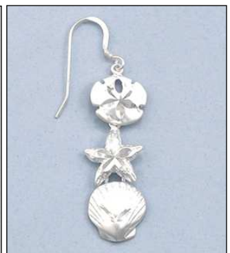
JE1007502T WT: 10.6 gm