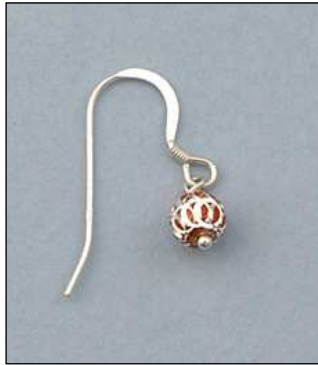
JE102089D6MMF WT: 1.18 gm