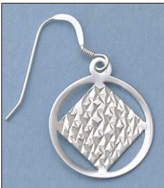
JE101541DC WT: 1.85 gm