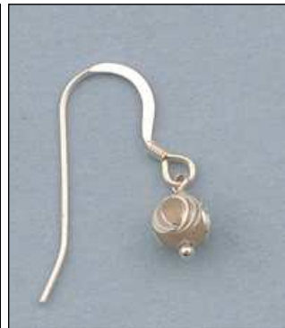
JE1020523T WT: 1.15 gm