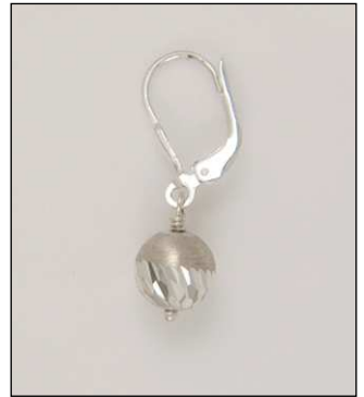
ER181626S8M3T WT: 2.35 gm