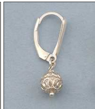
JE1020423T WT: 2.1 gm