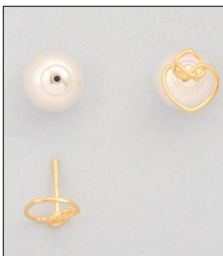
JE1809402T WT: 4.65 gm