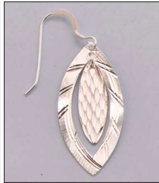
JE180391DC WT: 2.45 gm