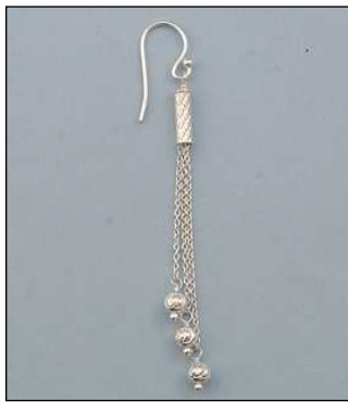
JE1029103T WT: 2.4 gm