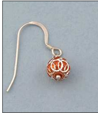
JE102089D8MMF WT: 2 gm