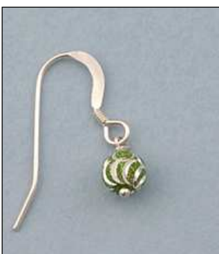
JE102091D6MMF WT: 1.2 gm