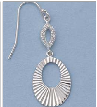
JE101614A18DC WT: 0.1/3.05 gm