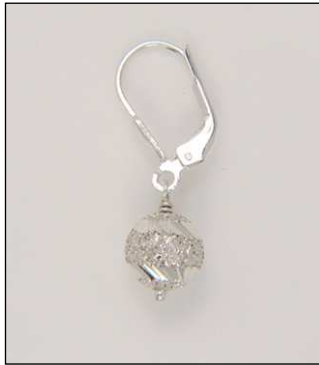
ER181628S8M3T WT: 2.35 gm