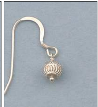
JE1020543T WT: 1.17 gm