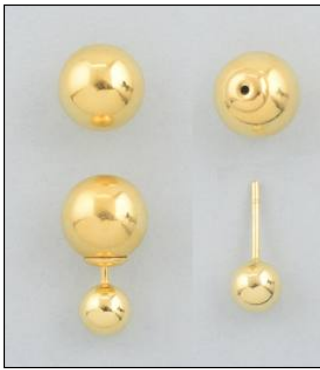
JME147022FG WT: 4.6 gm