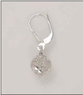
ER181627S8M3T WT: 2.3 gm