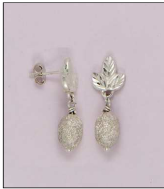
ER1819173T WT: 3.4 gm