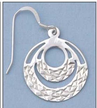
JE101540DC WT: 2.1 gm