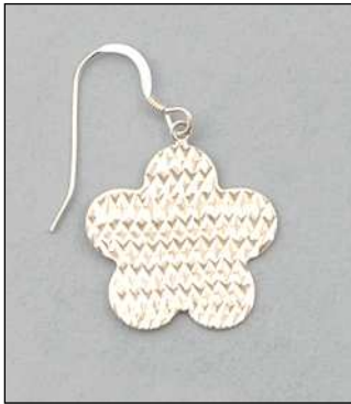
JE180069DC WT: 3.3 gm