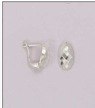
ER182072DC WT: 2.3 gm