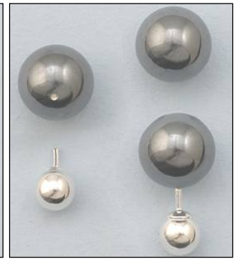
JE1025002T WT: 7.3 gm