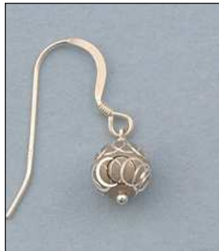
JE1020513T WT: 2 gm