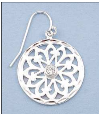
JE101537A18DC WT: 0.09/4.61 gm