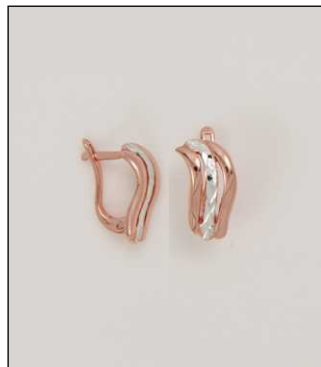
ER1821702T WT: 2.2 gm