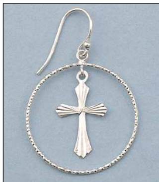
JE101705DC WT: 2.1 gm