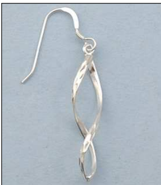
JE101947DC WT: 1.55 gm