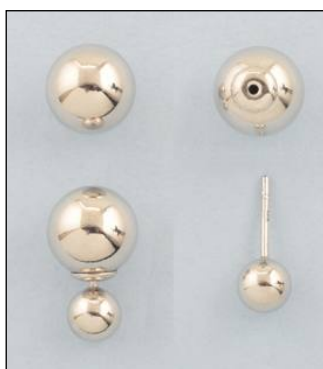
JME147022RH WT: 4.6 gm