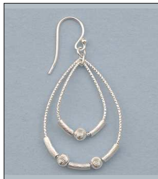
JE1020733T WT: 3.8 gm