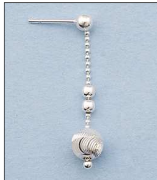
JE102818DC WT: 1.87 gm