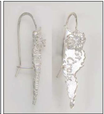
ER181540DC WT: 6.85 gm