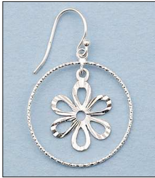
JE101685DC WT: 2.4 gm