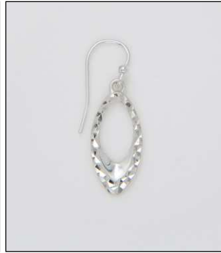
ER181721DC WT: 2.2 gm