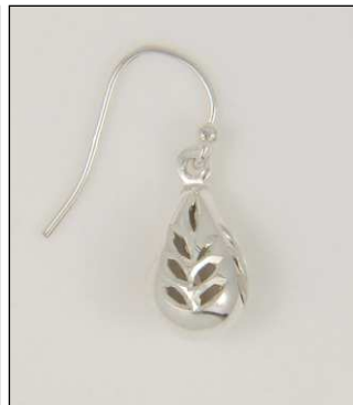
ER182078DC WT: 1.6 gm