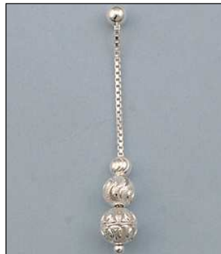
JE102906MF WT: 3.2 gm