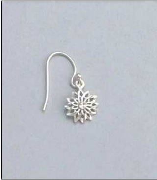
JE100560DC WT: 1.4 gm