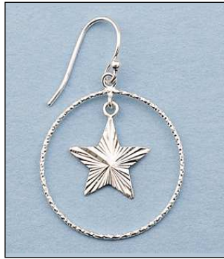
JE101687DC WT: 2.55 gm