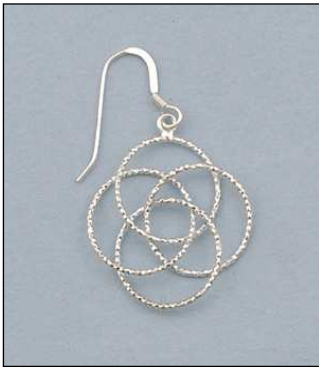
JE102066DC WT: 2.5 gm