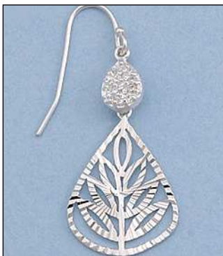
JE101618A18DC WT: 0.11/3.09 gm