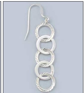
JE100412DC WT: 3.80 gm