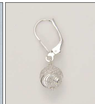
ER181624S8M3T WT: 2.45 gm