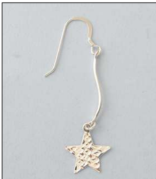
JE181183DC WT: 1.6 gm