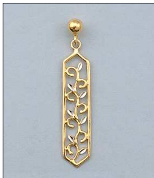
JE1019012T WT: 2.05 gm