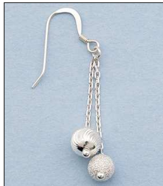
JE1028172T WT: 2.4 gm