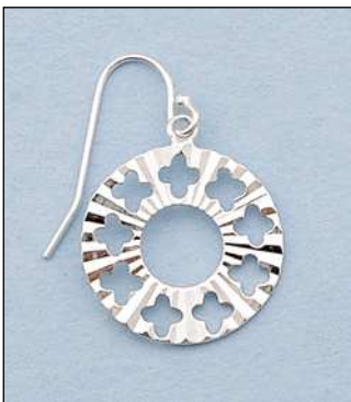
JE101668DC WT: 2.6 gm