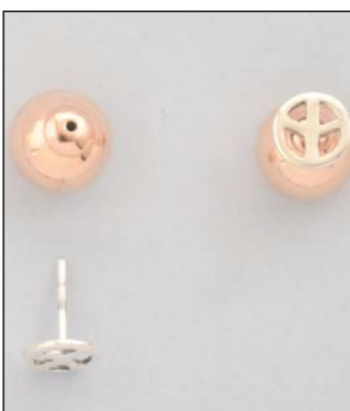
JE1809392T WT: 4.65 gm