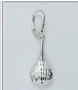
JE181314DC WT: 2.5 gm