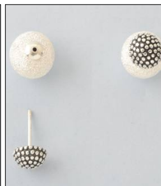
JE1812102T WT: 8.65 gm