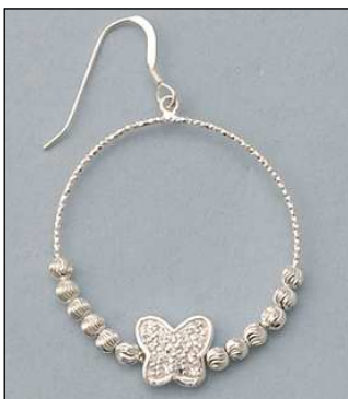
JE102230D30MA18DC WT: 0.12/3.28 gm