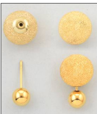
JE1807852T WT: 7.3 gm