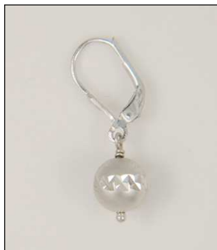
ER181629S8M3T WT: 2.4 gm