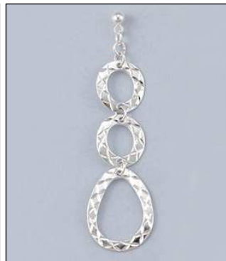
JE100405DC WT: 7.35 gm