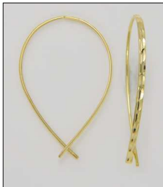
ER1815222T WT: 2.35 gm