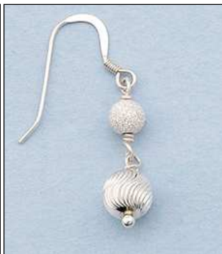
JE1016702T WT: 1.7 gm