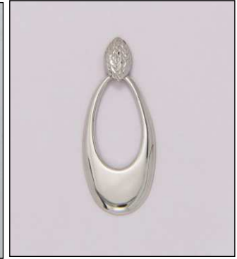
ER1821032T WT: 9.3 gm