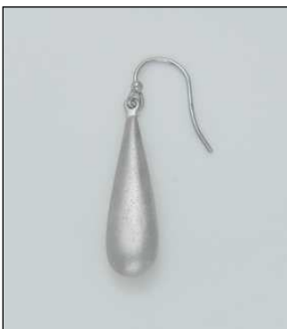
ER1813733T WT: 3.1 gm