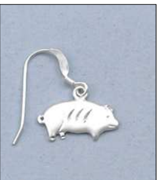
JE1007132T WT: 2.5 gm