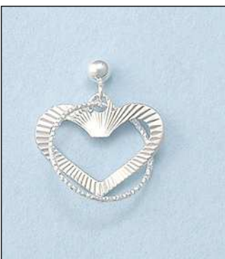
JE101375DC WT: 2.74 gm