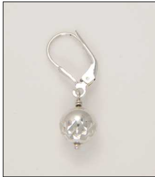
ER181625S8MDC WT: 2.3 gm