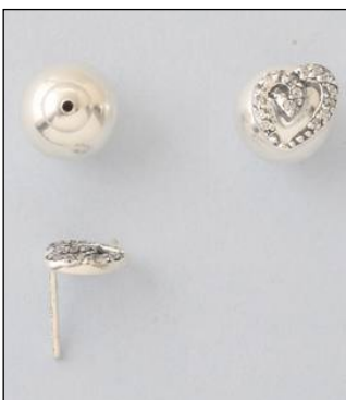
JE181101A182T WT: 5.3 gm