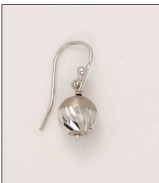
ER181634S8M3T WT: 2 gm