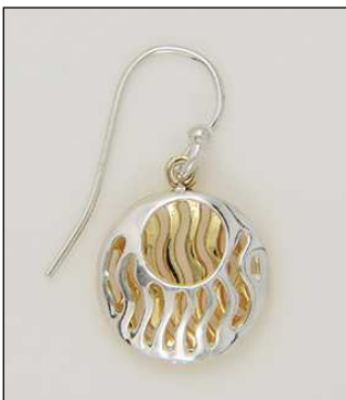
LZER1821642T WT: 2.35 gm