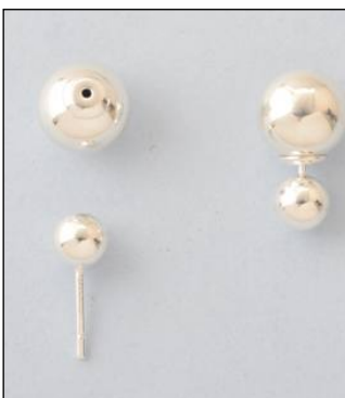
JE180916SL WT: 4.85 gm