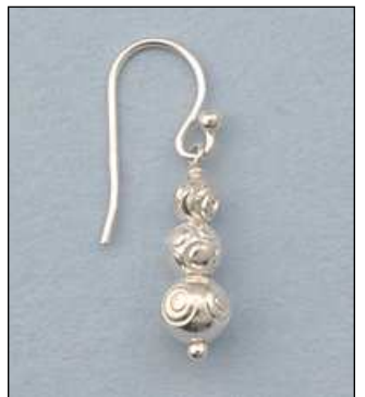
JE1020223T WT: 1.7 gm