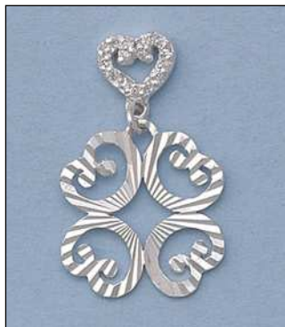
JE101612A18DC WT: 0.09/3.01 gm