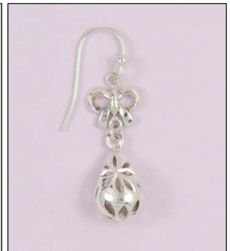
ER182115DC WT: 2.65 gm