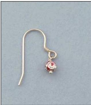
JE102092D4MMF WT: 0.78 gm