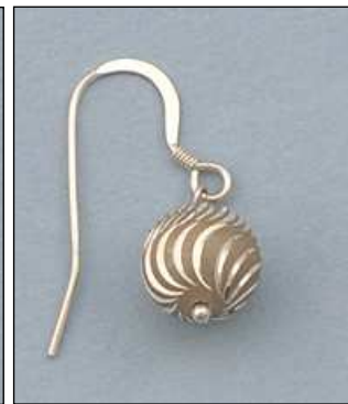
JE1020483T WT: 3.33 gm