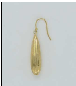
ER1813742T WT: 3.55 gm