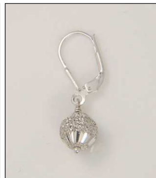
ER181630S8M3T WT: 2.35 gm