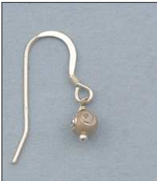
JE1020493T WT: 0.92 gm