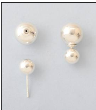
JE180915SL WT: 7.55 gm