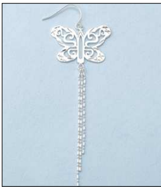
JE102740DC WT: 3.5 gm