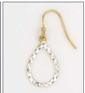
ER1814322T WT: 1.4 gm