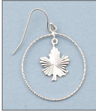
JE101714DC WT: 2.1 gm