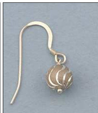
JE1020583T WT: 1.93 gm