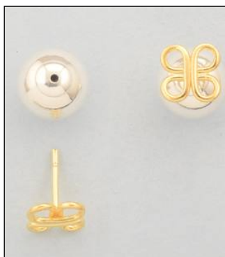
JE1809312T WT: 5 gm