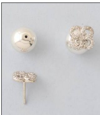
JE181092A182T WT: 5.8 gm