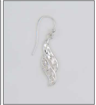
ER181722DC WT: 2.2 gm