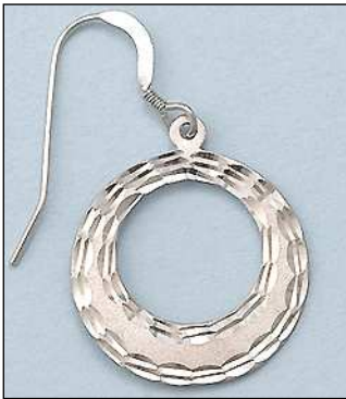
JE1014362T WT: 4.2 gm