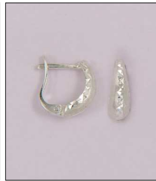
ER1820743T WT: 2.3 gm