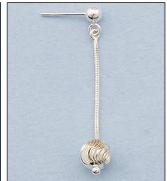
JE102819DC WT: 2.15 gm