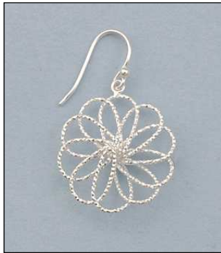
JE102067DC WT: 3.65 gm