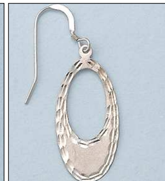
JE1014302T WT: 3.4 gm