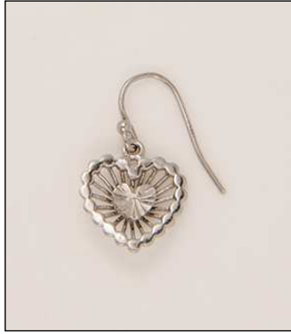
LZER1826002T WT: 2.5gm