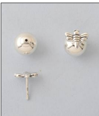
JE1810932T WT: 5.5 gm