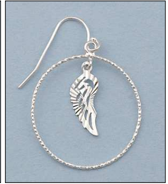
JE101720DC WT: 1.75 gm