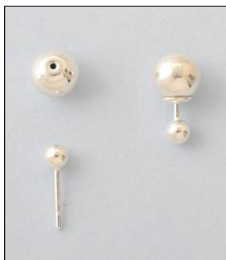
JE181074SL WT: 2.55 gm