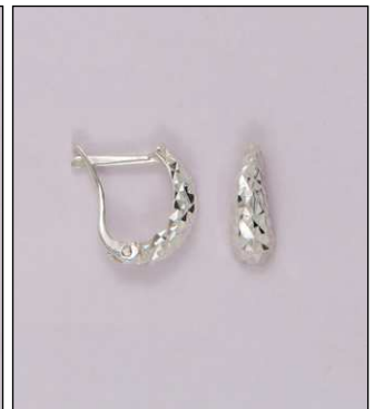
ER182073DC WT: 2.1 gm