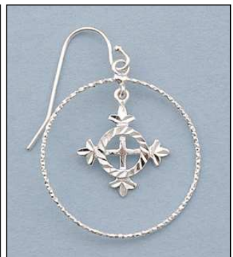
JE101723DC WT: 2.35 gm