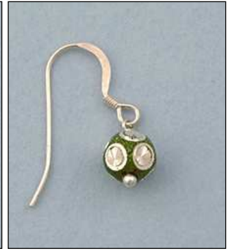
JE102095D8MMF WT: 1.87 gm