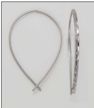
ER1815212T WT: 1.3 gm