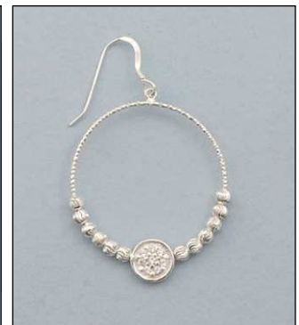
JE102219D30MA18DC WT: 0.15/3.65 gm