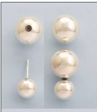
JE180546SL WT: 9.1 gm