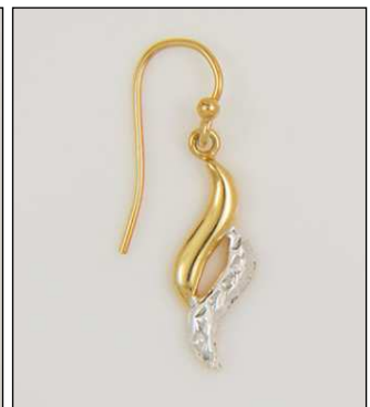
ER1820133T WT: 2.15 gm