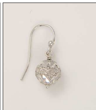
ER181633S8M3T WT: 1.95 gm