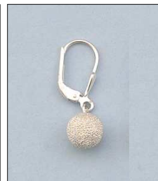
1M318538MMLZ WT: 2.35 gm