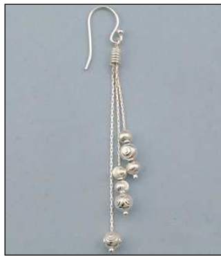
JE1029113T WT: 3.7 gm