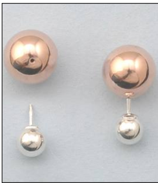
JE1800012T WT: 7.4 gm