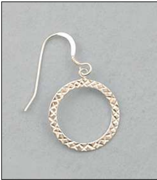
JE180067DC WT: 1.15 gm