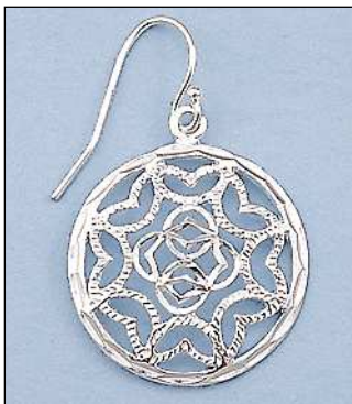
JE101572DC WT: 3.75 gm