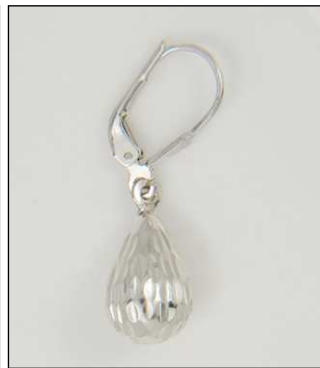
ER181851DC WT: 1.9 gm