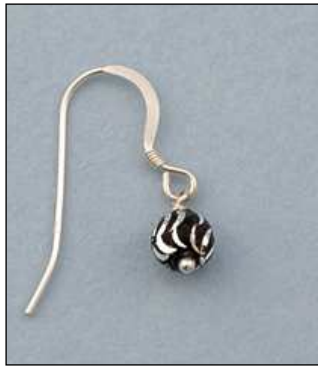
JE102097D6MMF WT: 1.15 gm