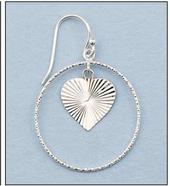
JE101688DC WT: 2.65 gm