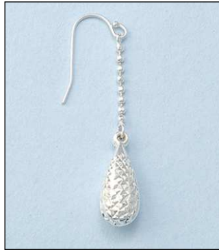
JE102732DC WT: 2.45 gm