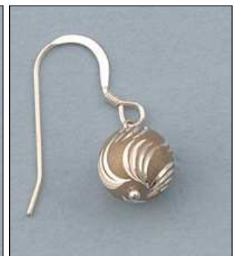
JE1020593T WT: 3.46 gm