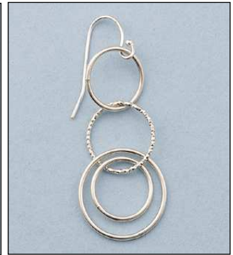
JE101698DC WT: 2.7 gm