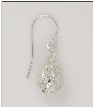
ER181993DC WT: 1.55 gm