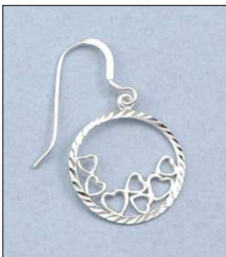
JE100802DC WT: 1.9 gm