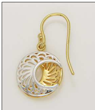
LZER1821932T WT: 2.2 gm