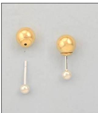
JE1809172T WT: 2.5 gm