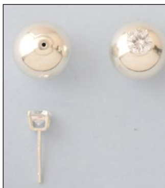
JE181075A18SL WT: 6.85 gm