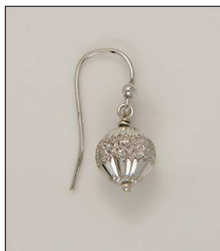
ER181632S8M3T WT: 2 gm