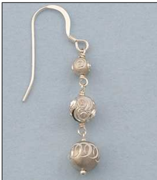
JE1020473T WT: 3.85 gm