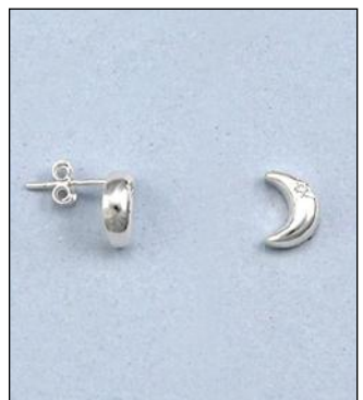
JE100876A18SL WT: 0.02/1.85 gm