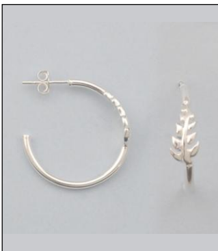
JE102463SL WT: 3 gm