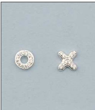
JE102388A18SL WT: 0.10/1.05 gm