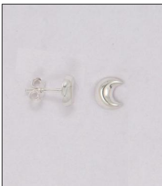
ER181640SL WT: 0.55 gm