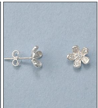
JE101323A18SL WT: 0.08/1.15 gm