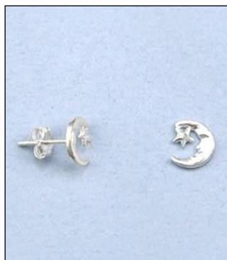
JE100768DC WT: 0.8 gm