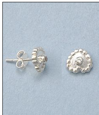
JE101316A18SL WT: 0.02/1.86 gm