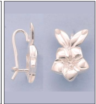
JME146033DC WT: 3.65 gm