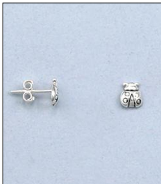
JE100898EN WT: 0.86 gm