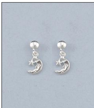
JE100196SL WT: 0.94 gm