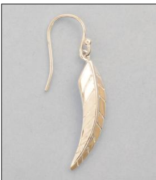
JE180892SL WT: 3.4 gm