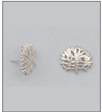
JE180153RH WT: 2.6 gm