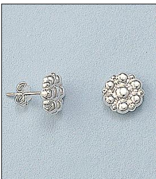
JE101412SL WT: 1.4 gm