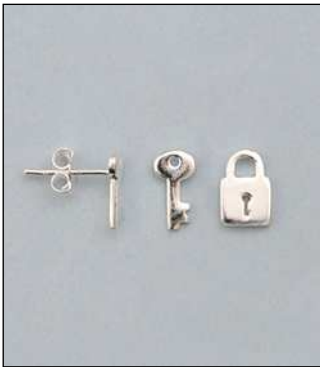
JE102348SL WT: 1.05 gm