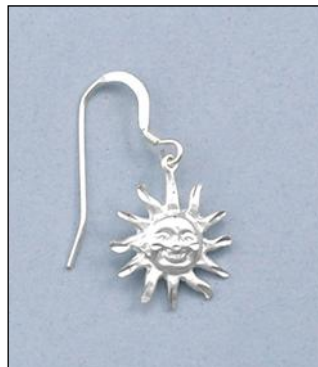
JE1007092T WT: 4.78 gm