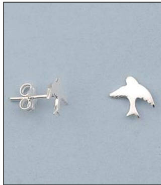
JE101794SL WT: 0.73 gm