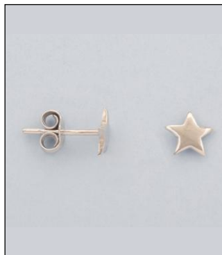
JE180702RH WT: 0.55 gm