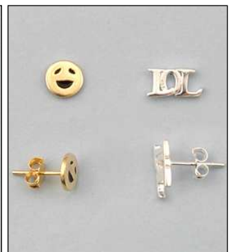
JE1801303T WT: 1.05 gm