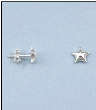
JE101059SL WT: 0.6 gm