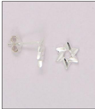
ER182131DC WT: 0.95 gm