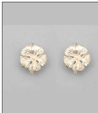
JE180266DC WT: 6.9 gm