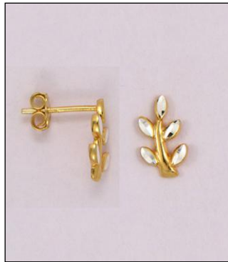
ER1820342T WT: 1.05 gm