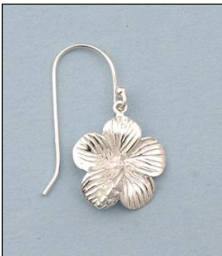
JE101950SL WT: 4.6 gm