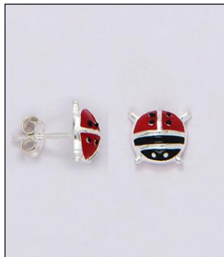
ER110892EN WT: 1.65 gm