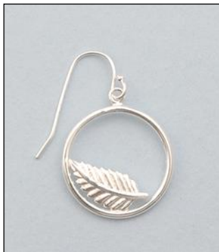
JE102390D20MSL WT: 3.05 gm