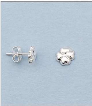
JE101692SL WT: 0.5 gm