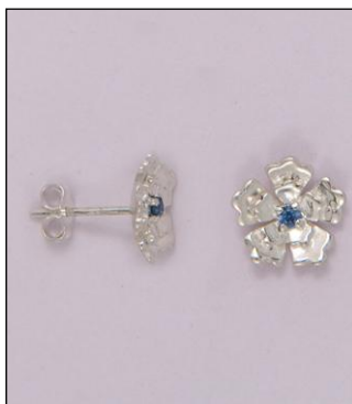
ER181555A55SL WT: 0.02/1.83 gm