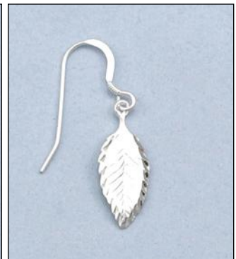
JE1006922T WT: 3 gm