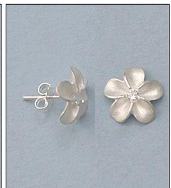
JE132072A182T WT: 0.06/1.75 gm