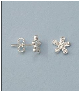
JE132112A18SL WT: 0.04/0.96 gm