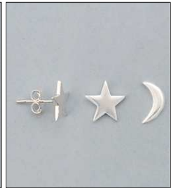
JE102351SL WT: 0.8 gm