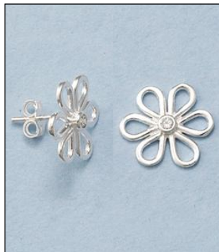
JE132086A18SL WT: 0.03/1.72 gm