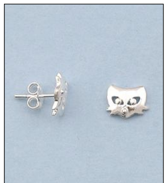
JE101684SL WT: 1.3 gm