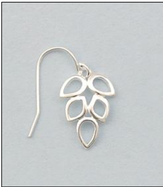
JE102397SL WT: 2.1 gm