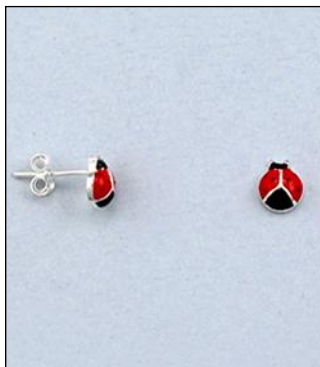
JE100923EN WT: 1.45 gm