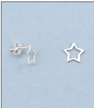
JE101058SL WT: 0.54 gm