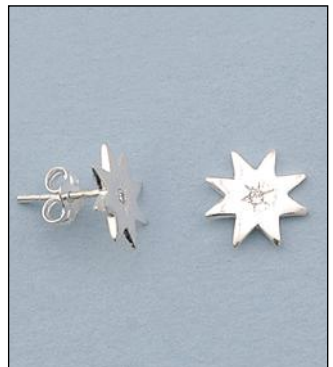
JE101724A18SL WT: 1.3 gm