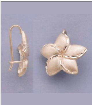
JME1460303T WT: 7.35 gm