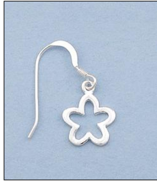
JE101508SL WT: 1.1 gm