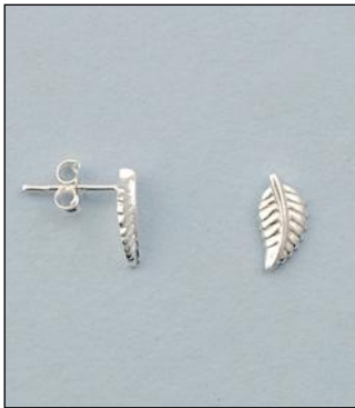
JE102405SL WT: 1.25 gm