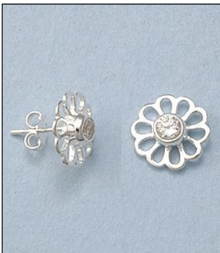
JE101313A18SL WT: 0.19/2.11 gm