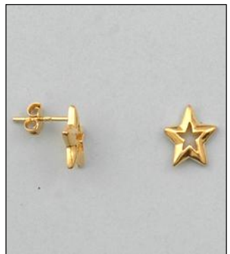
JE180118FG WT: 1.45 gm