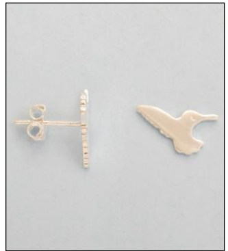
JE180608SL WT: 1.05 gm