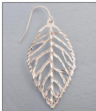
JE180496DC WT: 5.5 gm