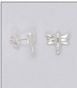
ER181827SL WT: 0.55 gm