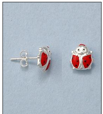
JE121523EN WT: 2.15 gm