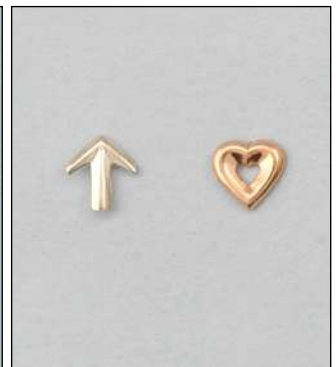
JE1800992T WT: 1.1 gm