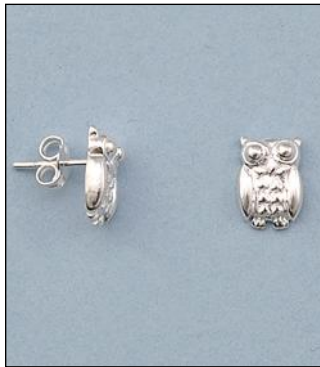
JE101749SL WT: 1.5 gm