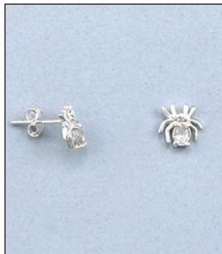
JE100905A18SL WT: 0.12/1.18 gm