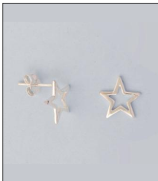
JE180629SL WT: 0.72 gm