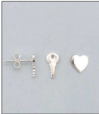
JE102349SL WT: 0.85 gm