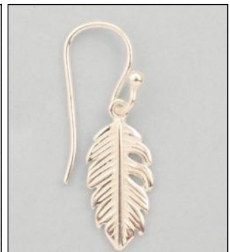
JE180856SL WT: 1.9 gm