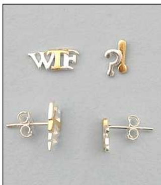
JE1801242T WT: 0.85 gm