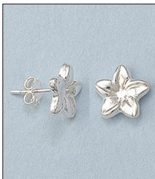
JE101417SL WT: 1.33 gm