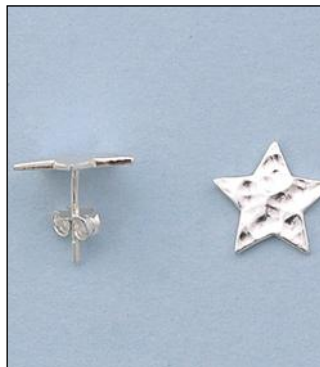
JE101633SL WT: 1.66 gm