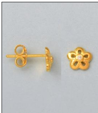
JE180677A18FG WT: 0.75 gm