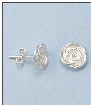
JE101455SL WT: 1.95 gm