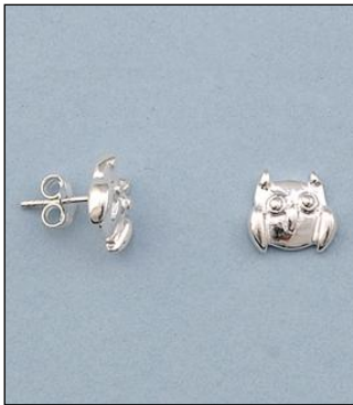
JE101748SL WT: 1.75 gm