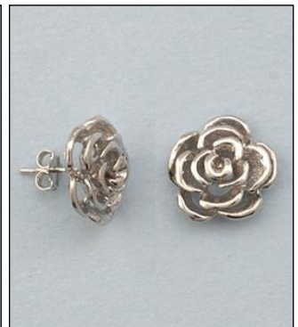
JE132204RH WT: 5.15 gm