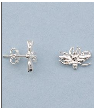
JE101739SL WT: 1.38 gm