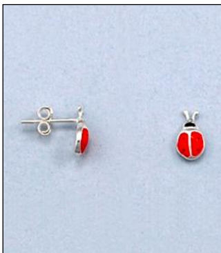
JE100841EN WT: 1.05 gm