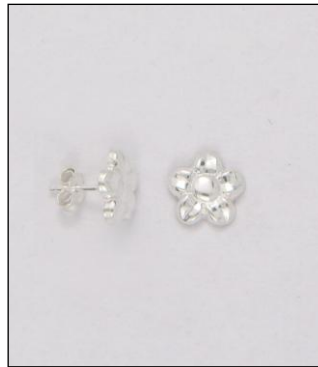
ER181656SL WT: 0.75 gm