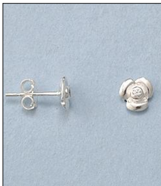
JE101314A18SL WT: 0.03/0.92 gm