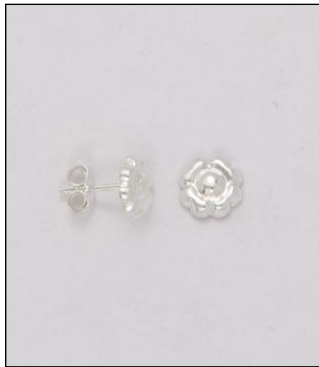
ER181655SL WT: 0.6 gm