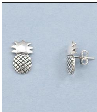
JE101130AT WT: 1.82 gm