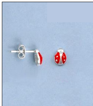
JE101023EN WT: 1.08 gm