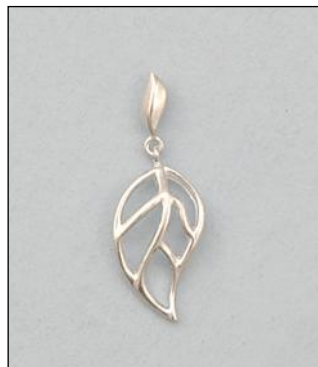
JE180066RH WT: 2.6 gm