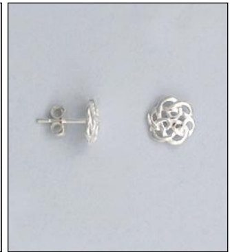
JE100614SL WT: 1.37 gm