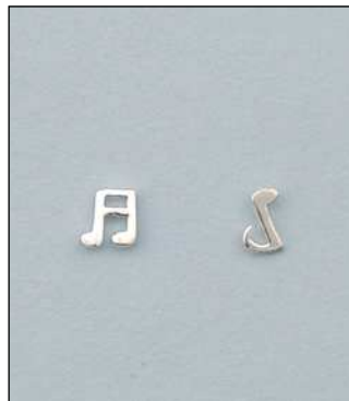
JE102386SL WT: 0.6 gm