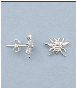
JE101738SL WT: 1.15 gm