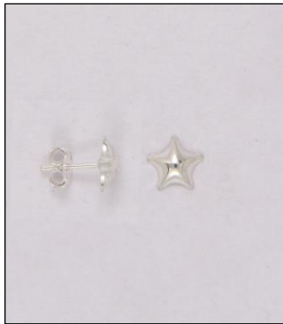
ER181639SL WT: 0.55 gm