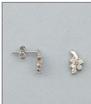
JE102331A18RH WT: 0.14/1.01 gm