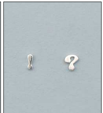
JE102387SL WT: 0.55 gm