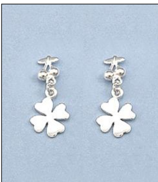
JE101200SL WT: 2.05 gm