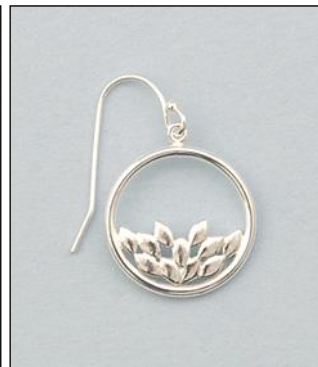
JE102395D18MSL WT: 3.35 gm