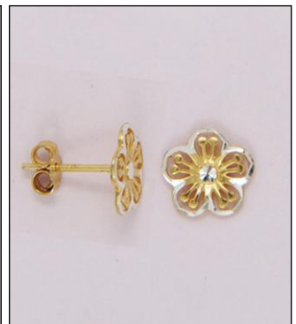
ER1821122T WT: 1 gm