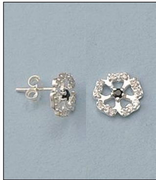
JE132113M1SL WT: 0.15/1.4 gm