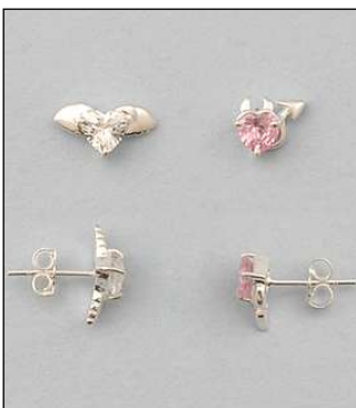
JE180123M1SL WT: 0.35/1.15 gm