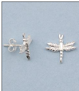
JE101740SL WT: 1.33 gm