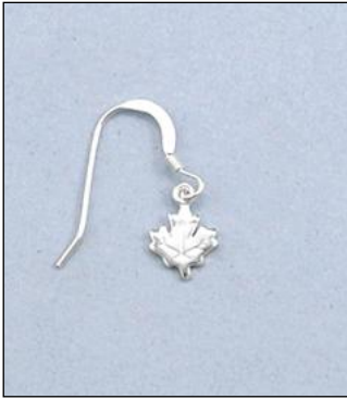
JE100850SL WT: 0.94 gm