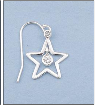
JE101764A18SL WT: 0.09/1.56 gm