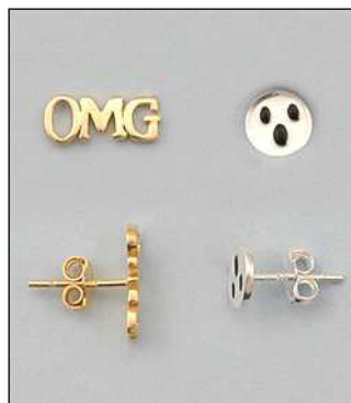
JE1801253T WT: 1 gm