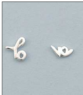
JE102392SL WT: 0.8 gm