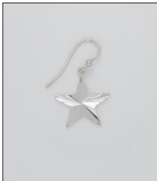
ER181725DC WT: 1.6 gm