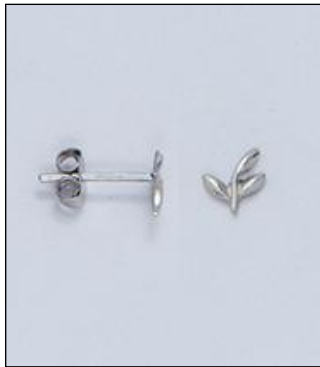
JE181337RH WT: 0.45 gm