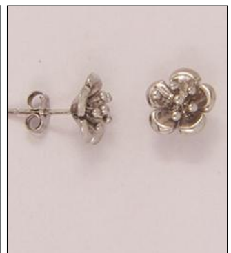
ER182842RH WT: 1.42 gm