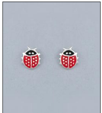
JE100390EN WT: 1.3 gm