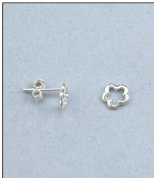
JE100968SL WT: 0.7 gm