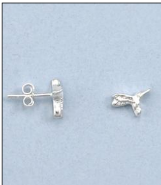
JE100776DC WT: 1.4 gm