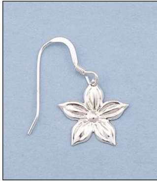
JE101507SL WT: 0.82 gm