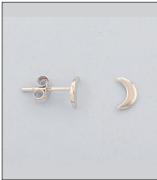
JE180703RH WT: 0.5 gm