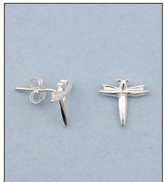
JE101741SL WT: 1.05 gm