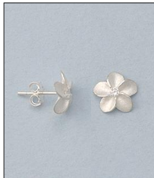
JE100999A182T WT: 0.03/1.5 gm