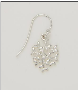
ER182186SL WT: 1.65 gm