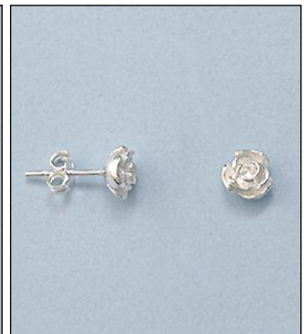
JE101267SL WT: 1.55 gm