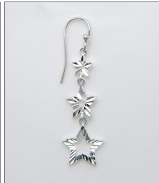
ER181739DC WT: 2.1 gm