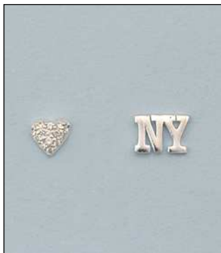
JE102391A18SL WT: 0.06/0.99 gm