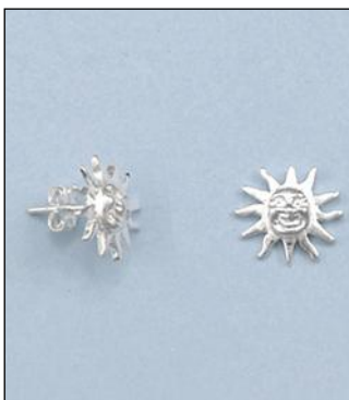
JE101125SL WT: 2.2 gm