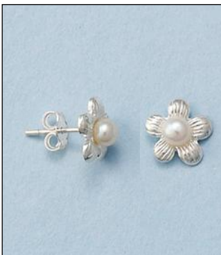
JE101280NPSL WT: 0.16/1.24 gm