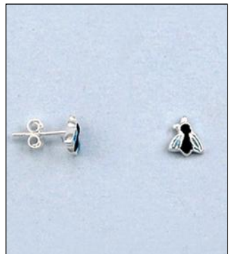
JE100913EN WT: 1.2 gm