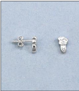
JE100894SL WT: 1.4 gm