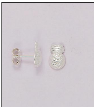
ER182006SL WT: 0.5 gm