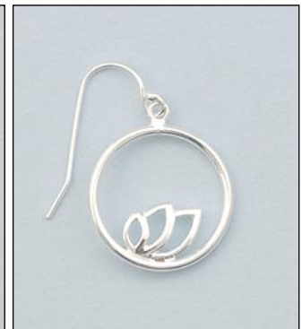
JE102396D20MSL WT: 2.45 gm