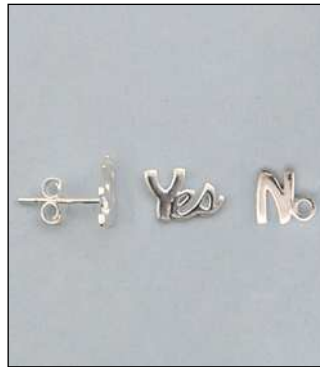
JE102350SL WT: 0.8 gm