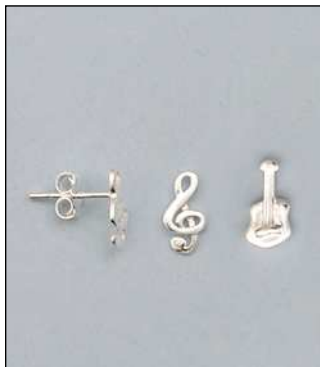
JE102353SL WT: 0.85 gm