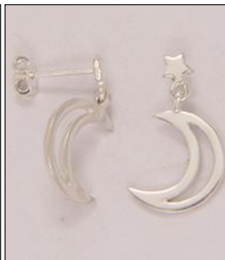
ER182827SL WT: 1.63 gm