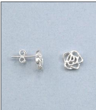
JE100966SL WT: 1.55 gm