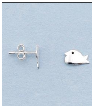
JE101673EN WT: 0.85 gm