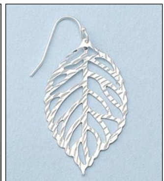
JE1027392T WT: 3.1 gm