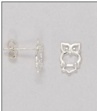
ER181863SL WT: 0.7 gm