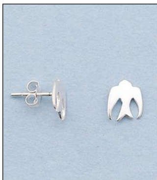
JE101671SL WT: 0.8 gm