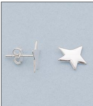
JE132162SL WT: 0.9 gm