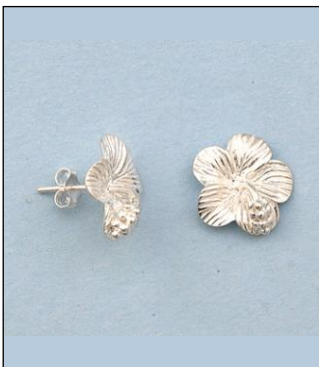
JE101949SL WT: 4.56 gm