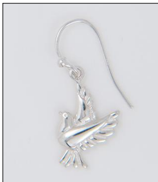
ER181710SL WT: 2.5 gm