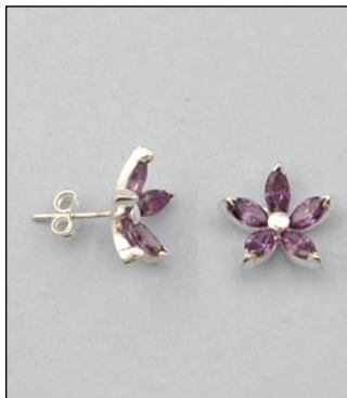
JE100049A47SL WT: 0.89/2.05 gm