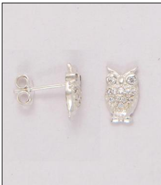
ER181861A18SL WT: 0.32/1.15 gm