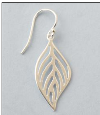
JE181178SL WT: 2.8 gm