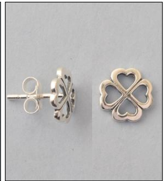
JE181107AT WT: 0.9 gm