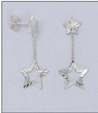
ER181730DC WT: 1.35 gm