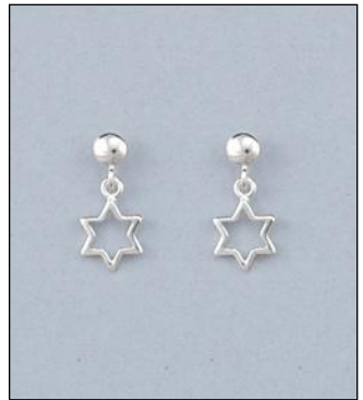
JE100200SL WT: 0.8 gm