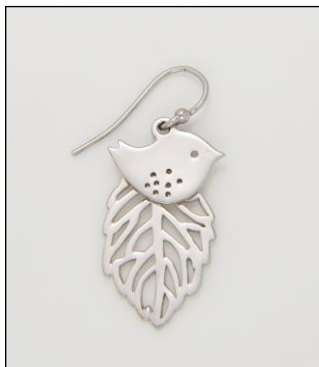
ER181961RH WT: 5.2 gm