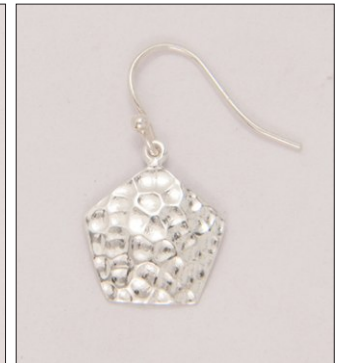
ER182937SL WT: 2.3 gm