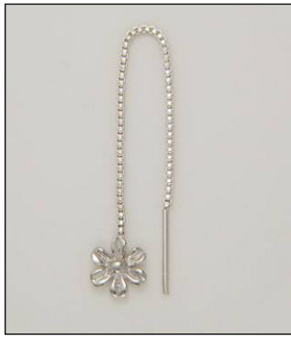
ER103060SL WT: 1.05 gm