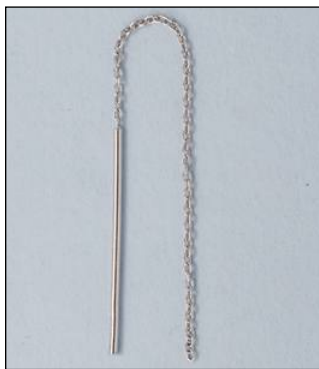
JE102997RH WT: 0.7 gm