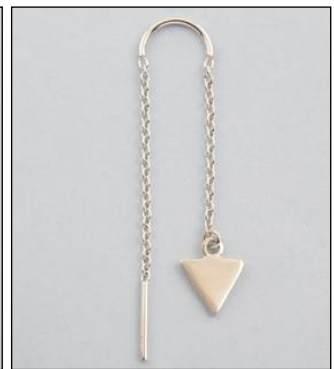
JE103019RH WT: 1.55 gm