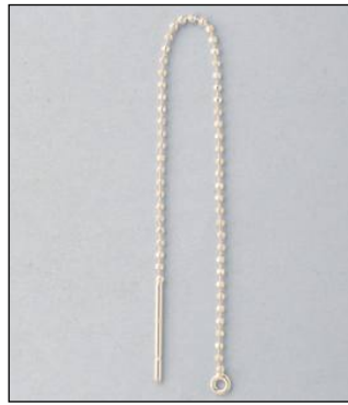
JME146289SL WT: 0.55 gm