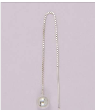
JE102666SL WT: 2.63 gm