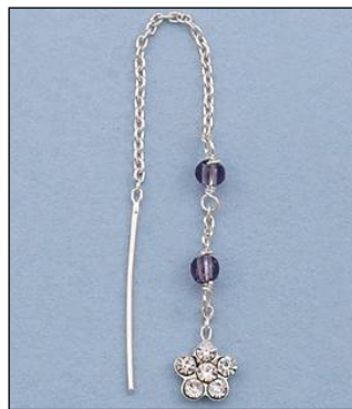
JE102814M1SL WT: 0.08/0.97 gm