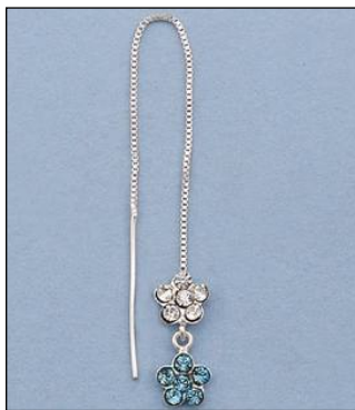
JE102815M1SL WT: 0.12/1.13 gm