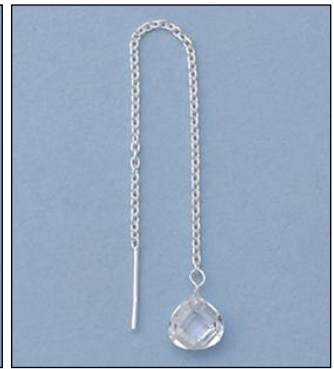
JE102776A15SL WT: 1.25/1.1 gm