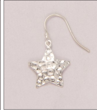
ER182931SL WT: 2.4 gm