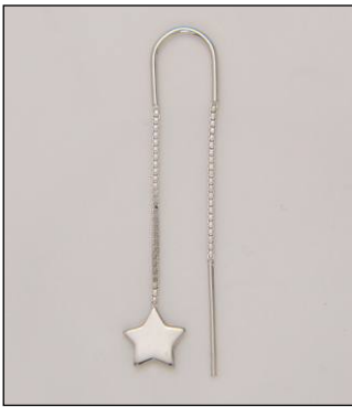
ER103066SL WT: 1.6 gm