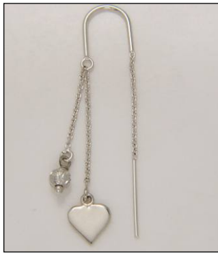
UER1030653T WT: 1.85 gm