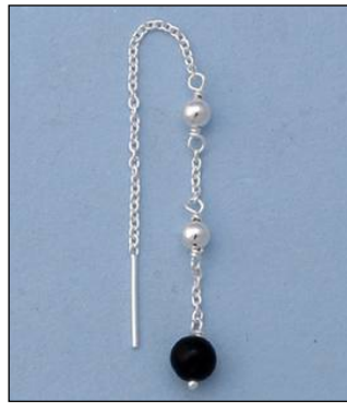
JE102774A2SL WT: 0.62/1.4 gm