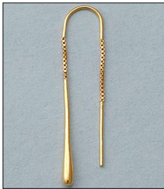
JE100438FG WT: 1.75 gm