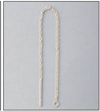
JME146290SL WT: 0.5 gm