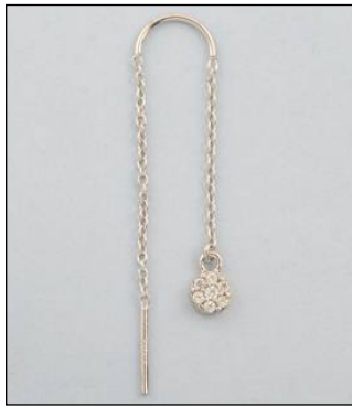
JE103021A18RH WT: 0.36/1.39 gm