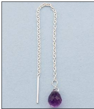
JE102779A3SL WT: 0.84/0.88 gm