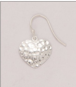
ER182933SL WT: 2.9 gm