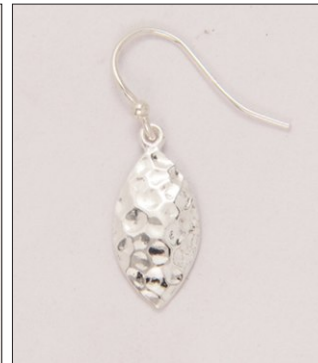
ER182936SL WT: 2.35 gm