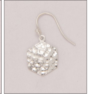
ER182932SL WT: 2.9 gm