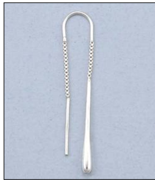
JE100438SL WT: 1.74 gm