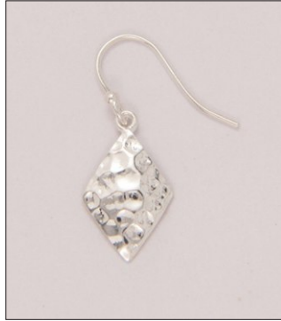
ER182930SL WT: 2.3 gm