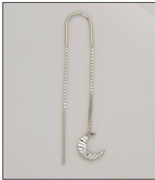
ER103067DC WT: 1.5 gm