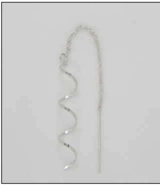
ER103059SL WT: 1.5 gm