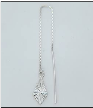
JME148020DC WT: 1.2 gm