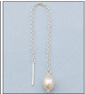
JE102782A30SL WT: 1.08/1.18 gm