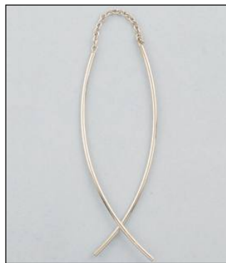
JE103018RH WT: 1.75 gm