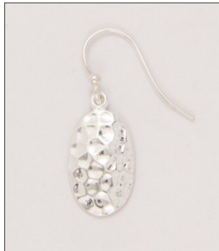
ER182935SL WT: 2.85 gm