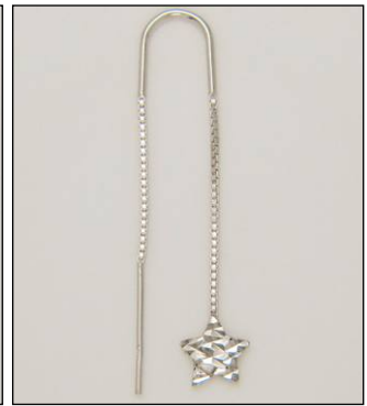
ER103069DC WT: 1.45 gm