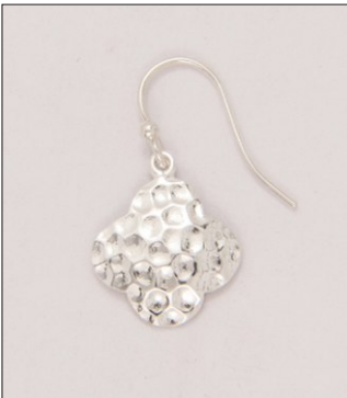
ER182934SL WT: 2.95 gm