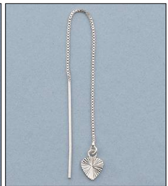
JE102827DC WT: 1 gm