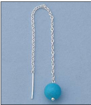
JE102778A7SL WT: 1.09/1.11 gm