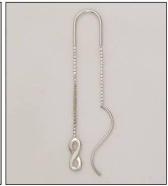
ER103064SL WT: 1.4 gm