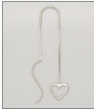
ER103068SL WT: 1.4 gm