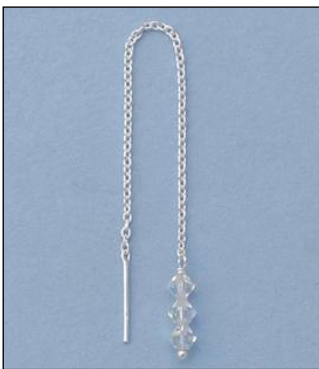
JE102789G15SL WT: 0.29/1.1 gm