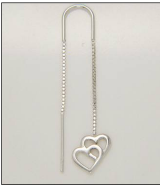
ER103070SL WT: 1.8 gm