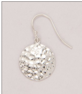
ER182938SL WT: 3.6 gm