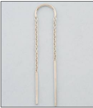
JE103020RH WT: 1.1 gm