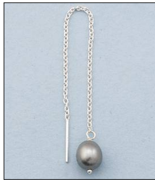
JE102782A29SL WT: 1.1/1.1 gm