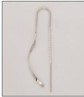
ER103063SL WT: 1.2 gm