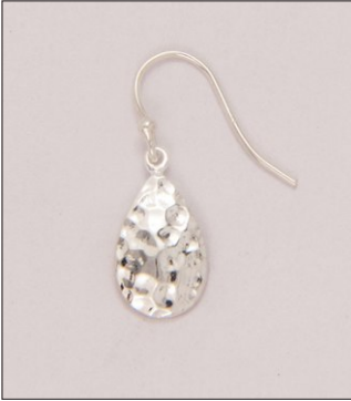
ER182929SL WT: 2.4 gm