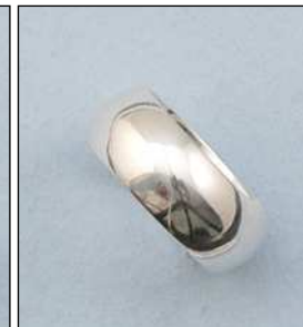
90608S6NSL WT: 7.84 gm