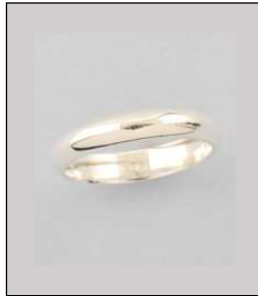
JW117135S7NSL WT: 3.7 gm