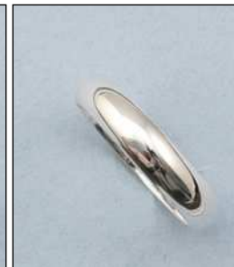
90703S12NOSL WT: 5.44 gm