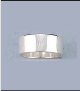
90808S13NSL WT: 9.37 gm