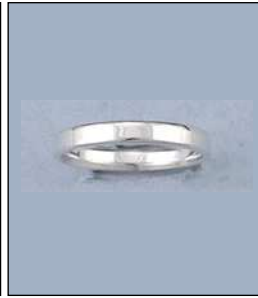
JW117010S10NSL WT: 2.97 gm