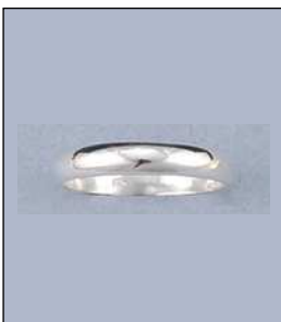
90511S25MSL WT: 4.38 gm