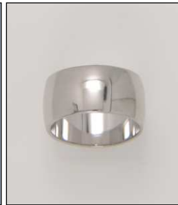
JW117130S10NSL WT: 9.11 gm