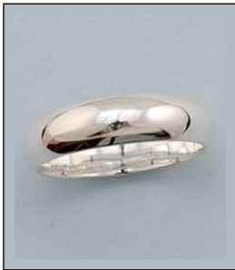
90534S14NOSL WT: 8.56 gm