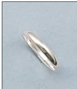
90701S11NSL WT: 2.35 gm