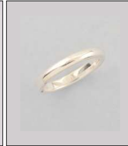
JW117134S10NSL WT: 3.4 gm