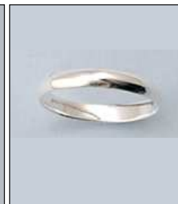
90602S4NSL WT: 0.96 gm