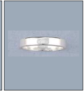
90803S6HNSL WT: 3.5 gm