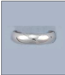
JW117009S12NOSL WT: 1.75 gm