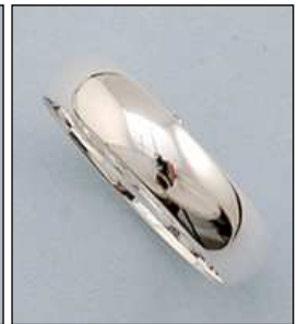
JW117104S12NSL WT: 4.95 gm