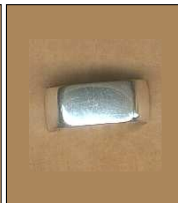
90807S9HNSL WT: 7.4 gm