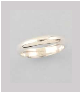
JW117135S6NSL WT: 3.5 gm