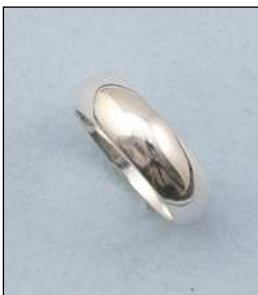
90606S5NOSL WT: 4.78 gm