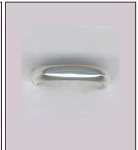
90604S10HNSL WT: 3.5 gm