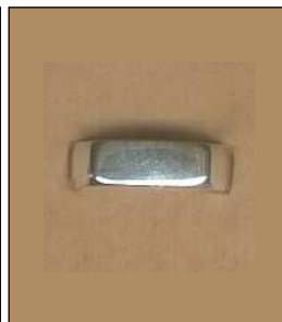
90805S9HNSL WT: 5.53 gm