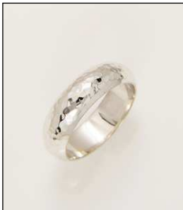
WB117157S7NSL WT: 5.25 gm