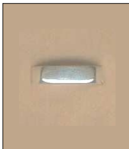
90804S9HNSL WT: 4.6 gm