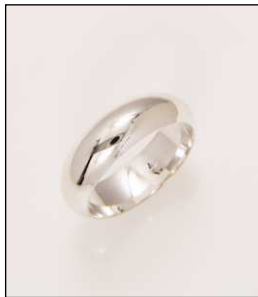
JW117015S7NOSL WT: 5.33 gm