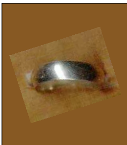
00000 WT: 0 gm