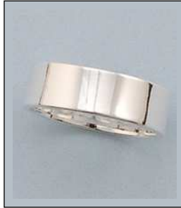
90801S5HNSL WT: 6.63 gm