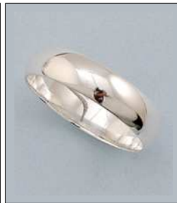
JW117104S13NSL WT: 5.2 gm