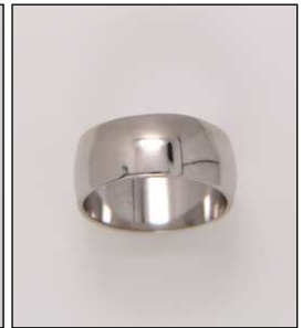
JW117130S12NSL WT: 9.46 gm