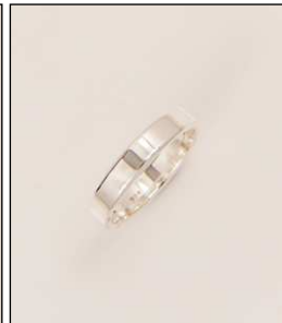
WB117187S7NSL WT: 3.25 gm