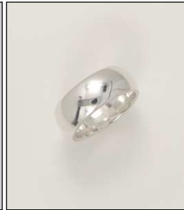
WB117140S7NSL WT: 9.2 gm