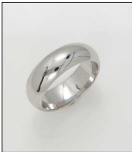
90536S7NSL WT: 7.2 gm