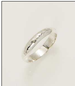
WB117158S7NSL WT: 3.2 gm