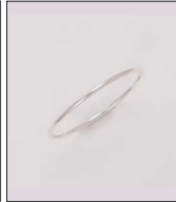
WB117174S9NSL WT: 0.52 gm