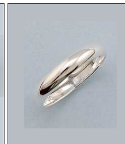
90602S9NSL WT: 1.24 gm