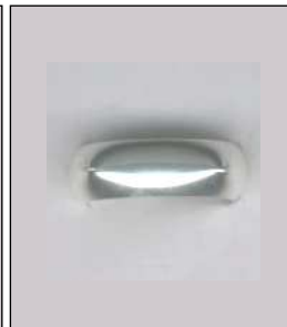
90607S11NSL WT: 8.36 gm