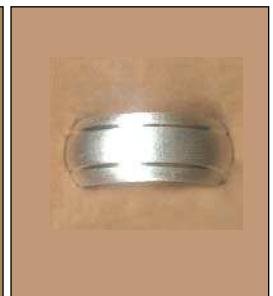
90833S9NOFF WT: 7.6 gm