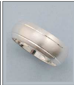
90832S9N2T WT: 9.16 gm