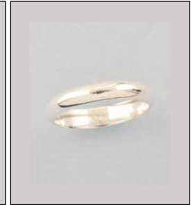
JW117135S5NSL WT: 3.4 gm