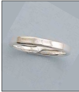
90802S8HNSL WT: 2.33 gm