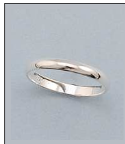
90602S5NSL WT: 1.03 gm