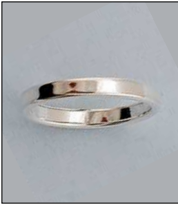
90801S5HNSL WT: 1.4 gm