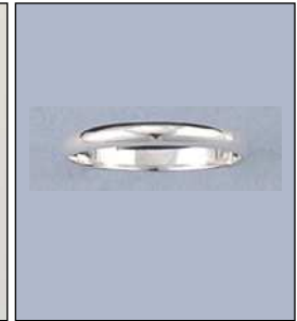
90510S3NOSL WT: 1.5 gm