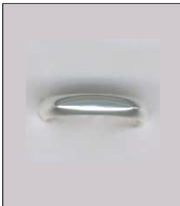
90604S11HNSL WT: 3.6 gm