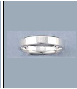
JW117011S13NSL WT: 4.5 gm