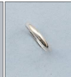
90603S7NSL WT: 2 gm