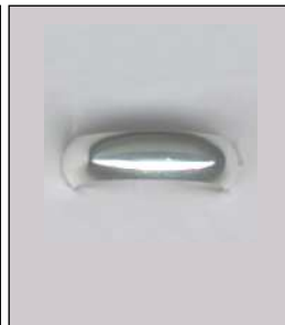
90605S5NSL WT: 4.1 gm