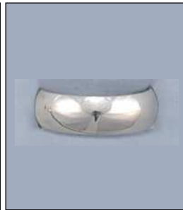
JW117008S7NOSL WT: 2 gm