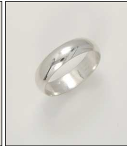
WB117138S22HMSL WT: 5.35 gm