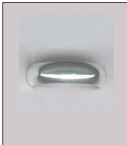
90605S4NSL WT: 3.89 gm