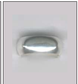
90608S9NOSL WT: 9.26 gm