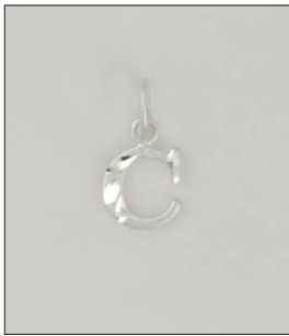
CH1704912T WT: 0.35 gm