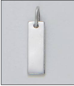
JCH170372RH WT: 0.85 gm