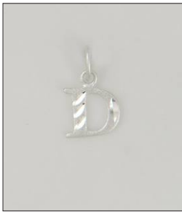
CH1704922T WT: 0.4 gm