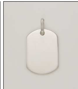
PD160802SL WT: 6.1 gm