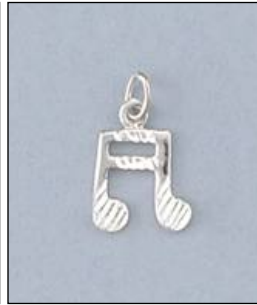
JCH128228DC WT: 0.56 gm