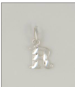
CH1705062T WT: 0.45 gm