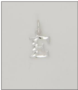
CH1704932T WT: 0.45 gm