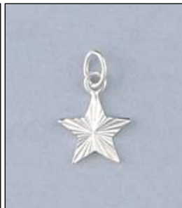
JCH128229DC WT: 0.41 gm