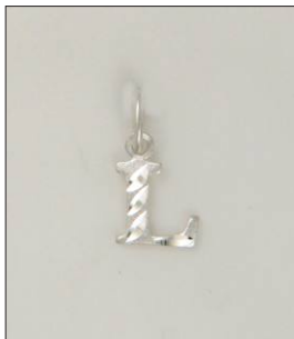
CH1705002T WT: 0.35 gm