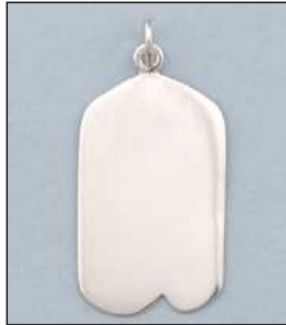
JP160078SL WT: 2.25 gm