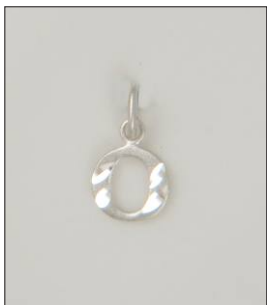
CH1705032T WT: 0.45 gm