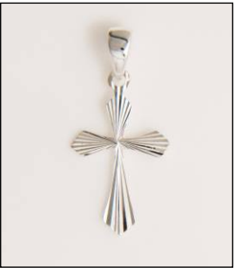
CH170738DC WT: 0.55 gm