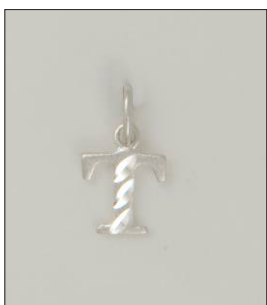
CH1705082T WT: 0.4 gm