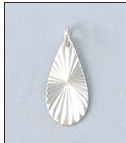
JCH128553DC WT: 0.73 gm