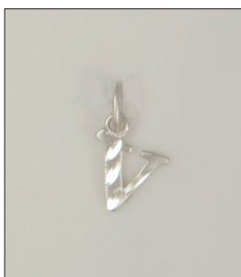
CH1705102T WT: 0.4 gm