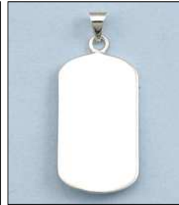
JP125376SL WT: 6.8 gm