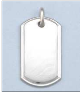
JP125324SL WT: 12.5 gm