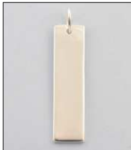
JP160409SL WT: 5.1 gm