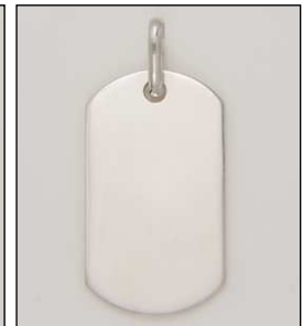
PD160803SL WT: 6.35 gm