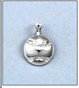
JCH128882DC WT: 1.89 gm