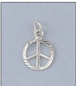
JCH128215DC WT: 0.46 gm