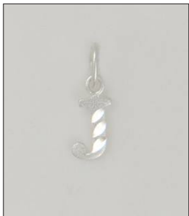
CH1704982T WT: 0.3 gm