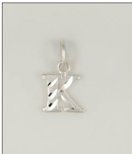
CH1704992T WT: 0.4 gm