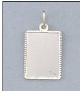
JP1243022T WT: 3.26 gm