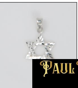
CH170585DC WT: 0.95 gm

PAUL GLOBAL VENTURES Quality starts with you