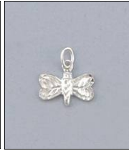
JCH128306DC WT: 0.75 gm