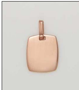
PD160974RG WT: 1.2 gm