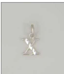
CH1705122T WT: 0.4 gm