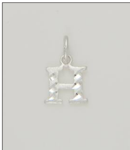
CH1704962T WT: 0.5 gm