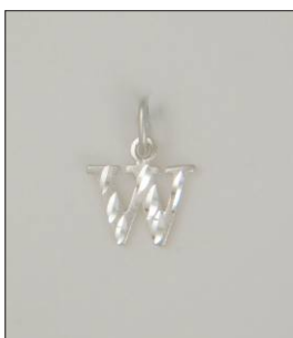
CH1705112T WT: 0.5 gm