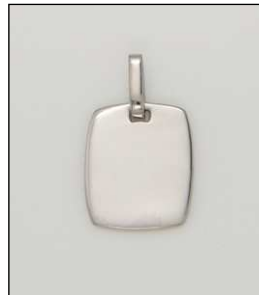
PD160974RH WT: 2 gm