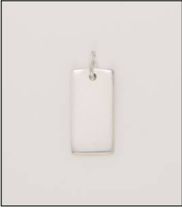
CH170725SL WT: 1 gm