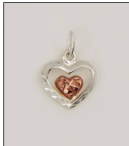
CH1703233T WT: 0.7 gm