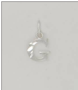
CH1704952T WT: 0.4 gm