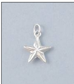
JCH128518DC WT: 1 gm