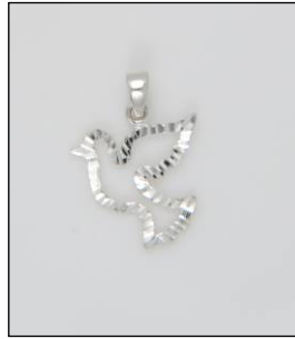
CH170582DC WT: 0.9 gm