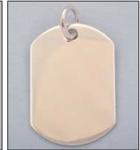
JP160254SL WT: 6.6 gm