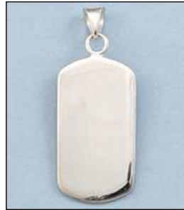
JP125375SL WT: 5.5 gm