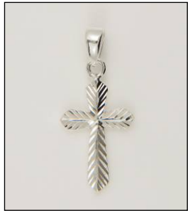
CH170737DC WT: 0.9 gm