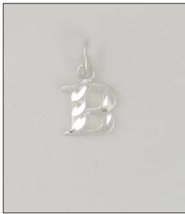
CH1704902T WT: 0.45 gm