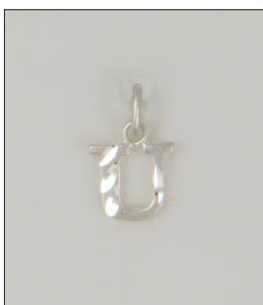
CH1705092T WT: 0.4 gm