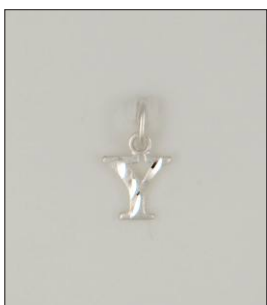
CH1705132T WT: 0.35 gm