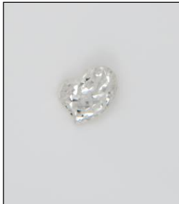
CH170583DC WT: 0.95 gm