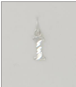
CH1704972T WT: 0.3 gm