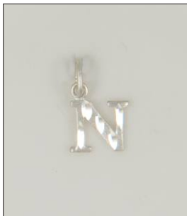
CH1705022T WT: 0.5 gm