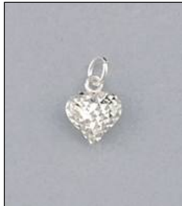
JCH128139DC WT: 0.51 gm