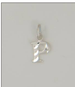
CH1705042T WT: 0.4 gm