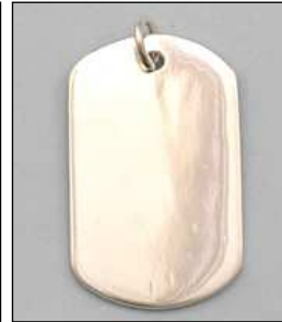
JP160207SL WT: 5.35 gm