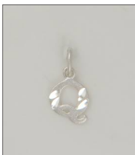
CH1705052T WT: 0.5 gm