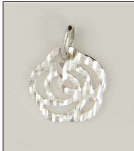
CH170735DC WT: 0.55 gm