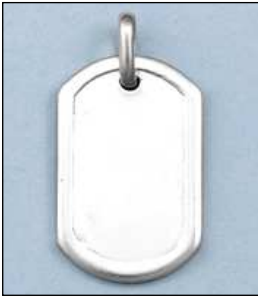
JP125319SL WT: 8 gm