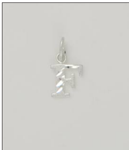
CH1704942T WT: 0.4 gm