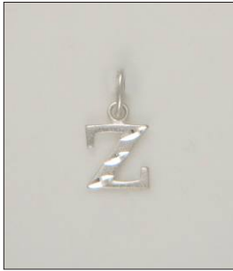
CH1705142T WT: 0.45 gm