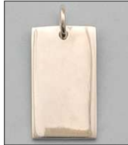
JP160206SL WT: 5.85 gm