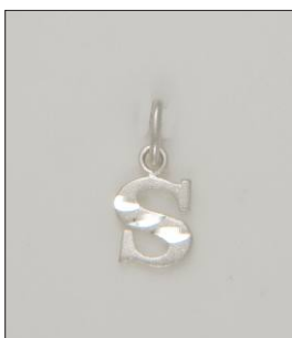
CH1705072T WT: 0.4 gm