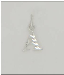
CH1704892T WT: 0.3 gm