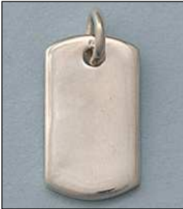
JP125399SL WT: 4.91 gm