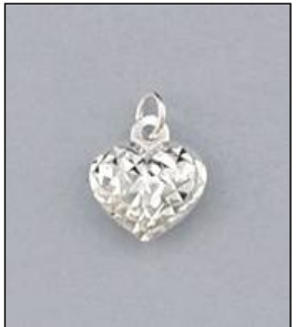
JCH128136DC WT: 0.36 gm