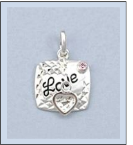
JCH128868A383T WT: 0.02/2.05 gm