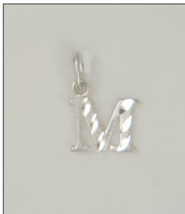
CH1705012T WT: 0.55 gm