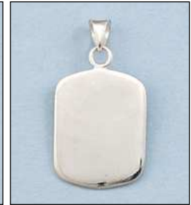
JP125378SL WT: 4 gm