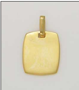
PD160974FG WT: 1.25 gm