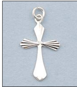
JCH170155DC WT: 0.4 gm