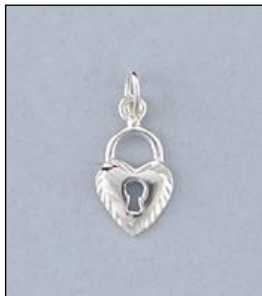
JCH128221DC WT: 0.44 gm