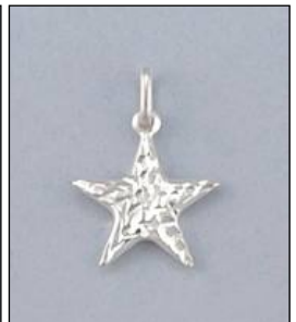
JCH128303DC WT: 0.63 gm