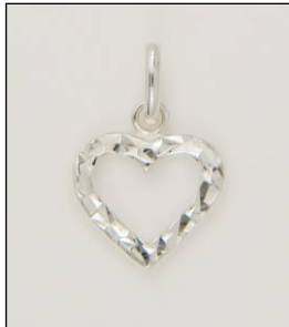
CH170736DC WT: 0.9 gm