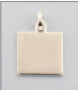
JP160408SL WT: 5.1 gm