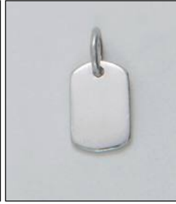
JCH170375RH WT: 0.77 gm