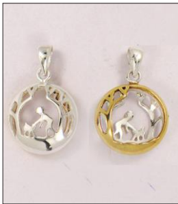
PD1905882T WT: 1.5 gm