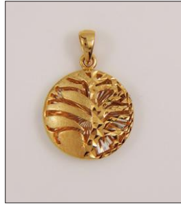
LZPD190395MF WT: 3.5 gm