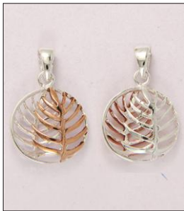
PD1905902T WT: 1.26 gm