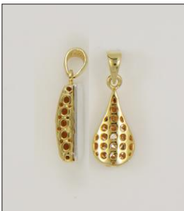
LZPD1902533T WT: 1.35 gm