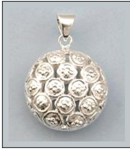
JP160145SL WT: 6.4 gm