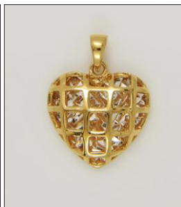
LZPD1902473T WT: 2.15 gm