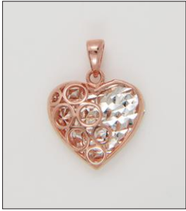
LZPD1323203T WT: 2 gm