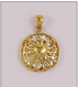
LZPD1902453T WT: 2.55 gm