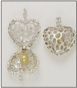
PD1902262T WT: 1.9 gm