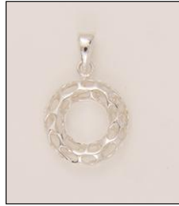
PD190816SL WT: 1.05 gm