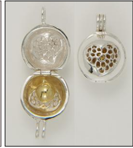
PD1902142T WT: 4.8 gm