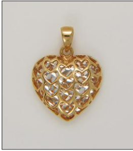
LZPD1903353T WT: 2.35 gm