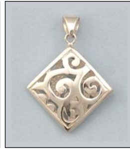
JP160148SL WT: 2.35 gm