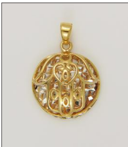
LZPD1902443T WT: 2.4 gm