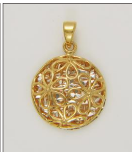
LZPD1902503T WT: 2.6 gm