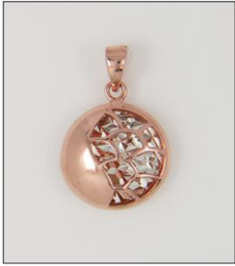
LZPD1323213T WT: 2.25 gm