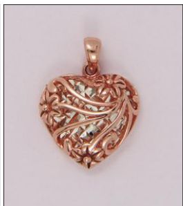
LZPD1902463T WT: 2.75 gm