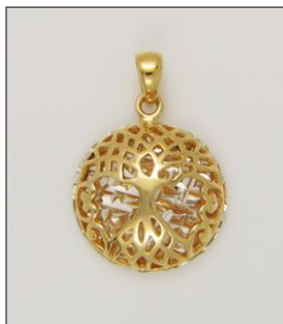
LZPD1902493T WT: 2.55 gm