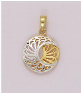
LZPD1902422T WT: 1.15 gm