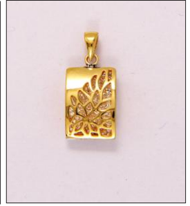
LZPD1905832T WT: 2.7 gm