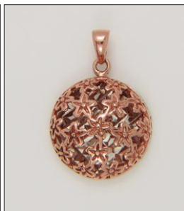
LZPD1902483T WT: 2.7 gm