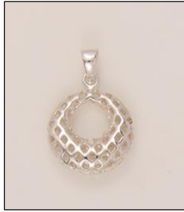
PD190808SL WT: 1.55 gm