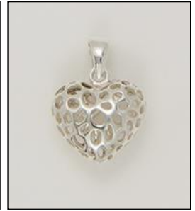
PD190241SL WT: 1.75 gm