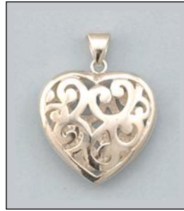
JP160147SL WT: 3.2 gm