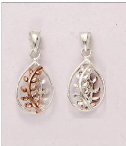
PD1905892T WT: 1 gm