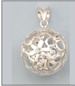
JP160146A18SL WT: 0.1/6.4 gm