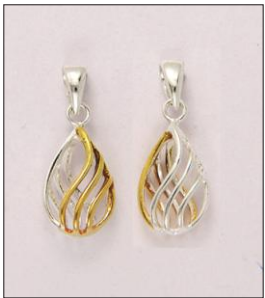
PD1905922T WT: 0.61 gm