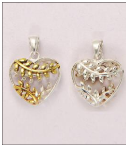
PD1905912T WT: 2 gm