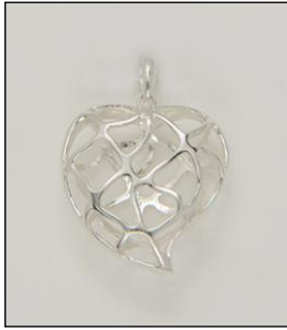
BP0002SL WT: 3.85 gm