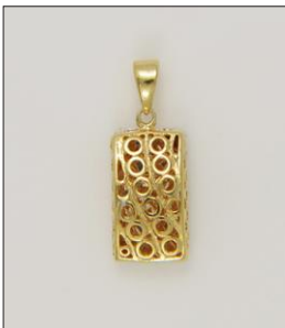
LZPD1902523T WT: 2.1 gm