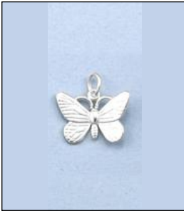
JP125115SL WT: 2.9 gm