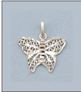
JP1600572T WT: 1.4 gm