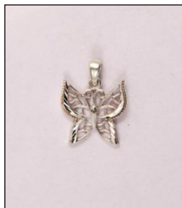
PD190559DC WT: 1.55 gm