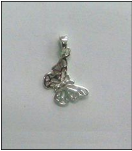
PD190756SL WT: 0.85 gm