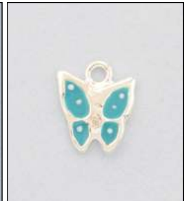
JMC140966EN WT: 0.34 gm