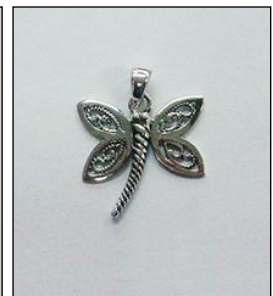
PD190652AT WT: 1.3 gm