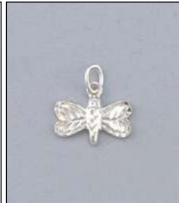
JCH128306DC WT: 0.75 gm