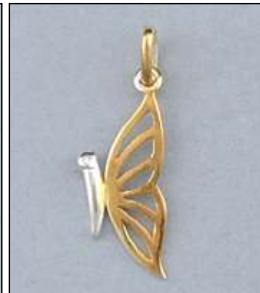
JCH1281872T WT: 0.80 gm