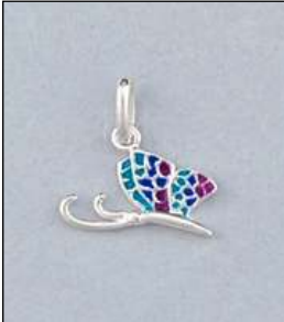
JCH128194EN WT: 0.82 gm