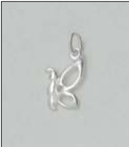
JMC147749SL WT: 0.4 gm