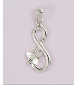
PD190106DC WT: 1.05 gm