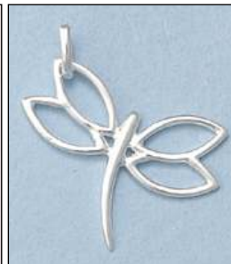
JCH128958SL WT: 1.18 gm