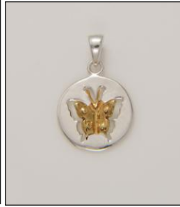
PD1903832T WT: 1.55 gm