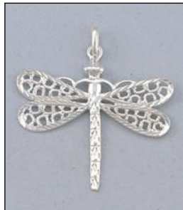
JP124563DC WT: 1.8 gm