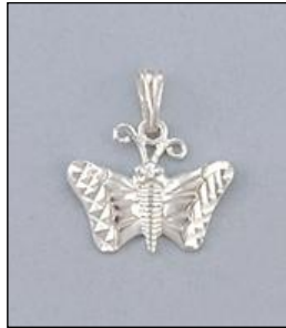
JP124565DC WT: 1.57 gm