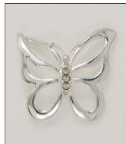
PD126381G18SL WT: 0.01/1.44 gm