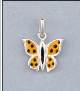
JCH128196EN WT: 1.24 gm