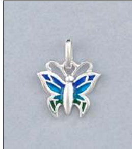
JCH128195EN WT: 1.28 gm