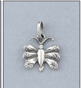
JCH128183AT WT: 1.05 gm