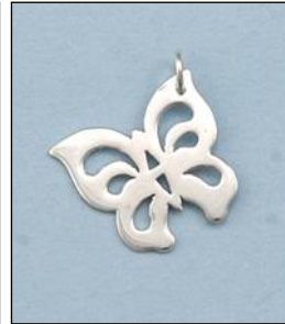
JP132081SL WT: 1.23 gm