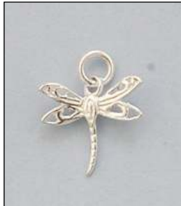
JCH170235SL WT: 0.58 gm