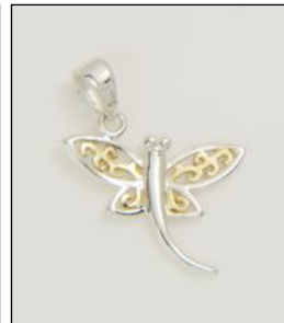
PD1902832T WT: 1 gm