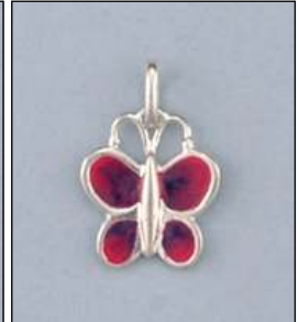
JCH128247EN WT: 1.5 gm