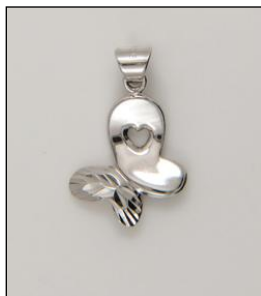
PD190331DC WT: 1.6 gm