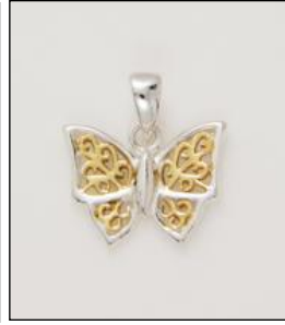
PD1903092T WT: 1.15 gm