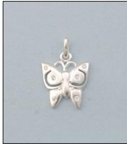
JP125900A18SL WT: 0.02/1.43 gm