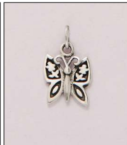
CH170771AT WT: 0.95 gm