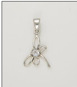
PD126354A18SL WT: 0.04/0.71 gm