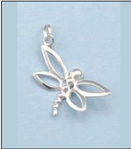
JP125369SL WT: 2 gm