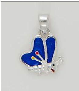
CH170484EN WT: 1.05 gm