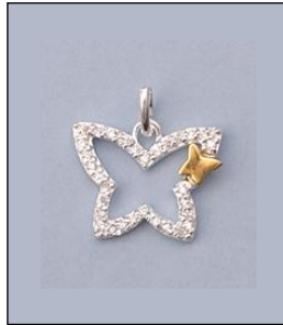
LZJP125969A182T WT: 0.13/1.42 gm