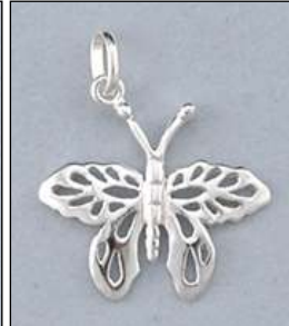
JCH128202SL WT: 1.9 gm