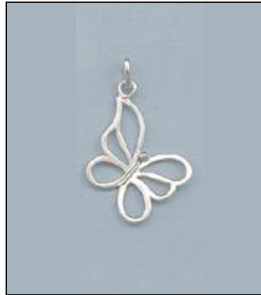
JP125374SL WT: 1.3 gm