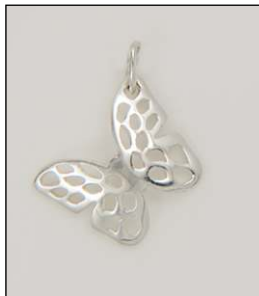
CH170689SL WT: 0.07 gm