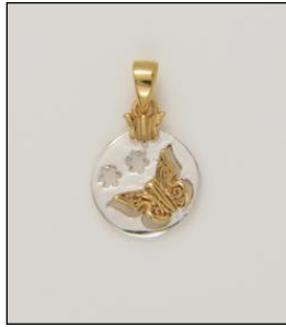
PD1903742T WT: 1.35 gm