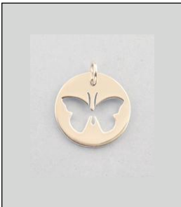
JP160347SL WT: 1.22 gm