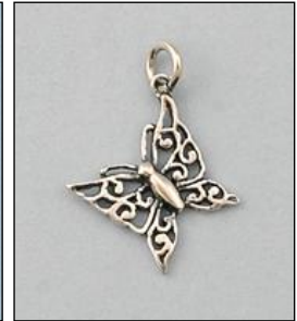
JP160188AT WT: 0.82 gm