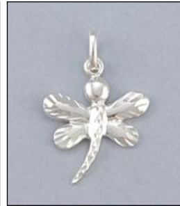
JP124567DC WT: 1.33 gm