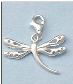
JCH128930SL WT: 2.2 gm