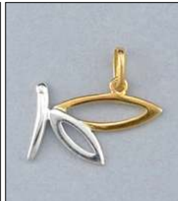
JCH1281862T WT: 1.06 gm