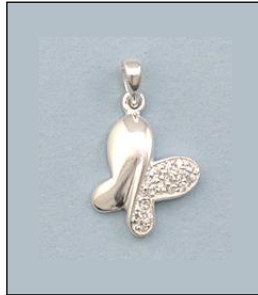
JP125935A18SL WT: 0.06/1.84 gm