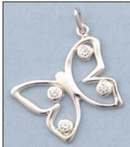
JCH170087A18SL WT: 0.06/1.09 gm