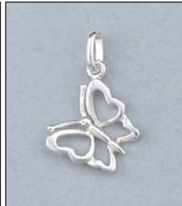
JCH128182SL WT: 1.12 gm