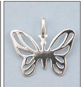
JP125475SL WT: 1.43 gm