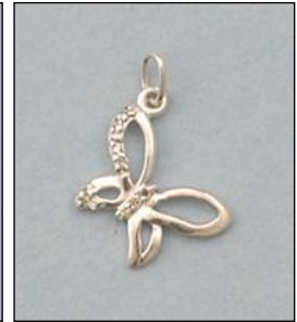
JP126000A18SL WT: 0.02/1.73 gm