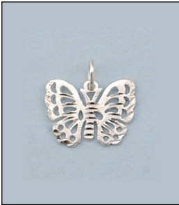
JP1254813T WT: 1.05 gm