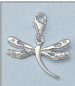
JCH128930A18SL WT: 0.03/2.45 gm