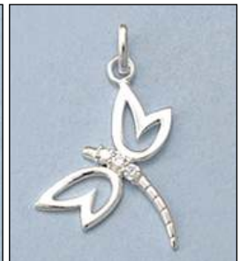
JCH128960A18SL WT: 0.04/1.16 gm