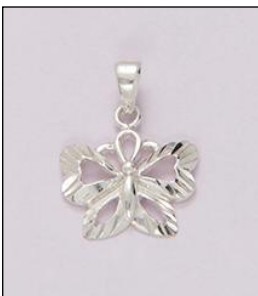
PD190046DC WT: 1.15 gm