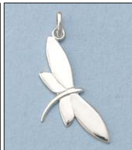
JCH128957SL WT: 1.8 gm