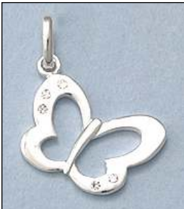
JCH128962A18SL WT: 0.02/1.3 gm