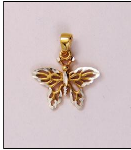
PD1905792T WT: 1.25 gm