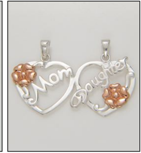
PD1607632T WT: 3.4 gm