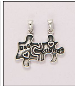
PD190542AT WT: 3.15 gm