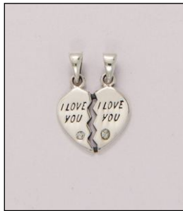
PD126412G18AT WT: 0.01/1.74 gm