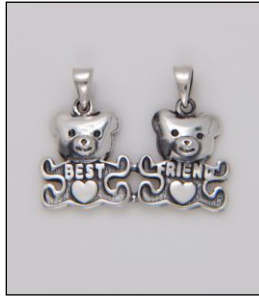
PD160876AT WT: 4.25 gm