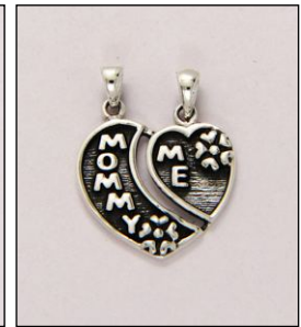
PD190585AT WT: 3.75 gm