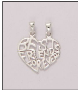
PD190410SL WT: 1.85 gm