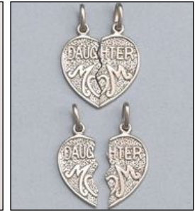
JP124777RH WT: 2.55 gm