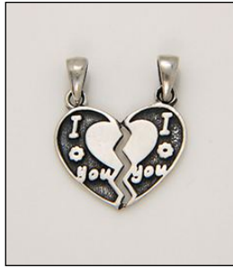
PD160777AT WT: 2 gm