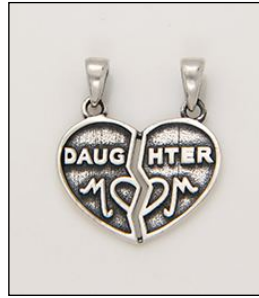
PD160775AT WT: 2.25 gm