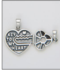
PD160886AT WT: 3.45 gm