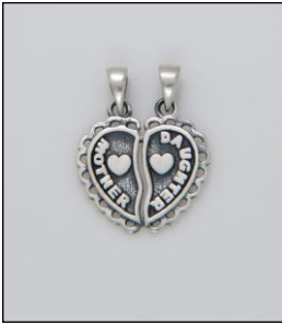
PD160844AT WT: 2.45 gm