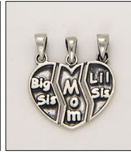
PD160776AT WT: 2.55 gm