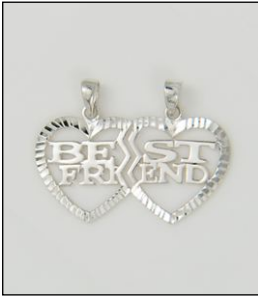
PD160745DC WT: 2.5 gm