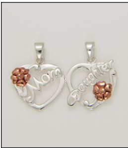
PD1900092T WT: 1.85 gm