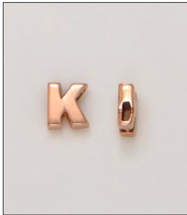
CH170464RG WT: 0.9 gm