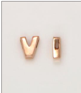
CH170475RG WT: 0.85 gm