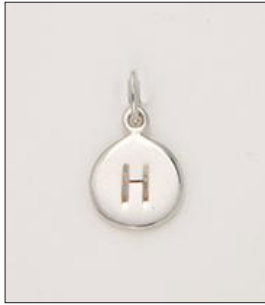
CH170529SL WT: 0.65 gm