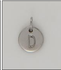
CH170427RH WT: 0.7 gm