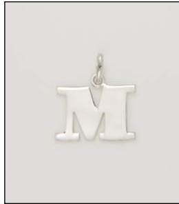
PD190077SL WT: 1.35 gm