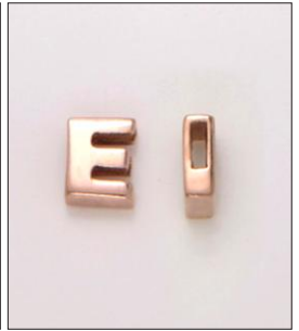
CH170458RG WT: 0.8 gm