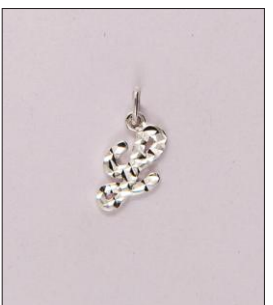
CH170755DC WT: 0.65 gm