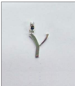
PD190679SL WT: 0.8 gm