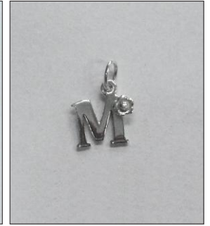
CH170790SL WT: 0.55 gm