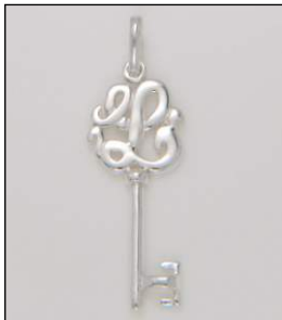
PD160947SL WT: 1.45 gm