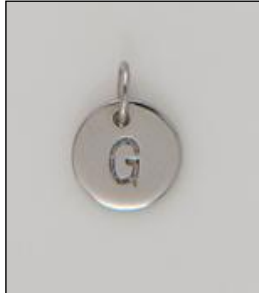
CH170430RH WT: 0.7 gm