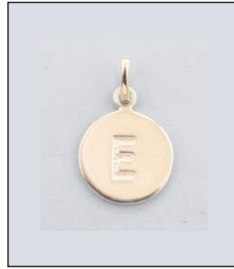
JP160326SL WT: 1.4 gm