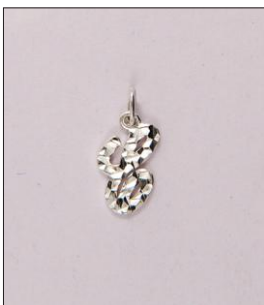
CH170751DC WT: 0.7 gm