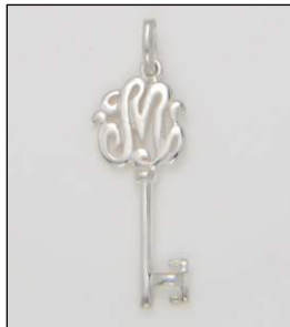
PD160948SL WT: 1.45 gm