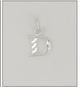
CH1704922T WT: 0.4 gm