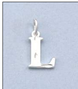
JP1250772T WT: 1.25 gm