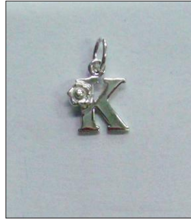
CH170788SL WT: 0.45 gm