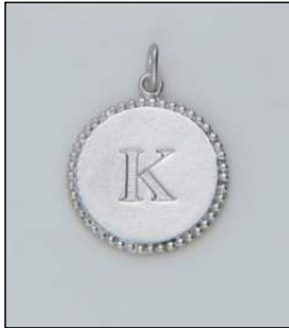
JP1605272T WT: 3.9 gm