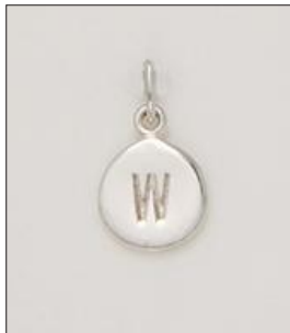
CH170540SL WT: 0.65 gm