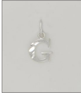
CH1704952T WT: 0.4 gm