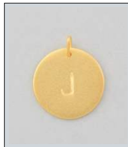
JP1225022T WT: 1.8 gm