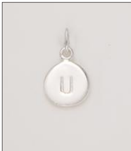
CH170538SL WT: 0.7 gm