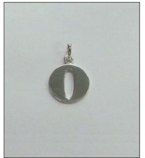
CH170802UF WT: 1.25 gm