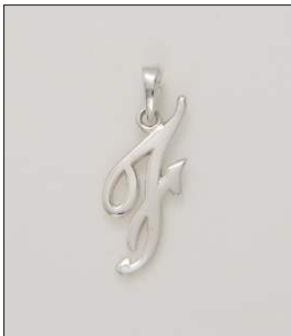
PD190326SL WT: 1.15 gm