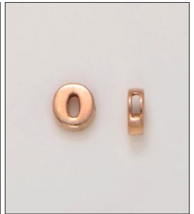
CH170468RG WT: 0.85 gm