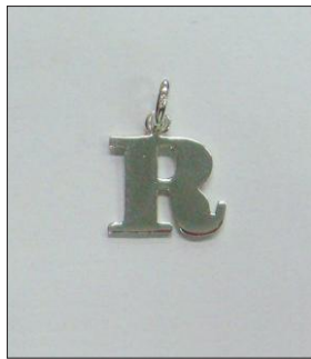
CH170809UF WT: 1.2 gm