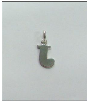
CH170803UF WT: 0.75 gm