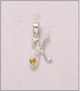
PD1905682T WT: 0.8 gm