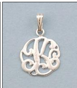
JCH170166SL WT: 0.7 gm