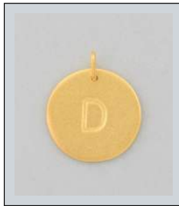
JP1224962T WT: 2 gm