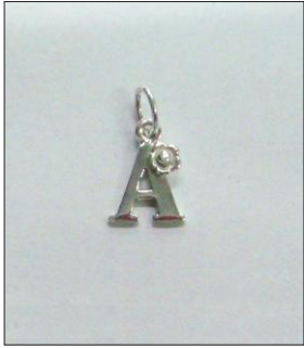
CH170786SL WT: 0.45 gm