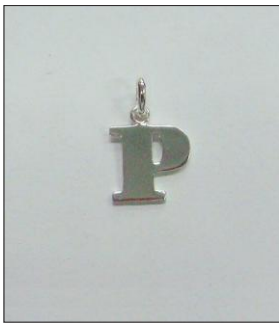
CH170800UF WT: 1.05 gm