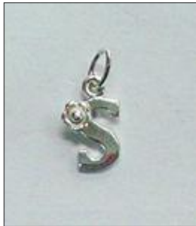
CH170792SL WT: 0.38 gm