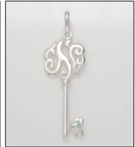
PD160941SL WT: 1.4 gm