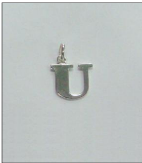
CH170808UF WT: 0.85 gm