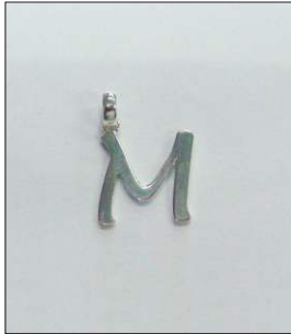
PD190696SL WT: 1.55 gm