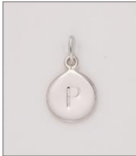
CH170535SL WT: 0.7 gm