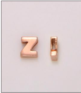
CH170479RG WT: 0.9 gm