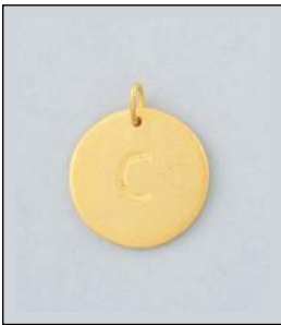
JP1224952T WT: 2.2 gm