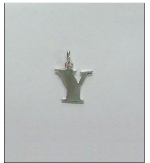
CH170811UF WT: 0.85 gm