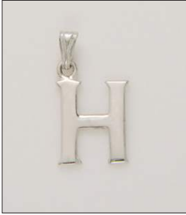
PD190338SL WT: 0.9 gm