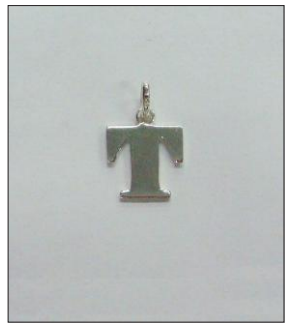
CH170805UF WT: 1 gm