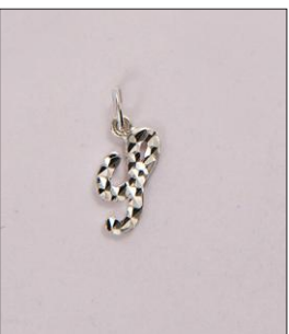
CH170756DC WT: 0.6 gm