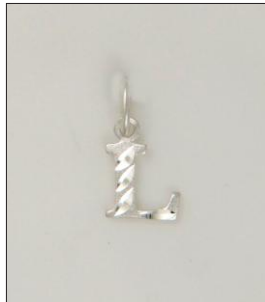
CH1705002T WT: 0.35 gm