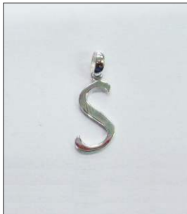
PD190682SL WT: 0.9 gm