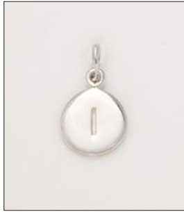
CH170530SL WT: 0.7 gm