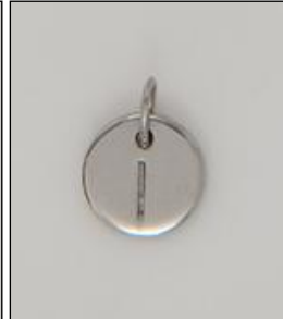
CH170432RH WT: 0.7 gm