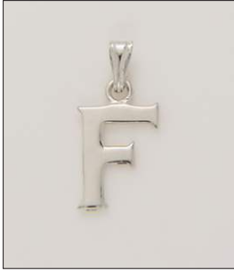
PD190337SL WT: 0.65 gm