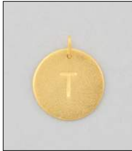
JP1225112T WT: 1.9 gm