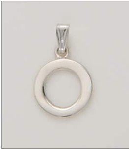
PD190340SL WT: 0.8 gm