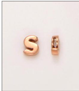
CH170472RG WT: 0.8 gm