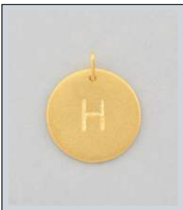
JP1225002T WT: 1.9 gm