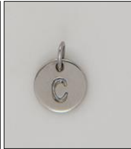
CH170426RH WT: 0.7 gm