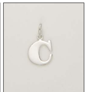
PD190086SL WT: 0.9 gm