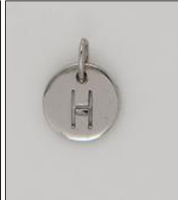
CH170431RH WT: 0.7 gm