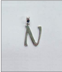
PD190677SL WT: 1.25 gm