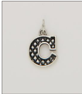
CH170697AT WT: 1.15 gm