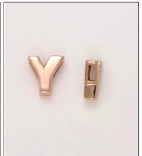
CH170478RG WT: 0.65 gm