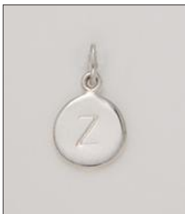
CH170543SL WT: 0.8 gm