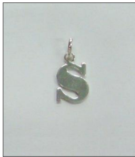
CH170806UF WT: 0.85 gm