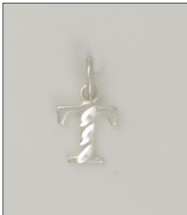
CH1705082T WT: 0.4 gm