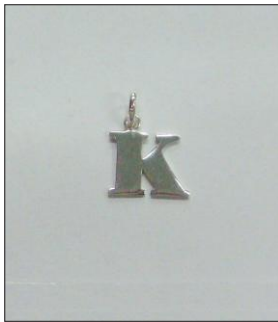
CH170801UF WT: 0 gm