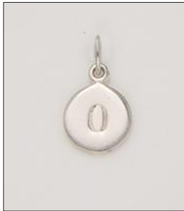
CH170534SL WT: 0.75 gm