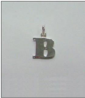
CH170798UF WT: 1.2 gm