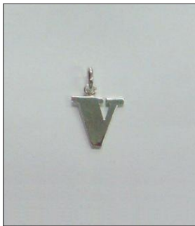
CH170807UF WT: 0.85 gm