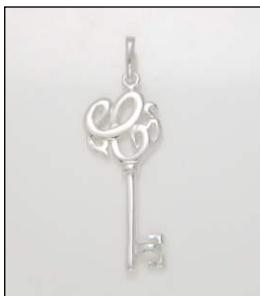
PD160938SL WT: 1.35 gm