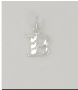
CH1704902T WT: 0.45 gm