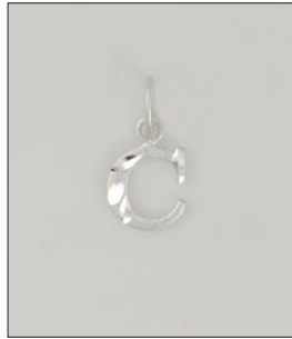
CH1704912T WT: 0.35 gm