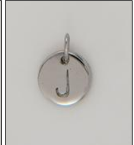
CH170433RH WT: 0.7 gm