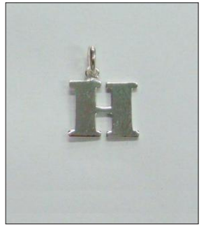
CH170797UF WT: 1.35 gm