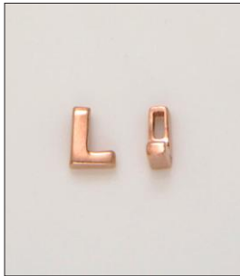
CH170465RG WT: 0.6 gm