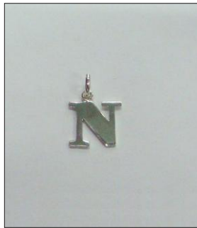
CH170814UF WT: 1.1 gm