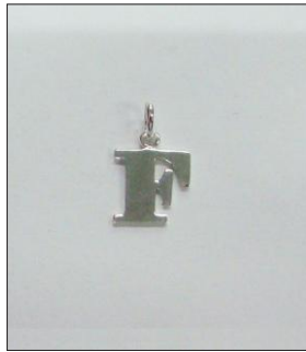
CH170813UF WT: 1 gm