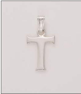
PD190347SL WT: 0.55 gm