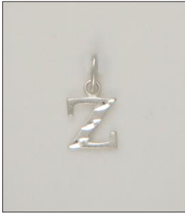
CH1705142T WT: 0.45 gm