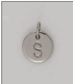
CH170439RH WT: 0.7 gm