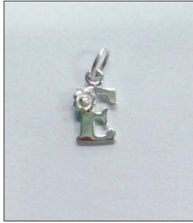
CH170787SL WT: 0.4 gm