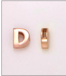
CH170457RG WT: 0.85 gm