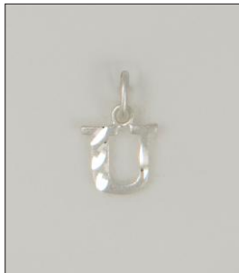
CH1705092T WT: 0.4 gm