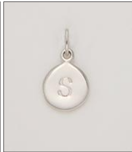
CH170537SL WT: 0.7 gm