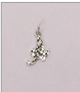
CH170752DC WT: 0.65 gm