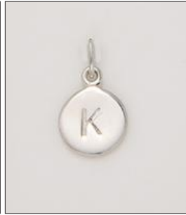
CH170532SL WT: 0.8 gm