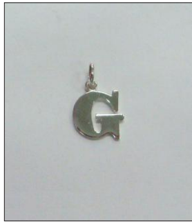
CH170795UF WT: 1.1 gm