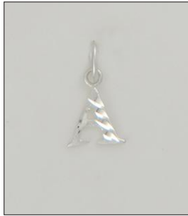
CH1704892T WT: 0.3 gm