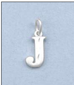
JP1250522T WT: 1.1 gm