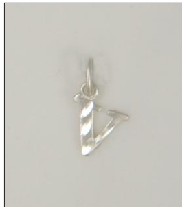
CH1705102T WT: 0.4 gm