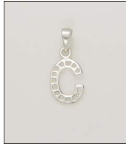
PD190095SL WT: 0.5 gm