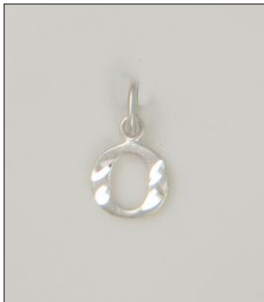
CH1705032T WT: 0.45 gm