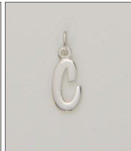
CH170672SL WT: 0.5 gm