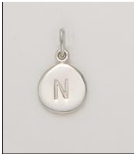
CH170533SL WT: 0.7 gm