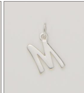
CH170675SL WT: 0.7 gm