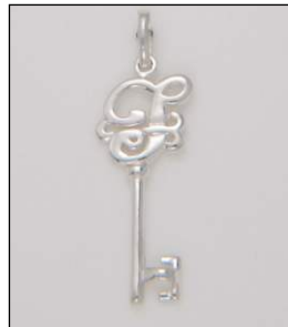
PD160950SL WT: 1.3 gm