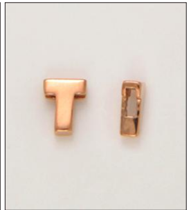
CH170473RG WT: 0.6 gm