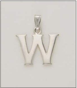
PD190343SL WT: 1.15 gm