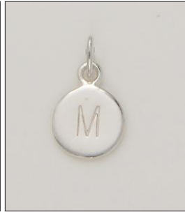
CH170574SL WT: 0.75 gm