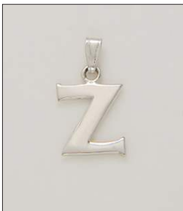
PD190346SL WT: 0.8 gm