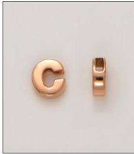
CH170456RG WT: 0.8 gm