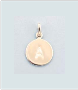
JP160324SL WT: 1.3 gm