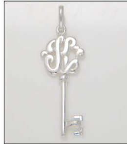
PD160940SL WT: 1.45 gm