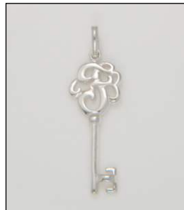
PD160945SL WT: 1.35 gm