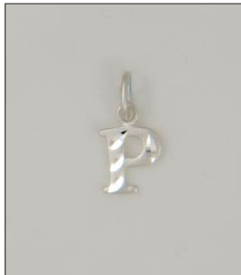
CH1705042T WT: 0.4 gm