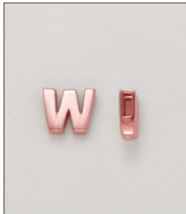
CH170476RG WT: 1.2 gm