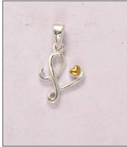
PD1905652T WT: 0.9 gm