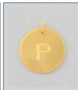
JP1225082T WT: 2 gm