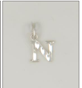
CH1705022T WT: 0.5 gm