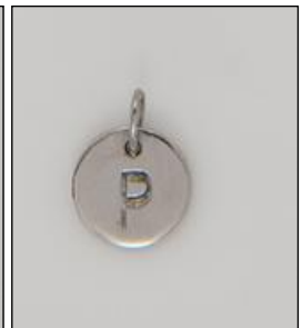
CH170437RH WT: 0.7 gm