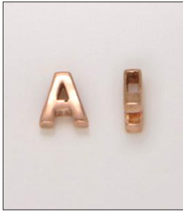
CH170454RG WT: 0.7 gm