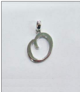
PD190674SL WT: 1.4 gm