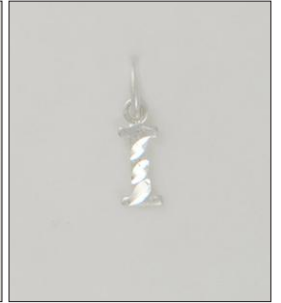
CH1704972T WT: 0.3 gm