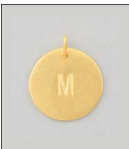
JP1225052T WT: 1.9 gm