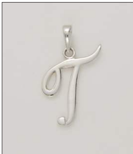
PD190324SL WT: 1.1 gm