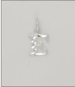
CH1704932T WT: 0.45 gm