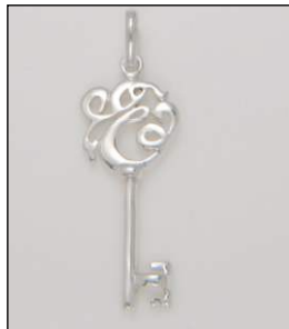
PD160944SL WT: 1.3 gm