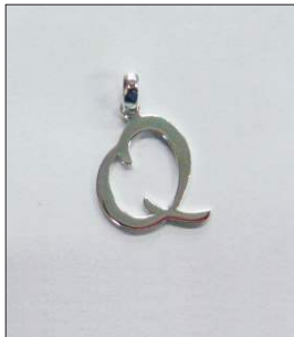
PD190683SL WT: 1.6 gm