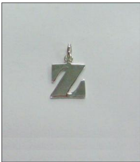
CH170810UF WT: 1.15 gm