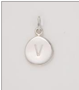
CH170539SL WT: 0.75 gm