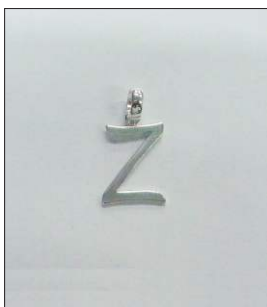
PD190700SL WT: 1.05 gm