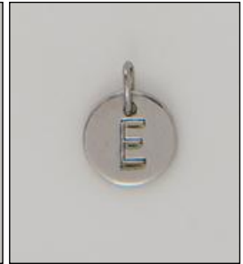
CH170428RH WT: 0.7 gm