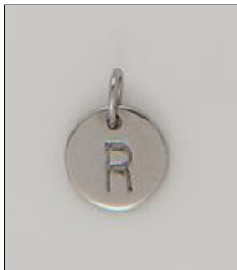
CH170438RH WT: 0.7 gm