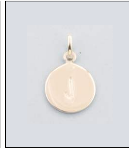
JP160327SL WT: 1.4 gm