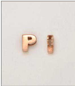
CH170469RG WT: 0.65 gm