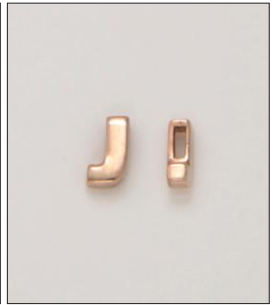
CH170463RG WT: 0.6 gm