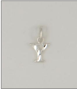
CH1705132T WT: 0.35 gm