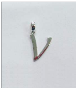
PD190680SL WT: 0.95 gm