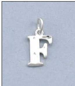
JP1249222T WT: 1.58 gm