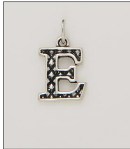
CH170698AT WT: 1.12 gm