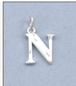
JP1249242T WT: 1.7 gm