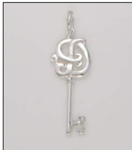
PD160943SL WT: 1.4 gm