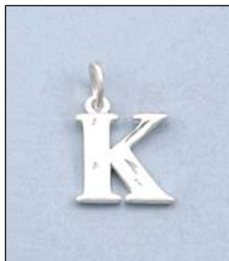
JP1250532T WT: 2 gm