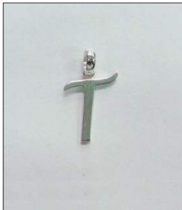
PD190698SL WT: 0.85 gm