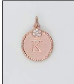
JP126270A182T WT: 0.03/2.32 gm