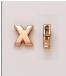
CH170477RG WT: 0.9 gm