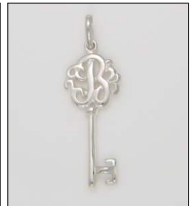
PD160951SL WT: 1.25 gm