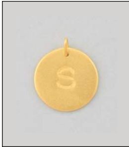
JP1225102T WT: 2 gm