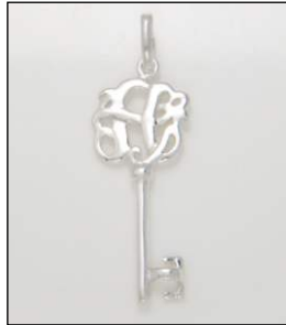
PD160937SL WT: 1.35 gm