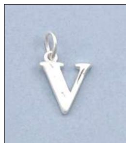
JP1249232T WT: 1.3 gm