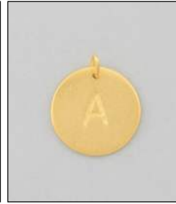
JP1224932T WT: 1.84 gm