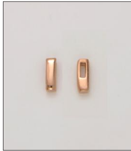
CH170462RG WT: 0.4 gm