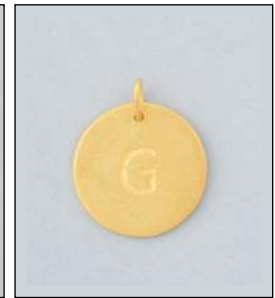
JP1224992T WT: 2 gm