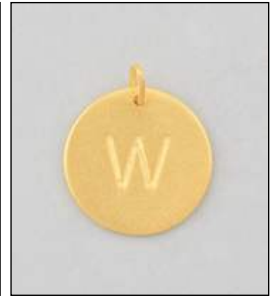
JP1225142T WT: 1.8 gm