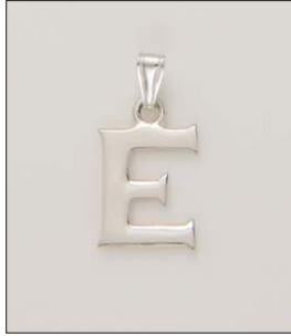
PD190336SL WT: 0.75 gm