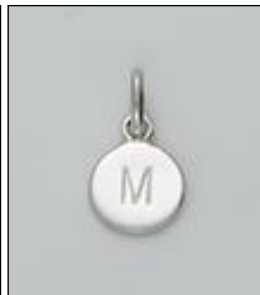
JCH170394SL WT: 1.04 gm