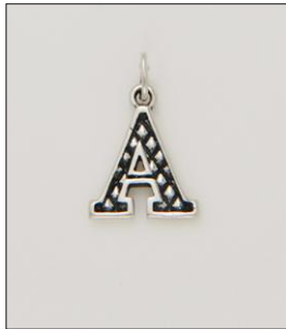
CH170696AT WT: 1 gm