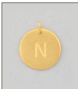
JP1225062T WT: 1.95 gm