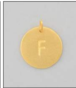
JP1224982T WT: 1.9 gm