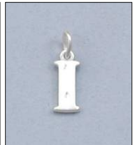
JP1249262T WT: 1.14 gm