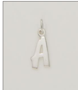
CH170671SL WT: 0.5 gm