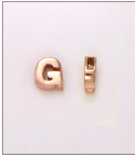
CH170460RG WT: 0.85 gm