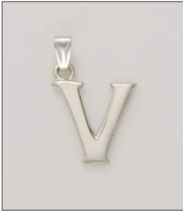
PD190342SL WT: 0.7 gm