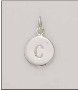
CH170571SL WT: 0.85 gm