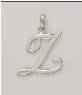
PD190327SL WT: 1.75 gm