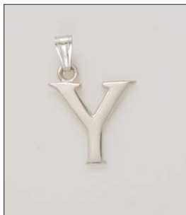
PD190345SL WT: 0.65 gm