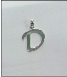
PD190693SL WT: 1.4 gm