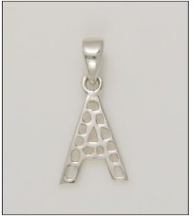
CH170679SL WT: 0.5 gm