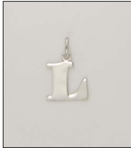
PD190078SL WT: 0.85 gm