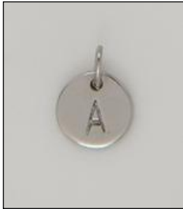
CH170424RH WT: 0.7 gm