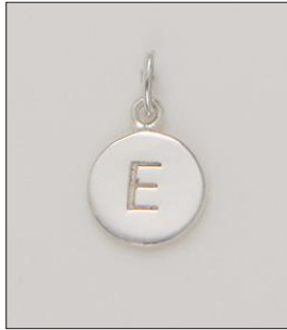
CH170572SL WT: 0.9 gm