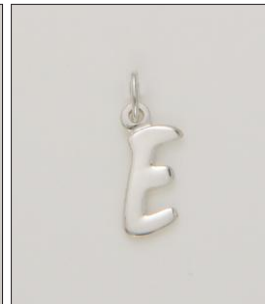
CH170673SL WT: 0.55 gm