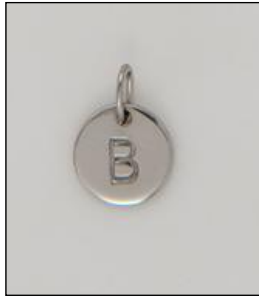
CH170425RH WT: 0.7 gm