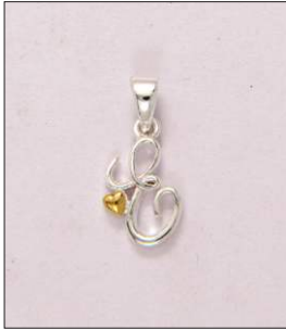
PD1905692T WT: 0.85 gm