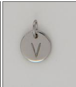
CH170441RH WT: 0.7 gm