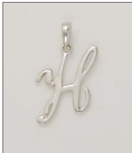
PD190325SL WT: 1.4 gm