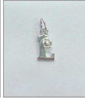
CH170789SL WT: 0.35 gm