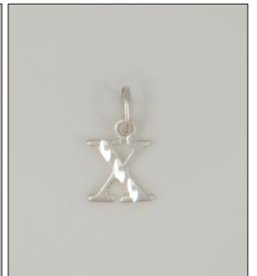
CH1705122T WT: 0.4 gm