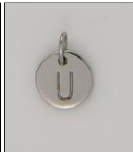
CH170440RH WT: 0.7 gm