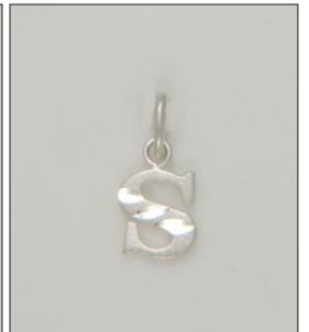
CH1705072T WT: 0.4 gm