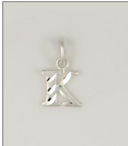
CH1704992T WT: 0.4 gm