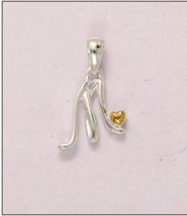
PD1905672T WT: 1 gm