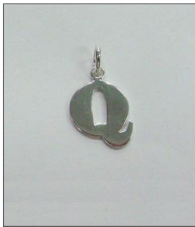
CH170799UF WT: 1.3 gm