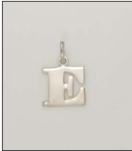
PD190079SL WT: 1.05 gm