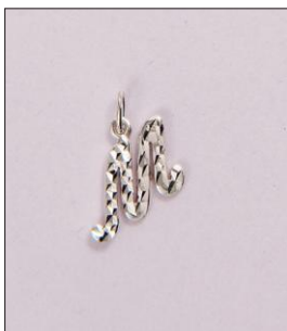
CH170753DC WT: 0.85 gm