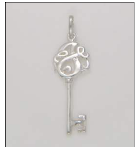
PD160946SL WT: 1.3 gm