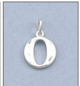
JP1249252T WT: 1.7 gm