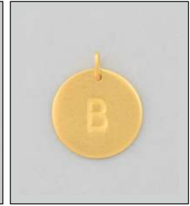
JP1224942T WT: 1.9 gm