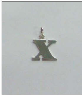
CH170812UF WT: 1.05 gm