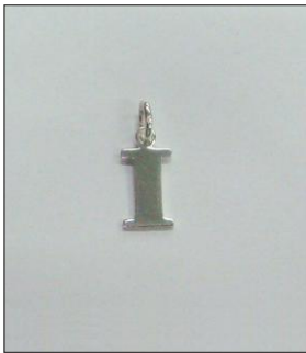
CH170794UF WT: 0.7 gm