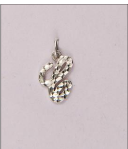
CH170754DC WT: 0.65 gm