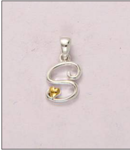
PD1905662T WT: 0.9 gm