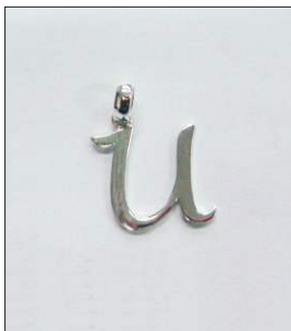
PD190681SL WT: 1.25 gm