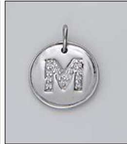
JP126280A18RH WT: 0.06/2.49 gm