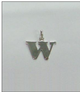
CH170804UF WT: 1.3 gm