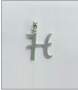
PD190694SL WT: 1.3 gm