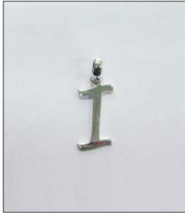
PD190685SL WT: 0.9 gm