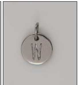
CH170442RH WT: 0.7 gm