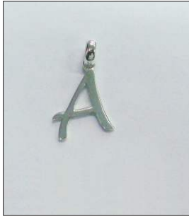
PD190691SL WT: 1 gm