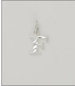
CH1704942T WT: 0.4 gm