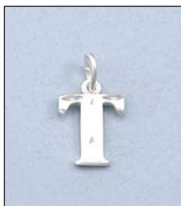
JP1250742T WT: 1 gm