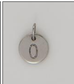
CH170436RH WT: 0.7 gm