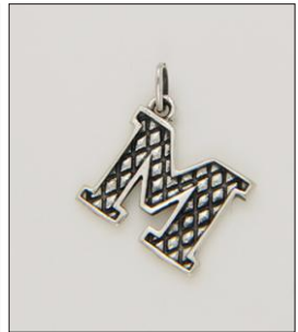
CH170700AT WT: 1.6 gm