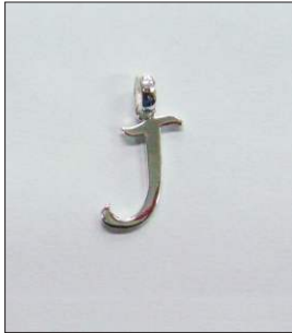
PD190686SL WT: 0.9 gm