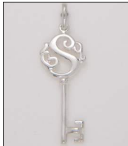
PD160949SL WT: 1.3 gm