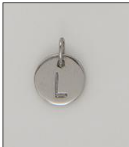
CH170435RH WT: 0.7 gm