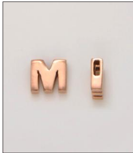
CH170466RG WT: 1.3 gm