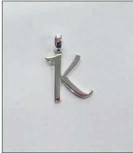
PD190684SL WT: 1.15 gm