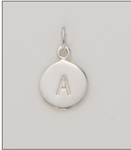
CH170570SL WT: 0.7 gm