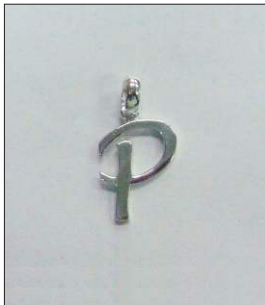
PD190697SL WT: 1.1 gm