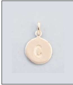
JP160325SL WT: 1.4 gm