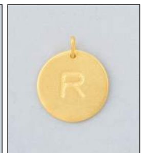
JP1225092T WT: 1.9 gm