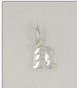
CH1705062T WT: 0.45 gm