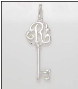
PD160942SL WT: 1.3 gm