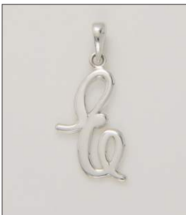
PD1902752T WT: 1.25 gm