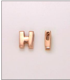
CH170461RG WT: 0.95 gm