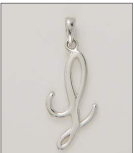
PD190323SL WT: 1.15 gm