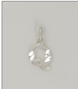
CH1705052T WT: 0.5 gm