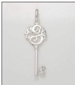
PD160939SL WT: 1.4 gm