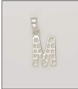
PD190102SL WT: 0.75 gm