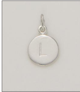
CH170573SL WT: 0.75 gm