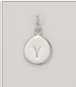
CH170542SL WT: 0.75 gm