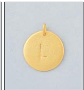
JP1225042T WT: 1.9 gm