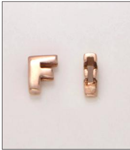
CH170459RG WT: 0.65 gm