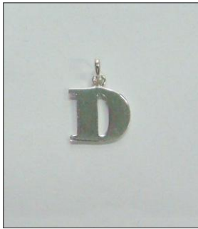
CH170796UF WT: 1.3 gm