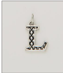
CH170699AT WT: 1 gm