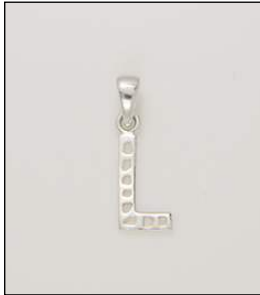
PD190097SL WT: 0.47 gm