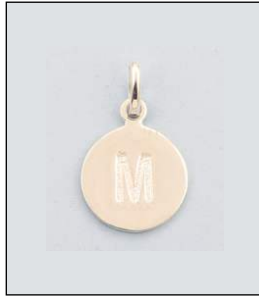
JP160330SL WT: 1.3 gm