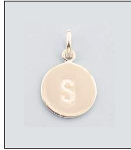
JP160331SL WT: 1.4 gm