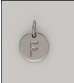
CH170429RH WT: 0.7 gm