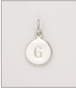
CH170528SL WT: 0.75 gm