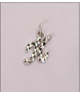
CH170758DC WT: 0.65 gm