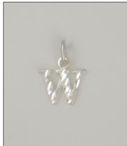
CH1705112T WT: 0.5 gm