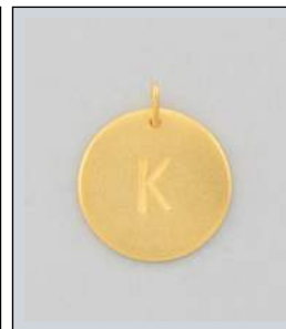
JP1225032T WT: 1.9 gm