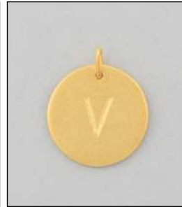
JP1225132T WT: 1.9 gm