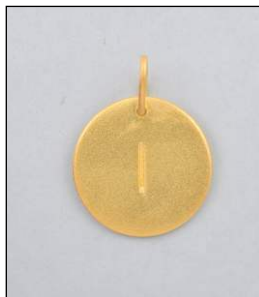
JP1225012T WT: 1.9 gm