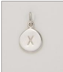
CH170541SL WT: 0.7 gm