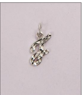
CH170757DC WT: 0.55 gm