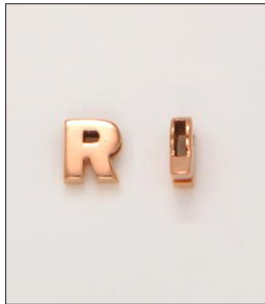
CH170471RG WT: 1.1 gm