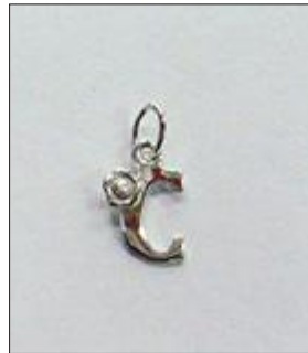
CH170793SL WT: 0.3 gm