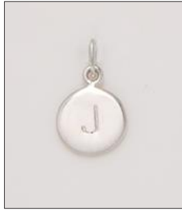
CH170531SL WT: 0.75 gm