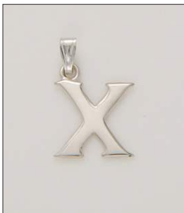
PD190344SL WT: 0.8 gm