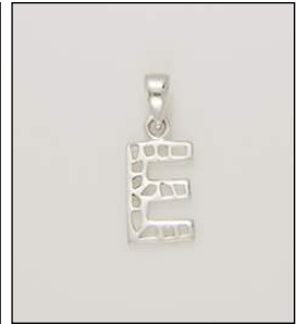
PD190099SL WT: 0.6 gm