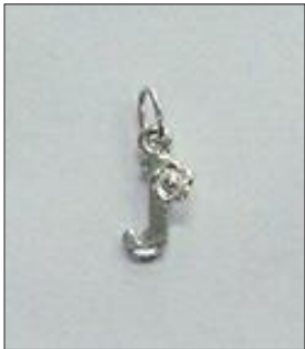
CH170791SL WT: 0.28 gm