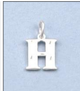
JP1250792T WT: 2 gm