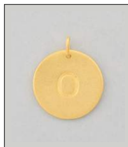
JP1225072T WT: 2 gm