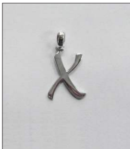
PD190678SL WT: 1.05 gm