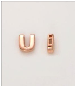
CH170474RG WT: 0.8 gm