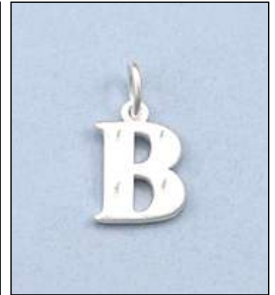
JP1250782T WT: 1.75 gm