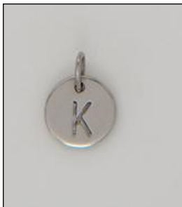
CH170434RH WT: 0.6 gm