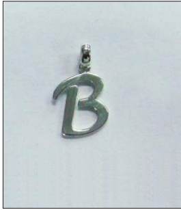
PD190692SL WT: 1.4 gm