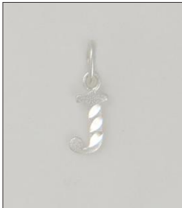
CH1704982T WT: 0.3 gm