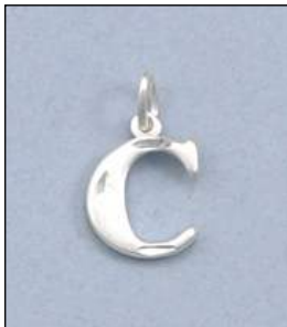
JP1249842T WT: 1.4 gm