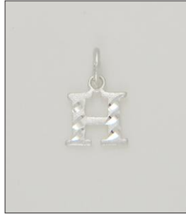
CH1704962T WT: 0.5 gm