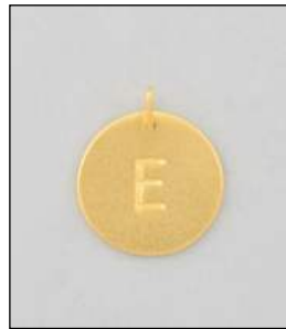
JP1224972T WT: 1.9 gm