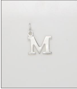
CH170590SL WT: 0.5 gm