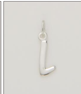
CH170674SL WT: 0.4 gm