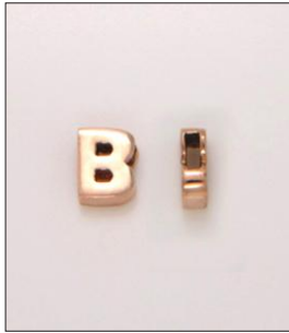
CH170455RG WT: 0.9 gm