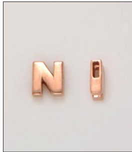
CH170467RG WT: 1.05 gm