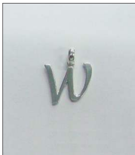
PD190699SL WT: 1.5 gm