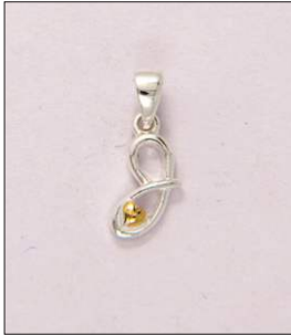
PD1905642T WT: 0.85 gm