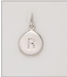
CH170536SL WT: 0.75 gm