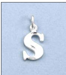
JP1251162T WT: 1.5 gm