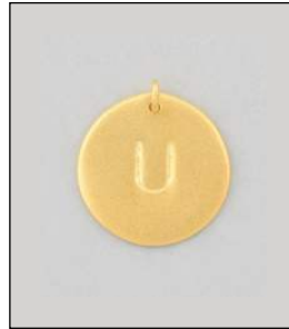
JP1225122T WT: 1.9 gm