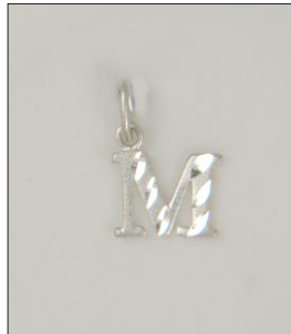
CH1705012T WT: 0.55 gm