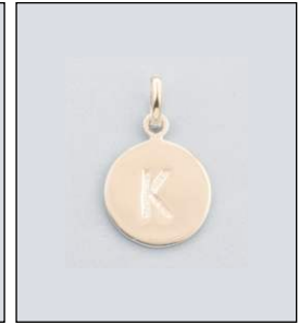
JP160328SL WT: 1.5 gm