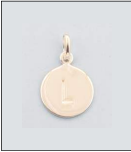
JP160329SL WT: 1.3 gm