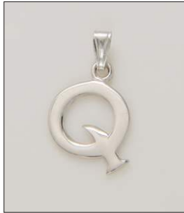
PD190341SL WT: 0.9 gm