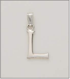
PD190339SL WT: 0.5 gm