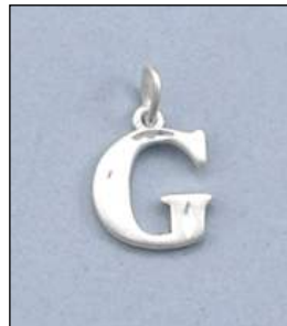
JP1249272T WT: 1.8 gm