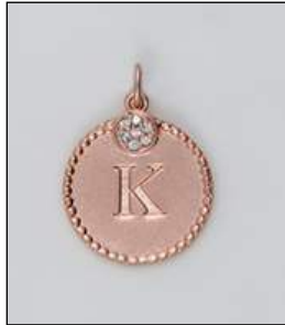
JP126269A182T WT: 0.04/3.01 gm