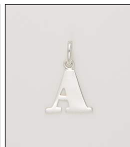
PD190085SL WT: 0.7 gm