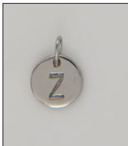
CH170444RH WT: 0.7 gm