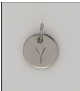
CH170443RH WT: 0.7 gm