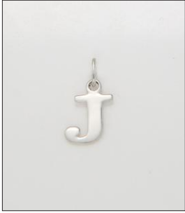
CH170589SL WT: 0.3 gm