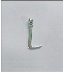
PD190695SL WT: 0.75 gm