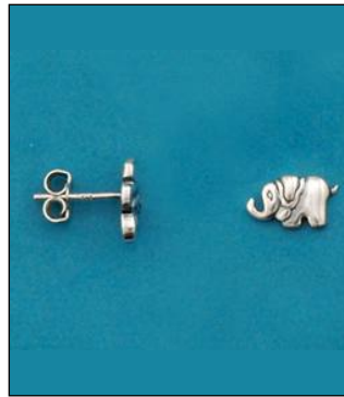
JE102329AT WT: 1.2 gm