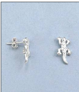
JE100854A18SL WT: 0.03/1.43 gm