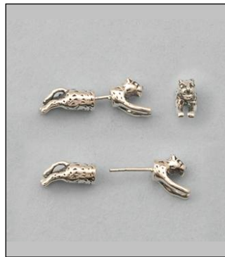
JE180035AT WT: 4.85 gm