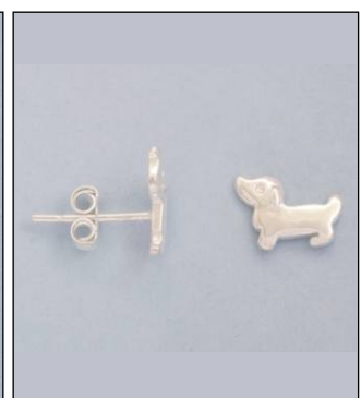
JE180594SL WT: 1.15 gm