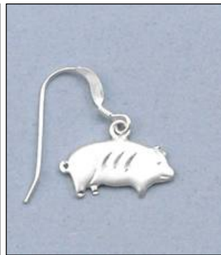
JE1007132T WT: 2.5 gm