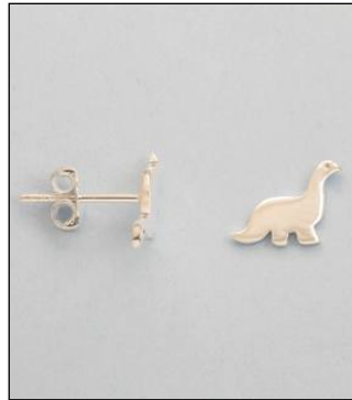
JE180606SL WT: 0.8 gm