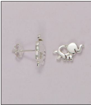
ER182149SL WT: 1.65 gm