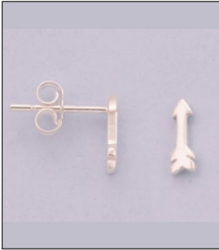
JE180458SL WT: 0.55 gm