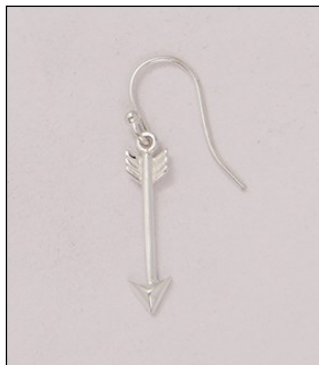
ER182917SL WT: 1.65 gm