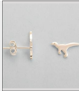
JE180611SL WT: 0.7 gm