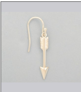
JE180854SL WT: 1.9 gm