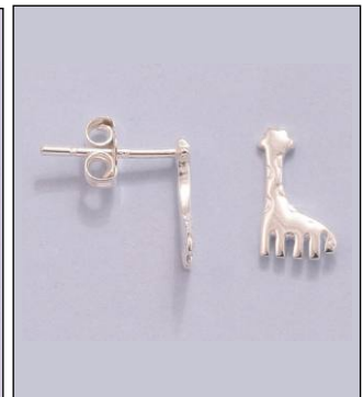
JE132249SL WT: 0.8 gm