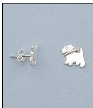
JE101746SL WT: 1.35 gm