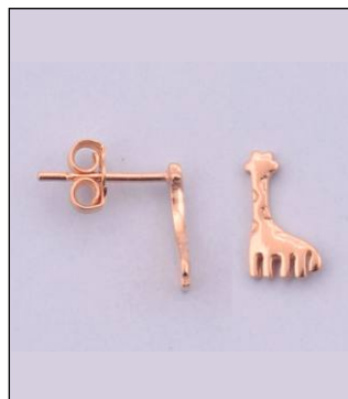
JE132249MG WT: 0.8 gm