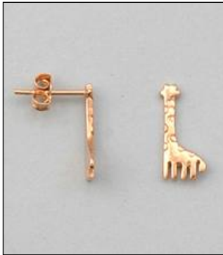
JE180245RG WT: 1 gm