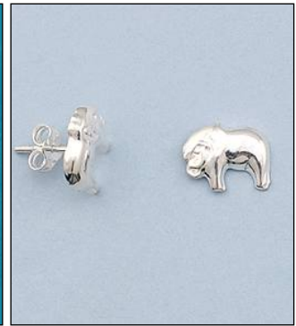
JE101678SL WT: 0.8 gm