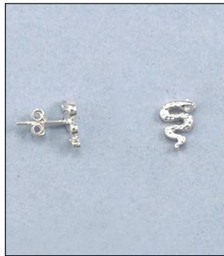
JE100897SL WT: 1.45 gm