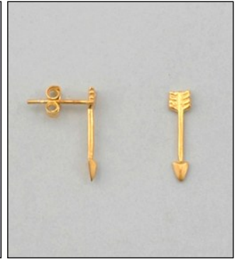
JE1802672T WT: 0.74 gm