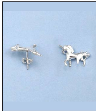
JE101049SL WT: 2.95 gm