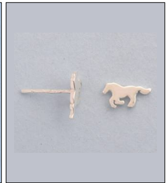
JE180504NBFSL WT: 0.7 gm