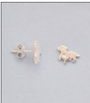
JE180603SL WT: 0.85 gm