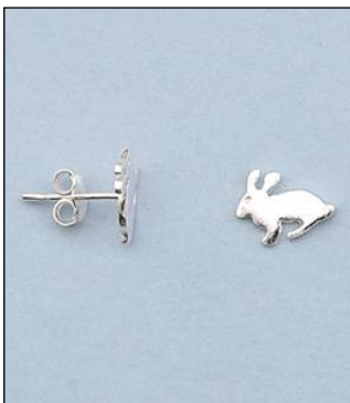
JE101682SL WT: 1 gm