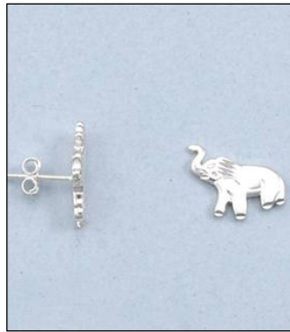
JE100778DC WT: 2.5 gm