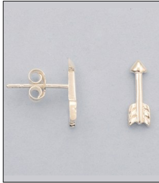
JE180692SL WT: 0.8 gm