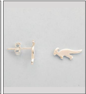
JE180612SL WT: 0.9 gm