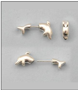
JE180034SL WT: 6.25 gm