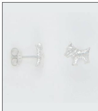
JE181261SL WT: 0.53 gm