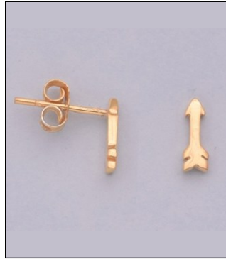
JE180458MG WT: 0.55 gm