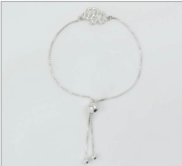
JB108363A18SL WT: 0.09/3.24 gm