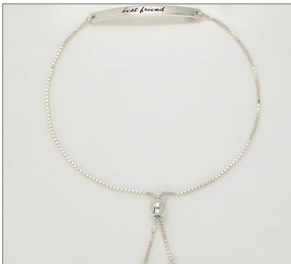
BR107142EN WT: 3.2 gm