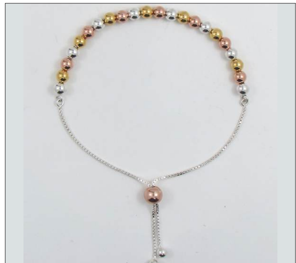
JB1069433T WT: 6.5 gm