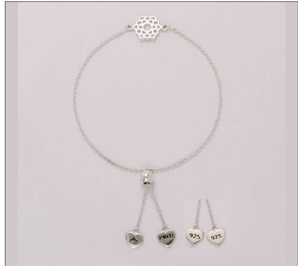
BR107307EN WT: 3.05 gm