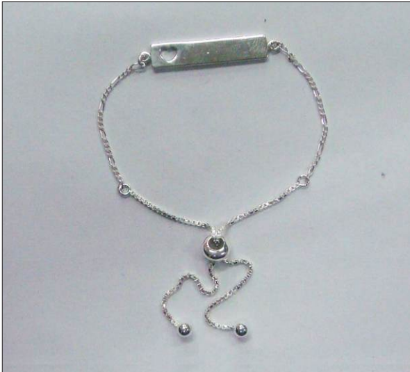
BR107435SL WT: 4 gm