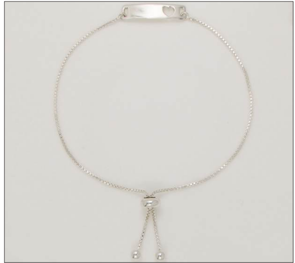
BR107222SL WT: 3.05 gm