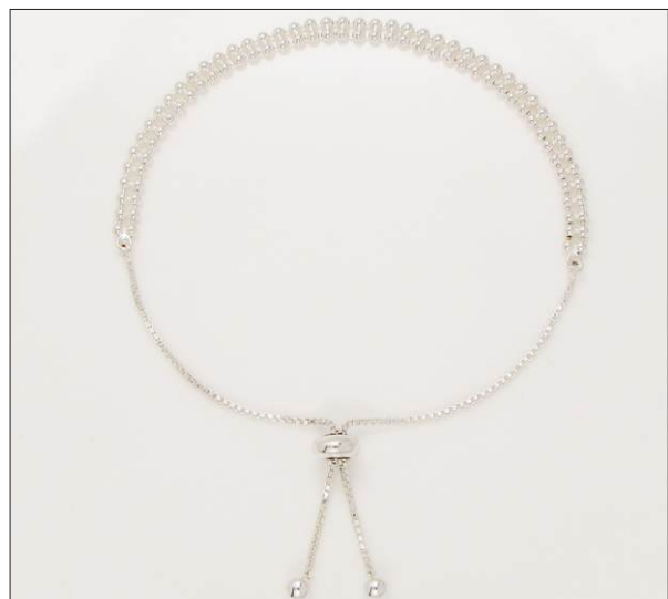
BR107182SL WT: 4.3 gm