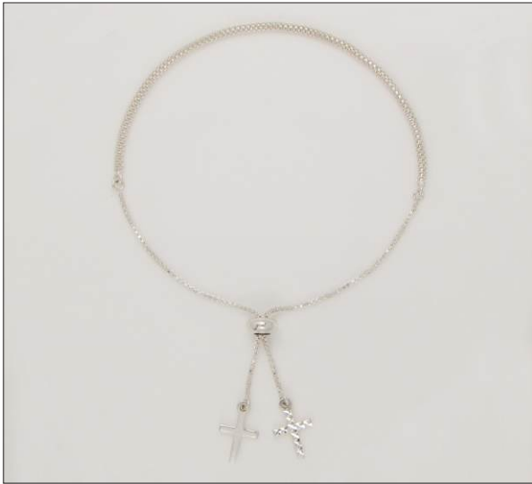
BR107189DC WT: 3.85 gm