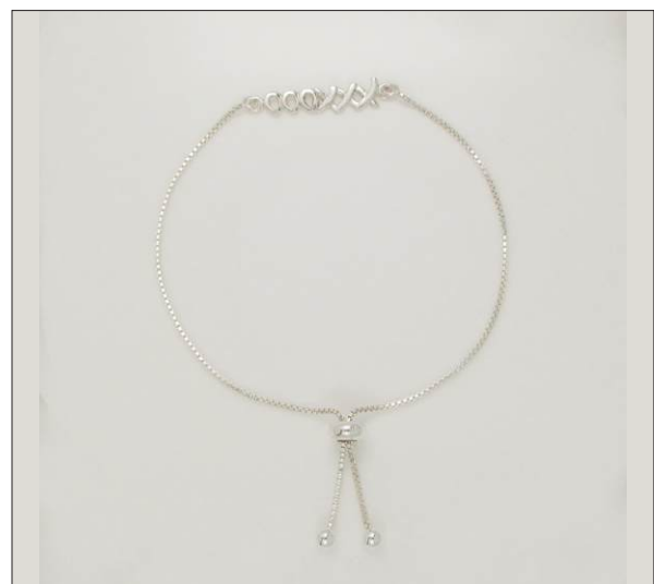
BR107242SL WT: 3.05 gm