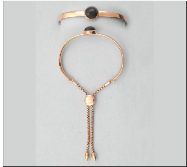
JB108322A2RG WT: 0.97/14.63 gm