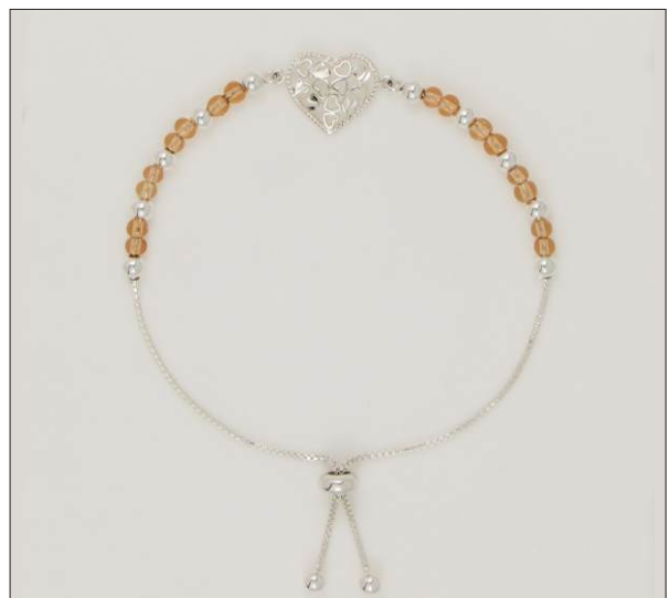
BR108407G10DC WT: 0.85/3.65 gm