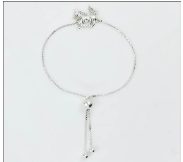
JB108364G18SL WT: 0.07/3.98 gm