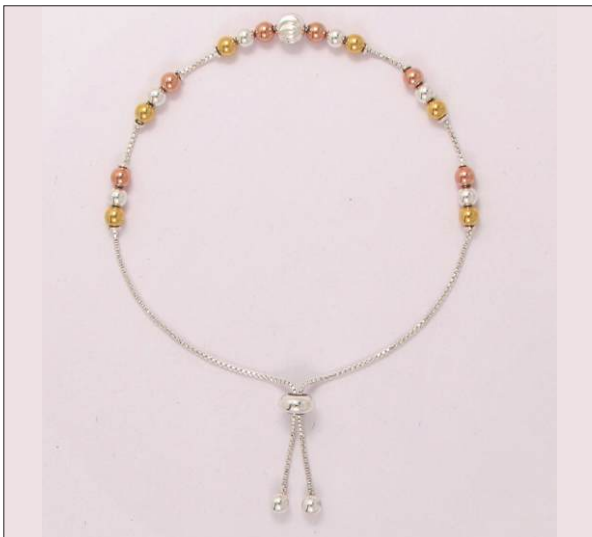
UBR107319MF WT: 4.25 gm