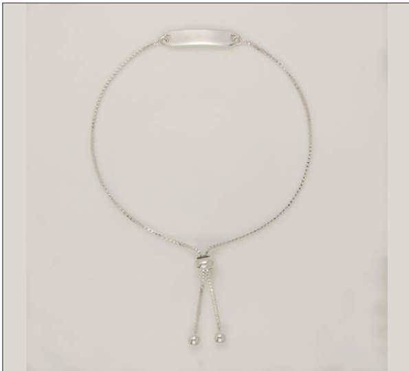
BR107223SL WT: 2.9 gm