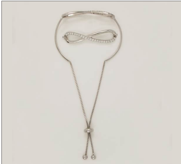
BR108411A18RH WT: 0.21/5.59 gm