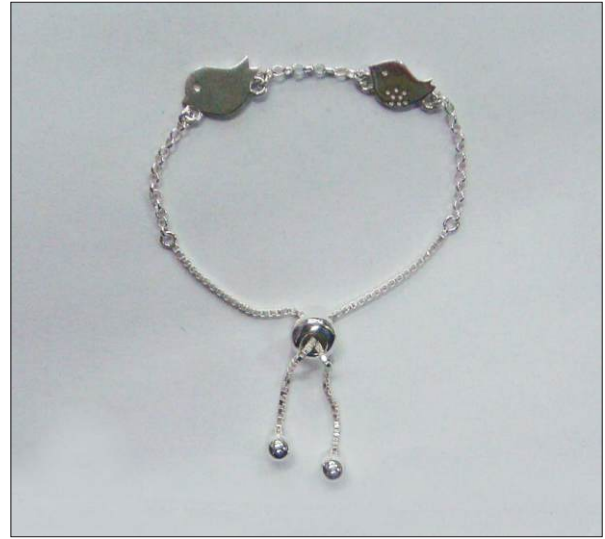
BR107423SL WT: 2.65 gm