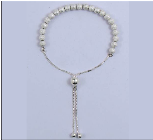
JB1069302T WT: 6.5 gm