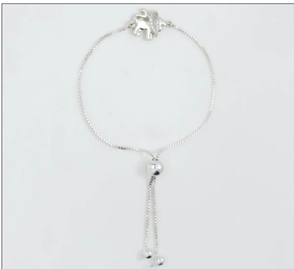
JB106949SL WT: 3.75 gm