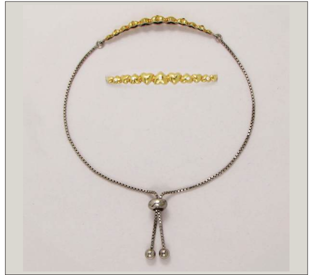
BR108414G182T WT: 4.15 gm