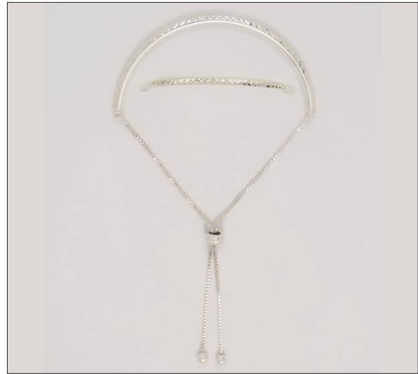
AFBR5169DC WT: 3.65 gm