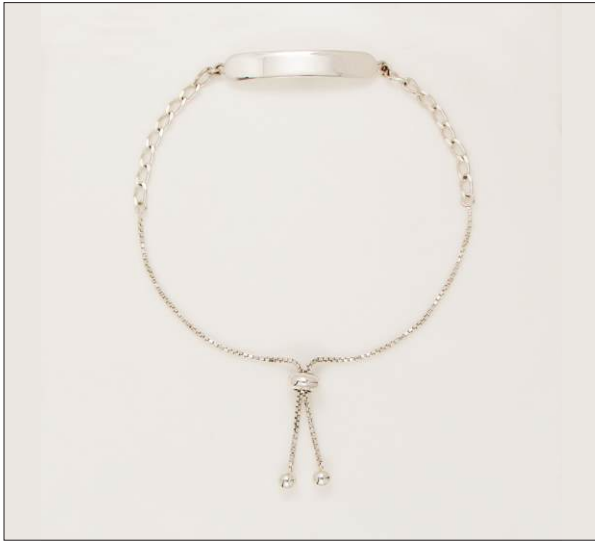
BR107268SL WT: 4.8 gm