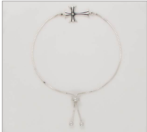
BR1071832T WT: 3.35 gm