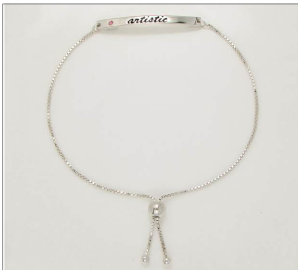
BR107147C38EN WT: 3.2 gm