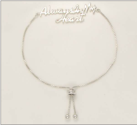
BR107083SL WT: 4.35 gm