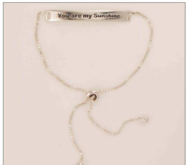
BR107452AT WT: 4.7 gm