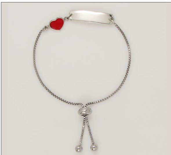
BR1072592T WT: 3.35 gm