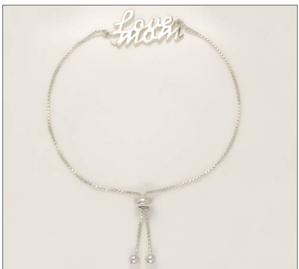
BR107080SL WT: 4.05 gm