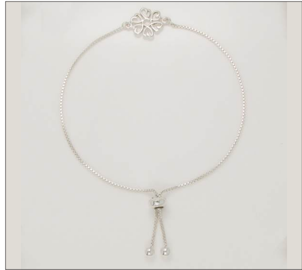
BR107243SL WT: 9.25 gm