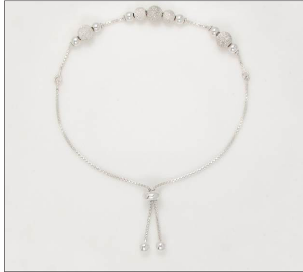
LZBR1071232T WT: 4.6 gm