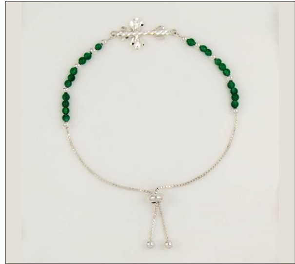
BR108403A25DC WT: 0.55/3.65 gm