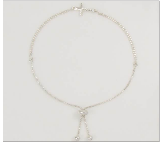
BR107190DC WT: 2.8 gm