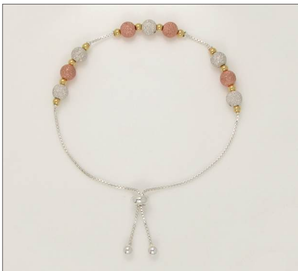
UBR107210MF WT: 5.9 gm