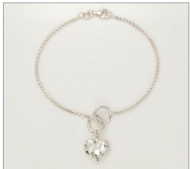
BR107208S7HIDC WT: 4.3 gm