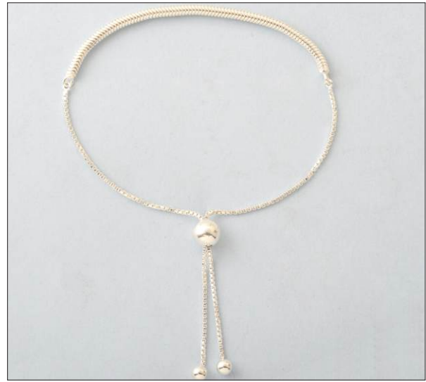
JB106866SL WT: 4.1 gm