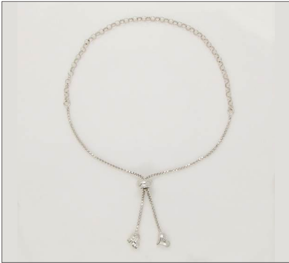
BR107176DC WT: 2.4 gm