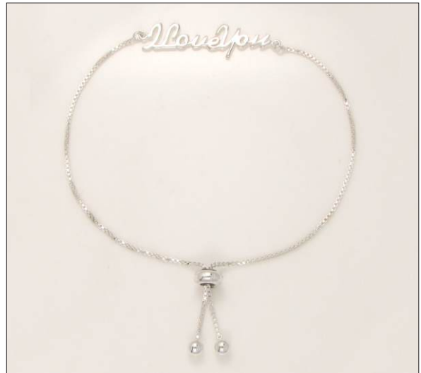
BR107086SL WT: 3.35 gm