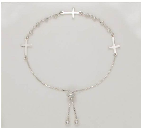
BR107180SL WT: 3.75 gm