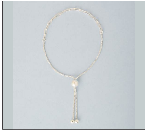
JB106857SL WT: 2.8 gm