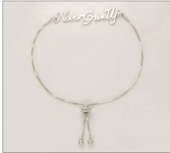
BR107082SL WT: 3.35 gm