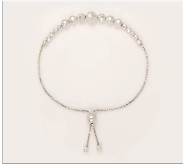
BR1071542T WT: 5.65 gm