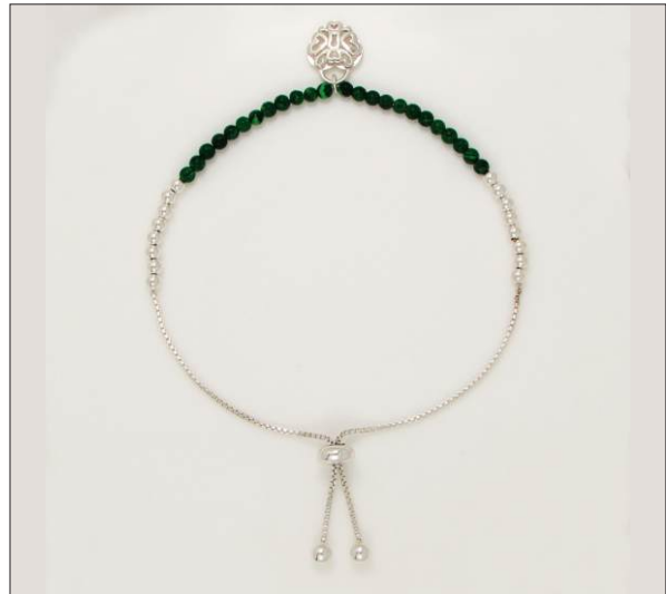
UBR108406A8SL WT: 0.71/3.39 gm