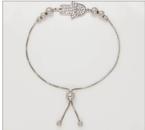
BR108396A18RH WT: 0.31/5.29 gm