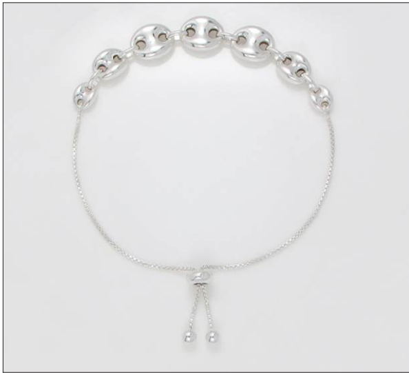
BR107117SL WT: 6.2 gm