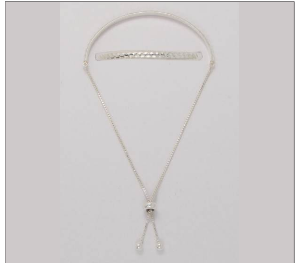
AFBR5175SL WT: 4.1 gm