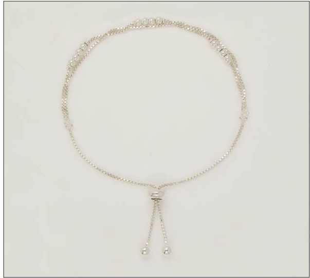
BR107271SL WT: 3.75 gm