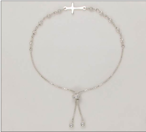
BR107181SL WT: 3.25 gm