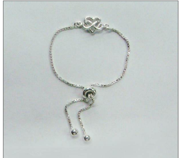
BR107440SL WT: 2.3 gm