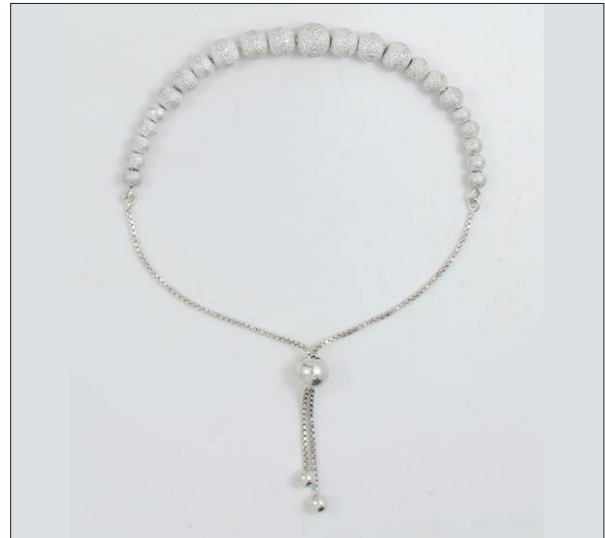
JB1069372T WT: 6.95 gm