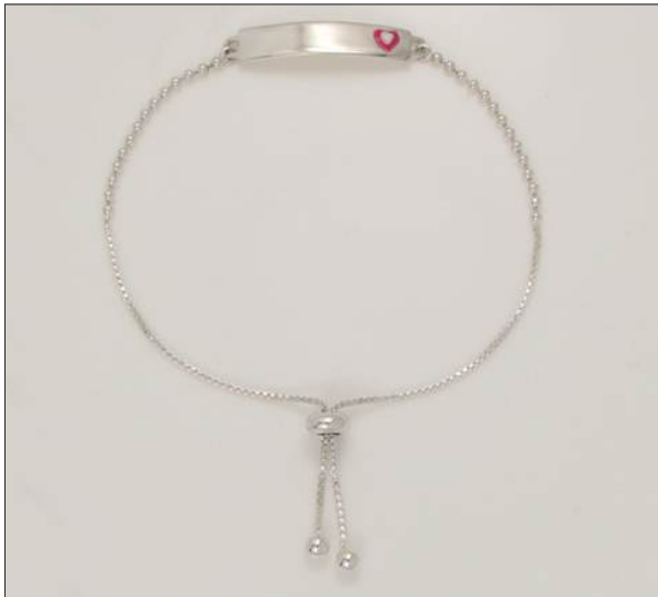
BR107078EN WT: 4.5 gm