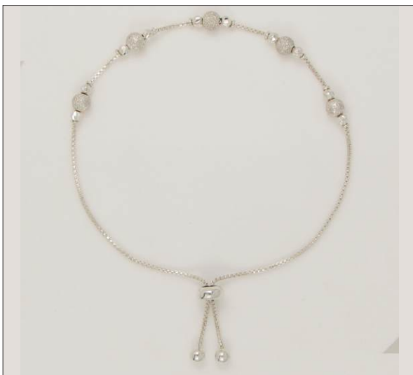
UBR1072113T WT: 3.8 gm