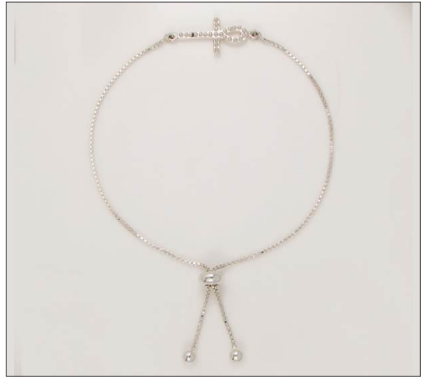
BR107177SL WT: 3.2 gm