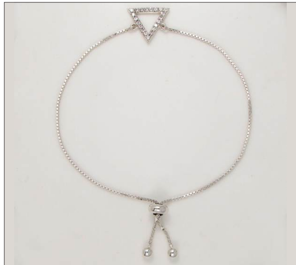
BR107132A18SL WT: 0.19/3.06 gm