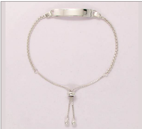
BR107341SL WT: 5.54 gm