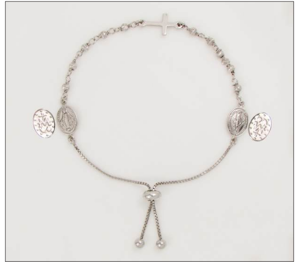
BR1071862T WT: 4.3 gm