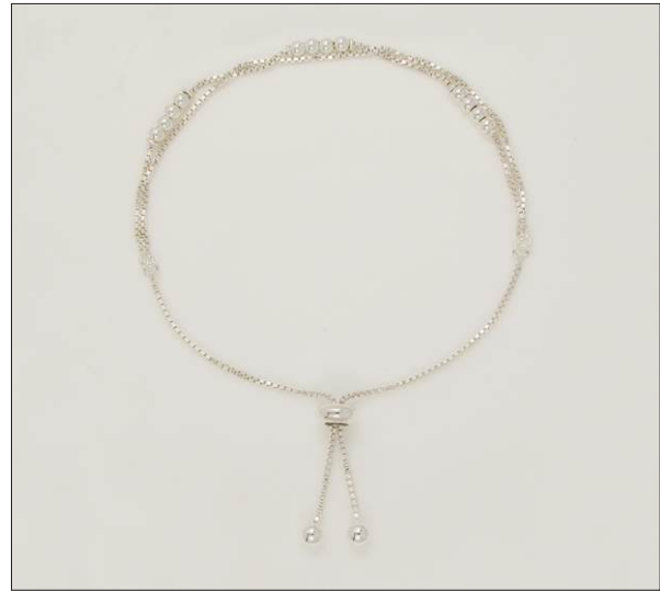
BR107271SL WT: 3.75 gm