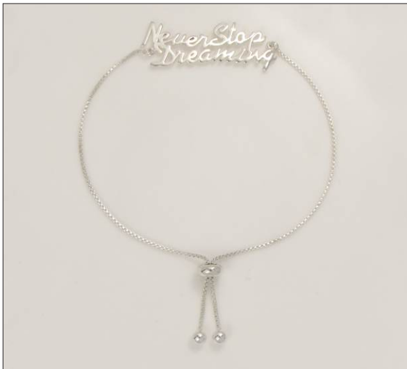
BR107091SL WT: 4.4 gm