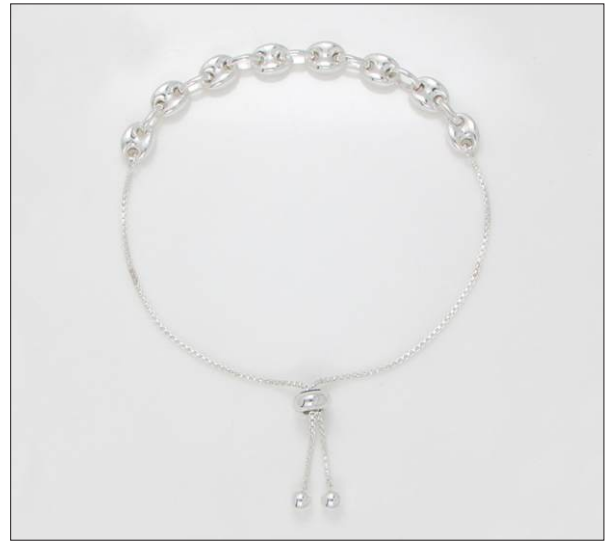
BR107118SL WT: 4.8 gm