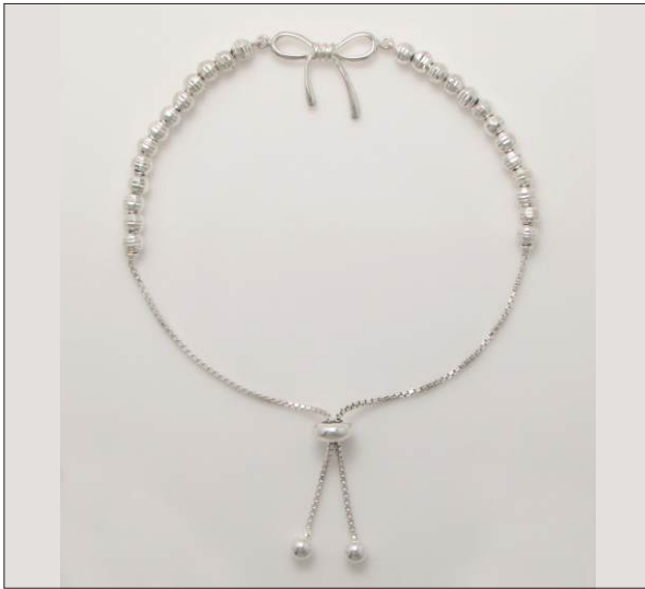
UBR107284DC WT: 4.65 gm