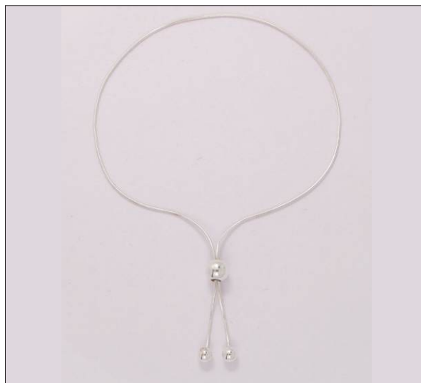
BR107313SL WT: 1.65 gm