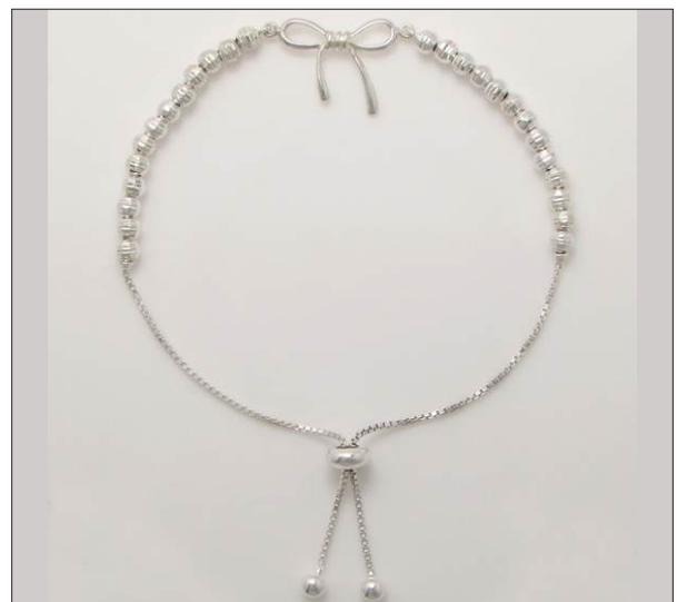
UBR107284DC WT: 4.65 gm