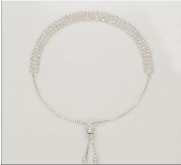
BR107195SL WT: 6.3 gm