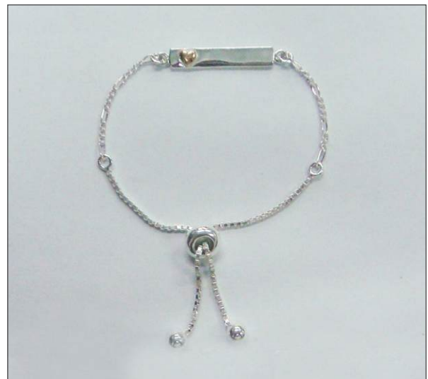
BR1074392T WT: 2.65 gm