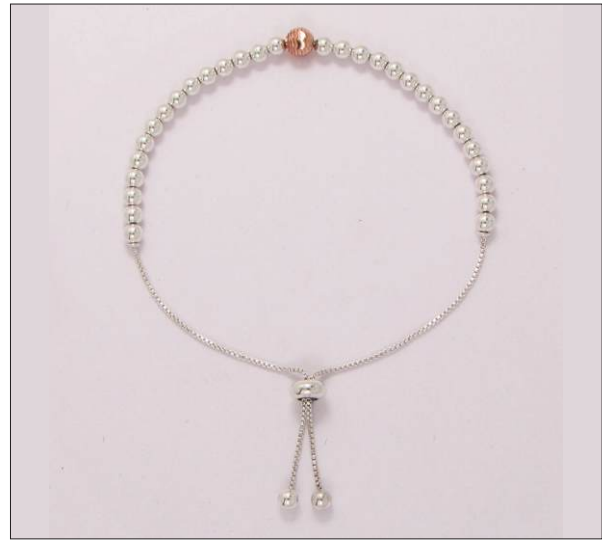
UBR1073213T WT: 5.25 gm