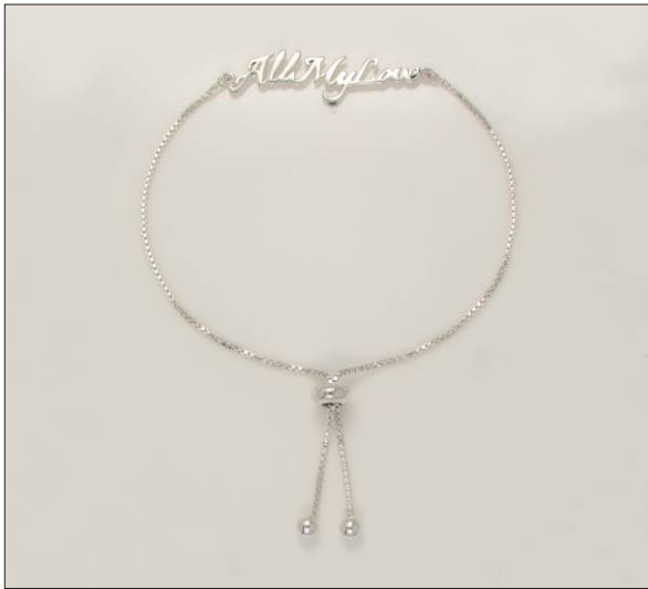
BR107089SL WT: 3.45 gm