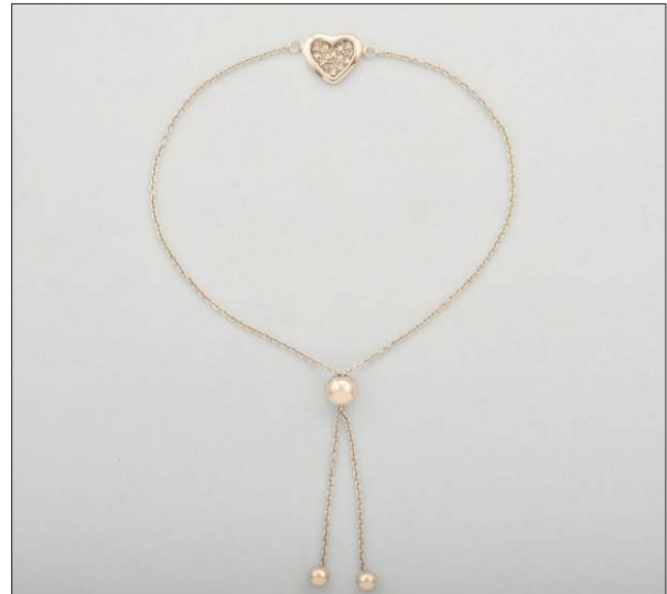
JB108352S7HIG18RH WT: 0.1/2.1 gm