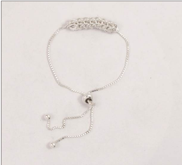
BR107457SL WT: 5.95 gm