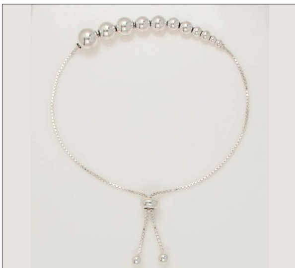
BR107167SL WT: 5.7 gm