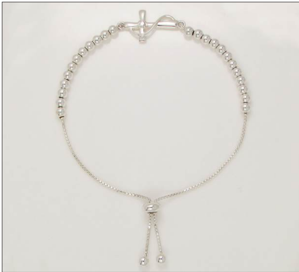
BR108408A18SL WT: 0.08/5.72 gm