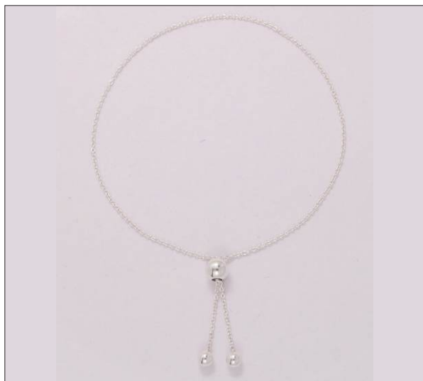
BR107312SL WT: 1.25 gm