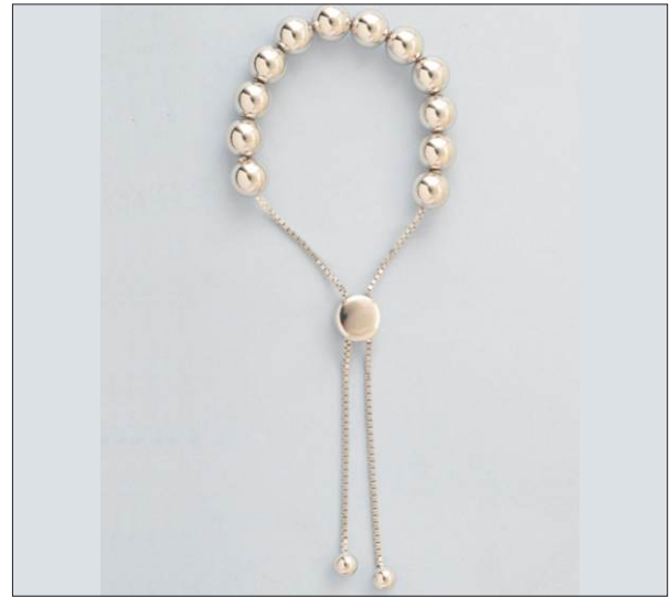
JB106854RH WT: 12.8 gm