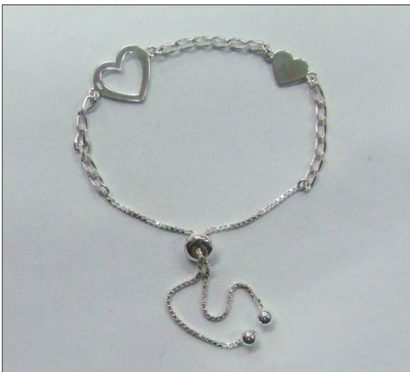
BR107429SL WT: 4.05 gm