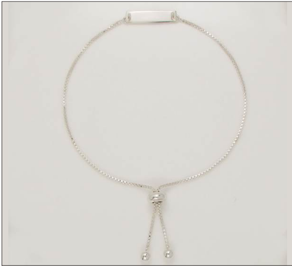
BR107221SL WT: 2.5 gm