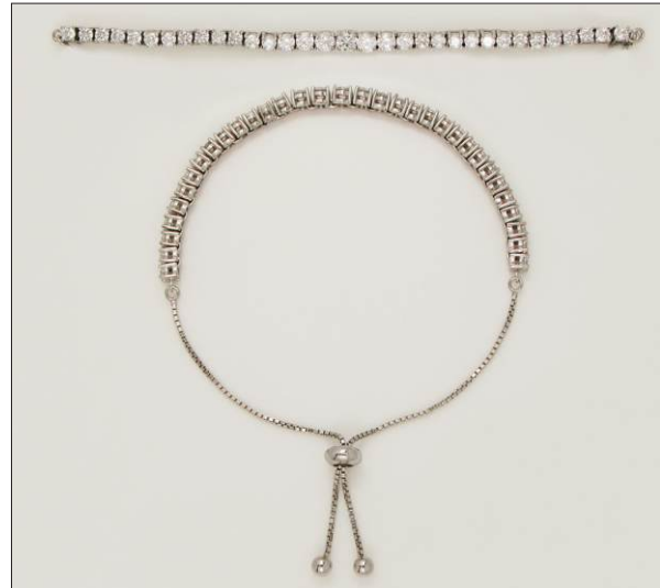
BR108412A18RH WT: 1.3/6.95 gm