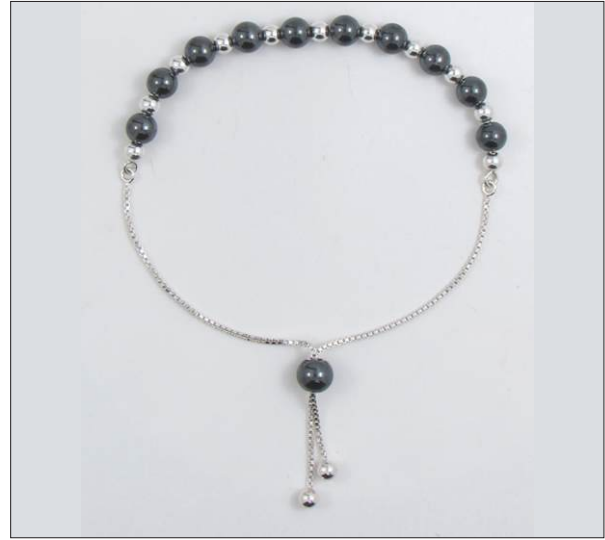
JB1069332T WT: 6.6 gm