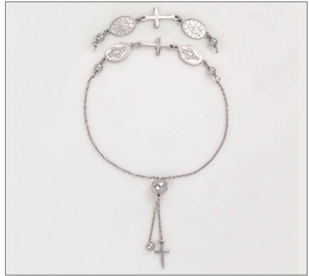
BR107016RH WT: 3.85 gm