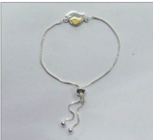
BR1074242T WT: 3.5 gm