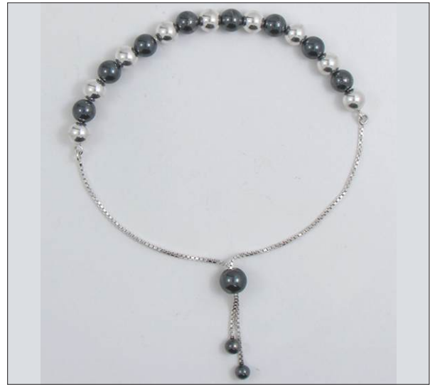
JB1069312T WT: 7.85 gm