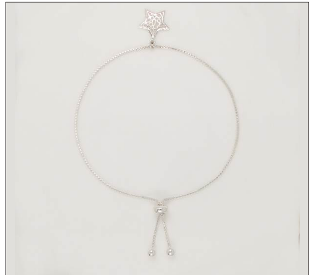
BR107203DC WT: 2.9 gm