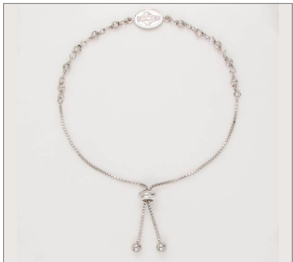
BR1072002T WT: 3.55 gm