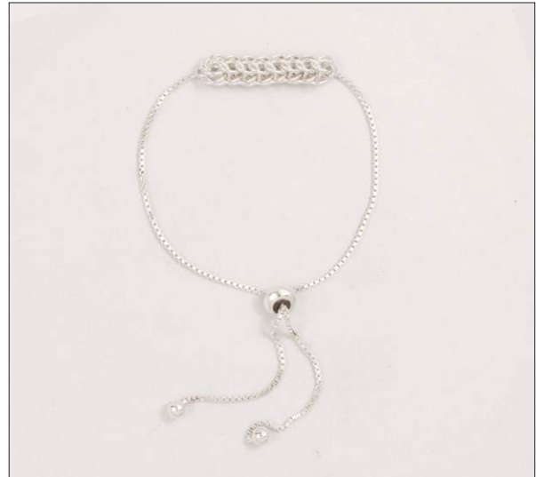
BR107458SL WT: 4.8 gm