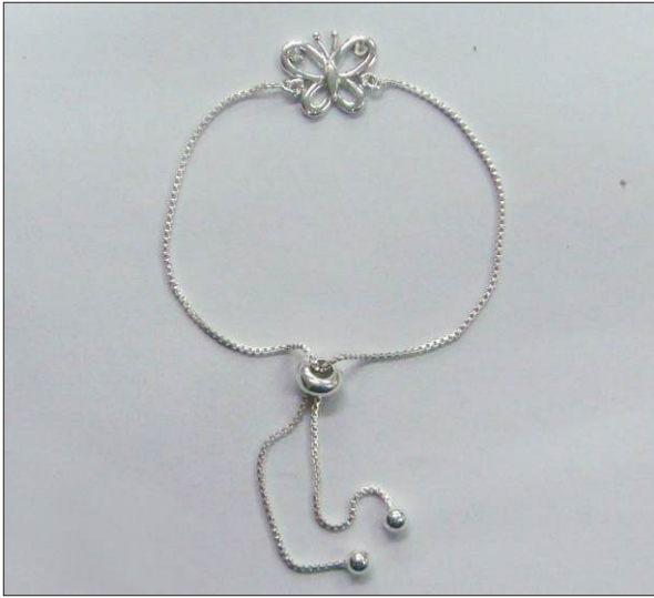
BR107431A18SL WT: 3.35 gm