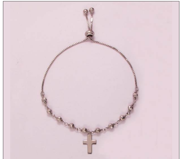
BR1074052T WT: 3.5 gm