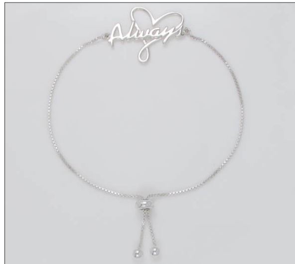
BR107092SL WT: 3.75 gm