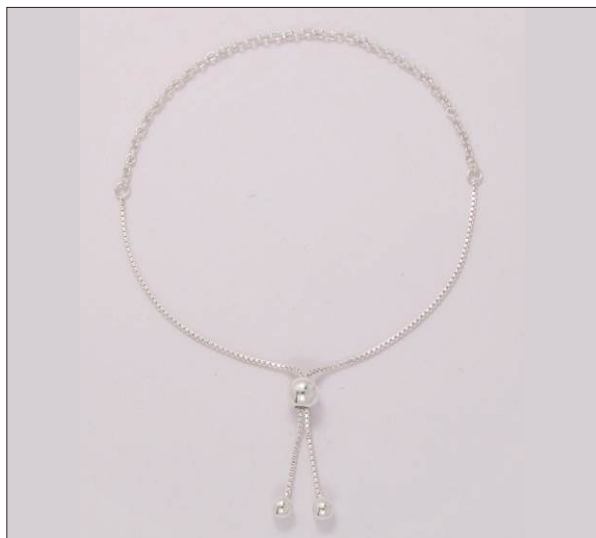
BR107308SL WT: 1.95 gm