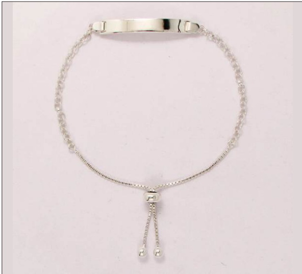
BR107339SL WT: 4.96 gm