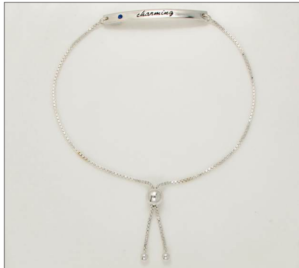
BR107146C22EN WT: 3.25 gm