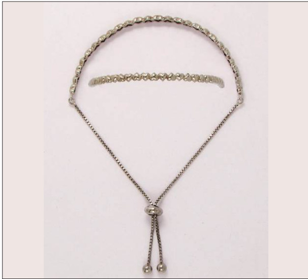
BR107376RH WT: 6.7 gm