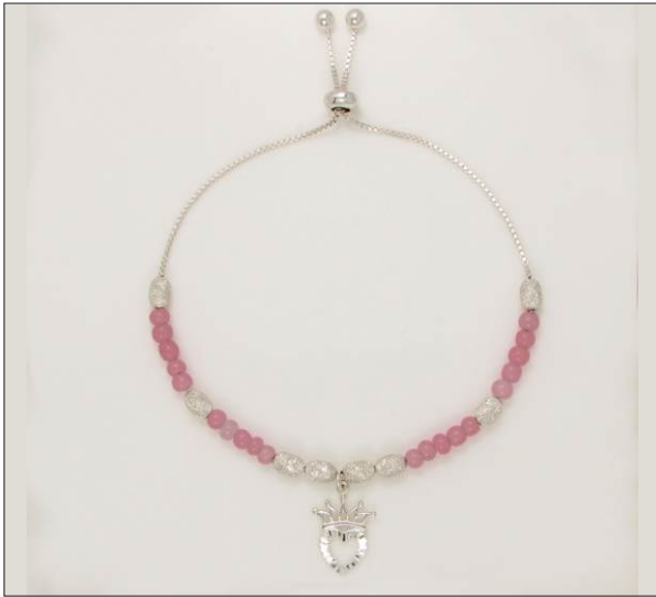
BR108402G123T WT: 1.35/4.45 gm