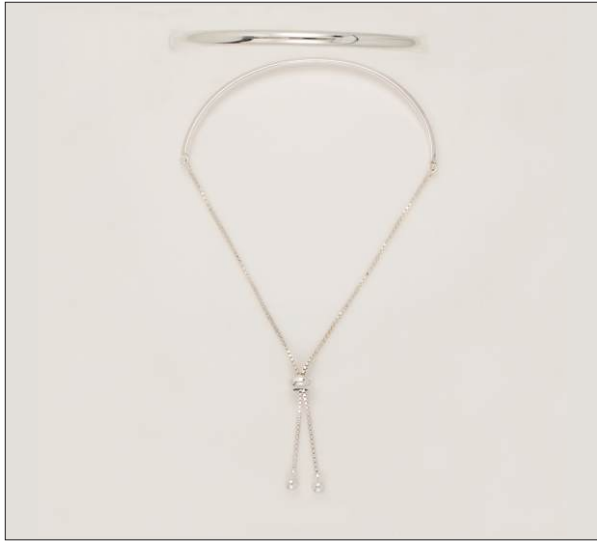
BR107228SL WT: 4.2 gm