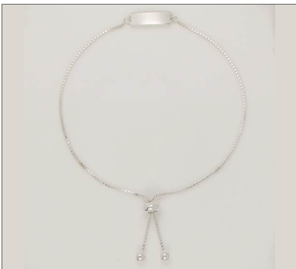
BR107236SL WT: 2.75 gm