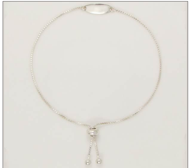
BR107224SL WT: 2.8 gm