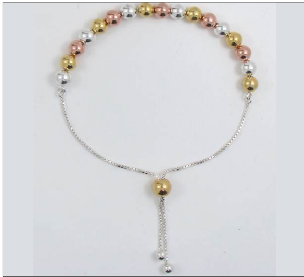
JB1069253T WT: 7.8 gm