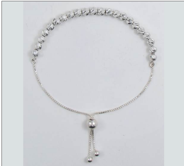
JB1069362T WT: 5.6 gm