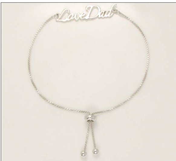
BR107087SL WT: 3.25 gm