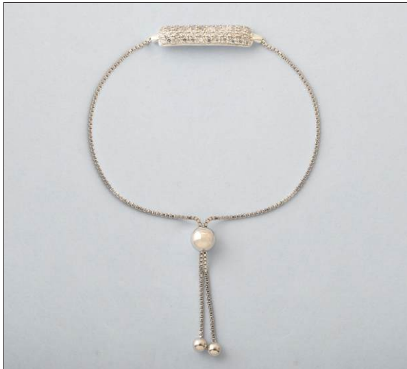
JB108357A18RH WT: 0.32/4.03 gm