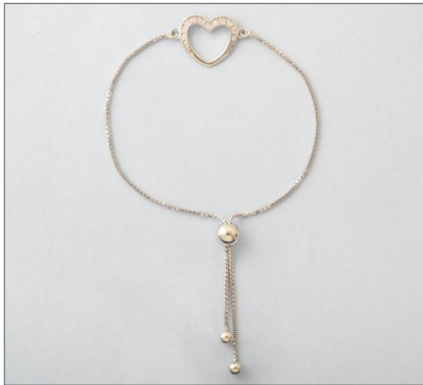
JB108358A18RH WT: 0.07/3.28 gm