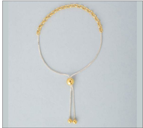
JB1068582T WT: 3 gm