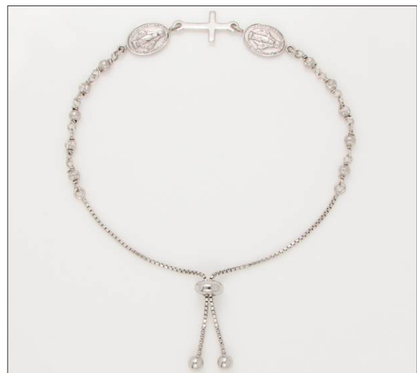
BR1071842T WT: 4.6 gm