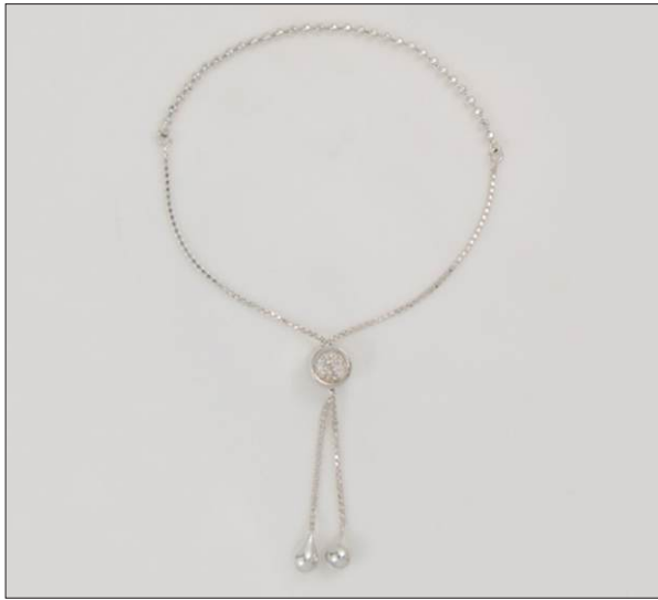
BR108381A18SL WT: 3.85 gm