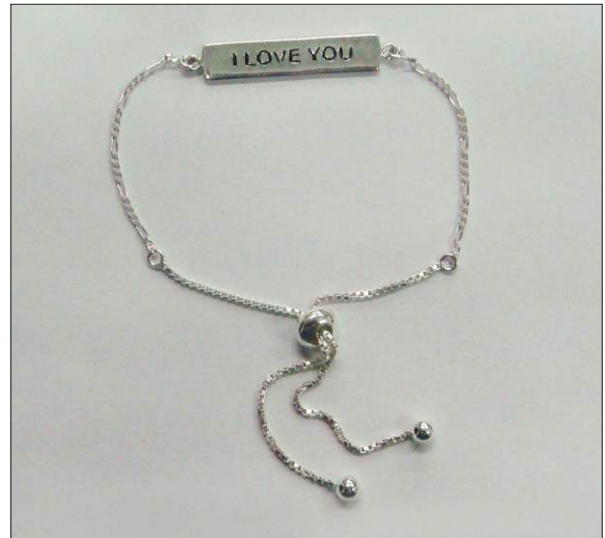
BR107444EN WT: 3.85 gm