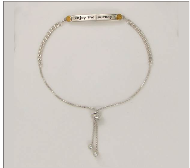
BR1070693T WT: 4.7 gm