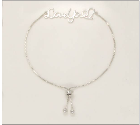
BR107084SL WT: 3.7 gm