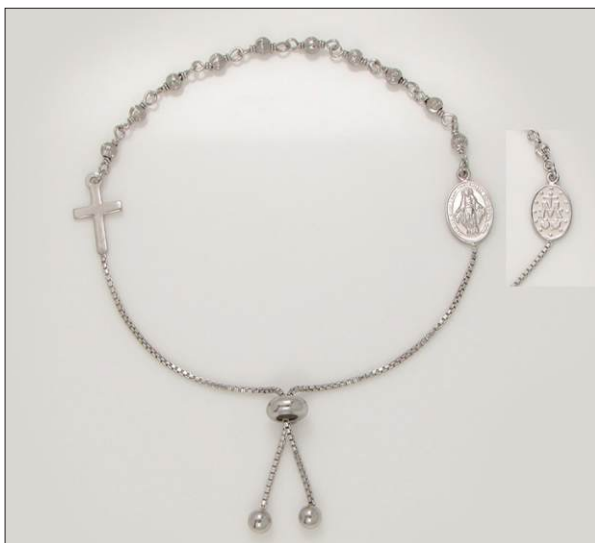
BR107201DC WT: 3.95 gm