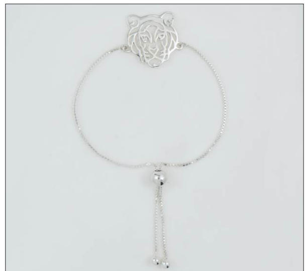
JB106947SL WT: 3.65 gm