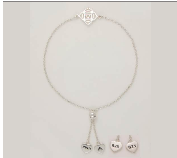
BR107303EN WT: 3 gm