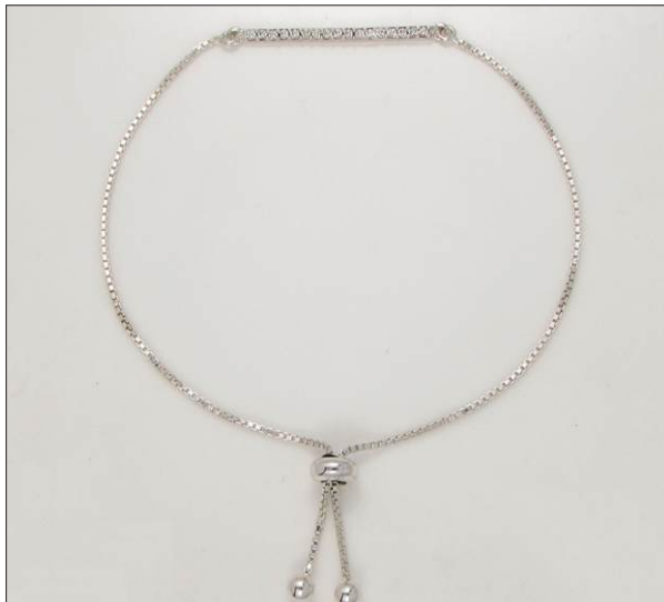
BR107131A18SL WT: 0.15/2.8 gm