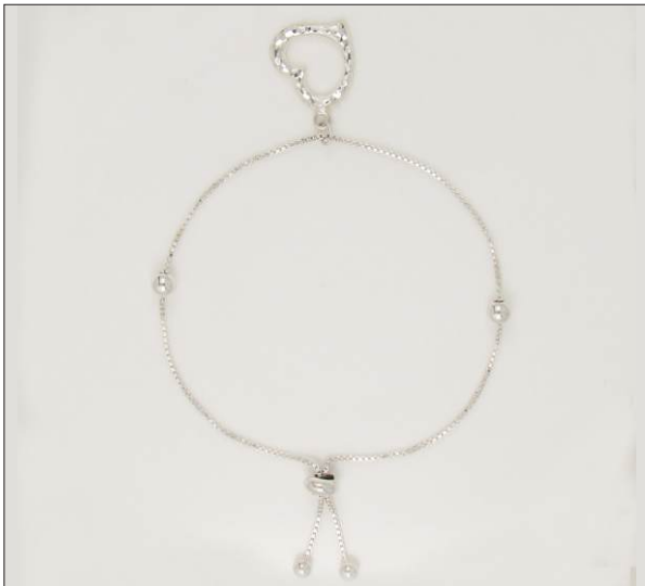
BR107196DC WT: 4.55 gm