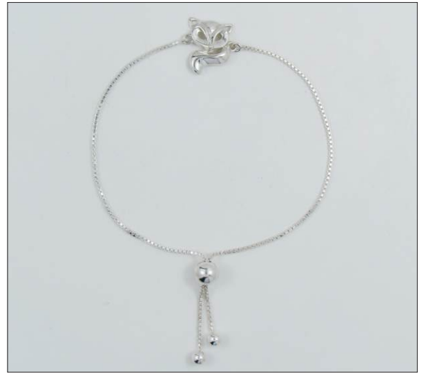
JB106955SL WT: 4.1 gm