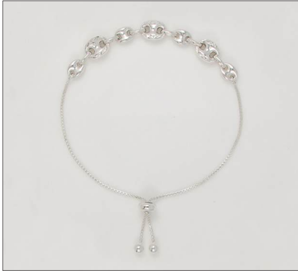
BR107122DC WT: 5.1 gm