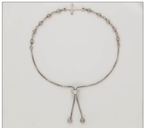
BR107181RH WT: 3.25 gm