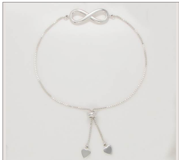
BR107175SL WT: 3.9 gm