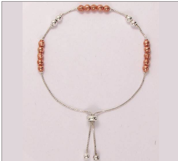
UBR1073233T WT: 3.95 gm