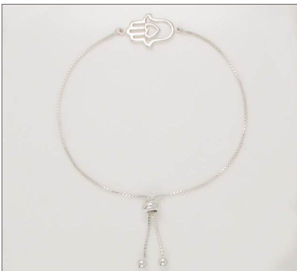
BR107193SL WT: 3.05 gm