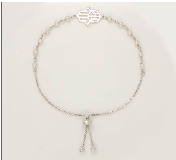
UBR108405NPSL WT: 3.5 gm