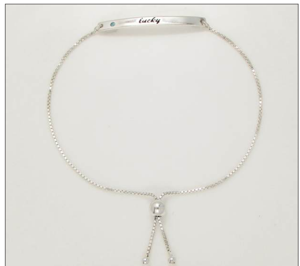
BR107149C16EN WT: 3.2 gm