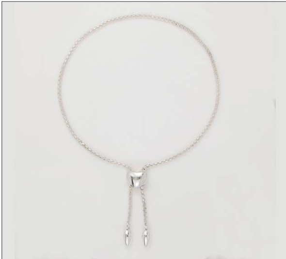
BR107280SL WT: 6.95 gm