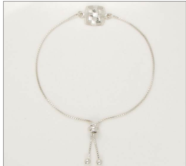
BR107213DC WT: 3.85 gm