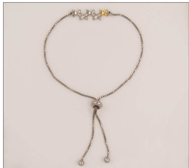
BR1074172T WT: 3.4 gm