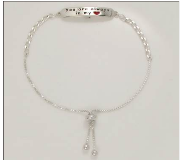
BR107077EN WT: 4.7 gm