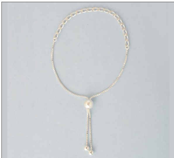
JB106855SL WT: 2.95 gm