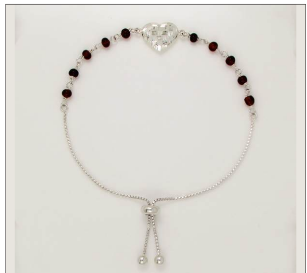
BR108401G4SL WT: 3.65 gm