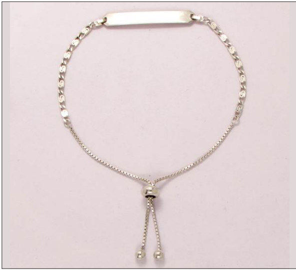
BR107332SL WT: 4.01 gm