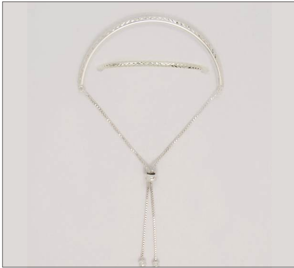
AFBR5169DC WT: 3.65 gm