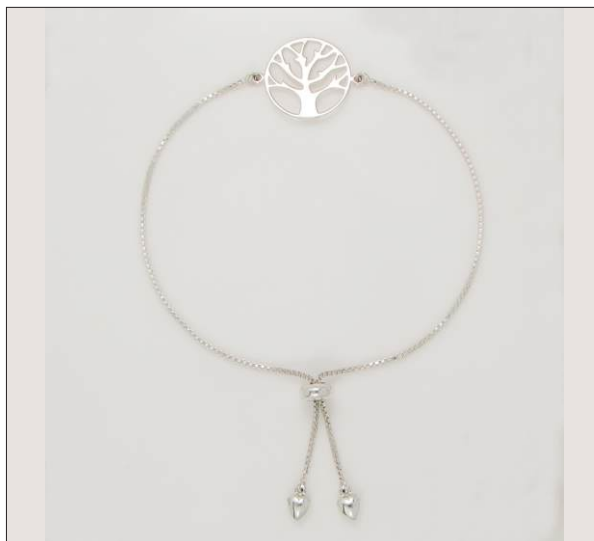
BR107174SL WT: 3.3 gm