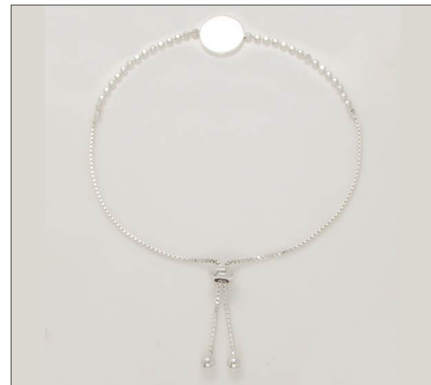
BR107295SL WT: 3.95 gm