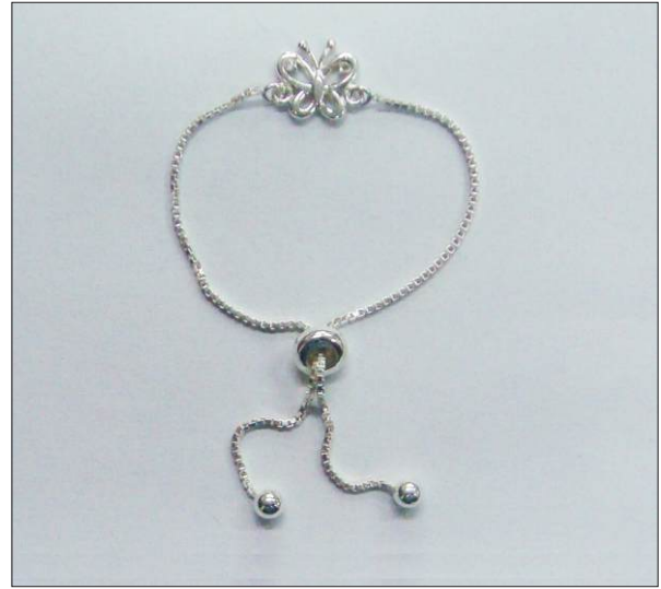
BR107432A18SL WT: 2.55 gm