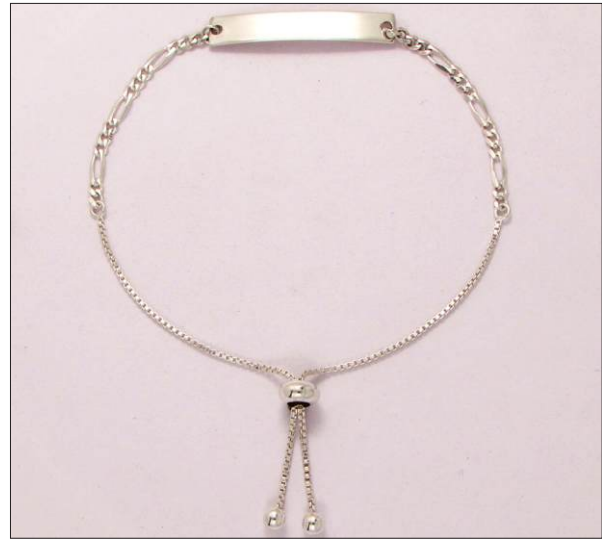
BR107333SL WT: 3.80 gm