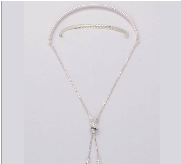
AFBR5172SL WT: 4.3 gm