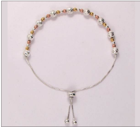
UBR107322MF WT: 5.7 gm