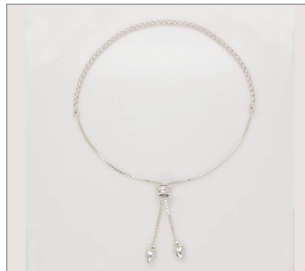
BR107173SL WT: 4 gm