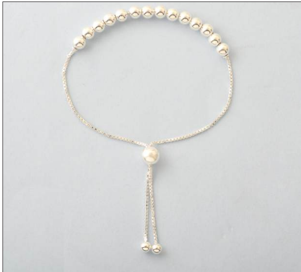
JB106863SL WT: 3.85 gm