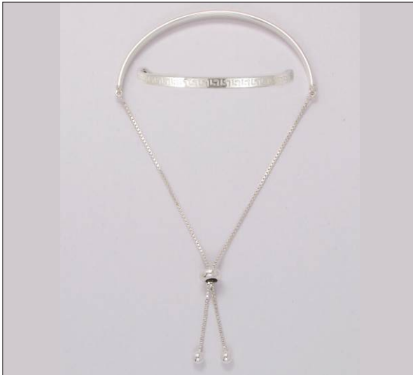
AFBR5171SL WT: 4.9 gm