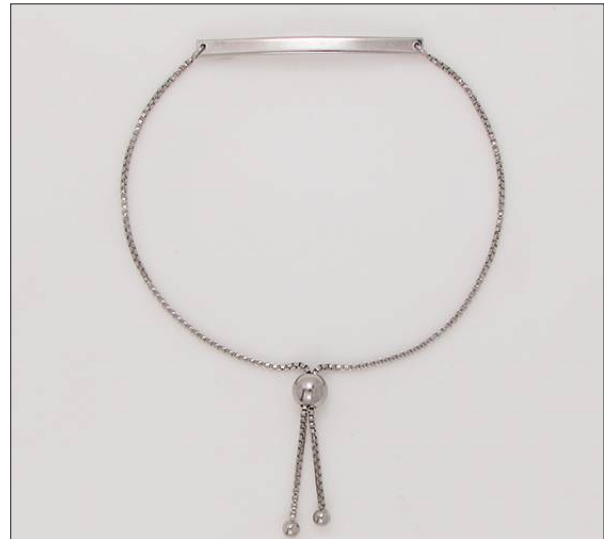
BR107047RH WT: 2.65 gm