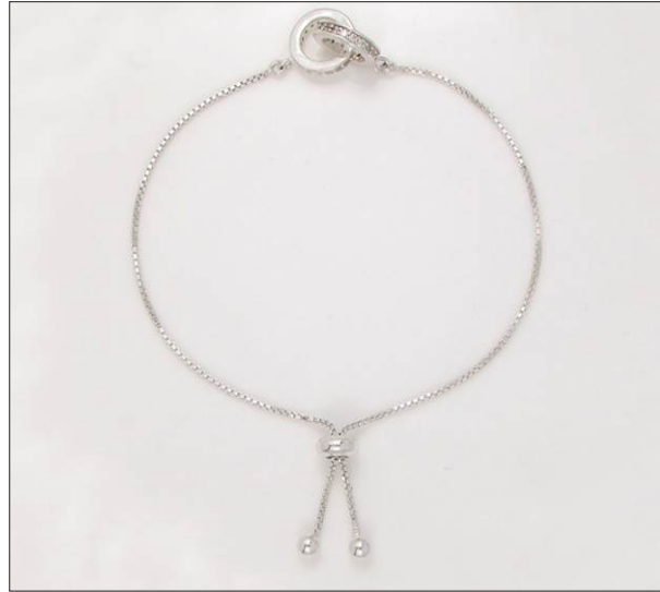
BR107130A18SL WT: 0.27/4.58 gm