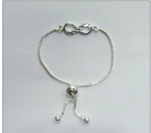
BR1074362T WT: 2.4 gm