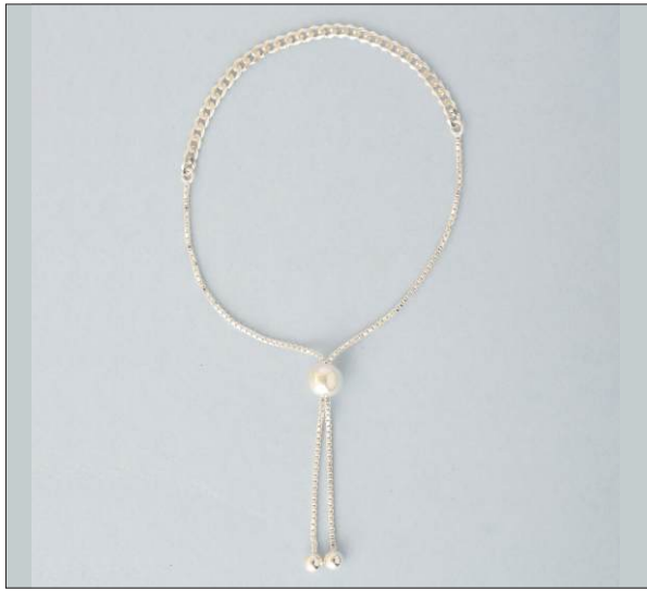
JB106856SL WT: 3 gm