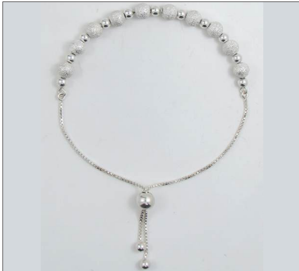
JB1069262T WT: 6.7 gm