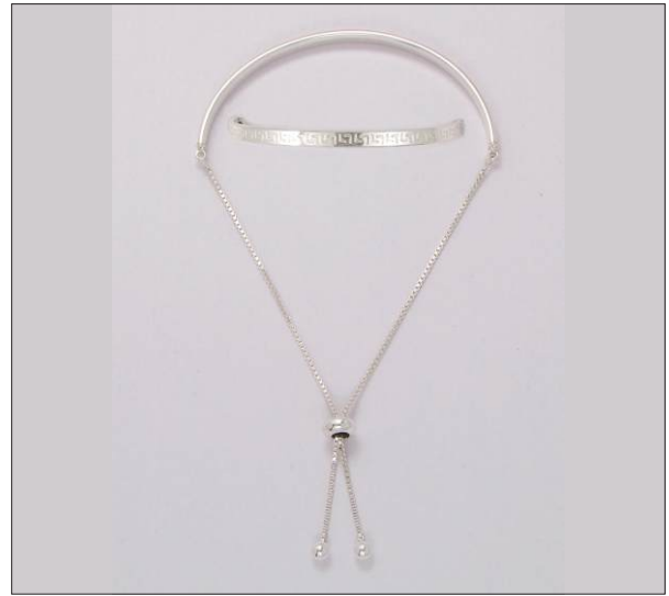
AFBR5171SL WT: 4.9 gm