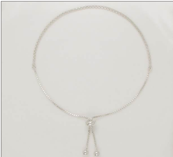
BR107191SL WT: 3.25 gm