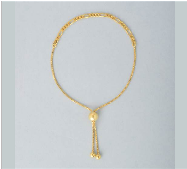
JB106860FG WT: 3.05 gm