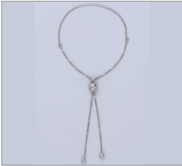
JB106921RH WT: 2.55 gm