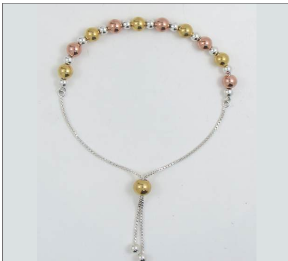
JB1069423T WT: 6.5 gm