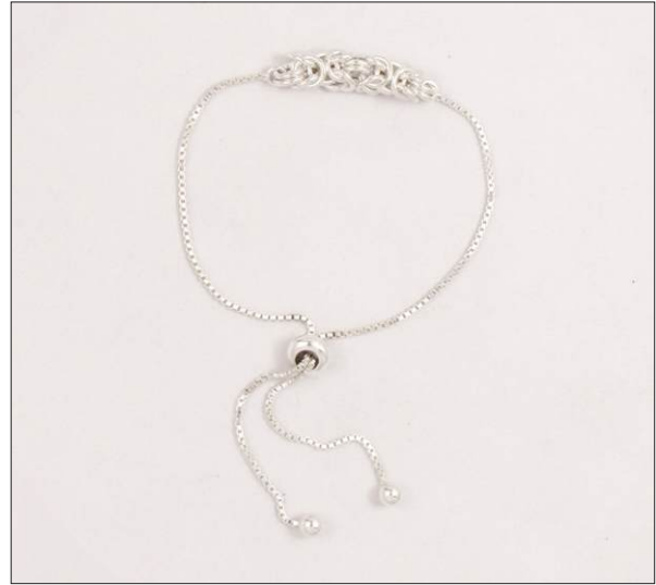
BR107456SL WT: 5.15 gm