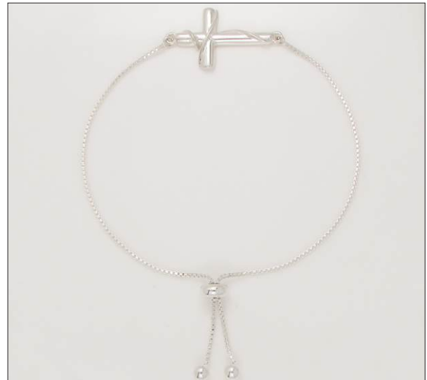
BR107192SL WT: 4.15 gm