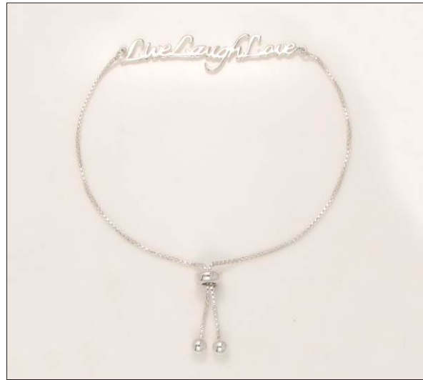
BR107090SL WT: 3.5 gm