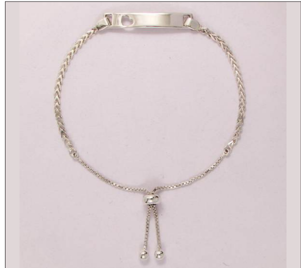
BR107340SL WT: 5.03 gm