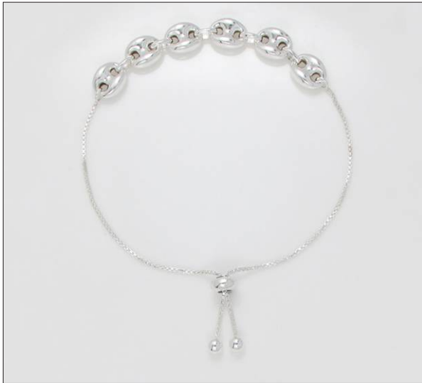
BR107119SL WT: 5.55 gm