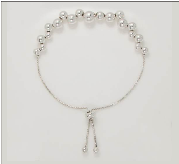
BR107285SL WT: 9.4 gm