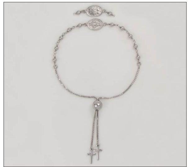
BR107019RH WT: 3.8 gm