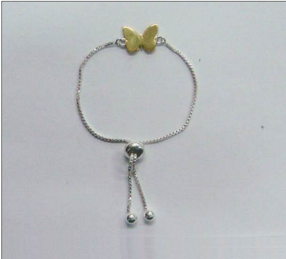
BR1074342T WT: 2.55 gm