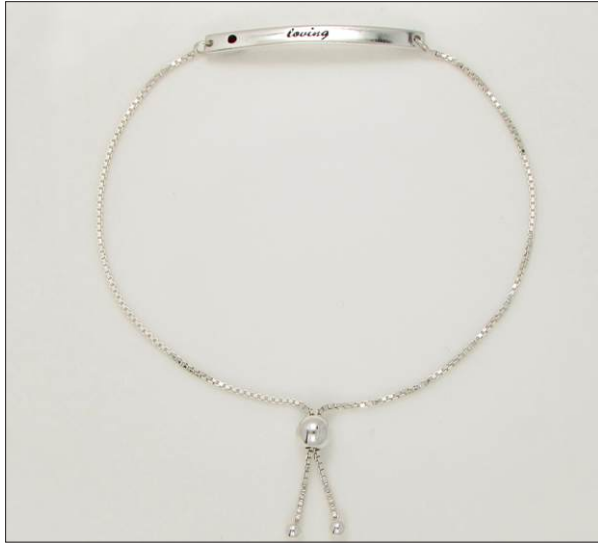
BR107144C40EN WT: 3.25 gm