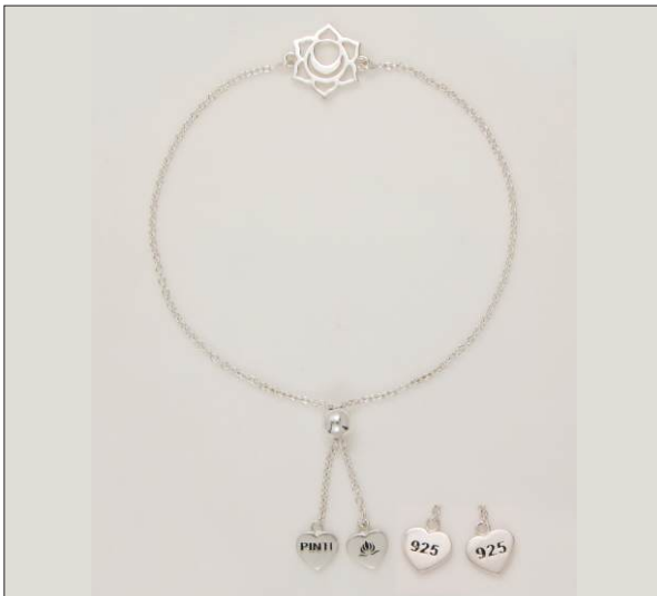
BR107302EN WT: 3.1 gm