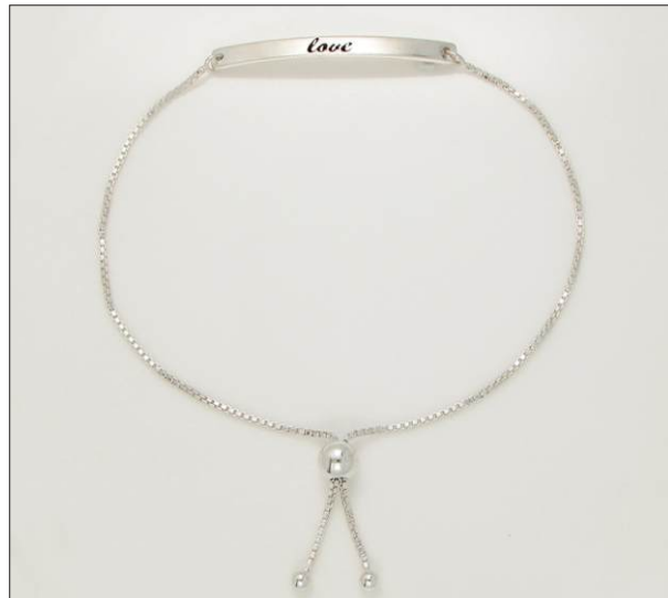
BR107141EN WT: 3.35 gm