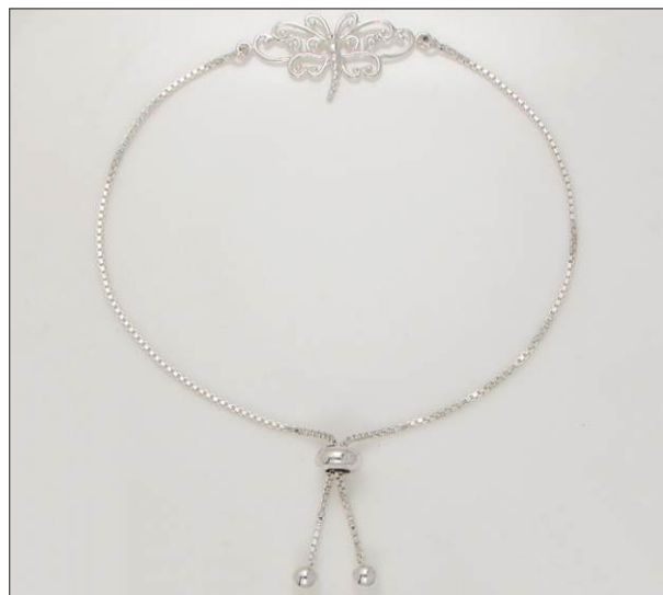
BR107134SL WT: 0.05/2.95 gm