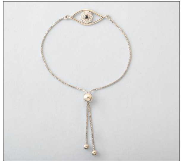
JB108359M1RH WT: 0.2/3.4 gm