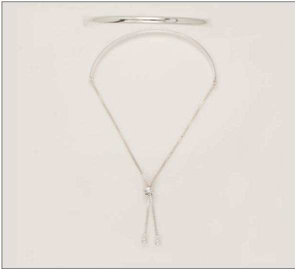
BR107228SL WT: 4.2 gm