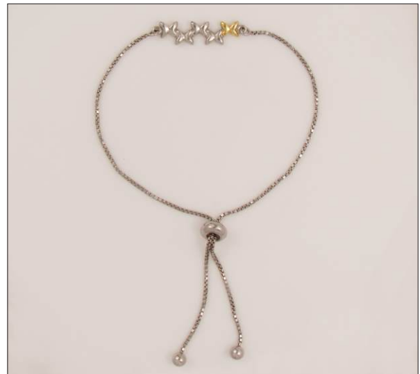
BR1074172T WT: 3.4 gm