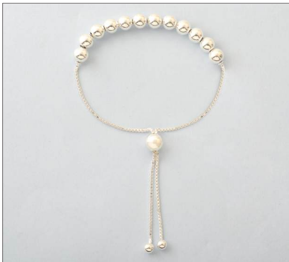
JB106862SL WT: 4.6 gm