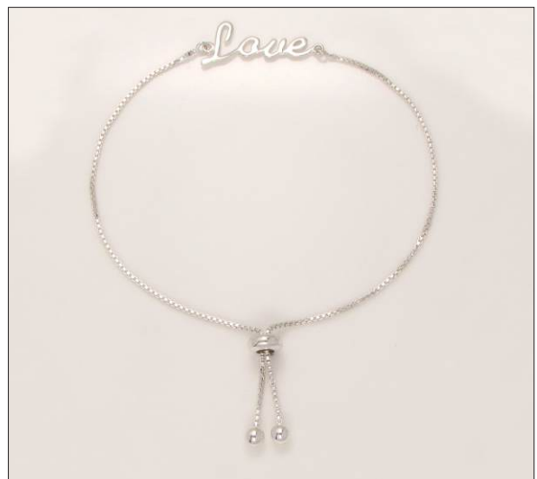
BR107088SL WT: 2.9 gm