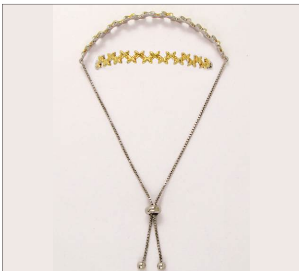
BR1073802T WT: 7.05 gm