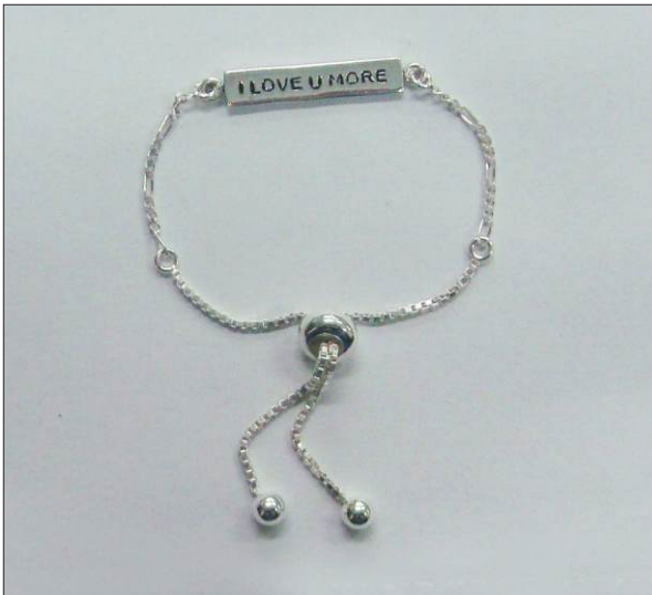
BR107443EN WT: 2.7 gm