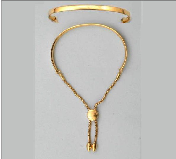
JB106737FG WT: 13.9 gm