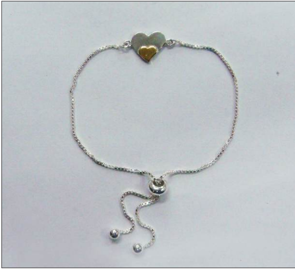
BR1074262T WT: 3.25 gm