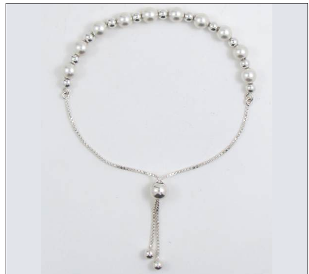
JB106939NPSL WT: 5.85 gm