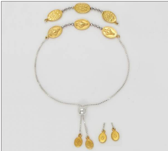
BR1069822T WT: 4.5 gm