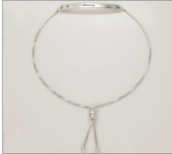
BR107144C45EN WT: 3.3 gm