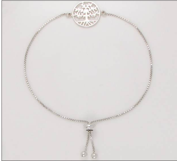
BR107136SL WT: 0.05/3.4 gm