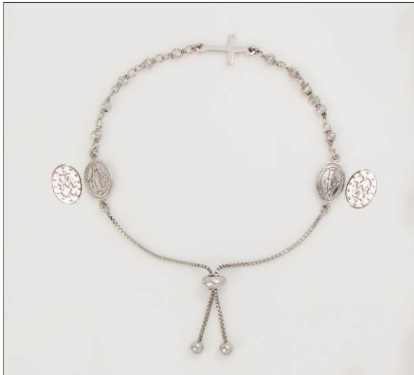
BR1071872T WT: 4.55 gm