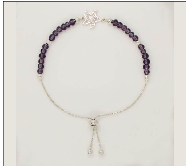
BR108399G5SL WT: 1.73/3.17 gm