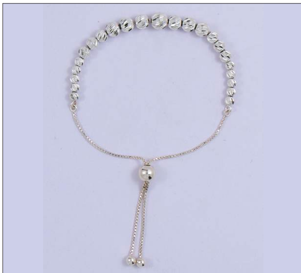
JB1069282T WT: 5.9 gm