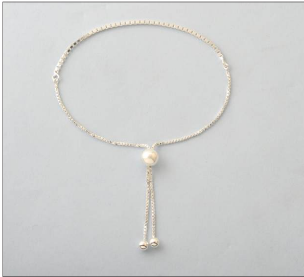
JB106867SL WT: 2.7 gm