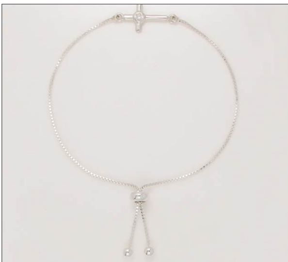
BR108397A18SL WT: 0.09/3.01 gm