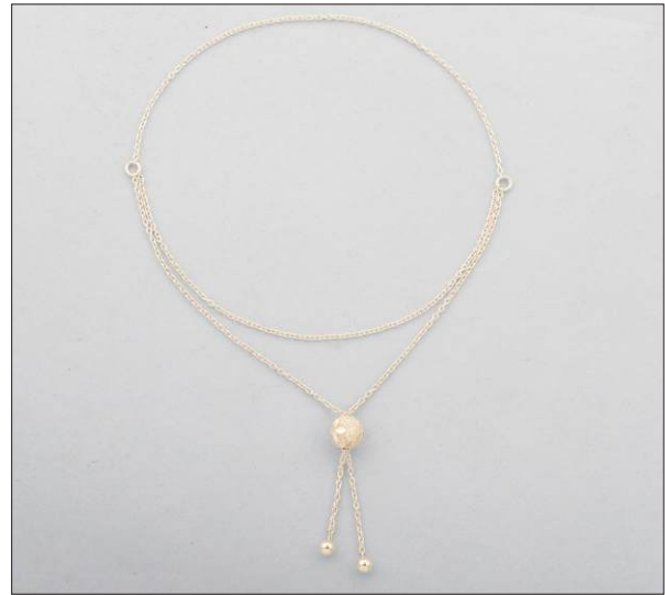
JB1068363T WT: 1.5 gm