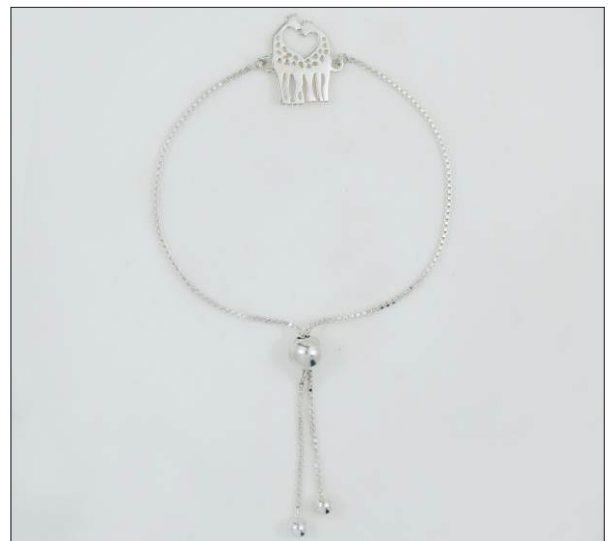
JB106946SL WT: 3.1 gm