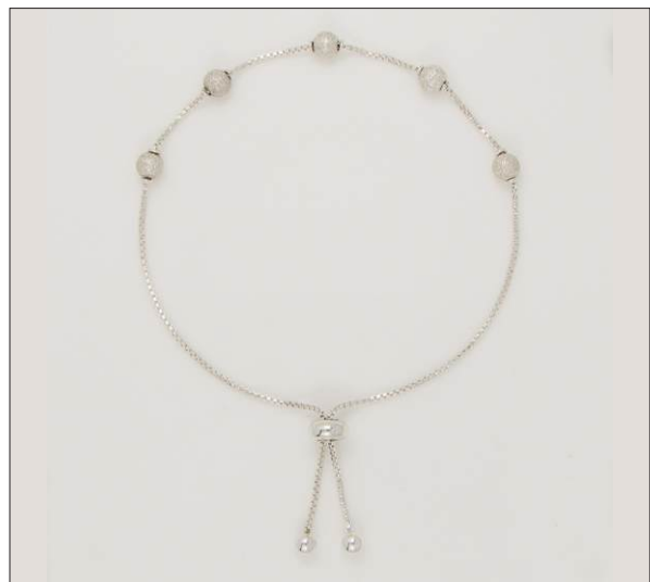
UBR1072172T WT: 3.35 gm