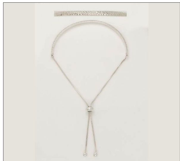
BR107228DC WT: 3.95 gm