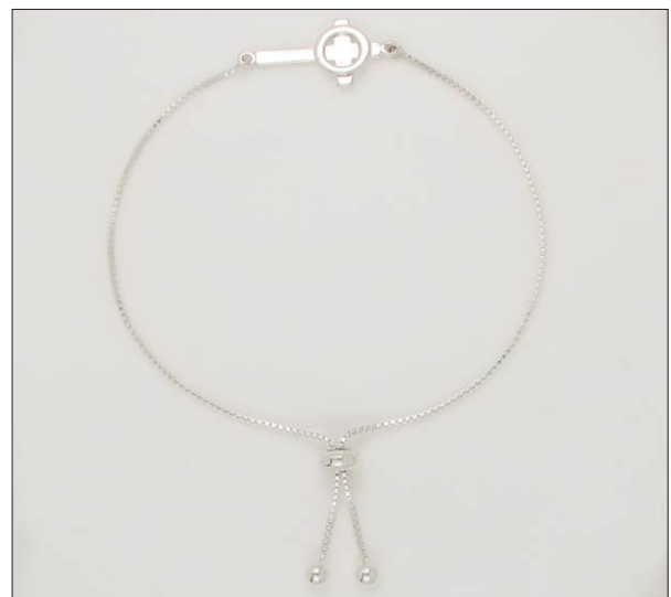
BR107194SL WT: 3.3 gm