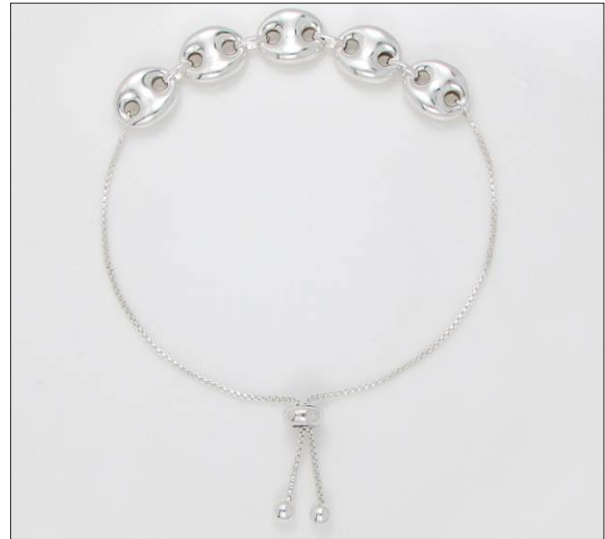
BR107120SL WT: 5.9 gm