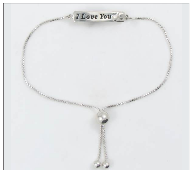
JB106896EN WT: 3.4 gm