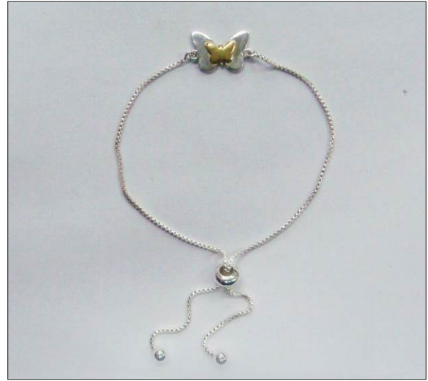
BR1074332T WT: 3.15 gm