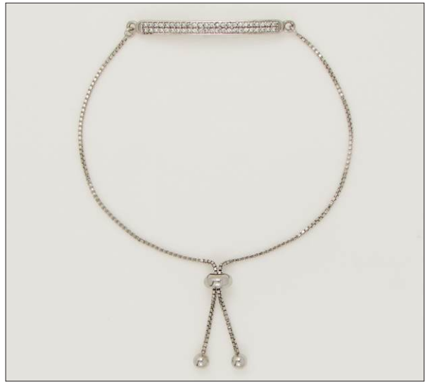
BR108410A18RH WT: 0.1/4 gm