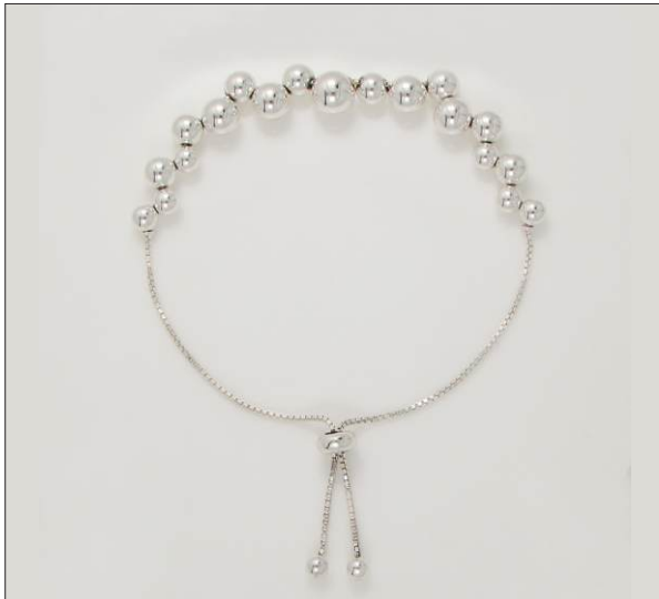
BR107285SL WT: 9.4 gm