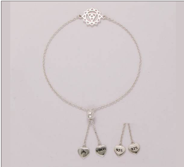
BR107306EN WT: 3.05 gm