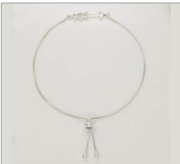
BR107241SL WT: 2.95 gm