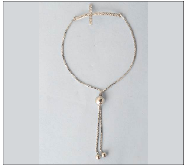
JB108355A18RH WT: 0.33/3.27 gm