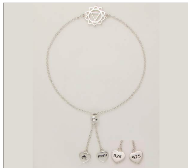
BR107305EN WT: 3.3 gm