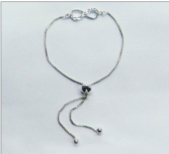
BR107445DC WT: 3.05 gm