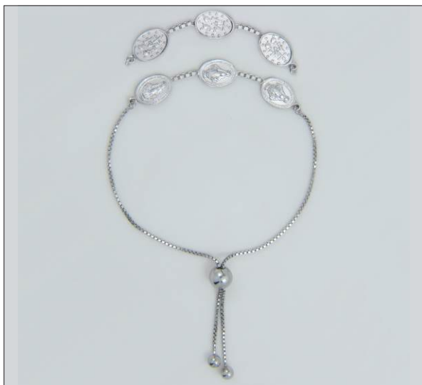
JB106975RH WT: 4.2 gm