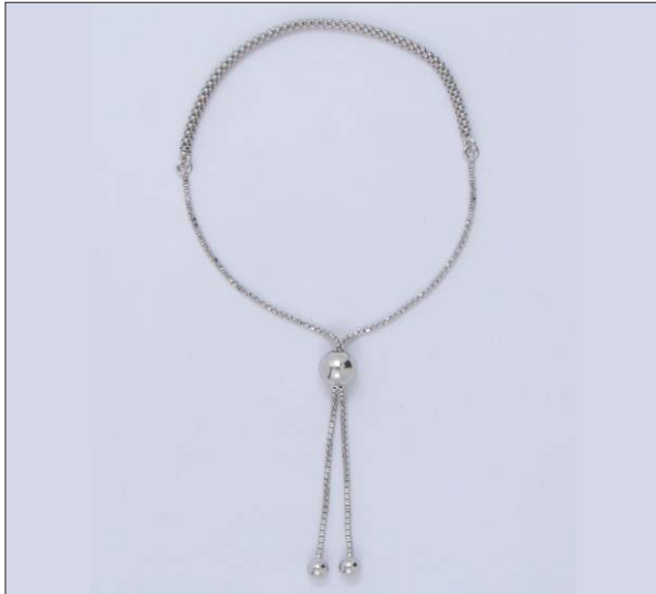
JB106919RH WT: 2.8 gm