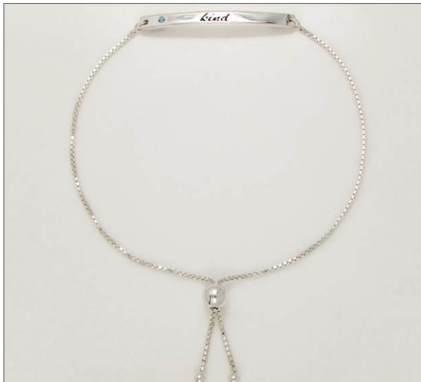
BR107145C16EN WT: 3.25 gm