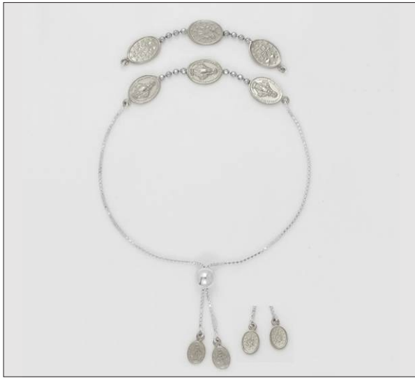
BR106982RH WT: 4.5 gm