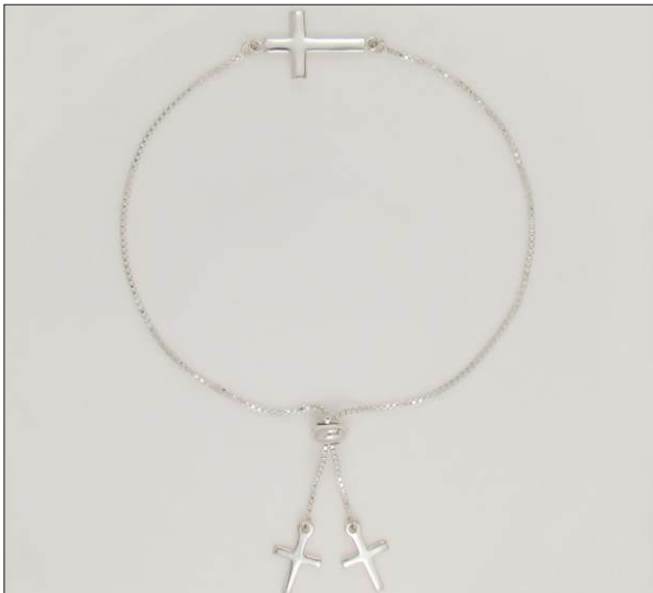
BR107198SL WT: 3.55 gm