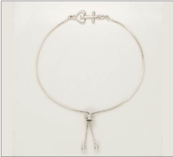
BR107205SL WT: 2.9 gm