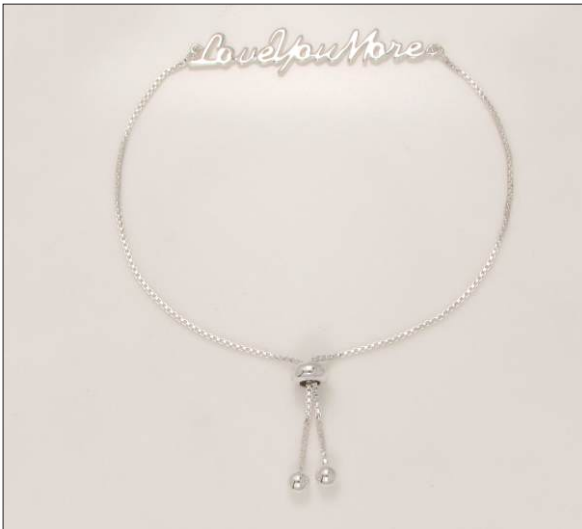
BR107085SL WT: 3.45 gm