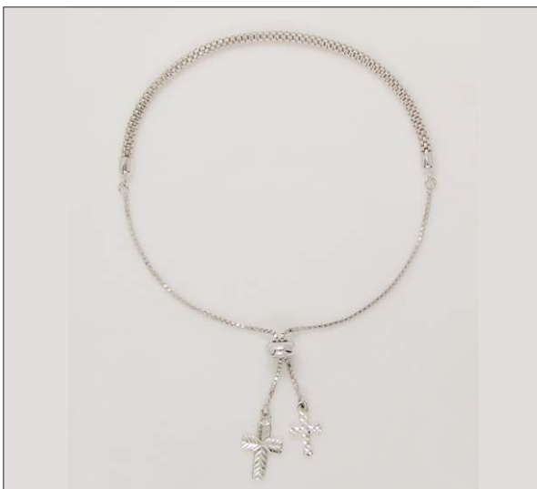
BR107283DC WT: 4.6 gm