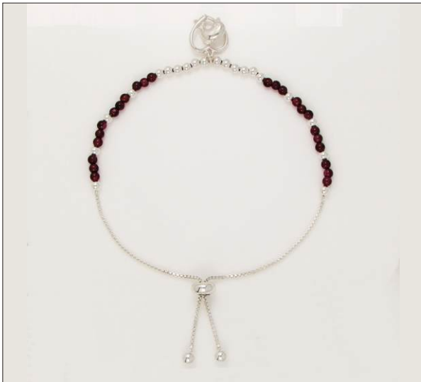
BR107207A4SL WT: 1.13/4.02 gm