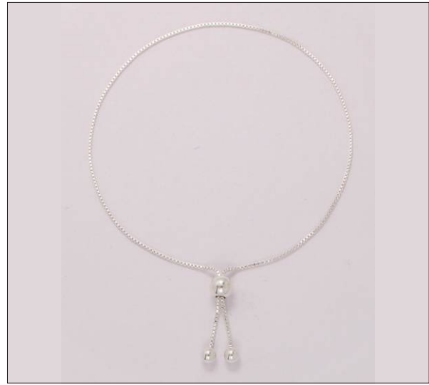
BR107315SL WT: 1.55 gm