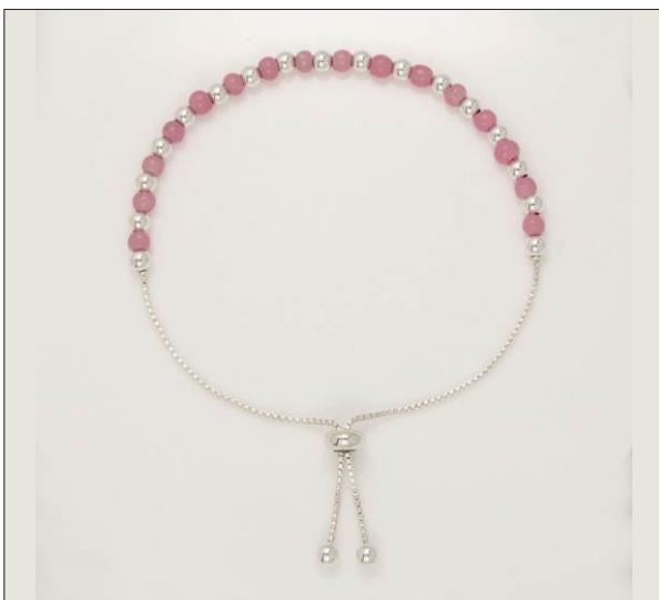
BR108400G12SL WT: 1.09/3.61 gm