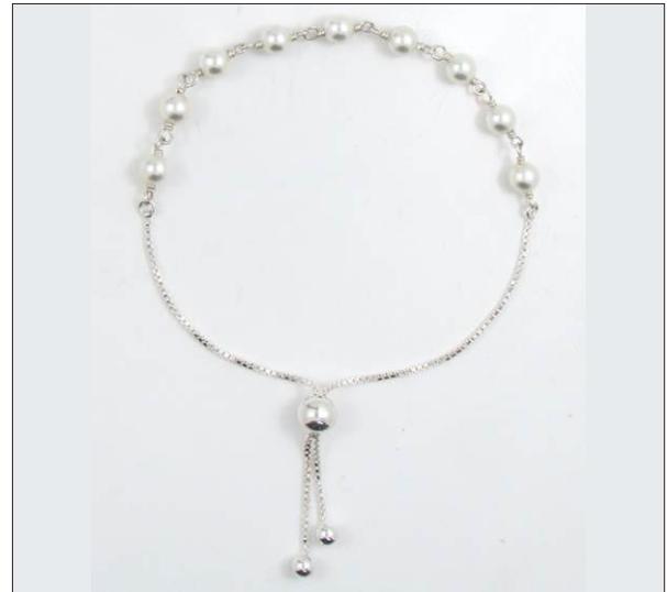
JB106940NPSL WT: 4.2 gm