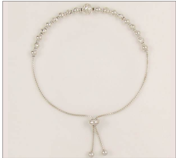
UBR107212DC WT: 4.85 gm