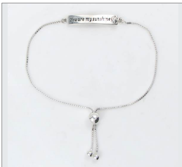
JB106898EN WT: 3.35 gm