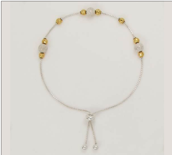
UBR107218MF WT: 4.15 gm