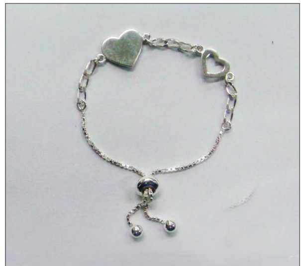
BR107430SL WT: 3.45 gm