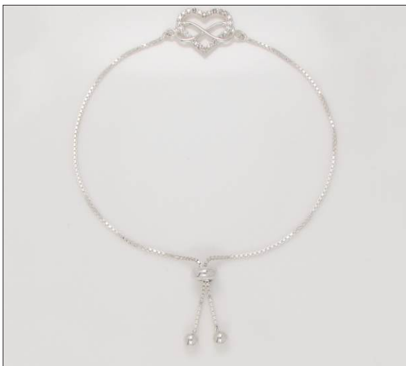
BR107137SL WT: 0.19/3.46 gm