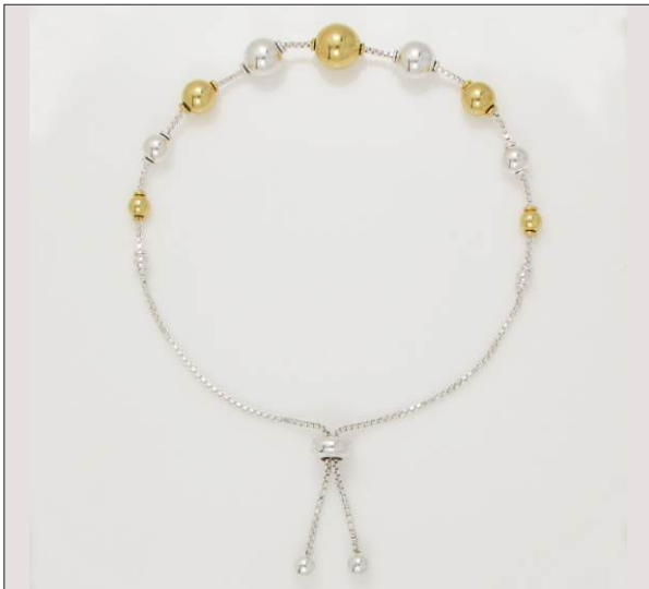
BR1071722T WT: 6.05 gm