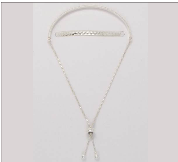
AFBR5175SL WT: 4.1 gm