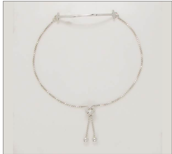
BR107238SL WT: 2.95 gm