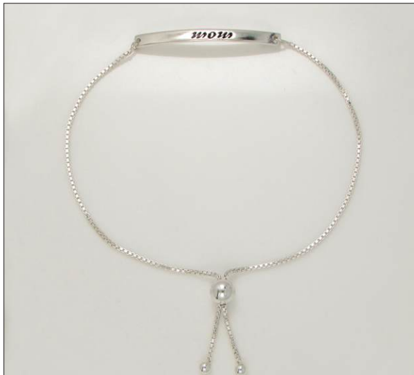
BR107140EN WT: 3.1 gm