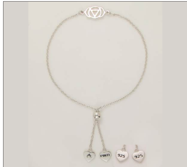
BR107301EN WT: 2.95 gm