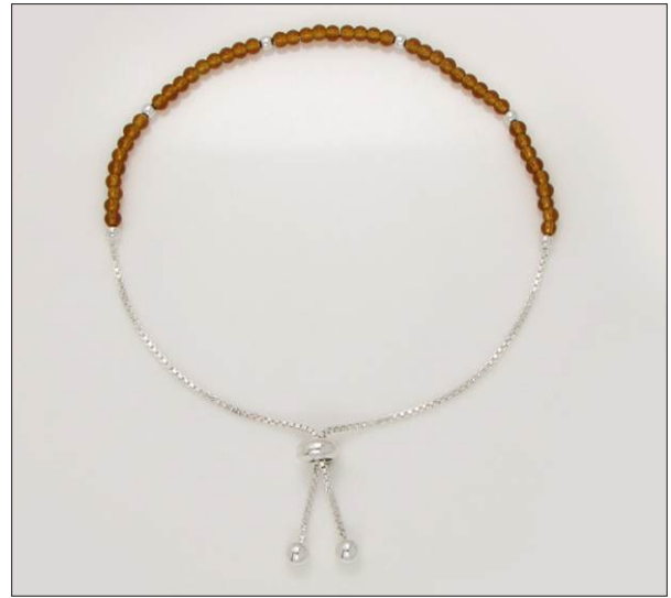
BR108398G10SL WT: 3 gm