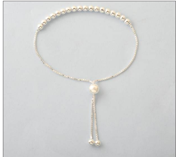
JB106864SL WT: 3.35 gm