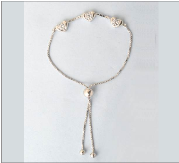
JB108356A18RH WT: 0.42/4.48 gm