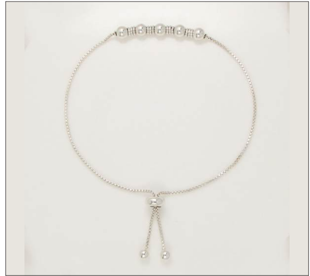
BR107206SL WT: 3.85 gm