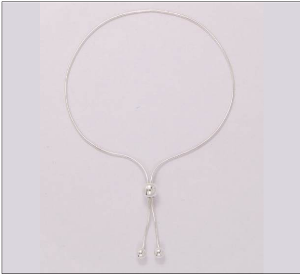
BR107314SL WT: 2.15 gm