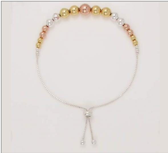
UBR1072193T WT: 8.05 gm