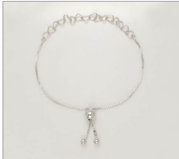
BR107138SL WT: 2.75 gm