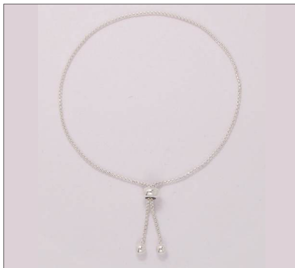
BR107311SL WT: 2.5 gm