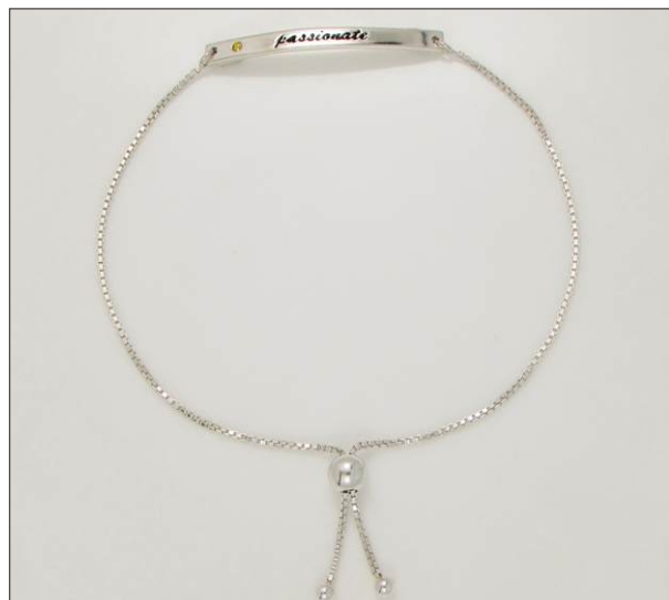
BR107148C39EN WT: 3.2 gm