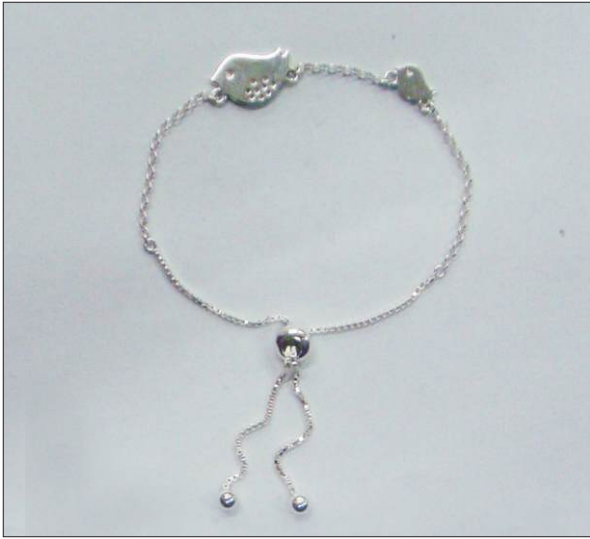
BR107422SL WT: 3.35 gm