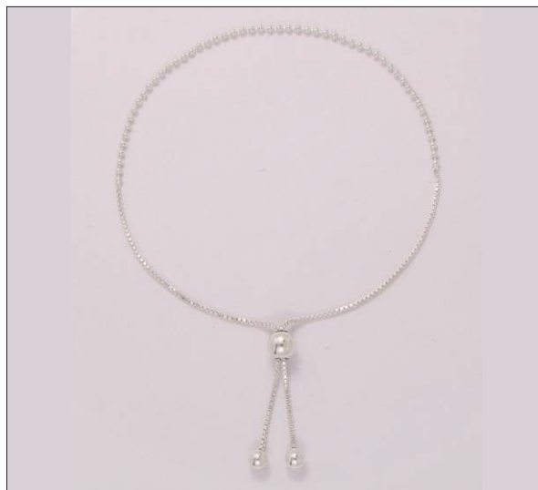
BR107309SL WT: 1.87 gm