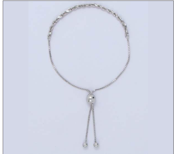
JB106918RH WT: 3.45 gm