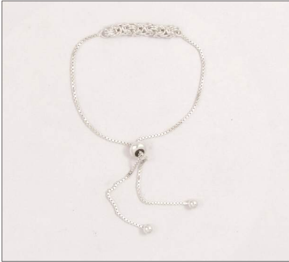
BR107455SL WT: 4.35 gm