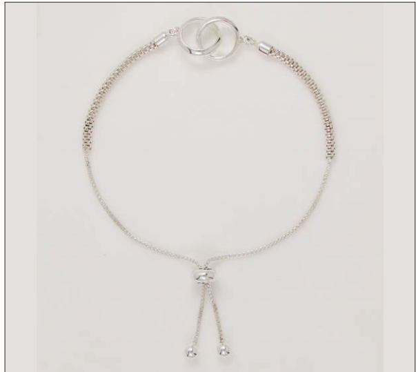
BR107282SL WT: 6 gm