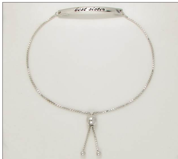
BR107143EN WT: 3.2 gm