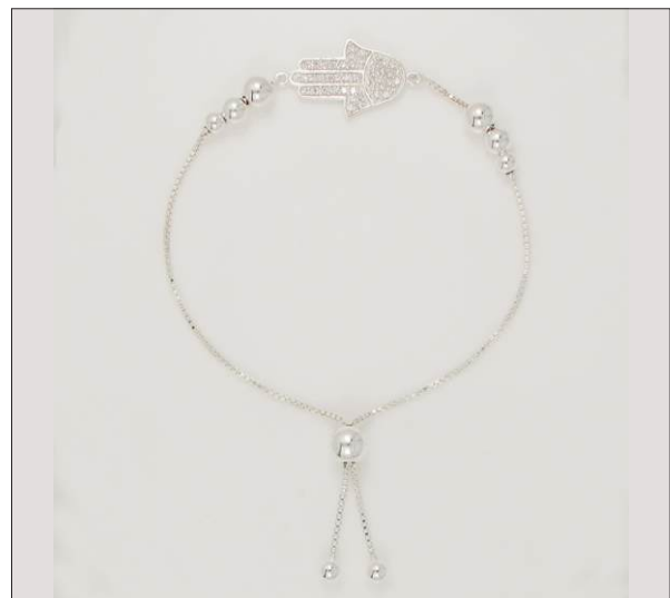
BR108396A18SL WT: 0.31/5.29 gm