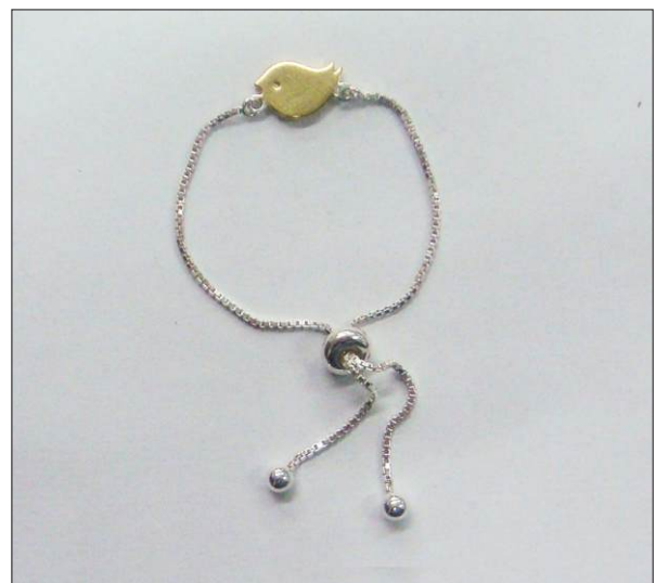
BR1074252T WT: 2.55 gm