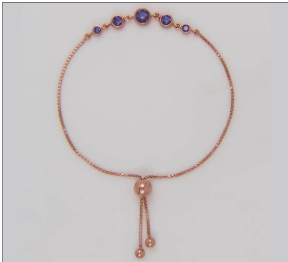
BR108378A47RG WT: 0.18/3.82 gm