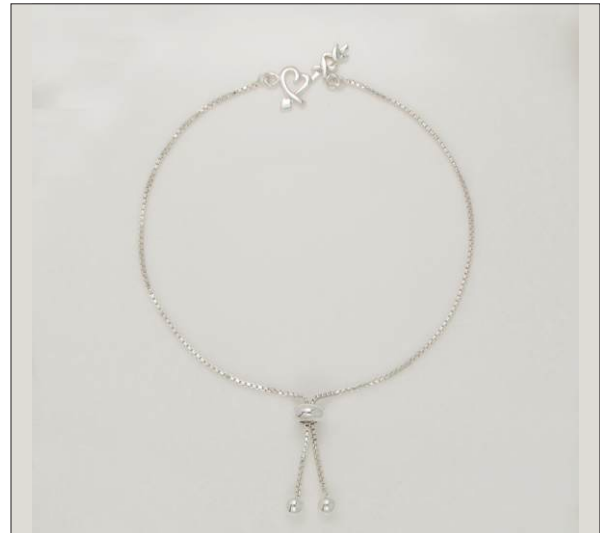
BR107240SL WT: 2.95 gm