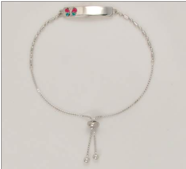
BR107076EN WT: 4.8 gm