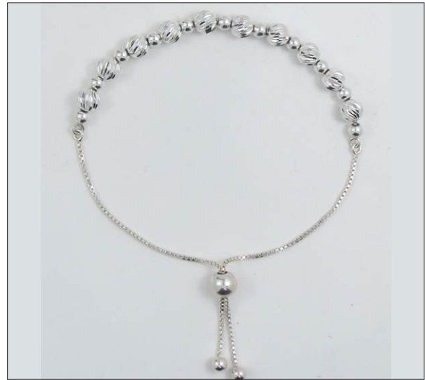
JB1069352T WT: 5.8 gm