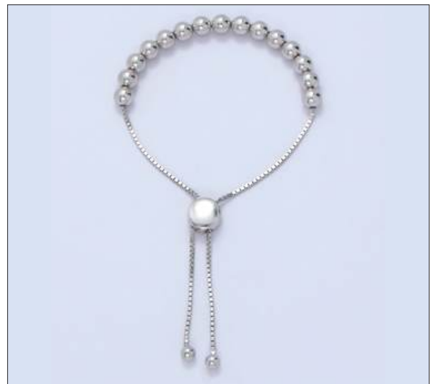
JB106853RH WT: 8.75 gm