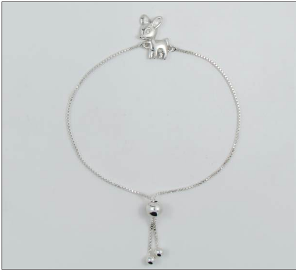
JB106954SL WT: 3.75 gm