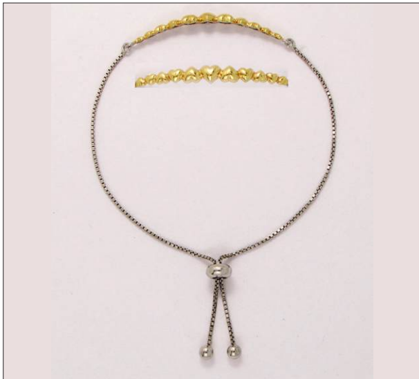
BR1073772T WT: 4.15 gm