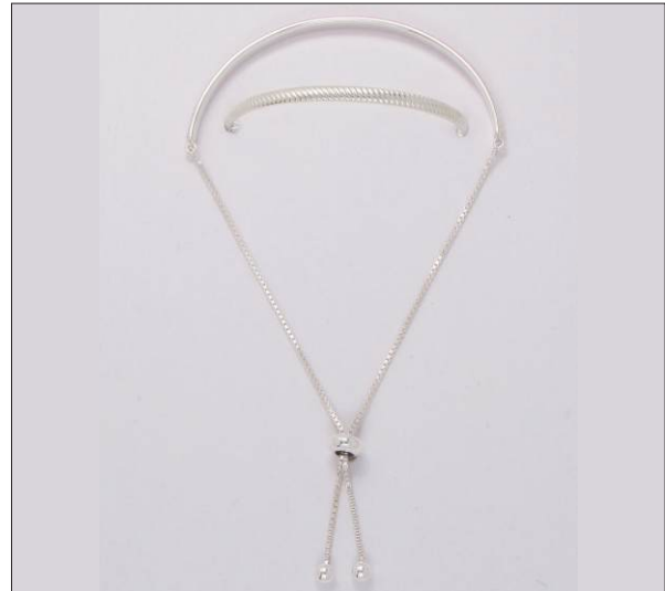
AFBR5172SL WT: 4.3 gm