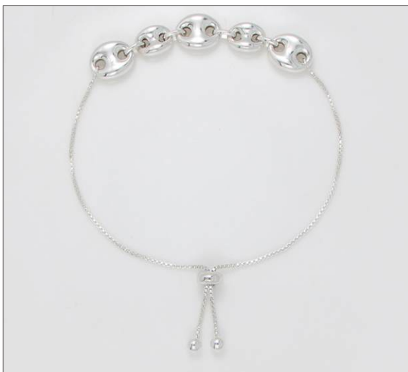
BR107121SL WT: 5.55 gm