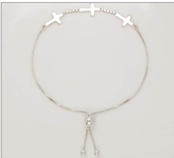
BR107168SL WT: 3.7 gm