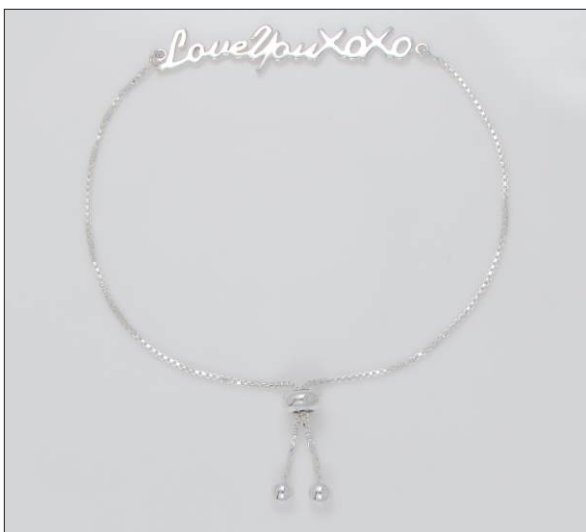
BR107093SL WT: 3.7 gm