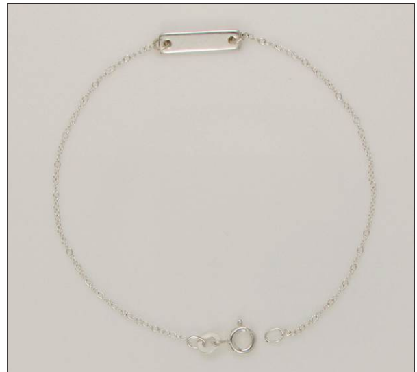
BR107157S7HISL WT: 1.2 gm