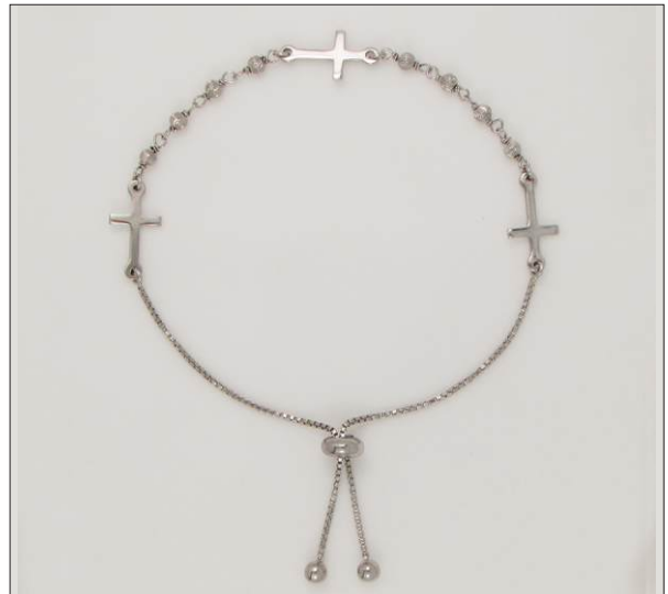
BR107180RH WT: 3.75 gm