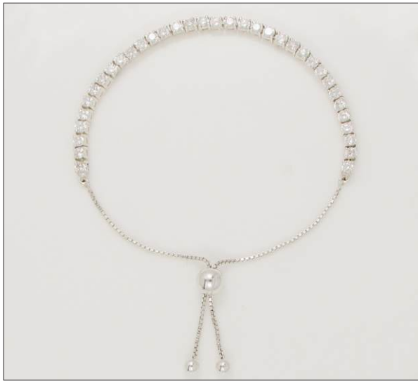
BR108409A18SL WT: 1.41/6.29 gm