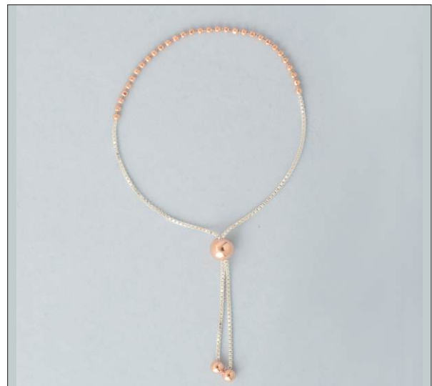
JB1068592T WT: 2.80 gm