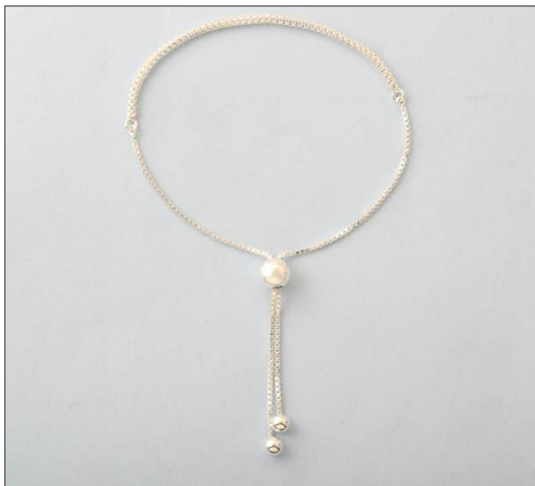
JB106865SL WT: 2.8 gm