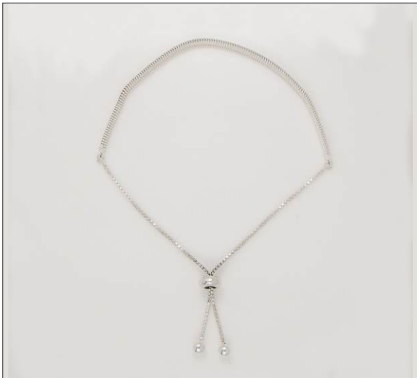
BR107179SL WT: 5.1 gm