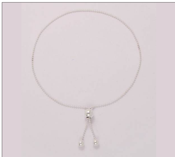
BR107310SL WT: 1.3 gm