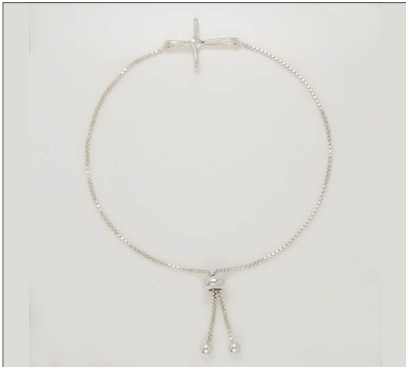
BR107239SL WT: 2.8 gm