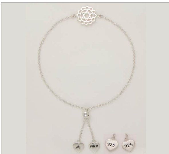
BR107304EN WT: 3.3 gm