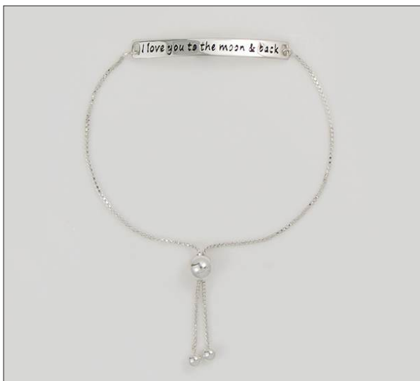
BR107029EN WT: 4.5 gm