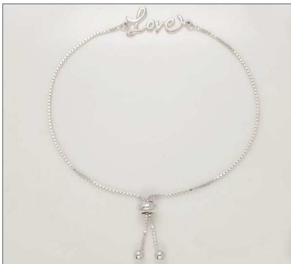
BR107133SL WT: 0.05/2.9 gm