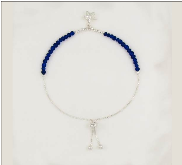
BR108404G6DC WT: 1.16/2.94 gm