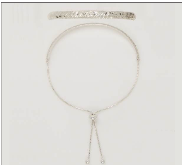
BR107220DC WT: 5.52 gm