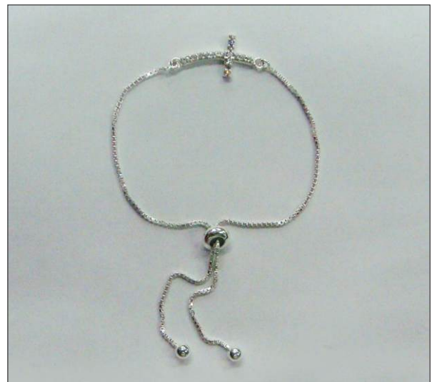
BR107442A18SL WT: 3.15 gm