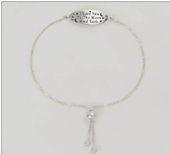
BR107015EN WT: 4.1 gm