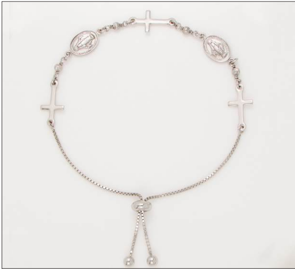
BR1071852T WT: 4.85 gm