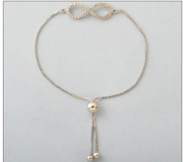
JB108360A18RH WT: 3.95 gm