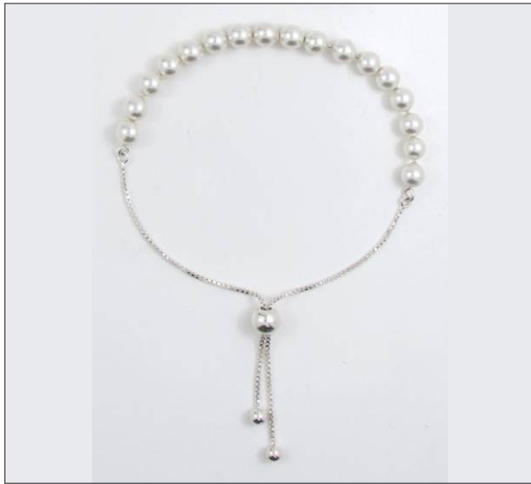
JB106941NPSL WT: 6.6 gm