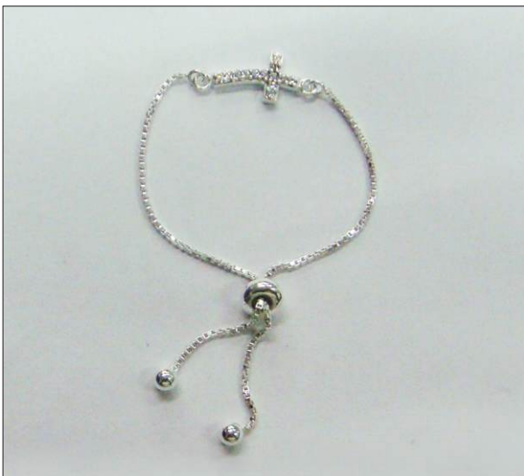
BR107441A18SL WT: 2.6 gm