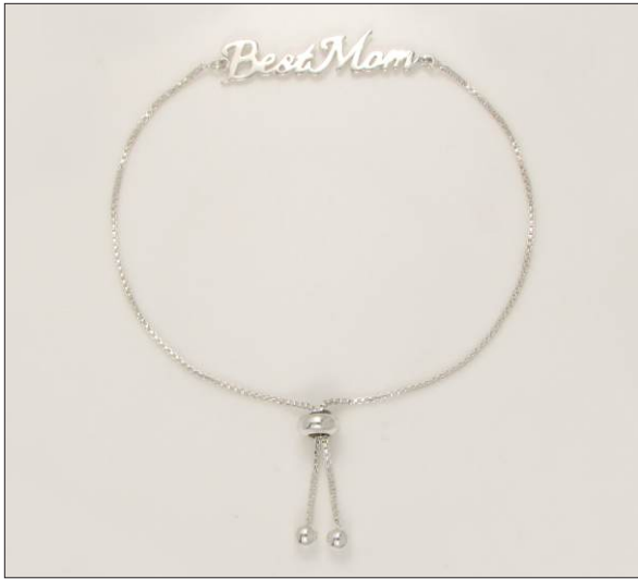
BR107081SL WT: 3.55 gm