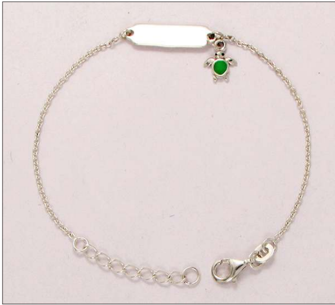
BR107368S7IEN WT: 2.15 gm