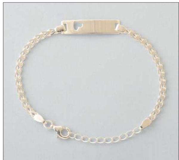
JB106887S18CSL WT: 3.05 gm