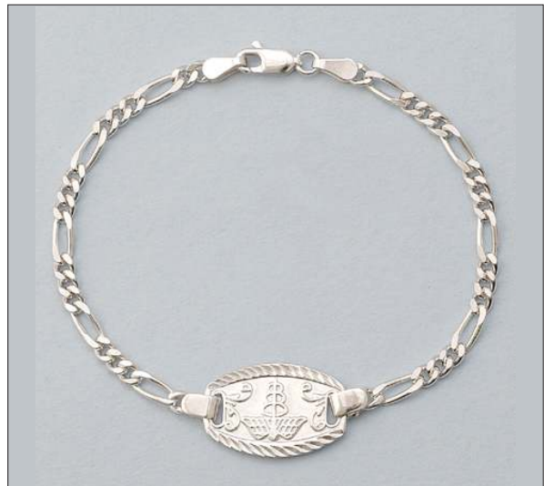
JB106667S7HI2T WT: 5.75 gm