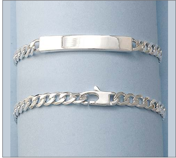
JB106354S8HISL WT: 15.8 gm