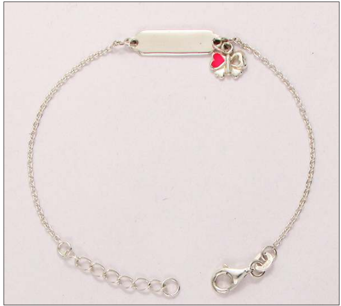
BR107369S7IEN WT: 2.28 gm