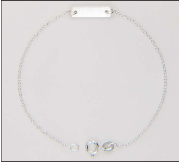
LZAN107281S10I2T WT: 1.35 gm