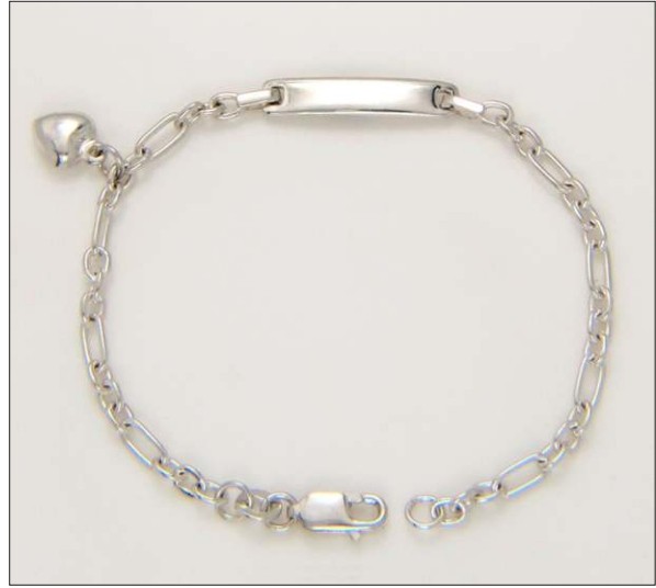
BR107057S6QISL WT: 3.6 gm