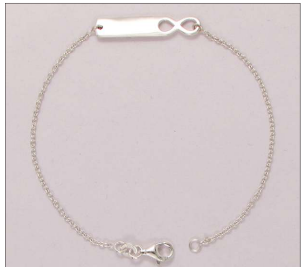
BR107325S7HISL WT: 2.57 gm