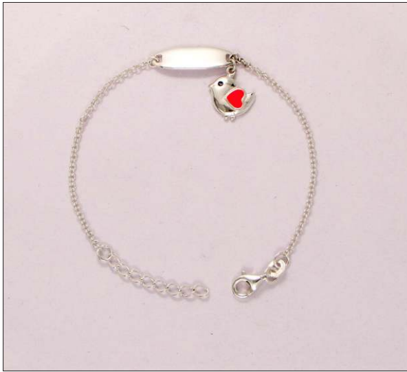
BR107337S7IEN WT: 3.34 gm