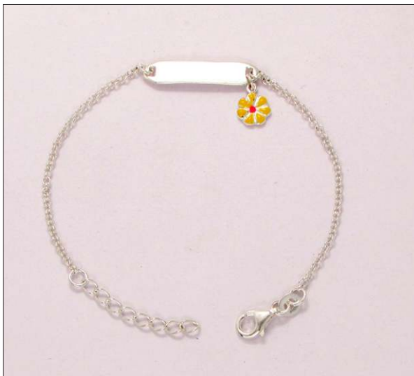
BR107335S7IEN WT: 2.69 gm