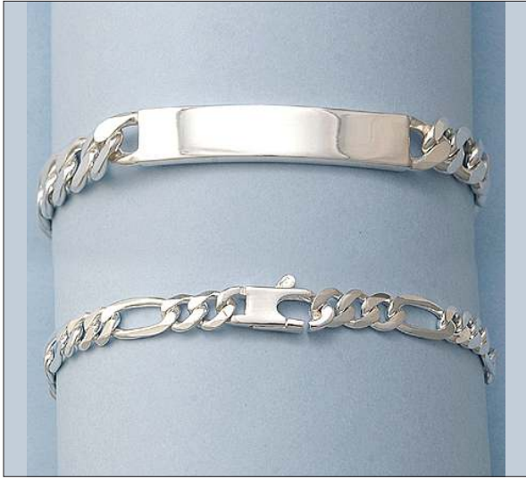
JB106353S8HISL WT: 14.5 gm