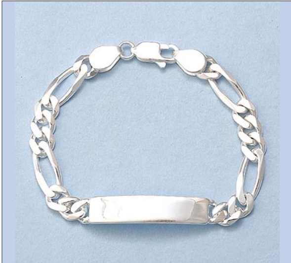
JB106296S7HISL WT: 18.55 gm