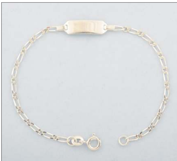
JB106850S6HISL WT: 1.95 gm