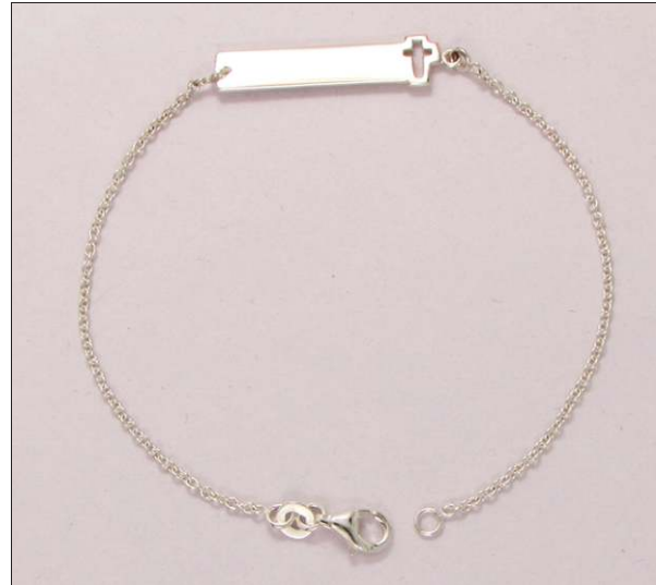
BR107329S7HISL WT: 2.81 gm