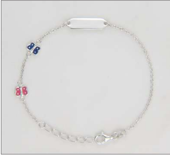
BR106984S7HIEN WT: 2.85 gm