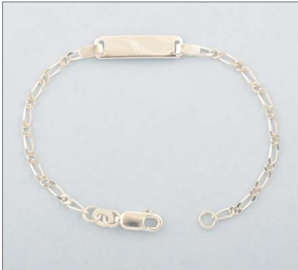
JB106848S5HISL WT: 2.1 gm