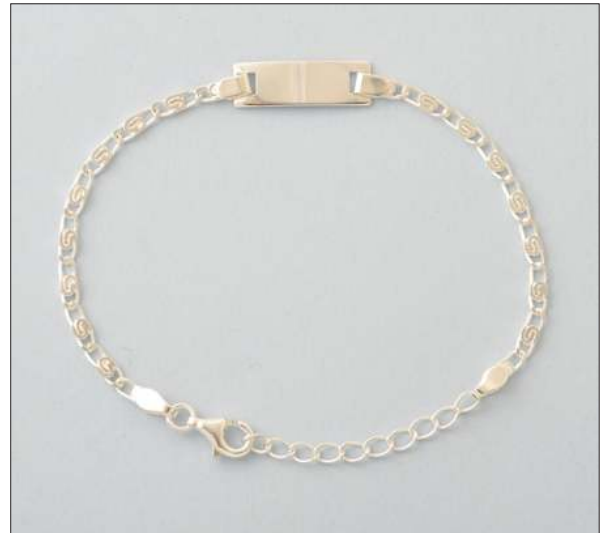
JB106885S18CSL WT: 2.85 gm