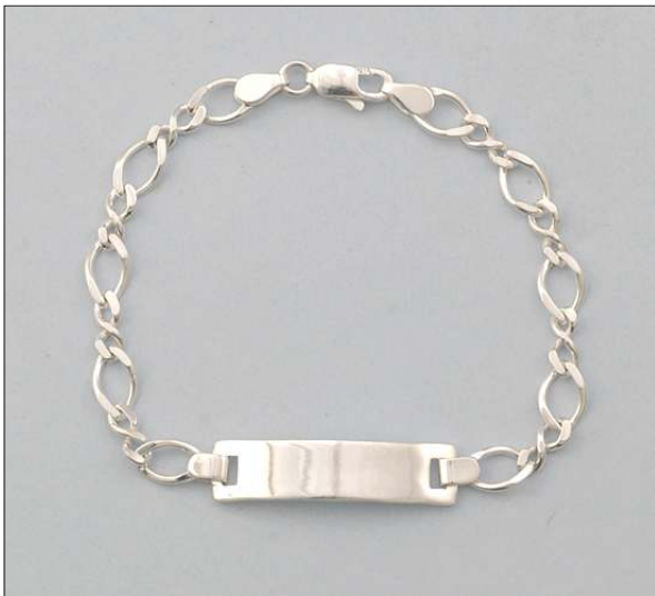
JB106701S7HISL WT: 7.8 gm