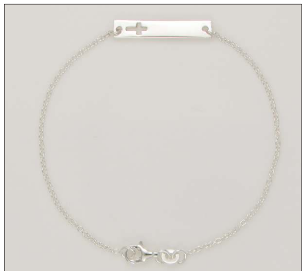
BR107234S7HISL WT: 2.15 gm