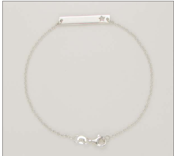
BR107232S7HISL WT: 2.1 gm