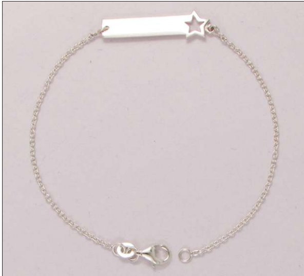
BR107328S7HISL WT: 2.71 gm