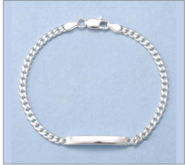
JB106294S7HISL WT: 6.35 gm