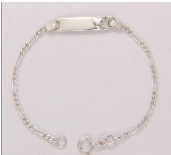
BR107318S6ISL WT: 2.4 gm