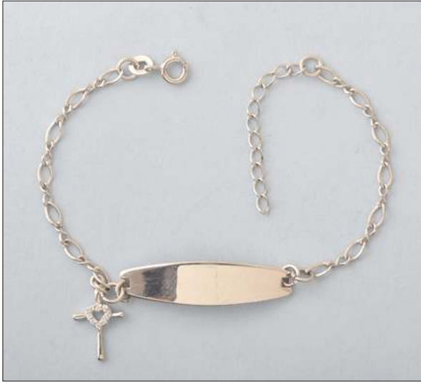
JB108354S7TIG18RH WT: 4.35 gm