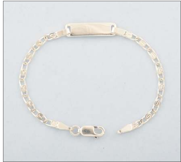
JB106847S5HISL WT: 2.7 gm