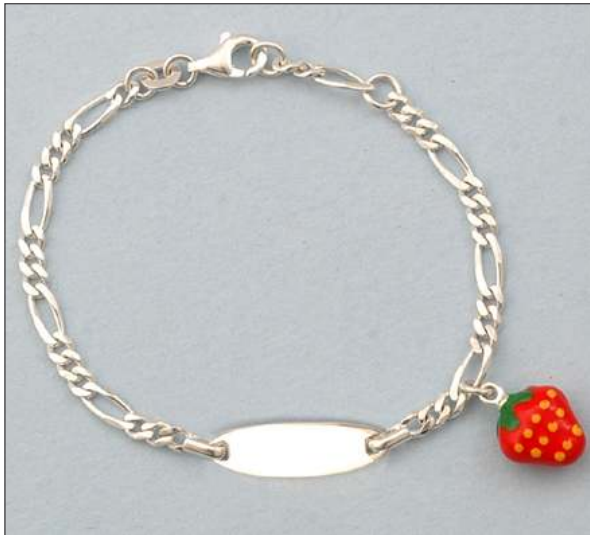
JB106738S6QIEN WT: 6.25 gm