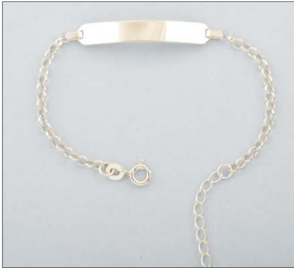
JB106852S6HISL WT: 2.6 gm