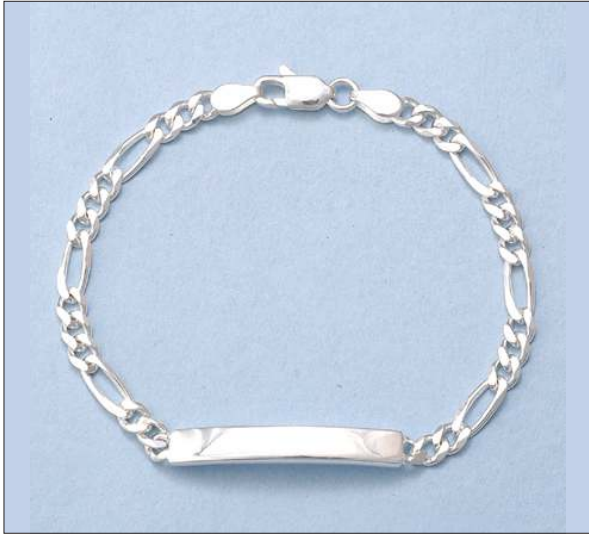
JB106293S7HISL WT: 9 gm