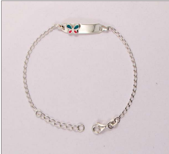
BR107349S7IEN WT: 2.30 gm