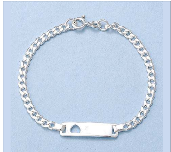
JB106290S16CSL WT: 3.85 gm