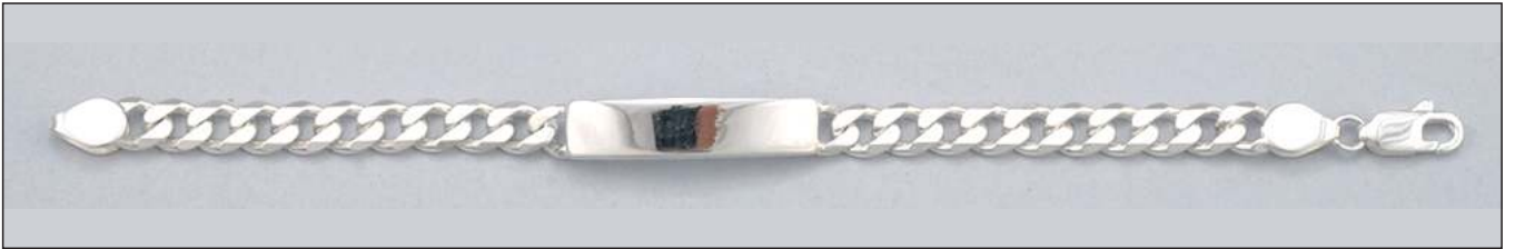
JB106295S7HISL WT: 19 gm