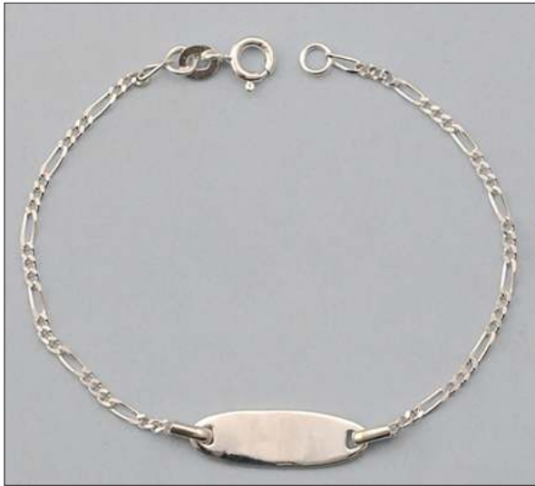
JB106705S6QISL WT: 2.3 gm