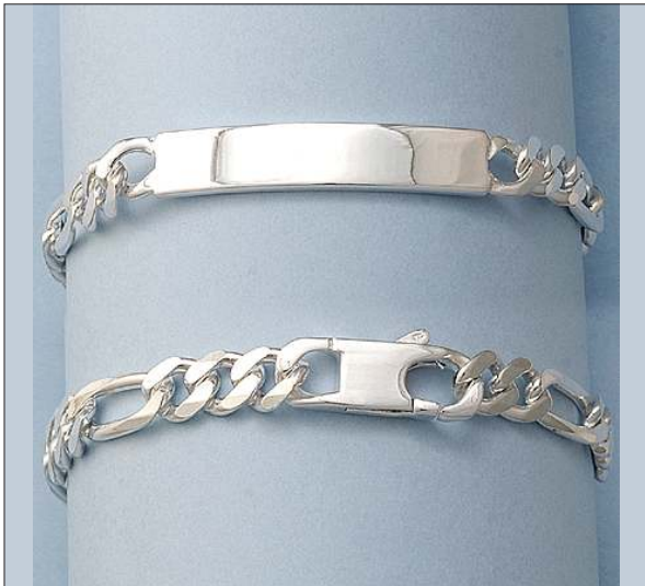
JB106361S8HISL WT: 23 gm