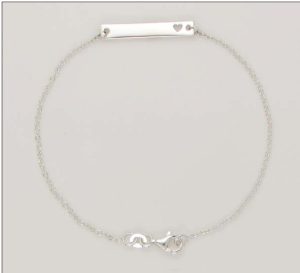
BR107231S7HISL WT: 2.1 gm