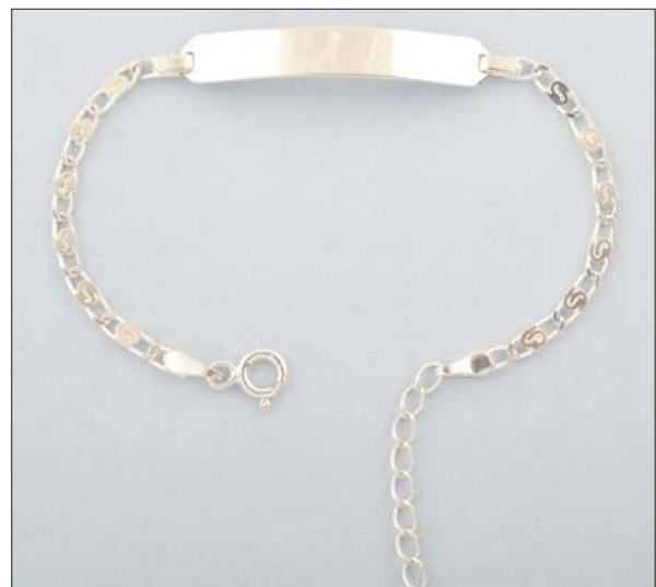
JB106851S6HISL WT: 3 gm