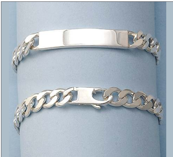
JB106349S8HISL WT: 25.5 gm