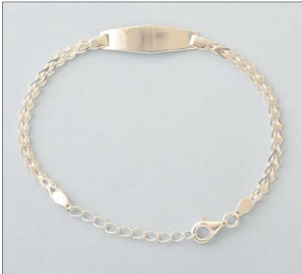
JB106883S18CSL WT: 3 gm