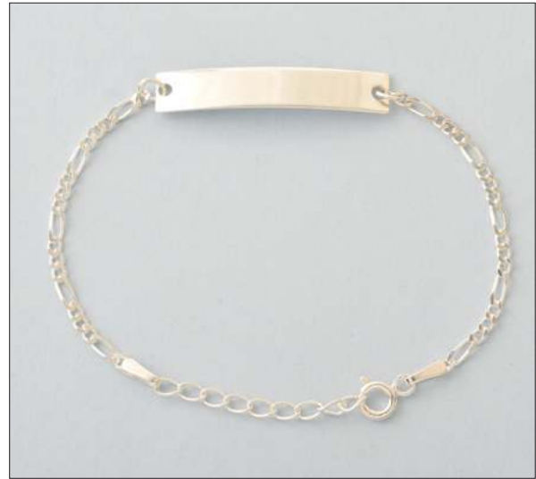
JB106882S18CSL WT: 2.5 gm