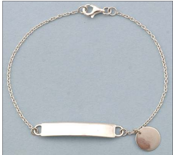
JB106649S7HISL WT: 3.1 gm