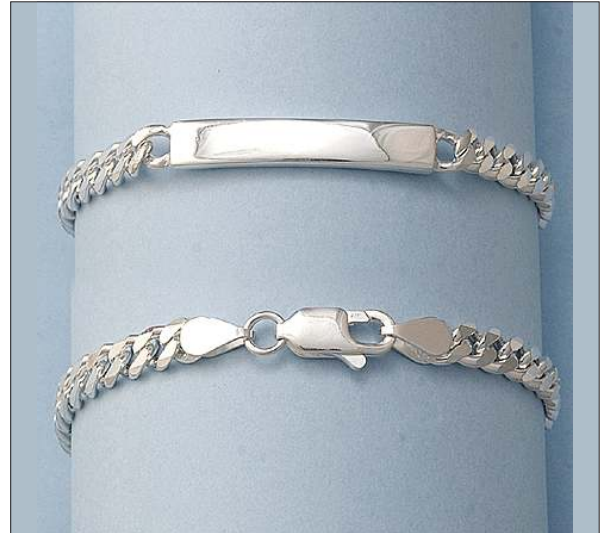
JB106301S7HISL WT: 12.1 gm