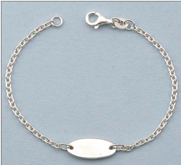
JB106634S6ISL WT: 2.65 gm