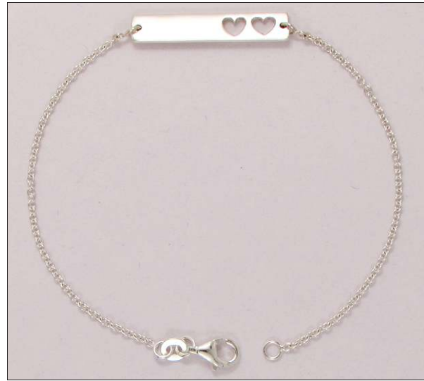
BR107327S7HISL WT: 2.61 gm