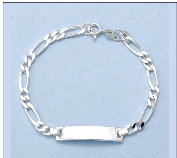
JB106292S16CSL WT: 5.05 gm