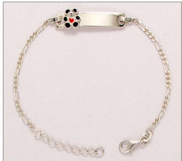
BR107367S7IEN WT: 3.45 gm