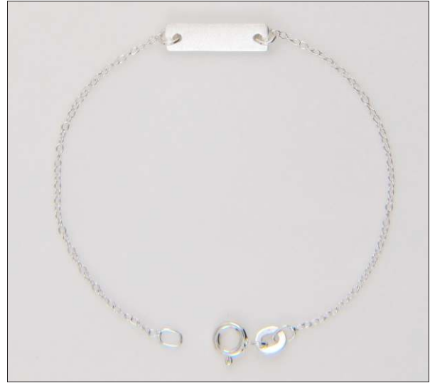
LZBR107281S6I2T WT: 1.2 gm