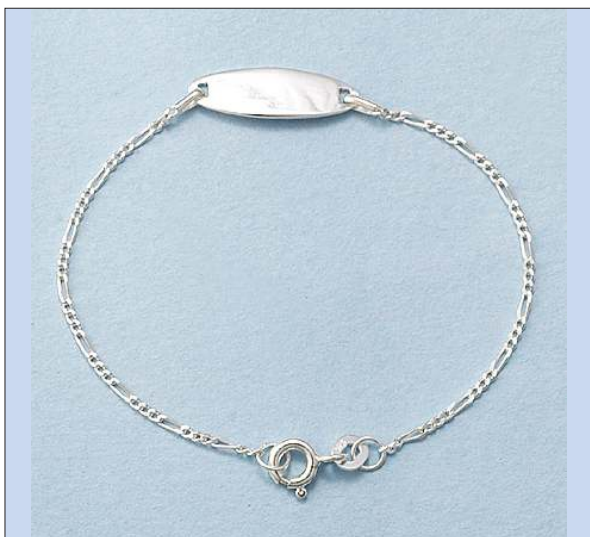
JB106291S16CSL WT: 1.6 gm