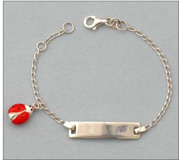
JB106711S6IEN WT: 4.45 gm