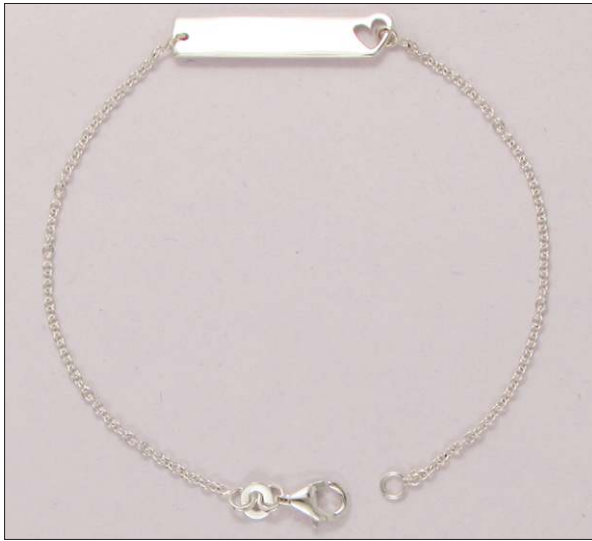
BR107326S7HISL WT: 2.80 gm