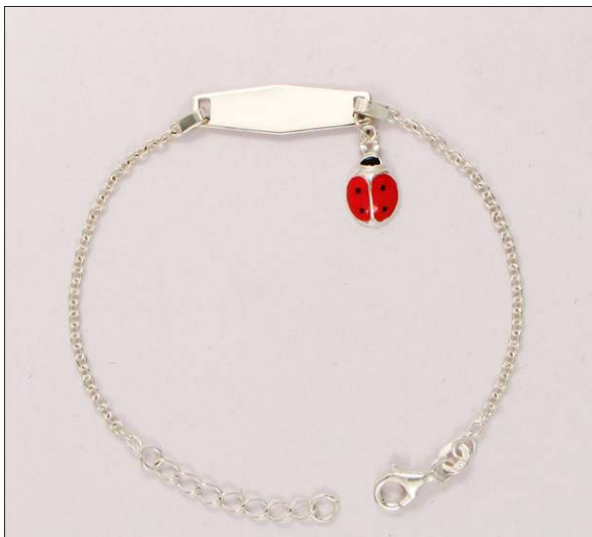
BR107363S7IEN WT: 2.12 gm