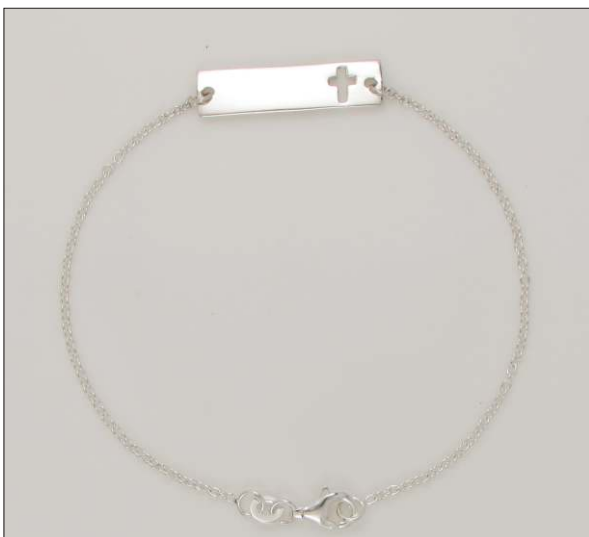
BR107233S7HISL WT: 2.45 gm