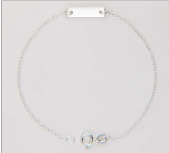
LZBR107281S7I2T WT: 1.2 gm