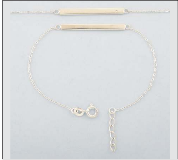
JB122530S18CG18SL WT: 1.43 gm