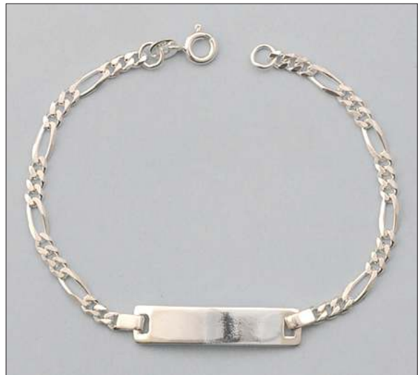
JB106704S6HISL WT: 4.05 gm