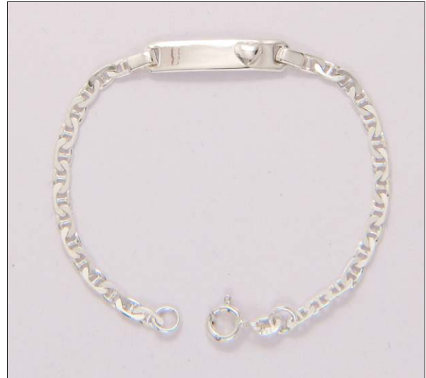
BR107317S6ISL WT: 3 gm