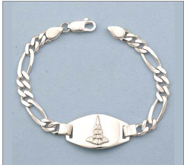
JB106619S7HISL WT: 15.2 gm