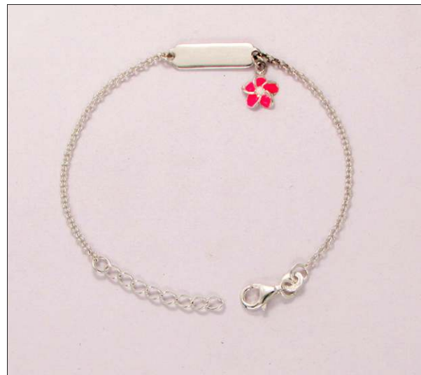
BR107336S7IEN WT: 2.58 gm