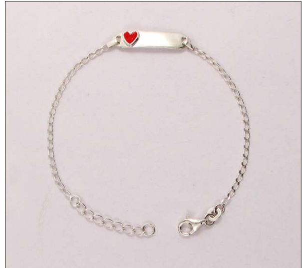
BR107350S7IEN WT: 2.20 gm