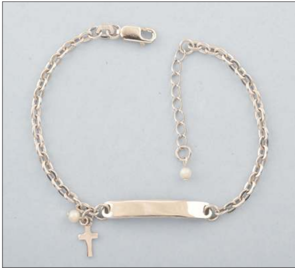
JB106846S7HINPRH WT: 0.08/4.57 gm