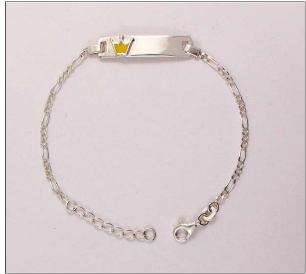
BR107348S7IEN WT: 3.20 gm