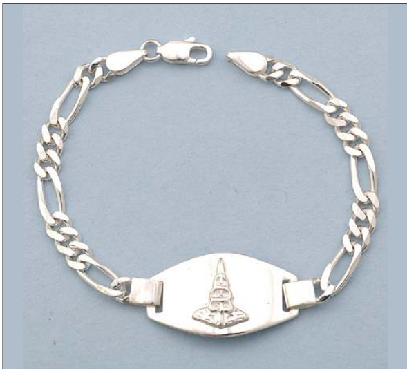
JB106620S7HISL WT: 12.75 gm