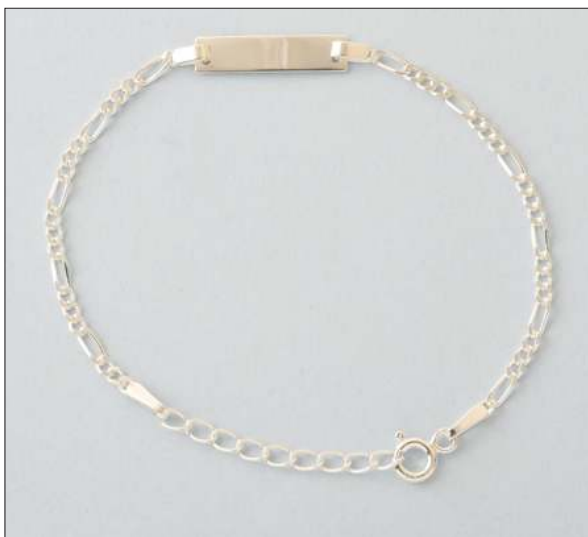
JB106886S18CSL WT: 1.9 gm