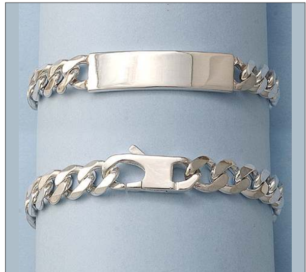
JB106350S8HISL WT: 34.4 gm