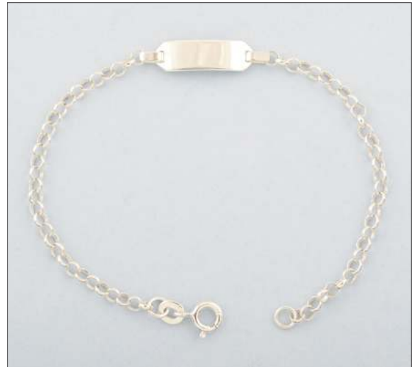
JB106849S6HISL WT: 2.25 gm