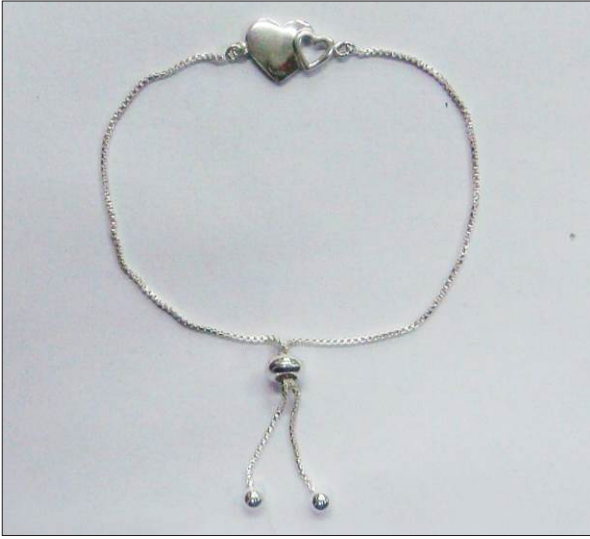
BR107427SL WT: 3.4 gm