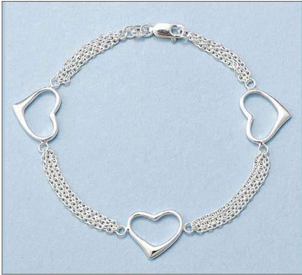
JB106333S7HISL WT: 6.02 gm