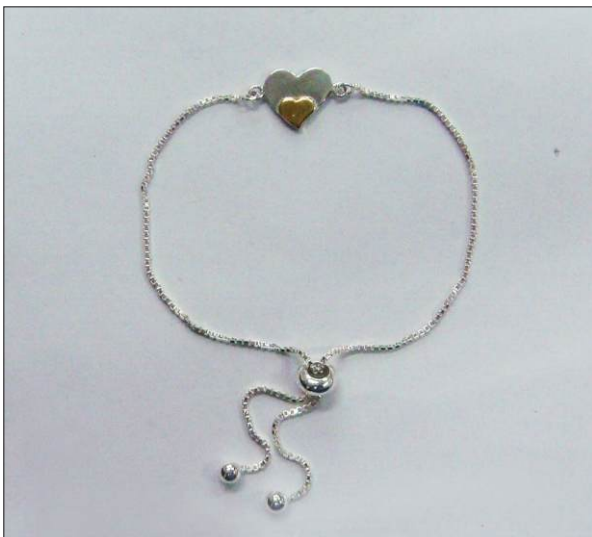
BR1074262T WT: 3.25 gm