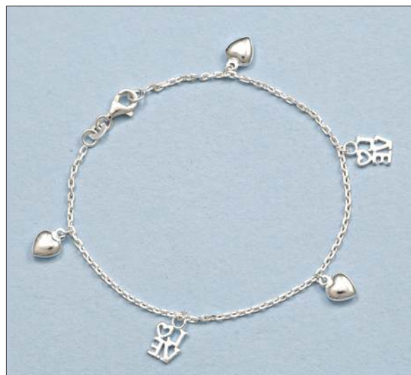
JB106576S7HISL WT: 3.3 gm