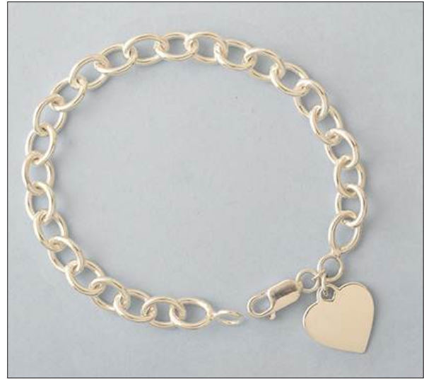
JTB251035S8QINSL WT: 17.2 gm