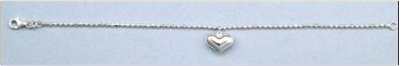
JB106487S7HISL WT: 3.6 gm