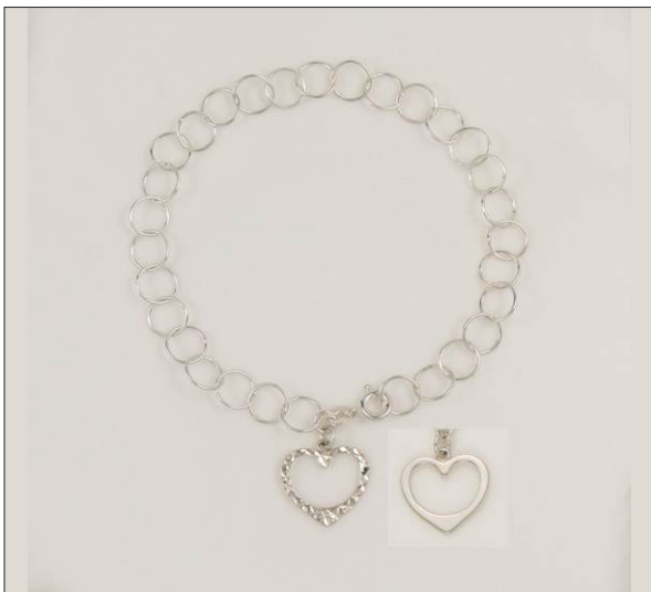
BR107065S7HIDC WT: 2.4 gm