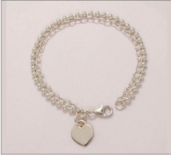
BR107395S7HISL WT: 7.95 gm