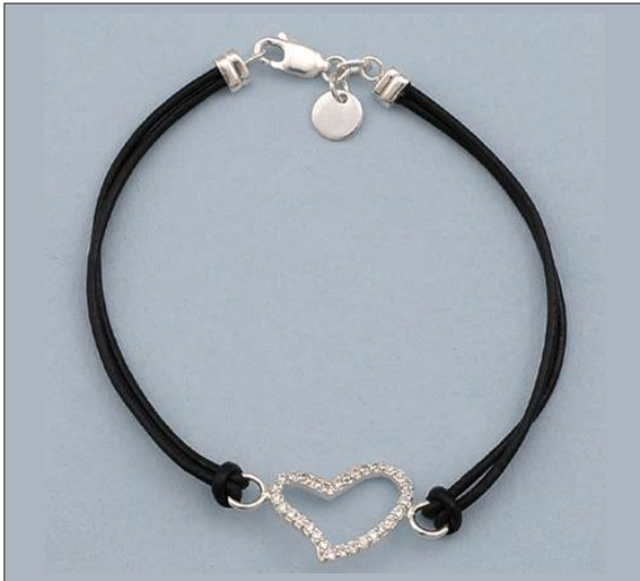
JB108266S7HIA18SL WT: 3 gm