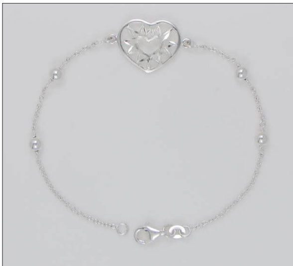
BR107100S7HIDC WT: 2.45 gm