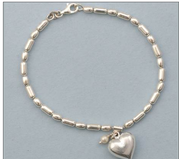
JB108284S7HIA31SL WT: 7.45 gm