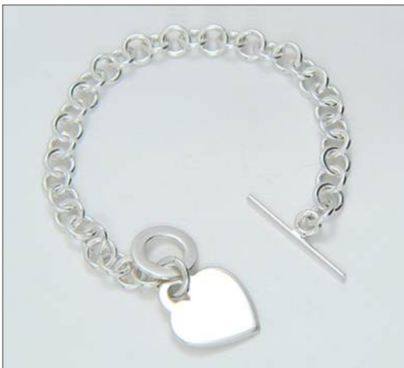
JB122606S7HISL WT: 22.6 gm