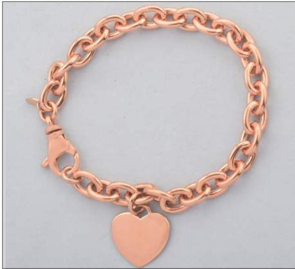
JB106797S7HIRG WT: 23.15 gm