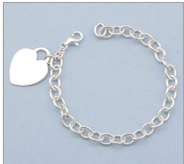
JB106597S7HISL WT: 13.85 gm