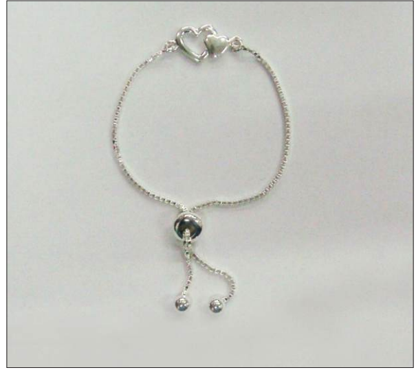
BR107428SL WT: 2.5 gm