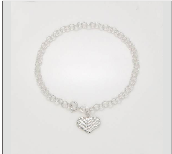
BR107046S7HIDC WT: 3.35 gm