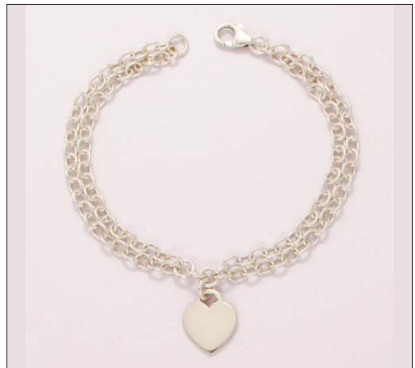
BR107401S7HISL WT: 8 gm