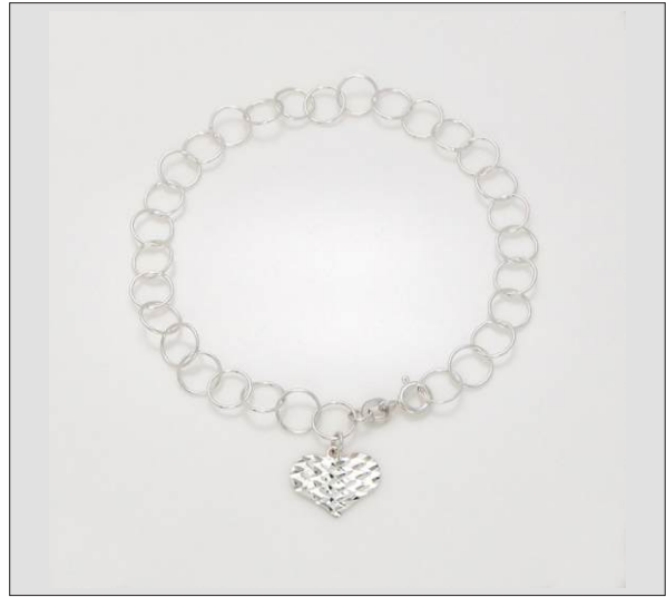
BR107045S7HIDC WT: 2.75 gm