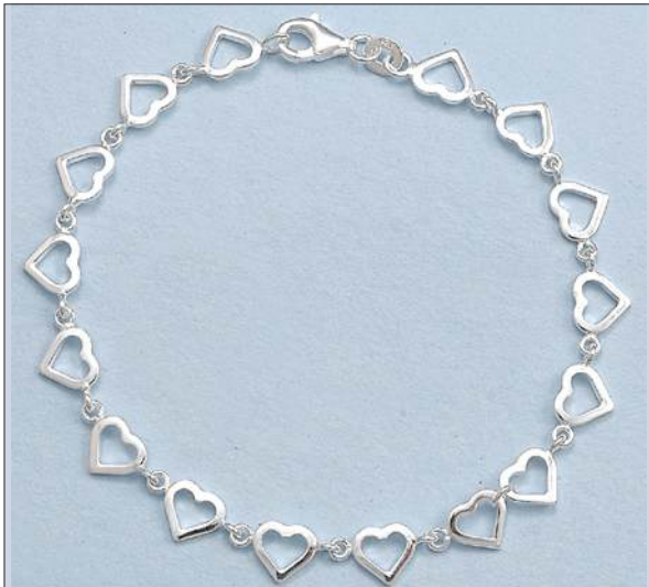
JB106460S7HISL WT: 4.3 gm