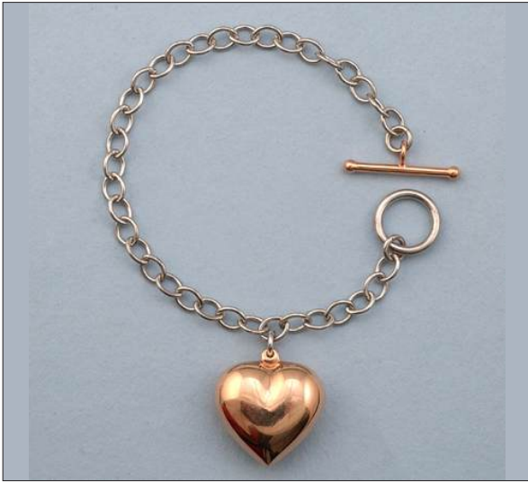
JB121695S7HI2T WT: 10.45 gm