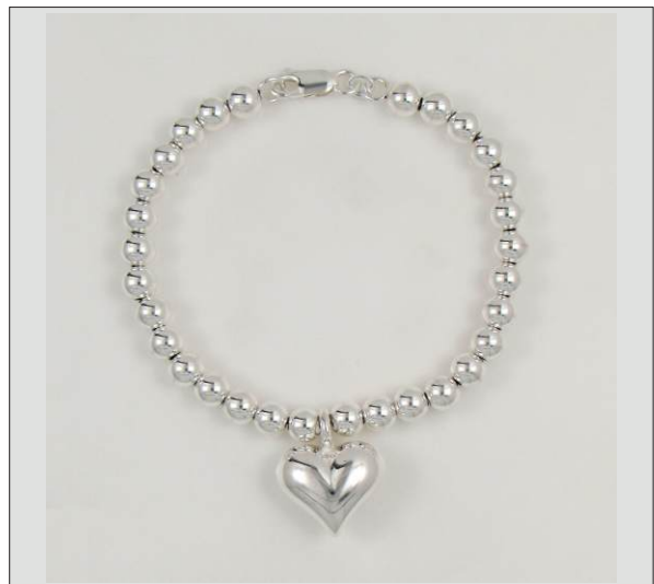
BR107049S7HISL WT: 9.6 gm