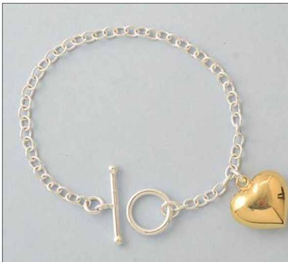
JB106895S7HI2T WT: 8.2 gm