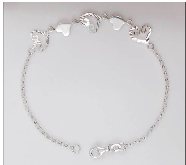
BR107101S7HIDC WT: 2.5 gm