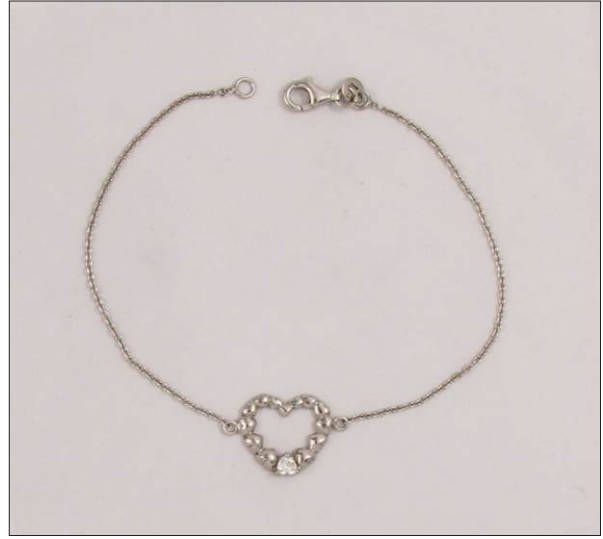
BR107477S7HIA18RH WT: 0.04/2.06 gm