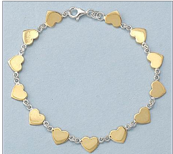
JB106470S7HI2T WT: 5.52 gm