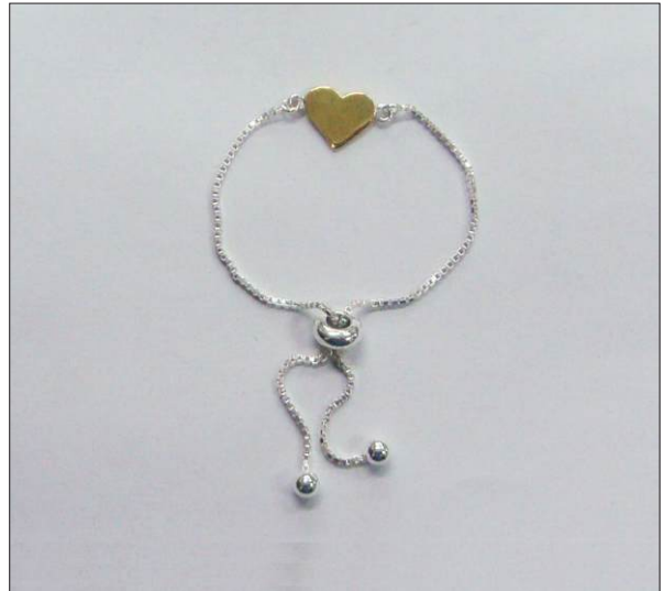
BR1074372T WT: 2.45 gm