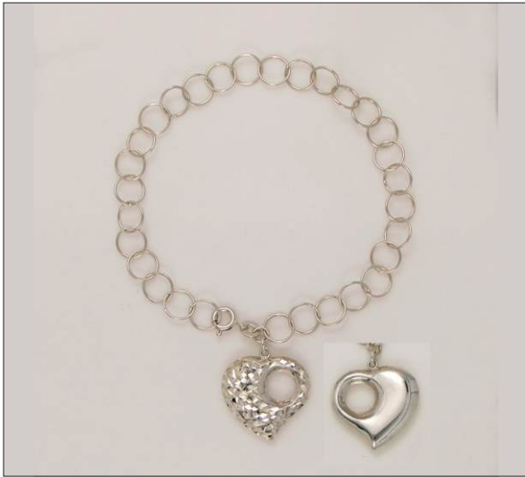
BR107062S7HIDC WT: 3.6 gm