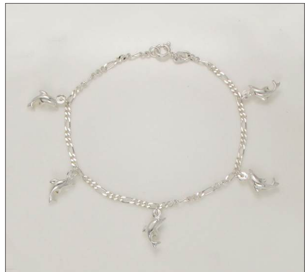
BR107059S7HISL WT: 3.9 gm