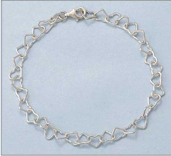
JB106580S7HISL WT: 3.92 gm