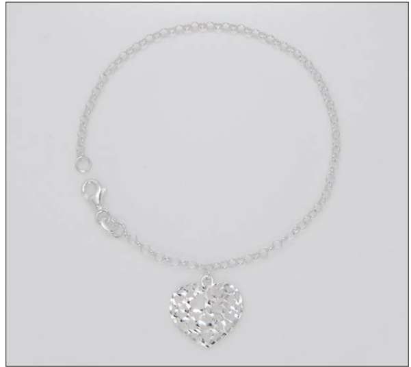
BR107103S7HIDC WT: 2.5 gm