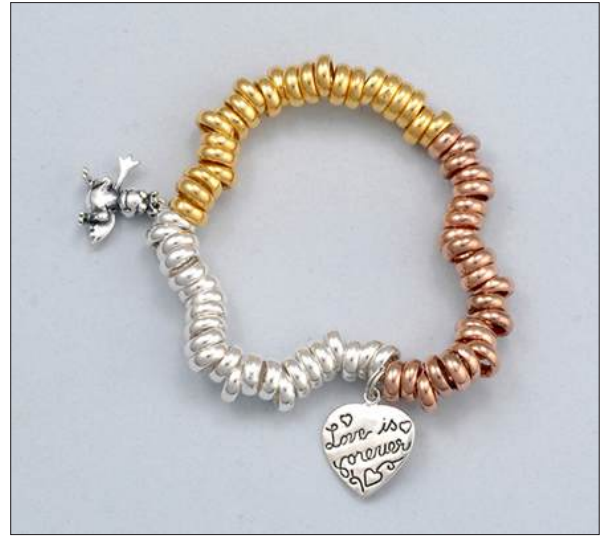
JB106308MF WT: 15.35 gm