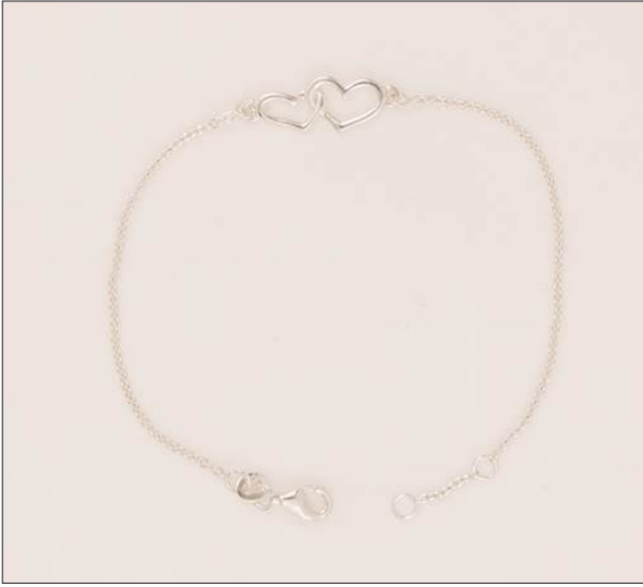
BR107447S7HISL WT: 1.9 gm