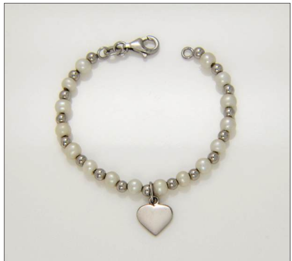
BR108394S12CNPRH WT: 3.4 gm