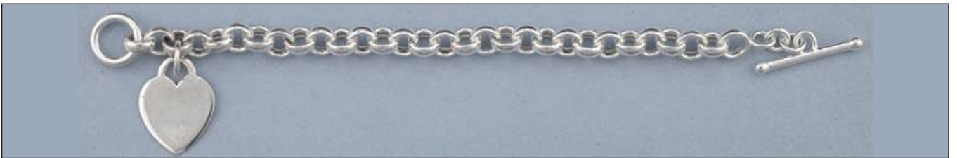
JB106139S7HISL WT: 16 gm