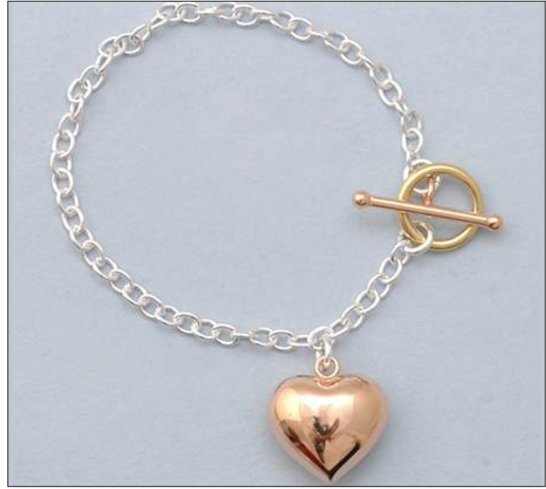
JB106668S7HI3T WT: 7.65 gm