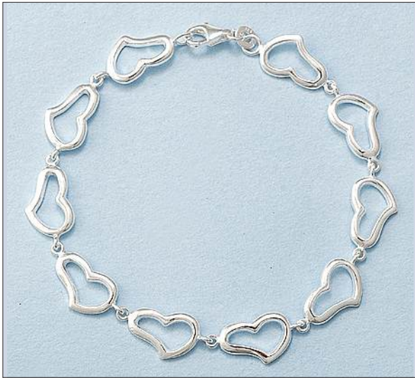
JB106137S7HISL WT: 7.18 gm