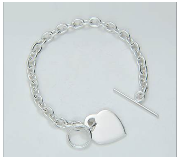
JB122607S7HISL WT: 21.8 gm