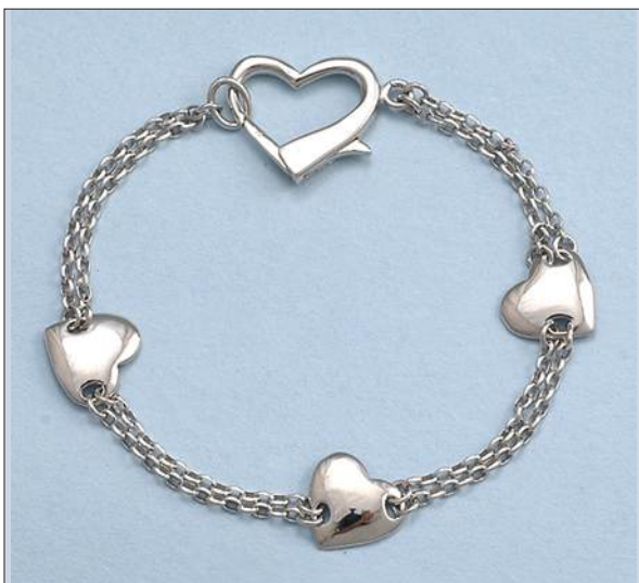
JB106572S7HIRH WT: 7.3 gm