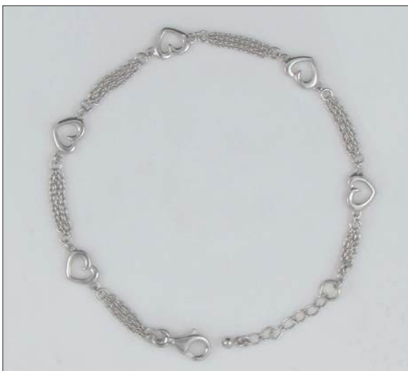
JB106913S8HIRH WT: 4.4 gm