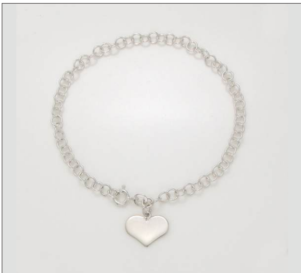
BR107046S7HISL WT: 3.35 gm