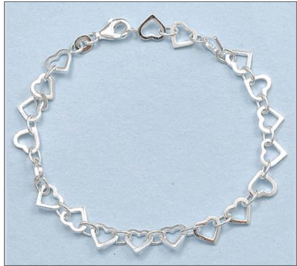
JB106459S7HISL WT: 5.1 gm