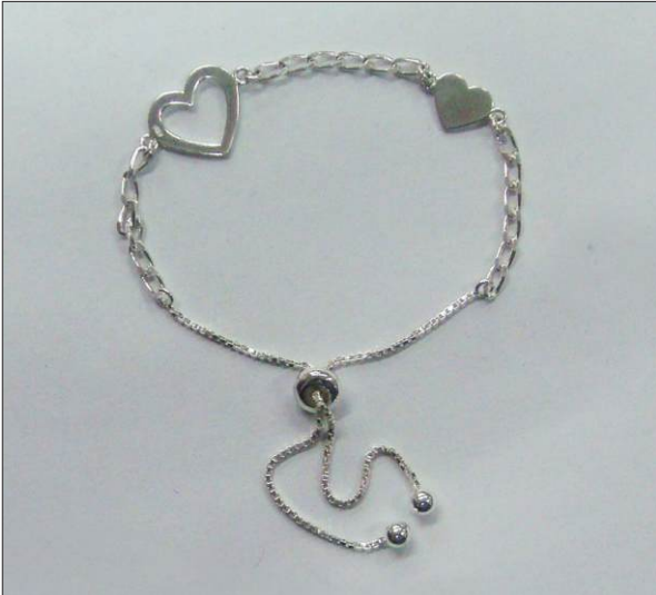
BR107429SL WT: 4.05 gm