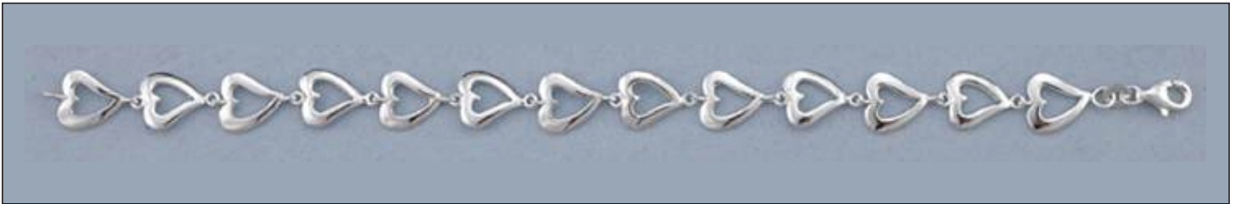
JB106131S7HISL WT: 7 gm