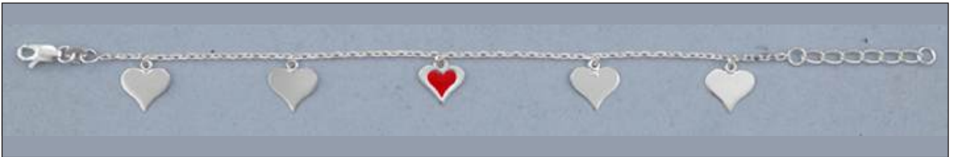
JB106151S7HIEN WT: 3.21 gm