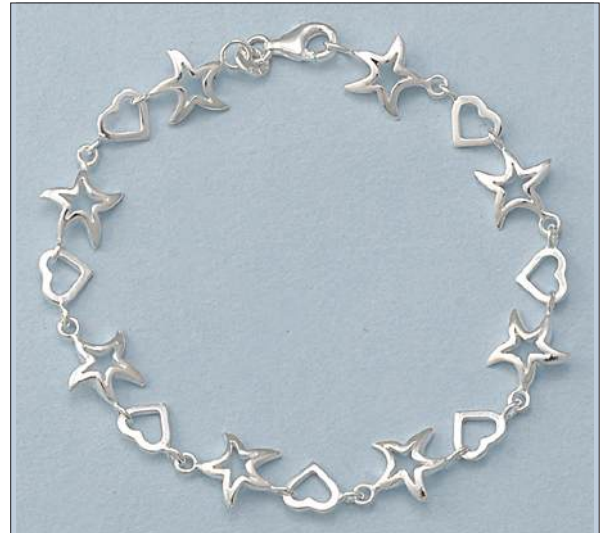
JB106491S7HISL WT: 6.2 gm