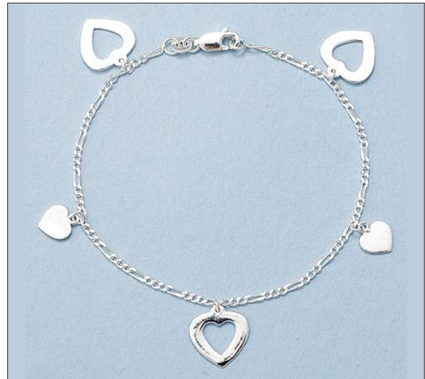
JB106331S7HISL WT: 4 gm