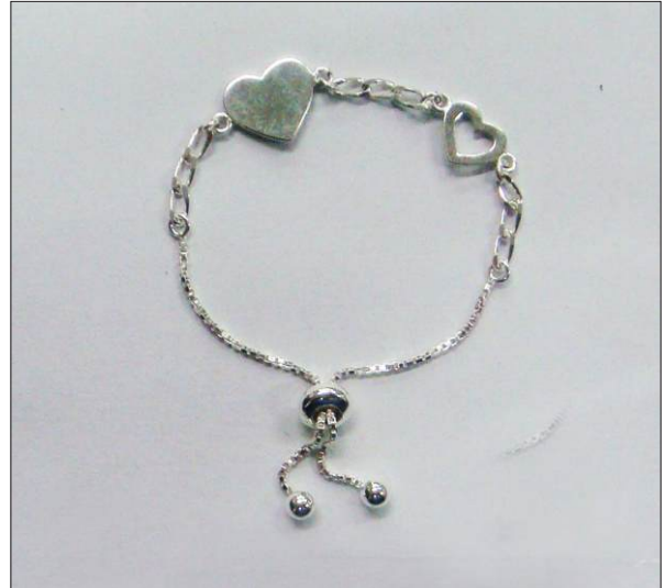
BR107430SL WT: 3.45 gm