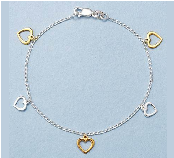
JB106329S7HI2T WT: 2.1 gm