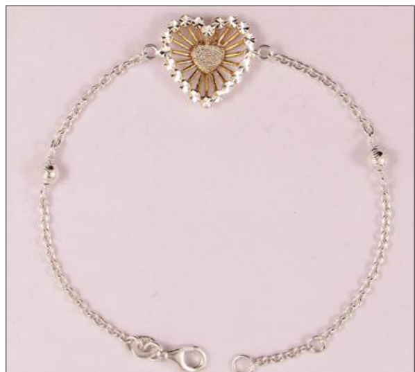
BR107411S7HIMF WT: 3.2 gm