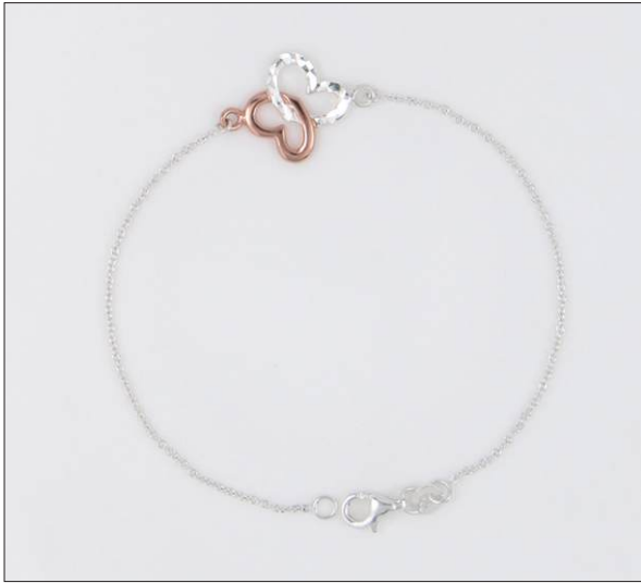
BR107107S7HI3T WT: 1.9 gm