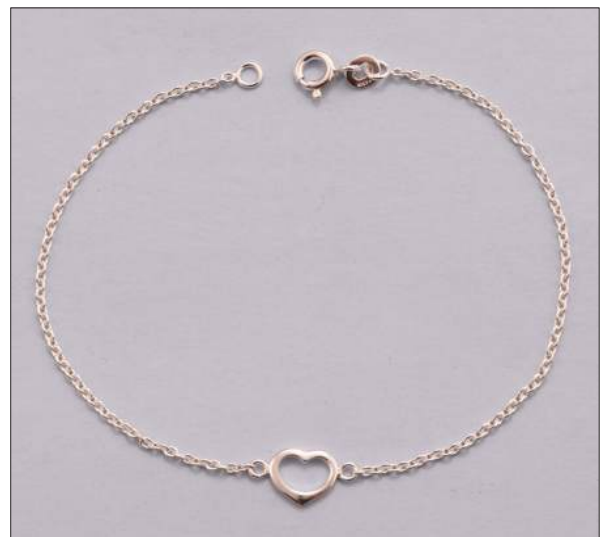
JB106775S7HISL WT: 1.35 gm