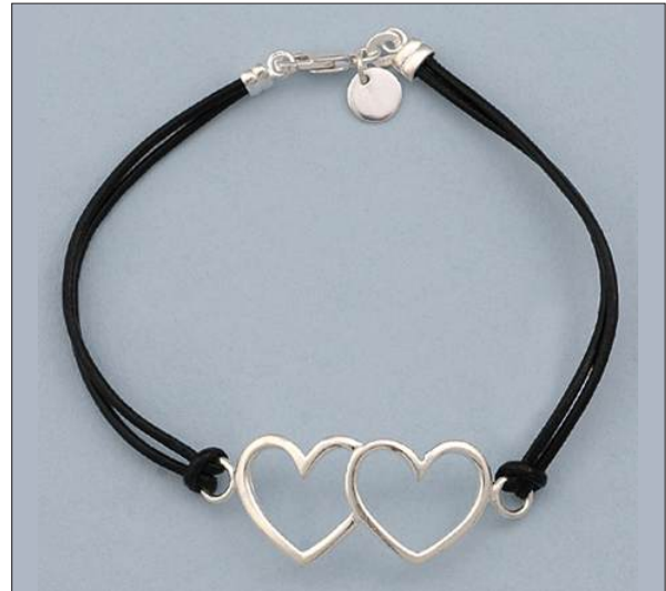
JB106627S7HISL WT: 3.5 gm