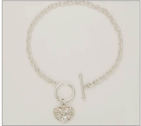
BR107279S7HISL WT: 7.9 gm