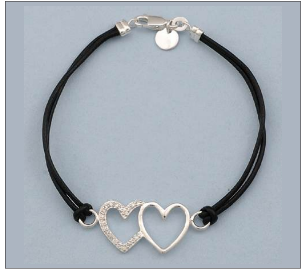
JB108269S7HIA18SL WT: 4 gm