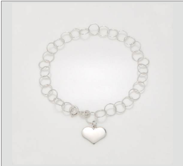
BR107045S7HISL WT: 2.75 gm