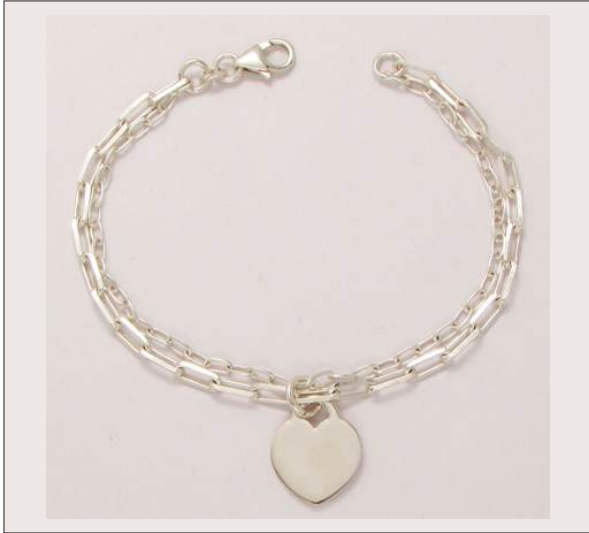
BR107397S7HISL WT: 7.25 gm