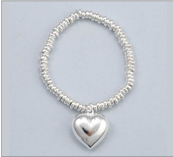
JB106306SL WT: 19.23 gm