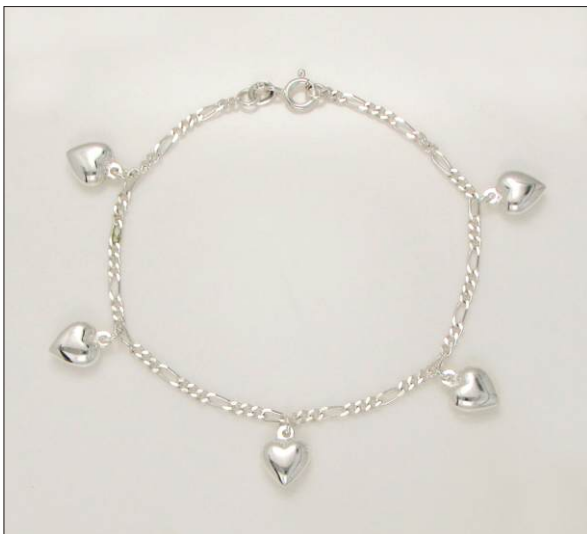
BR107058S7HISL WT: 4.1 gm