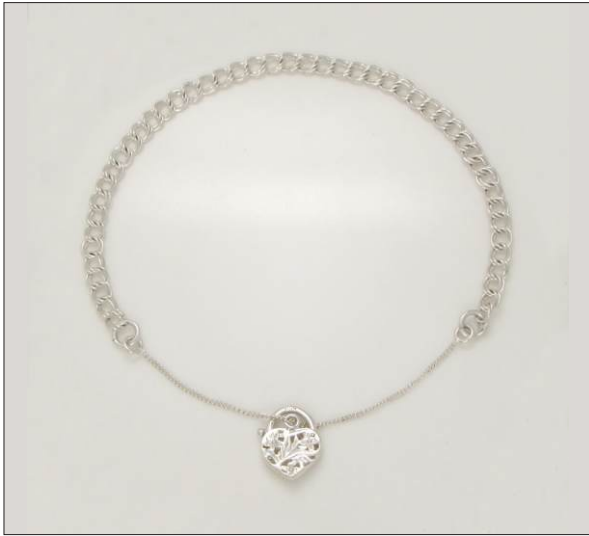
BR107050S7HISL WT: 6.65 gm