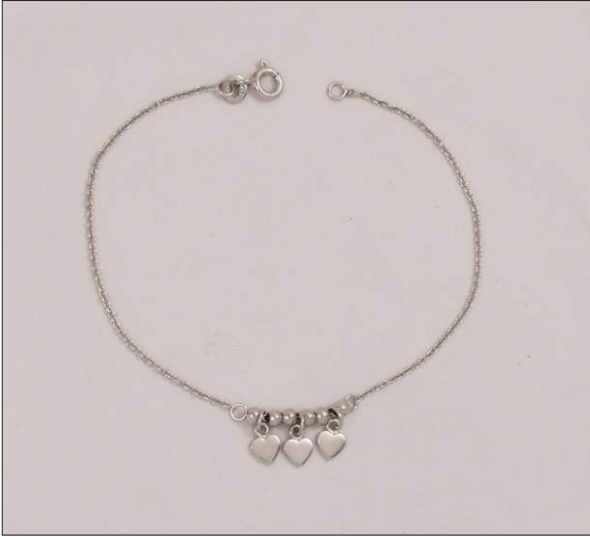
BR107469S7HIRH WT: 1.65 gm