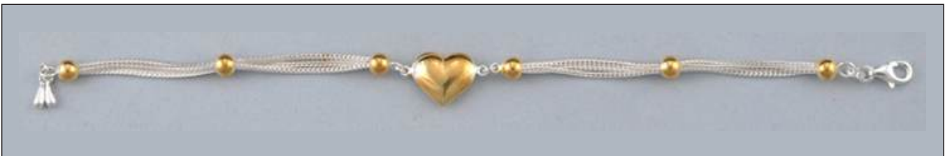
JB106173S7HI2T WT: 6.54 gm