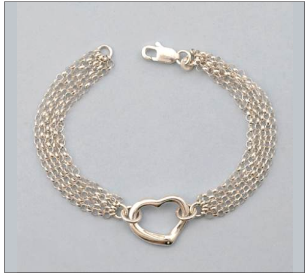
JB106670S7HISL WT: 8.75 gm