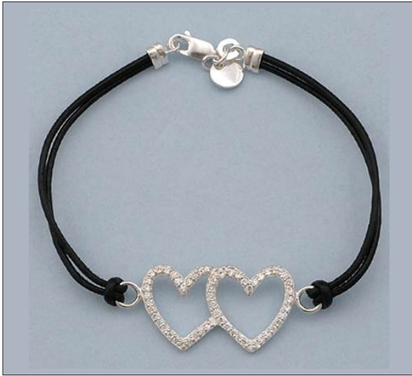
JB108268S7HIA18SL WT: 4.4 gm