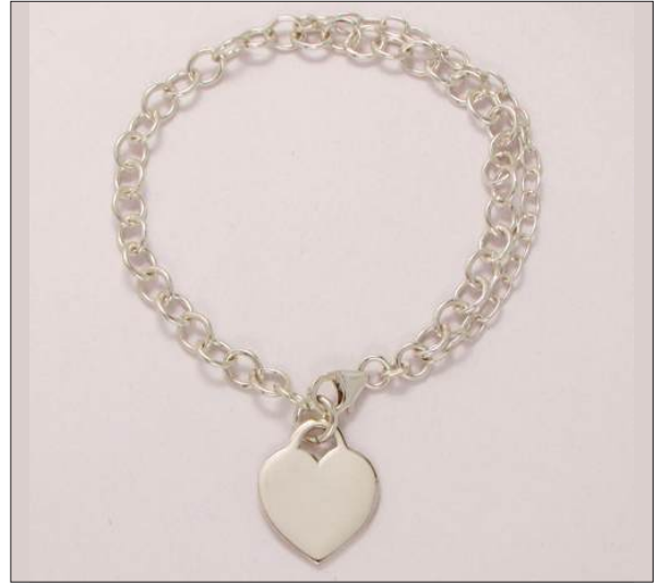
BR107396S7HISL WT: 8.8 gm