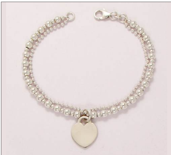
BR107399S7HISL WT: 7.9 gm