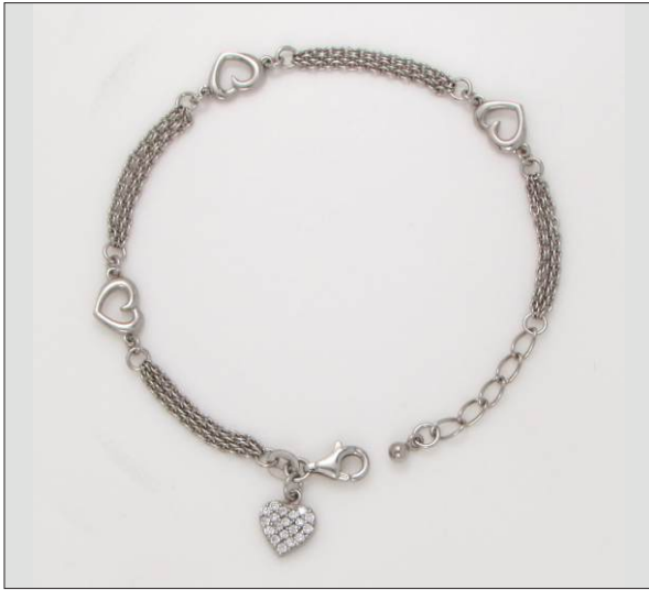
BR107044S7HIA18RH WT: 0.09/4.46 gm