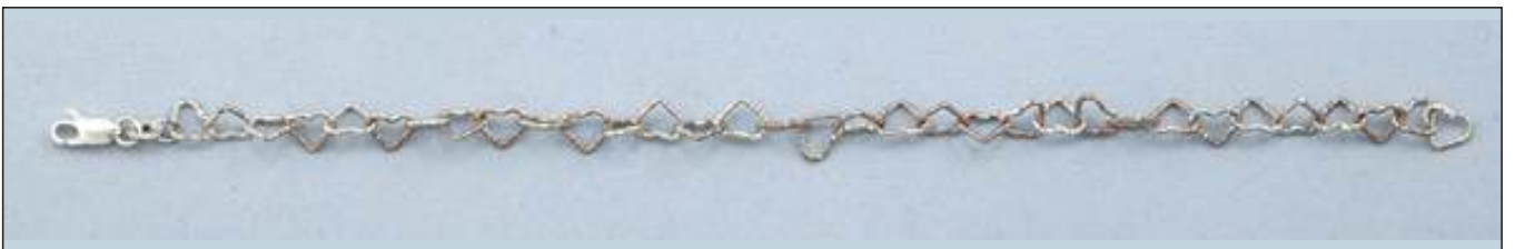
JB106435S7HIDC WT: 3.6 gm