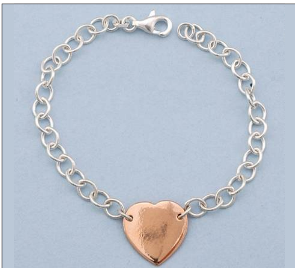
JB106596S7HI2T WT: 7.55 gm