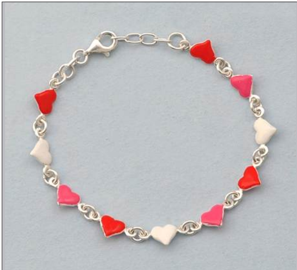
JB106707S6HIEN WT: 4.6 gm