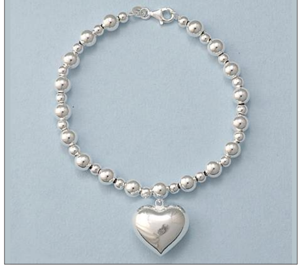
JB106488S7HISL WT: 9 gm