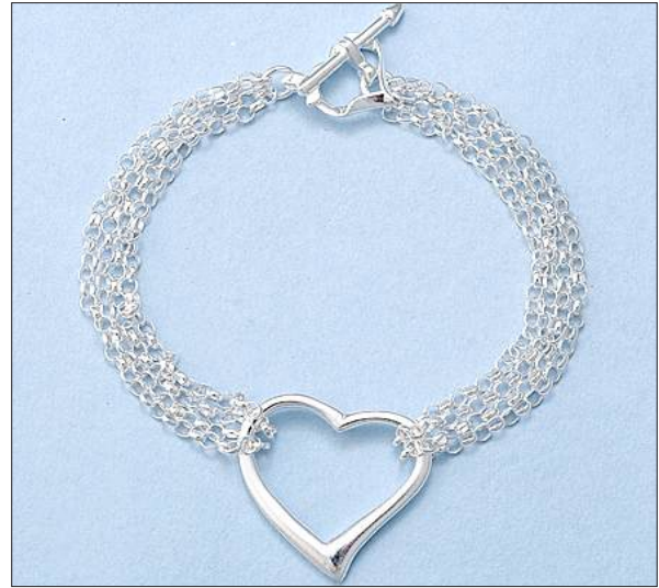
JB106383S7HISL WT: 8.1 gm