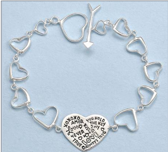
JB106473S7HIEN WT: 7.05 gm