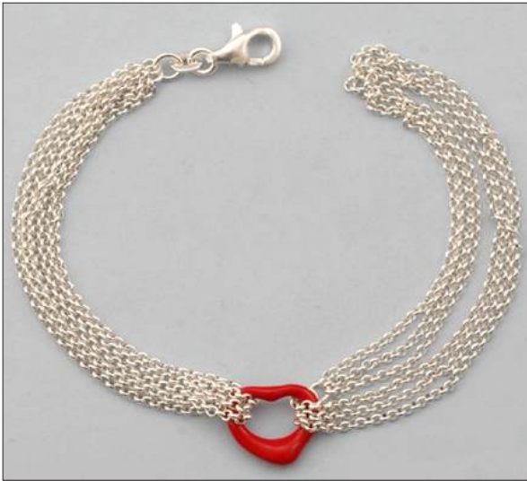
JB106744S7HIEN WT: 8.65 gm