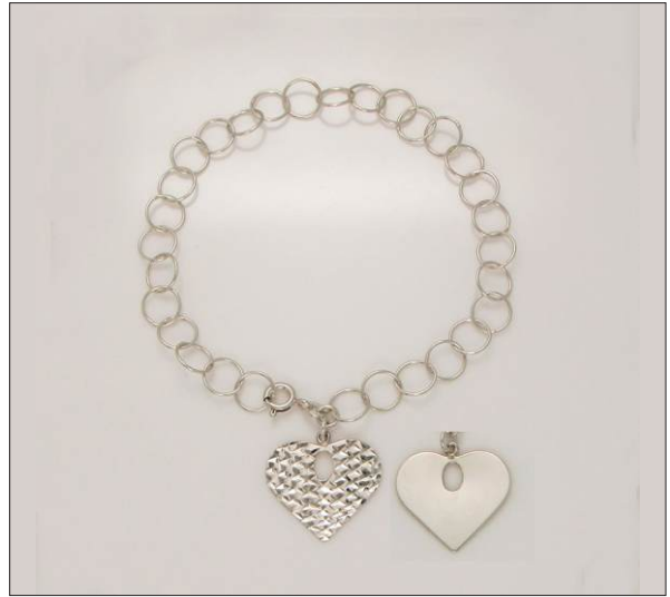
BR107066S7HIDC WT: 2.85 gm