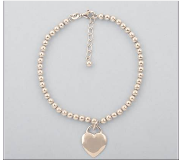
JB106827S8HIRH WT: 8.35 gm