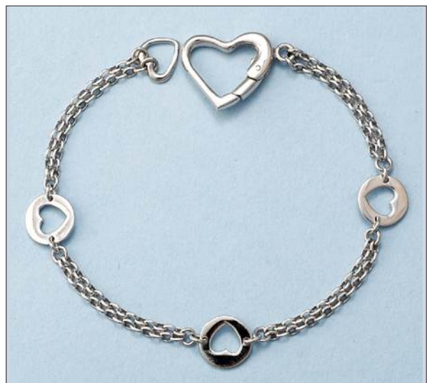
JB106574S7HIRH WT: 5.55 gm