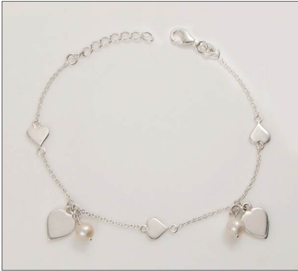
BR108413S7HINPSL WT: 0.34/3.26 gm