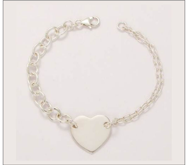
BR107398S7HISL WT: 9.65 gm