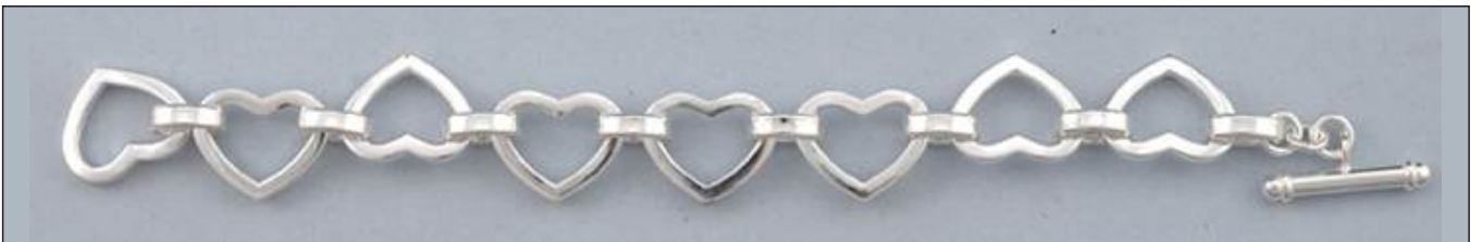
JB106171S8INSL WT: 13.5 gm