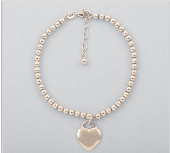
JB106827S8HIRH WT: 8.35 gm