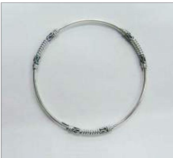
BG111058D61MAT WT: 5.8 gm