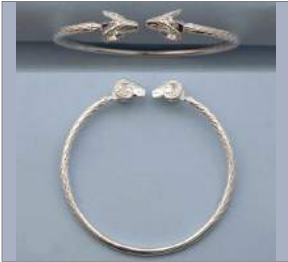
JBN110429D70MSL WT: 27.41 gm