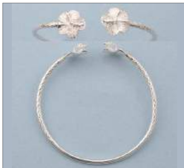
JBN110369D64MSL WT: 18.25 gm