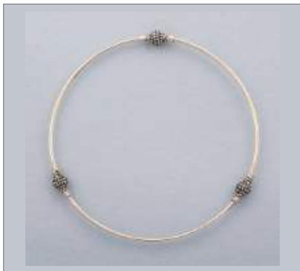
JBN110675D65MAT WT: 4.6 gm