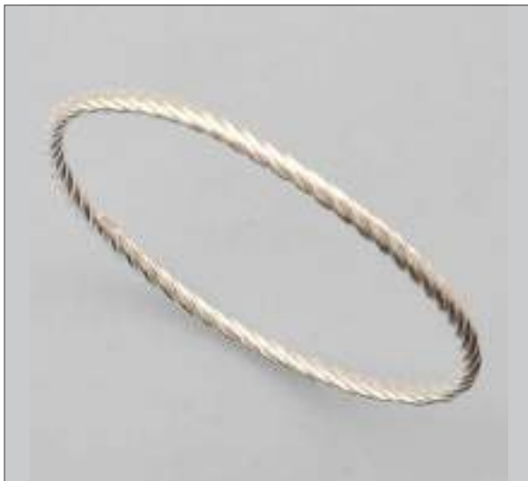
AF9265D60MSL WT: 11.65 gm