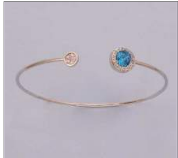
JBN110613D62MM1RH WT: 0.42/3.73 gm