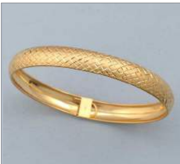
AF91643T WT: 6.05 gm