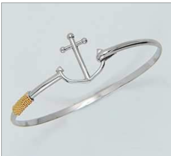
JBN110553D45X60M2T WT: 6.7 gm