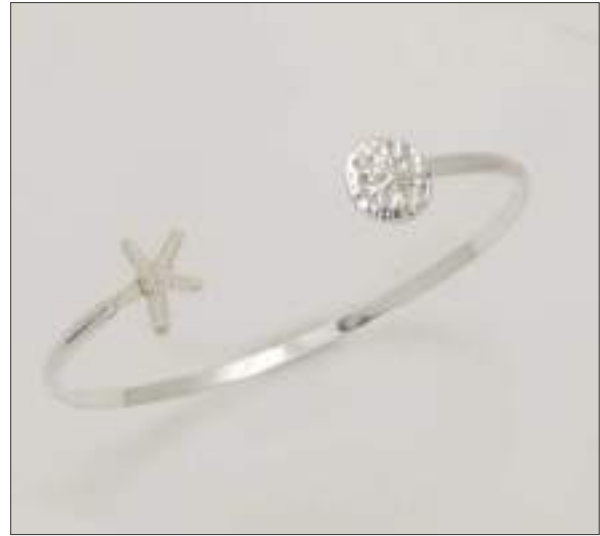
BG110992SL WT: 7.5 gm