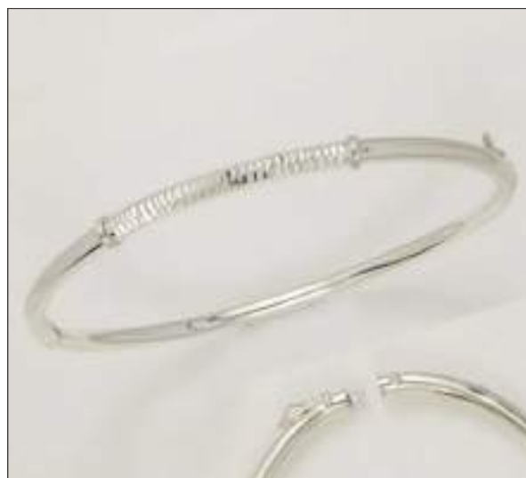
AF9329DC WT: 6.2 gm