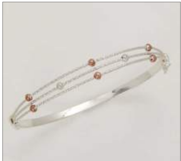
AFBG93273T WT: 6.5 gm