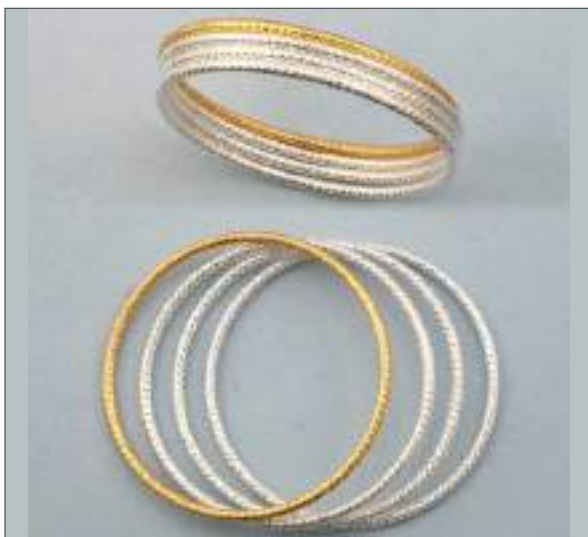
JBN110454D66M3T WT: 20.25 gm