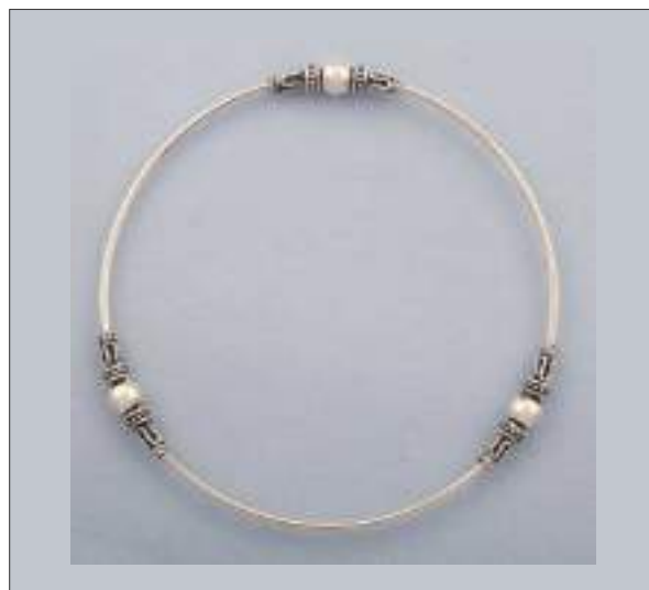
JBN110674D65MAT WT: 5 gm