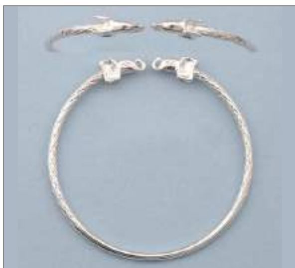
JBN110373D64MSL WT: 16.3 gm