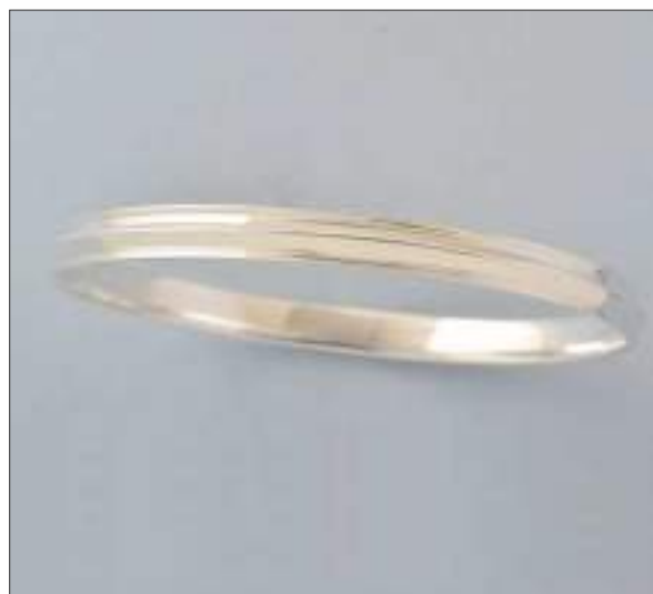
JBN110779D75MSL WT: 28.1 gm