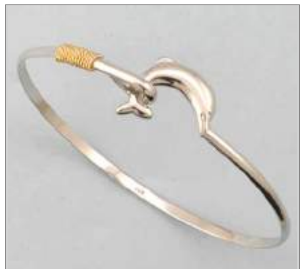
JBN110554D40X52M2T WT: 6.2 gm