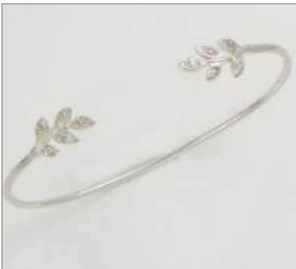
BG110958D51X60A18S WT: 0.05/3.55 gm