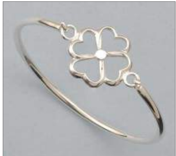
JBN110504D60MSL WT: 7.75 gm