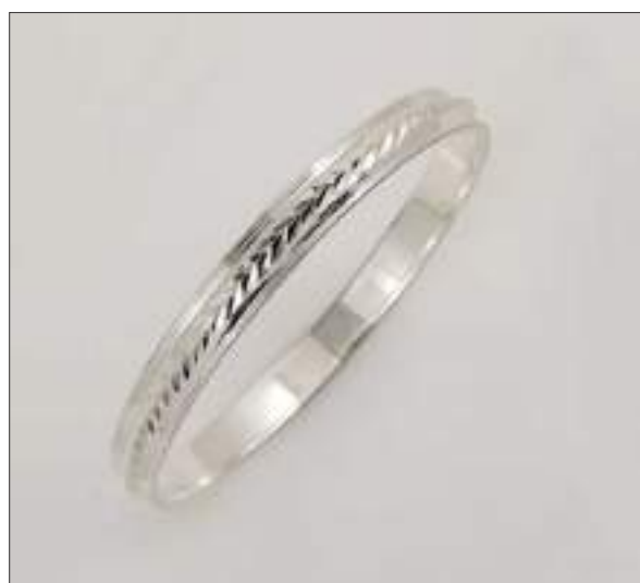
BG110847D60HMDC WT: 24.7 gm