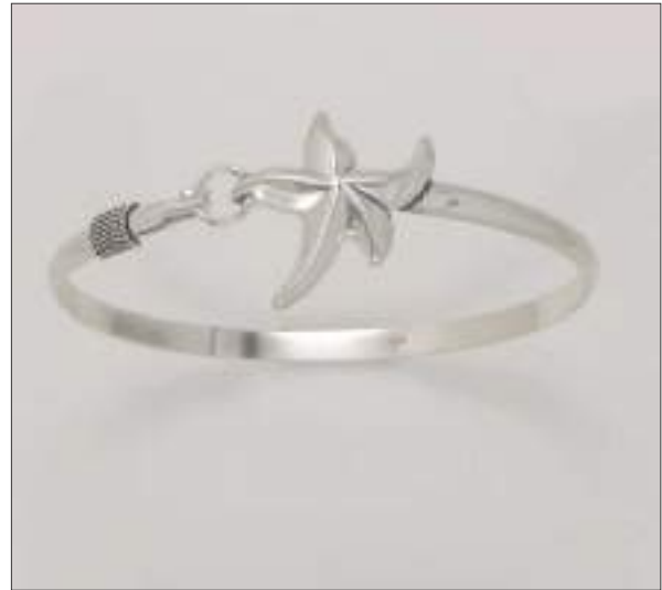
BG110991SL WT: 11.7 gm