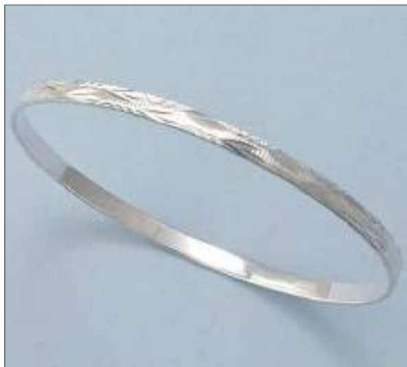
JBN110282D65MDC WT: 8.75 gm