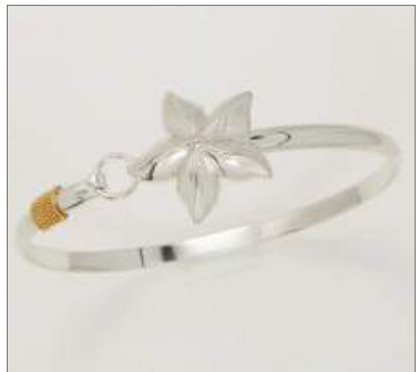
BG1110142T WT: 11.25 gm