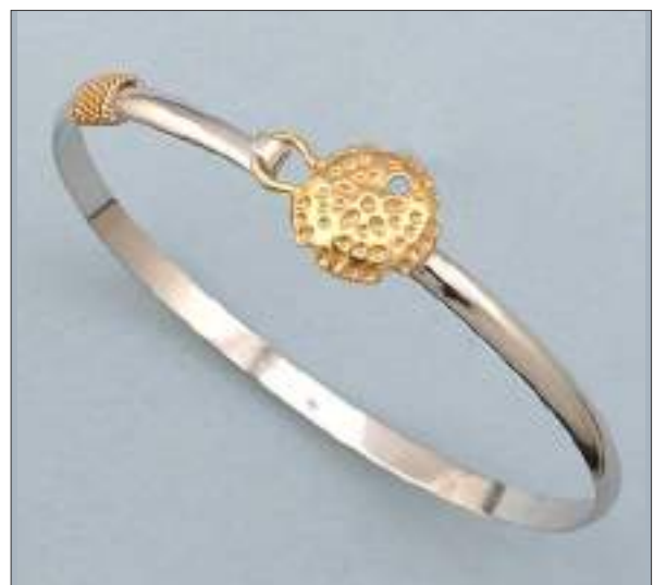
JBN1104382T WT: 9.7 gm