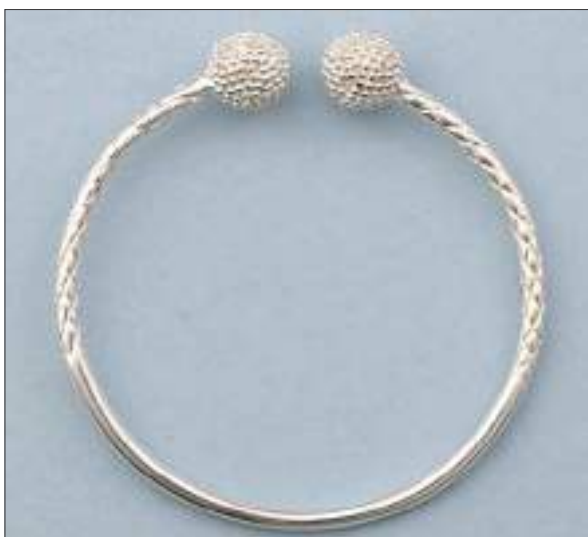
JBN110365D45MSL WT: 12.29 gm