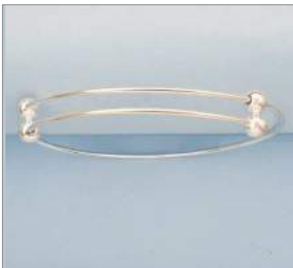
JBN110713D64MSL WT: 6.4 gm