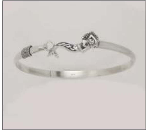
BG110989AT WT: 10.7 gm