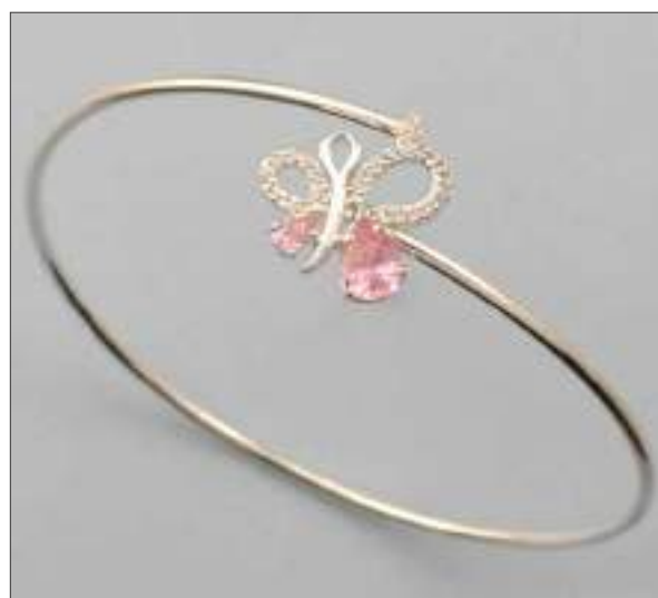
JBN110569D66MM1SL WT: 0.51/5.84 gm