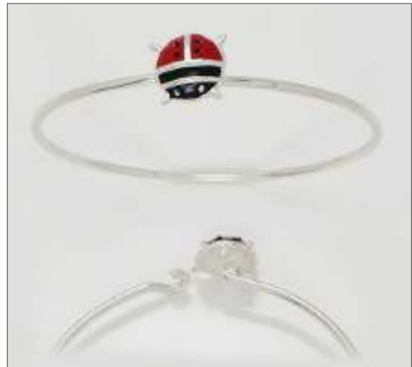
BG110892D45MEN WT: 3.65 gm