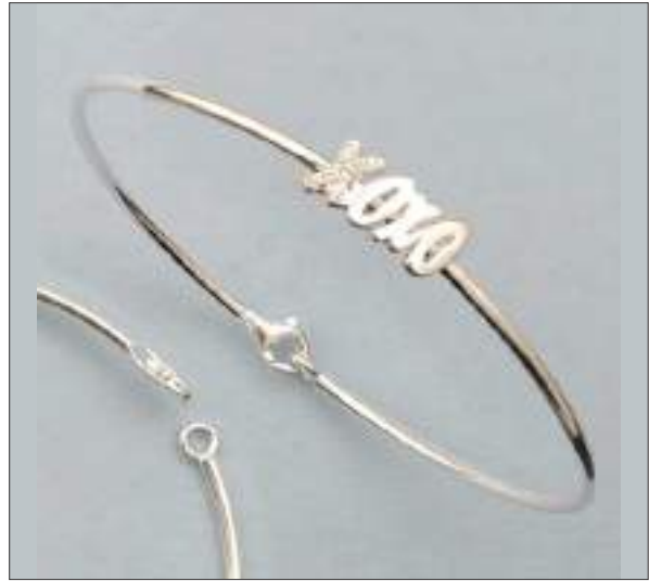
LZJBN110516D65A18S WT: 0.04/4.66 gm