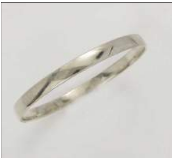
BG110964D63MSL WT: 7.7 gm