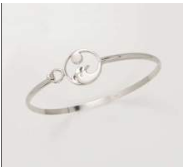
BG110980RH WT: 8.05 gm