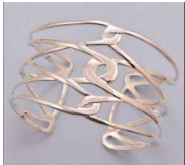
JBN110605D54X65MSL WT: 30.25 gm