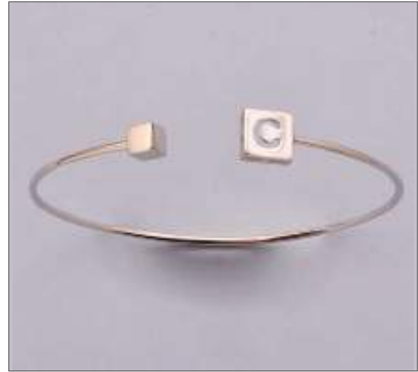
JBN110611D62MRH WT: 3.75 gm