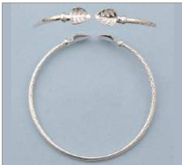
JBN110370D59MSL WT: 11 gm