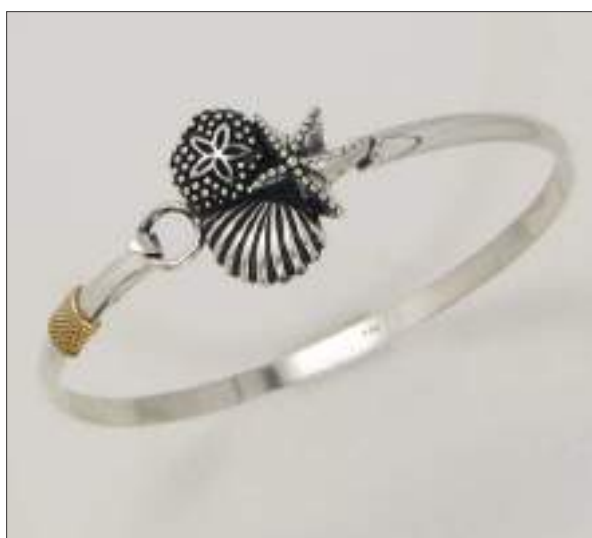
BG1110073T WT: 13.25 gm