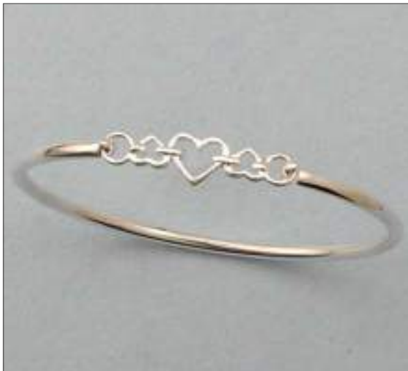
JBN110503D60MSL WT: 6.4 gm