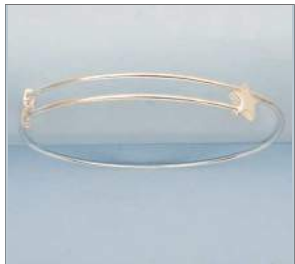
JBN110714D64MSL WT: 6.85 gm