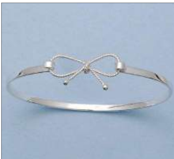
JBN110385SL WT: 6.45 gm