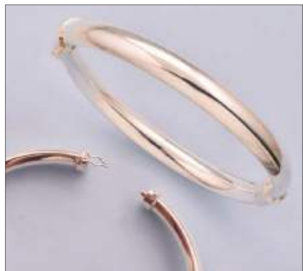
JBN110622D65MSL WT: 26.37 gm