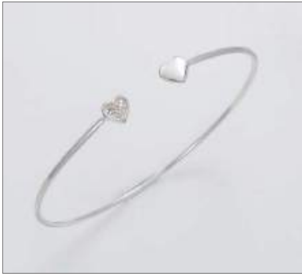
BG110873D62MA18SL WT: 0.02/2.68 gm