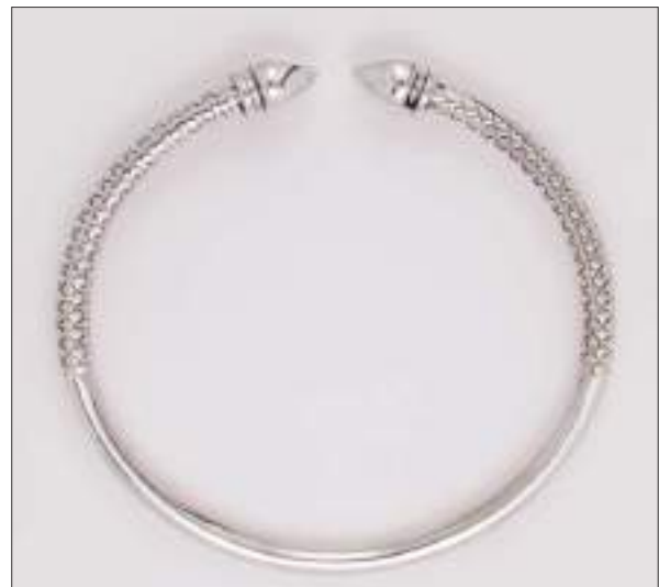
BG110938D69MSL WT: 38 gm