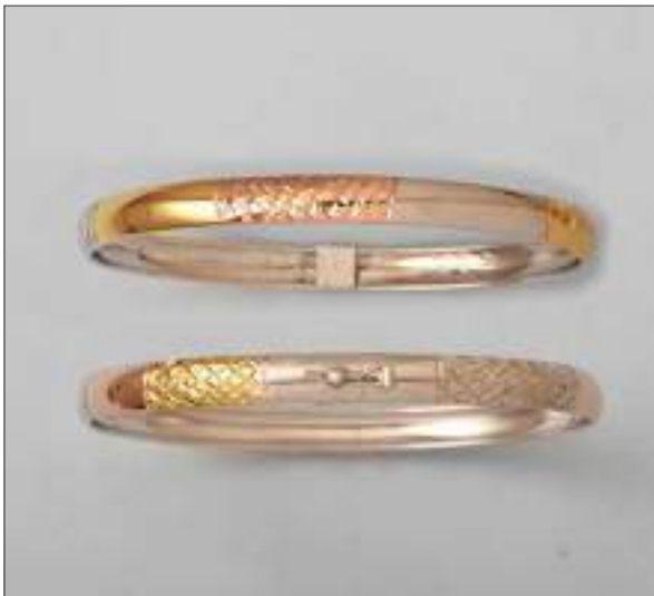
AF9290MF WT: 5.2 gm