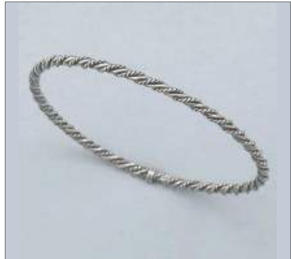
JBN110452D65MAT WT: 10.35 gm