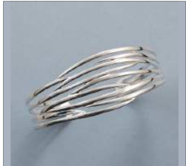
JBN110599SL WT: 21.55 gm