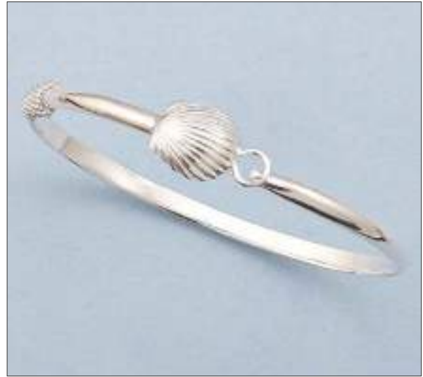
JBN110355SL WT: 12.8 gm