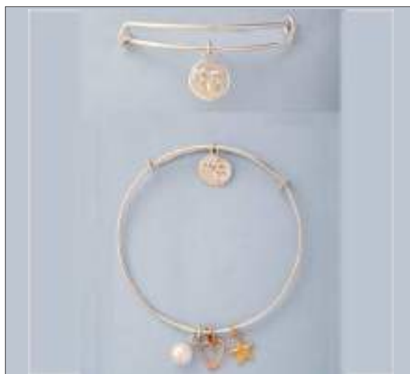
JBN110693D64MM13T WT: 0.74/8.16 gm