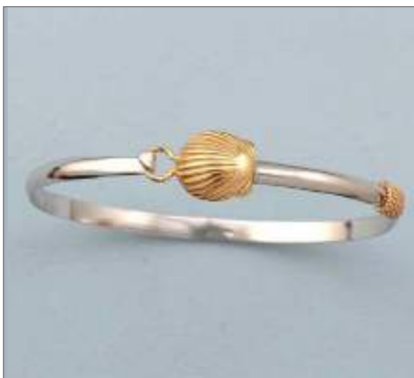
JBN1104372T WT: 9.4 gm