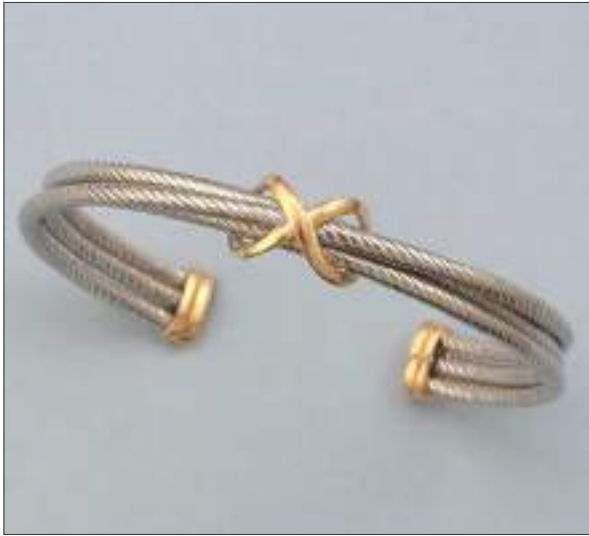
AF9204D66M2T WT: 13 gm