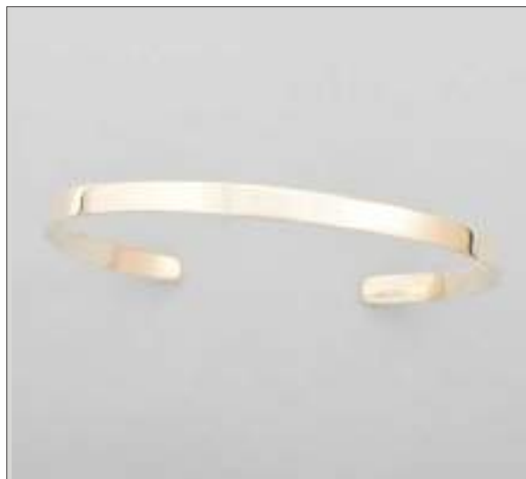
JBN110759SL WT: 11.62 gm