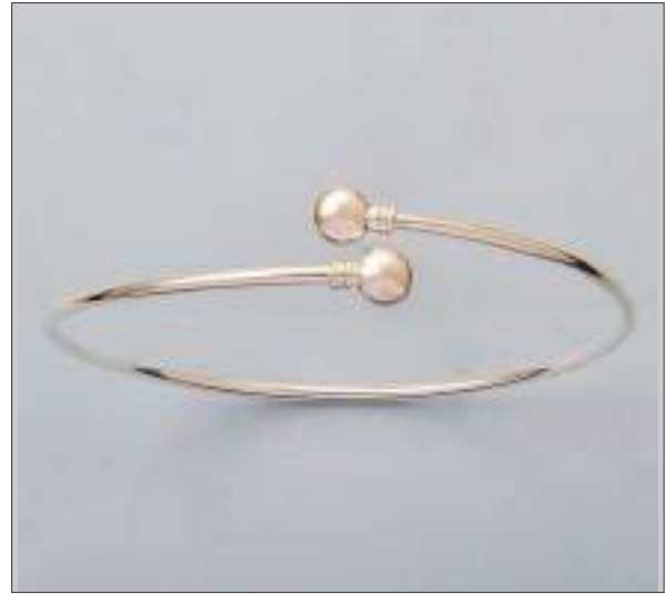
JBN110706D65MSL WT: 8.05 gm