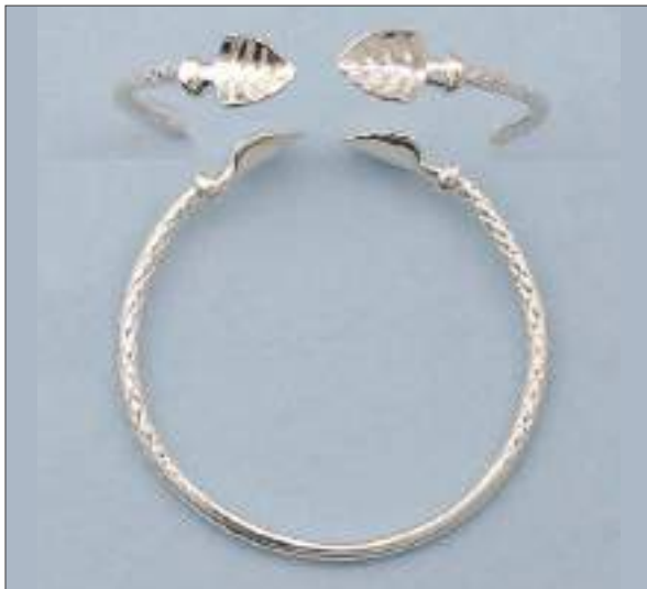
JBN110378D45MSL WT: 7.9 gm