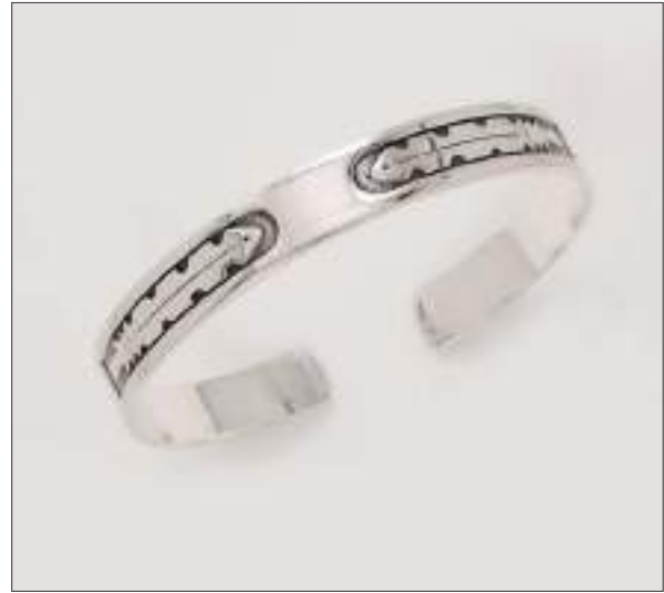
BG111051D62MAT WT: 27.45 gm