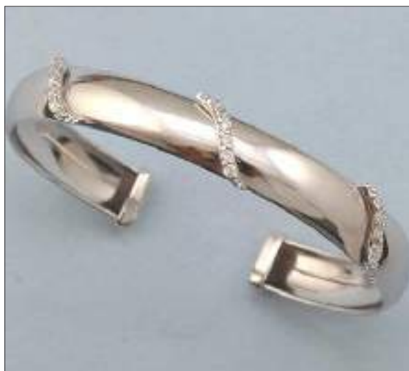
AF9200A18RNP WT: 0.17/6.18 gm