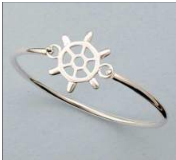
JBN110509D60MSL WT: 10.3 gm