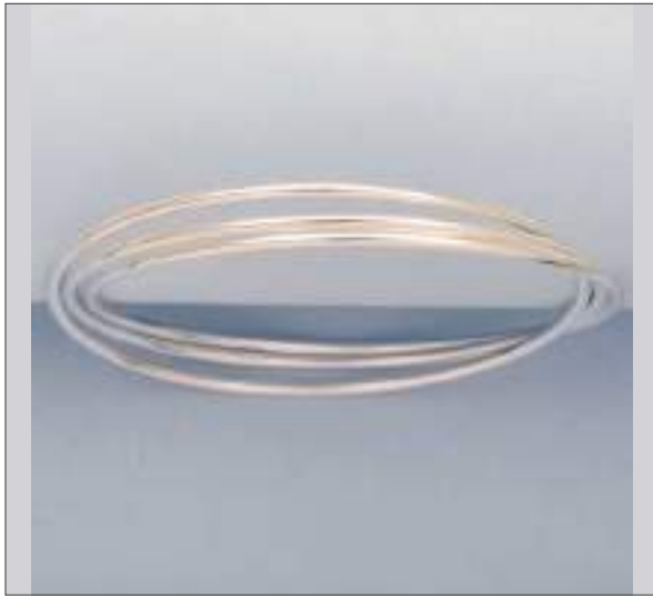
AF9292D63MSL WT: 8.2 gm