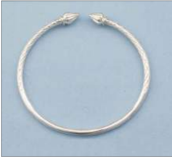
JBN110335D70MSL WT: 26.65 gm