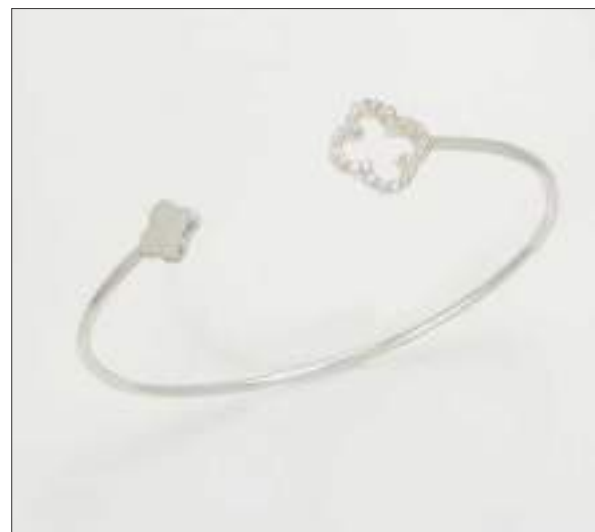
BG110946D51X60A18S WT: 0.10/3.10 gm