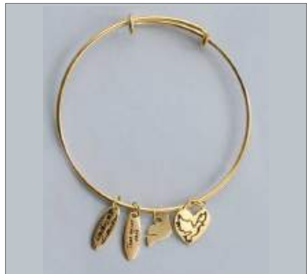
JBN110598D65M2T WT: 12.45 gm