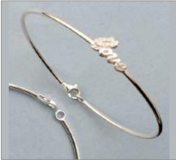
LZJBN110514D65A18S WT: 0.05/4.55 gm