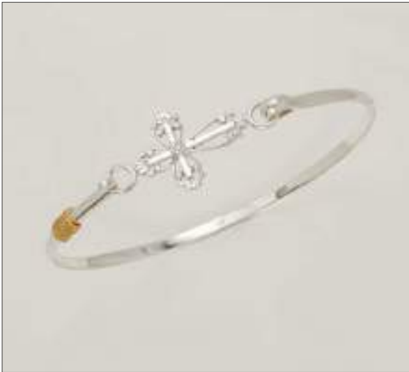
BG111043G182T WT: 7.35 gm