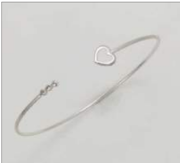
BG110886D62MA18SL WT: 0.02/2.38 gm