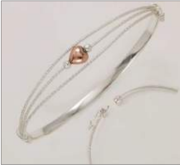
AFBG93383T WT: 6.25 gm