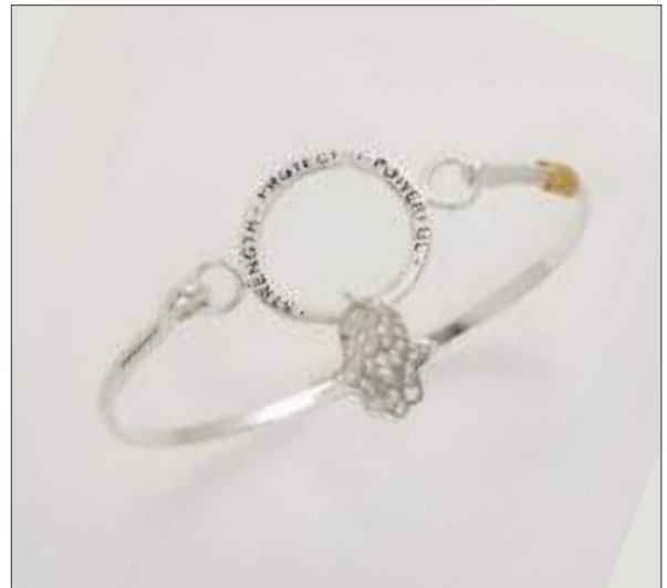
BG1110503T WT: 9.05 gm