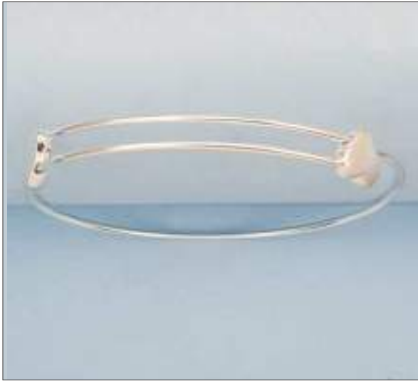
JBN110715D64MSL WT: 8.35 gm