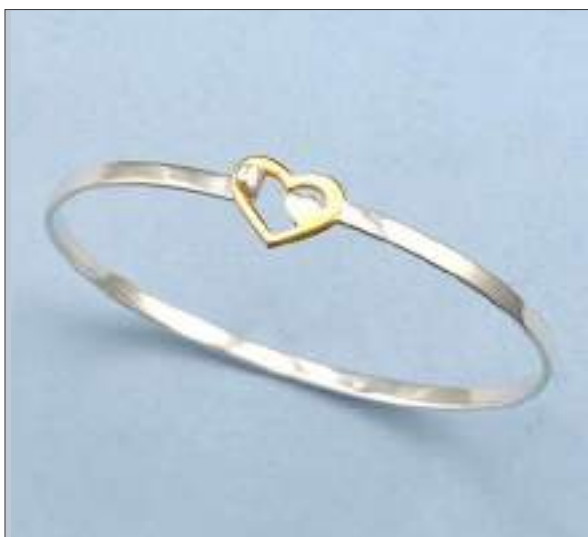
JBN1102732T WT: 5.75 gm