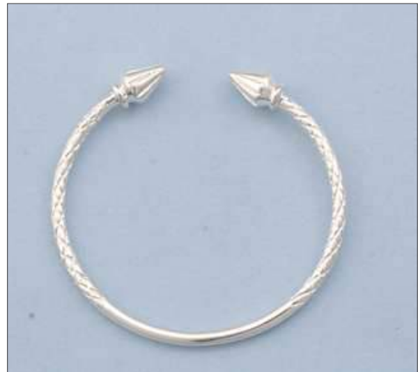
JBN110332D45MSL WT: 10 gm