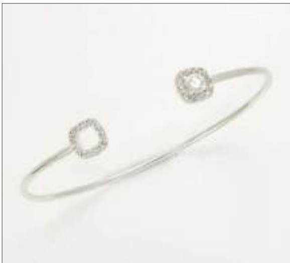
BG110951D51X60A18S WT: 0.27/3.23 gm