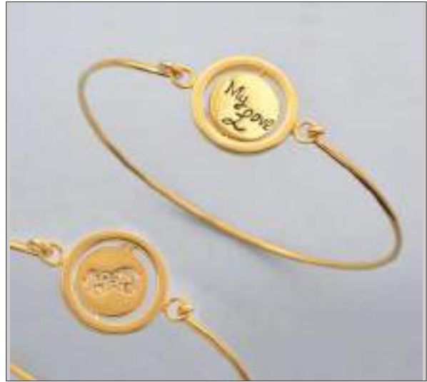
JBN110630D62MA182T WT: 0.06/7.74 gm