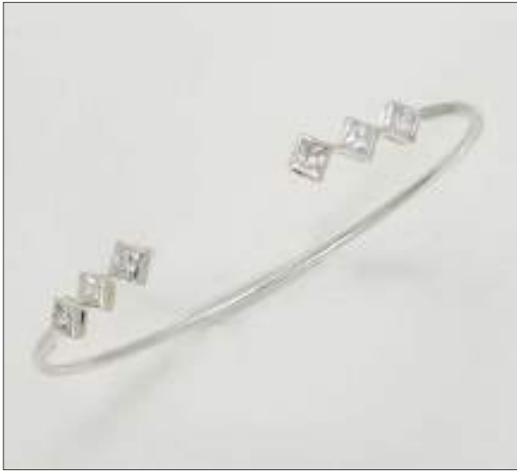
BG110960D51X60A18S WT: 0.68/2.62 gm