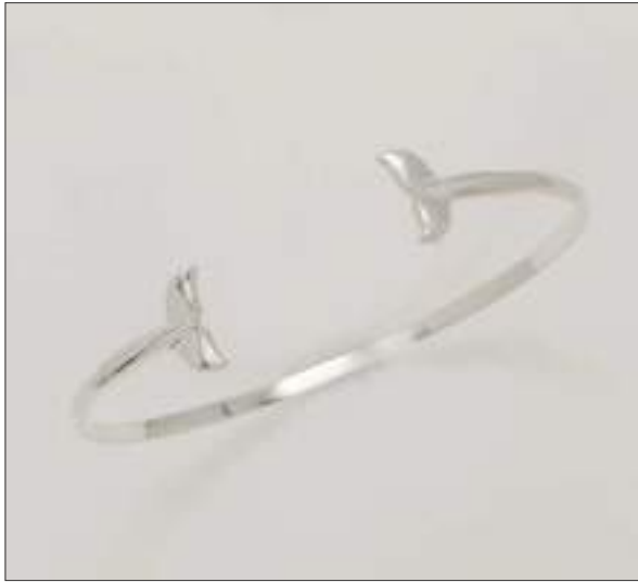
BG110987SL WT: 7.35 gm