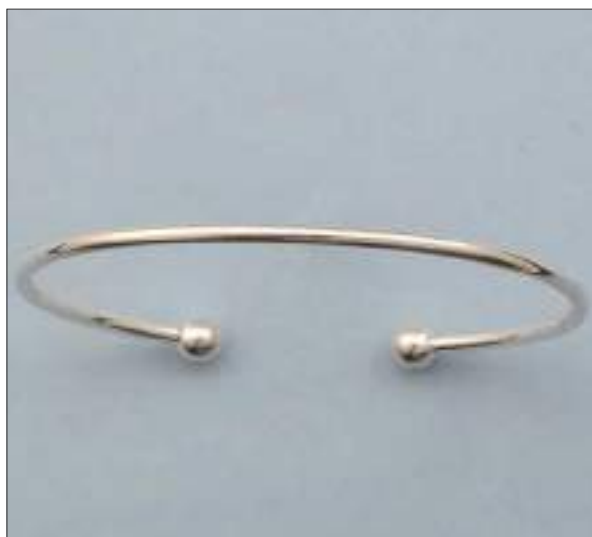
JBN110463D52X63MSL WT: 9.6 gm