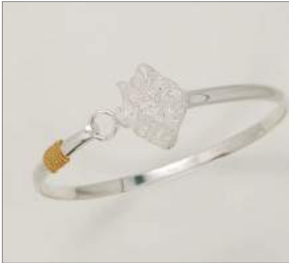
BG1110113T WT: 11.5 gm