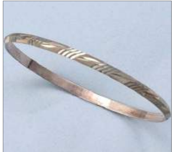
JBN110229D66MDC WT: 9.9 gm