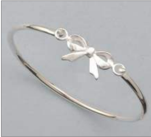
JBN110501D60MSL WT: 7.3 gm