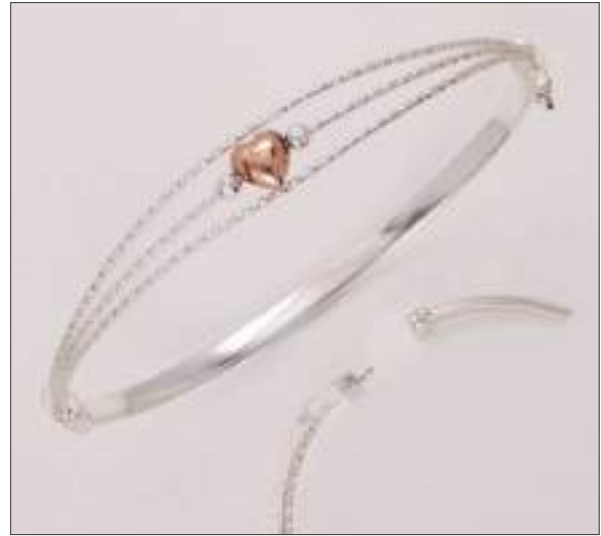
AFBG93393T WT: 6.25 gm