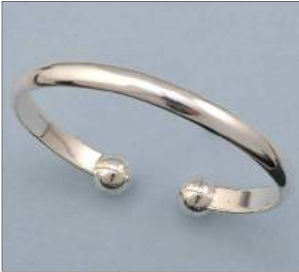
JBN110347SL WT: 31.2 gm