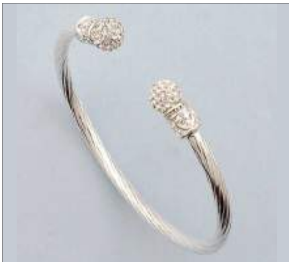
URAF9242SL WT: 10.85 gm