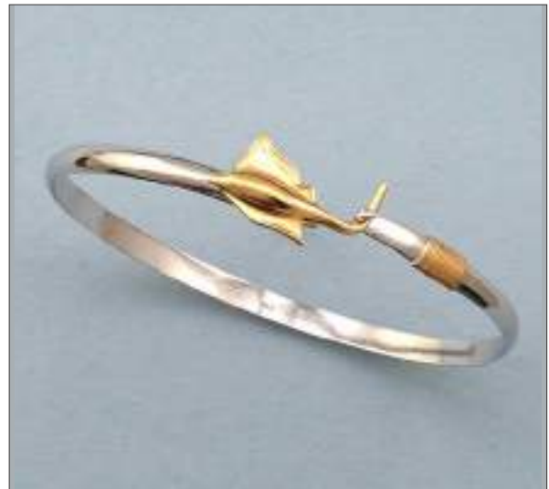
JBN1104462T WT: 9.2 gm