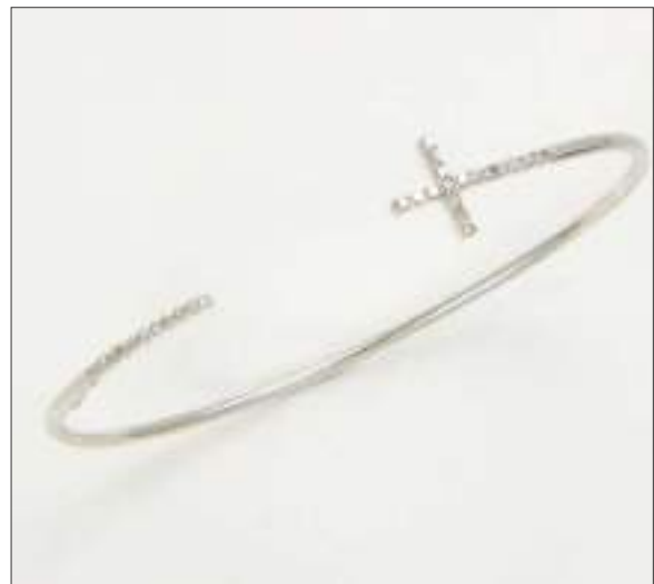
BG110953D51X60A18S WT: 0.11/2.44 gm