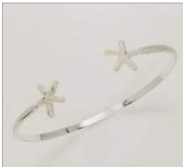
BG111000SL WT: 7.25 gm