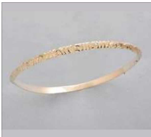
JBN110685D66MDC WT: 9.4 gm