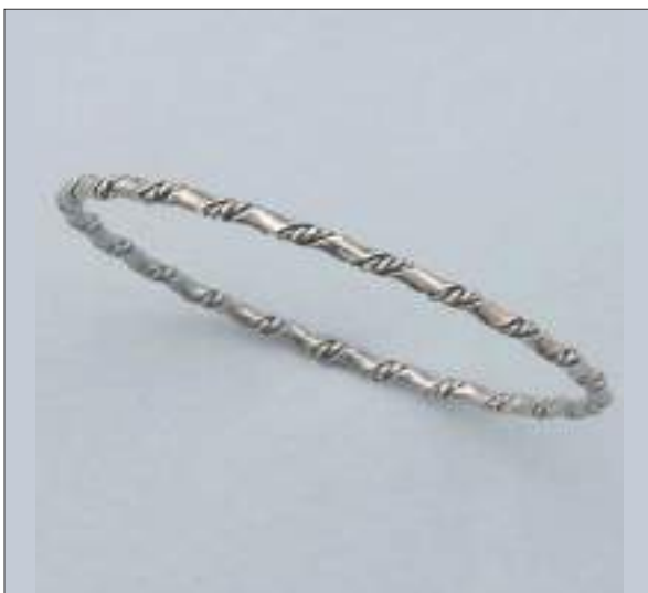
JBN110451D65MAT WT: 9.3 gm