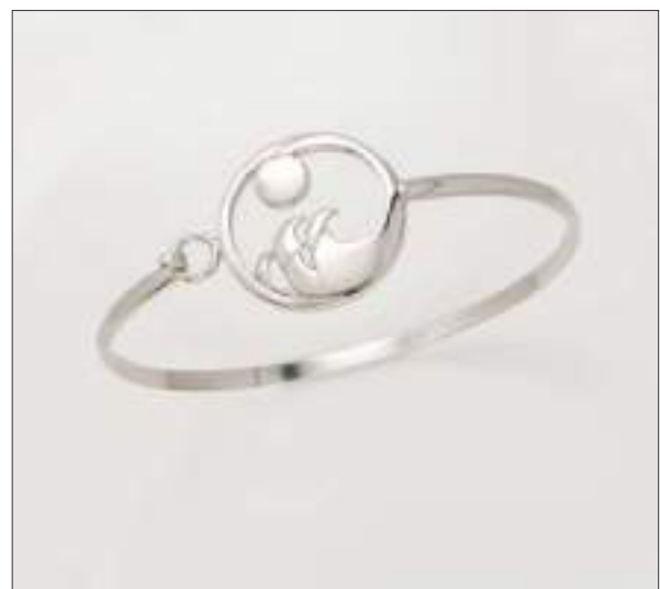
BG110981RH WT: 9.9 gm