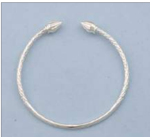
JBN110333D59MSL WT: 12.25 gm