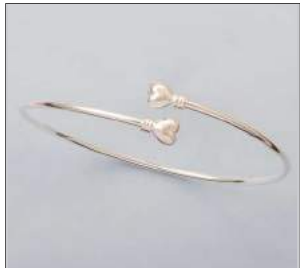
JBN110711D65MSL WT: 7.7 gm