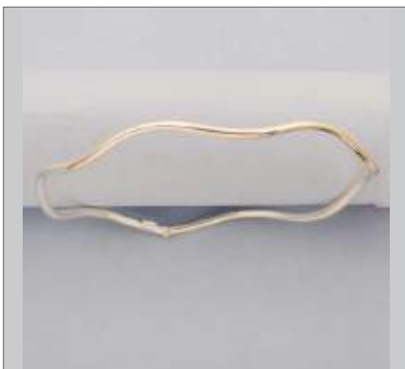
AF9294D61MSL WT: 2.95 gm