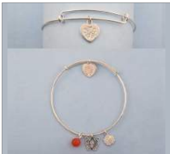
JBN110663D64MM12T WT: 0.69/9.31 gm