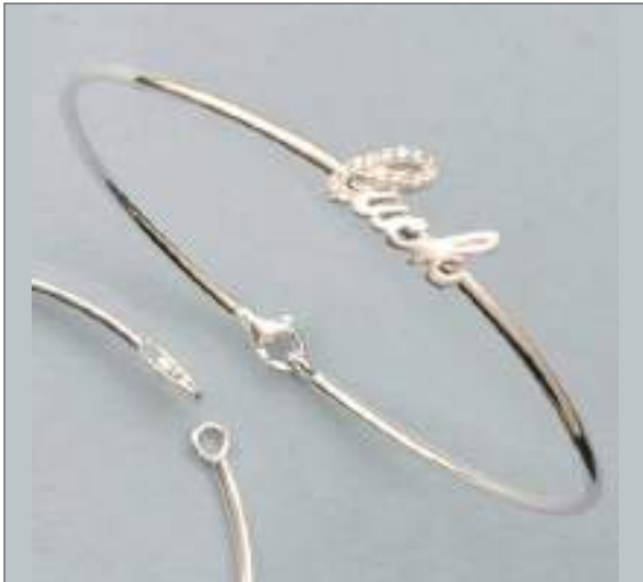
LZJBN110517D65A18S WT: 0.06/4.14 gm