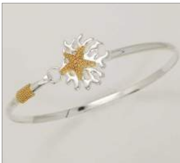
BG1110052T WT: 8.55 gm