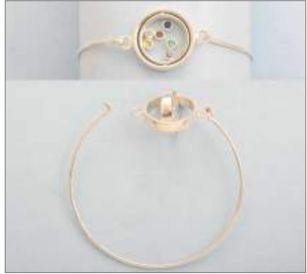
JBN110696D62MM1SL WT: 1.15/10.5 gm