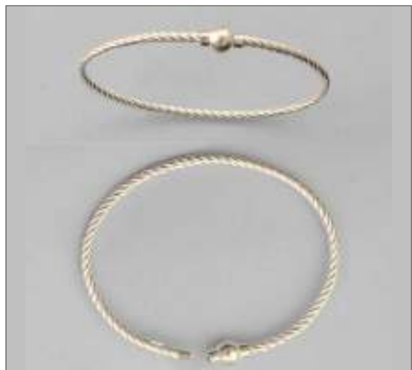
AF9264SL WT: 10.9 gm