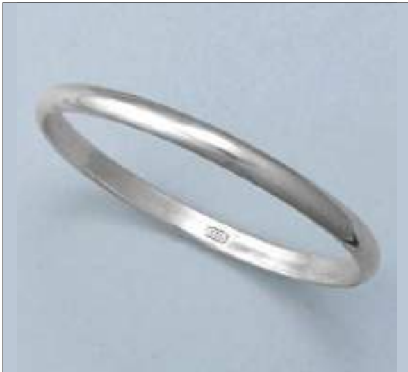
JBN110247D62MSL WT: 8 gm