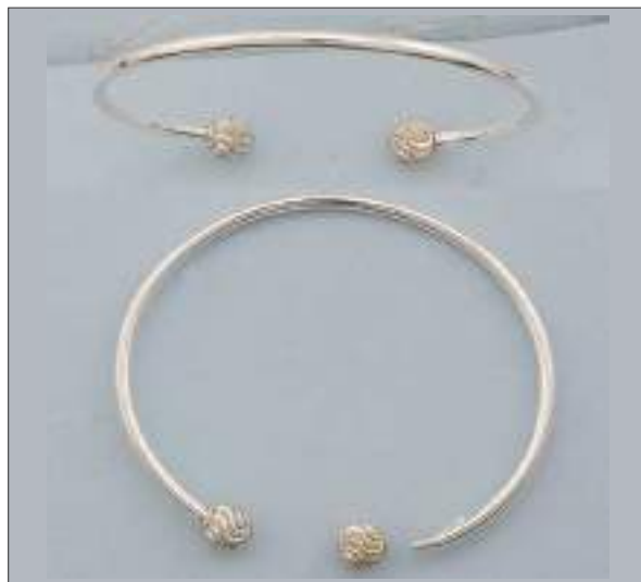
JBN1104803T WT: 4.2 gm