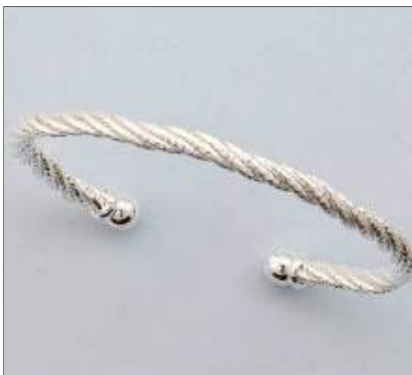
AF9239SL WT: 12 gm