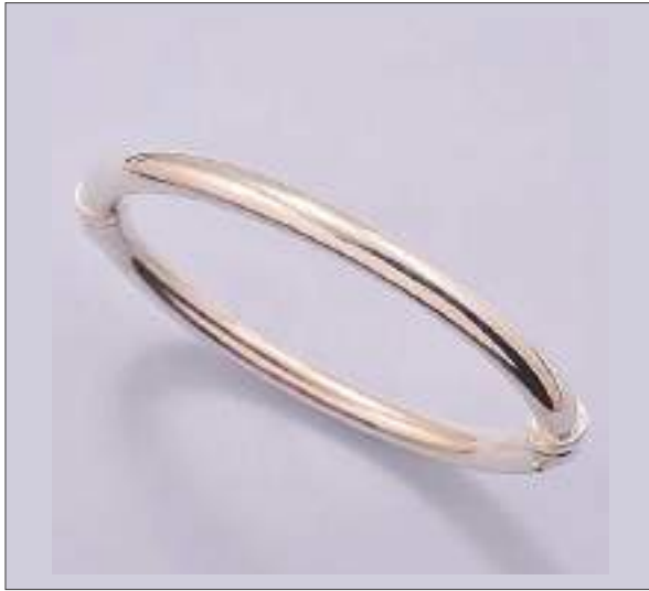
AF9270SL WT: 16 gm