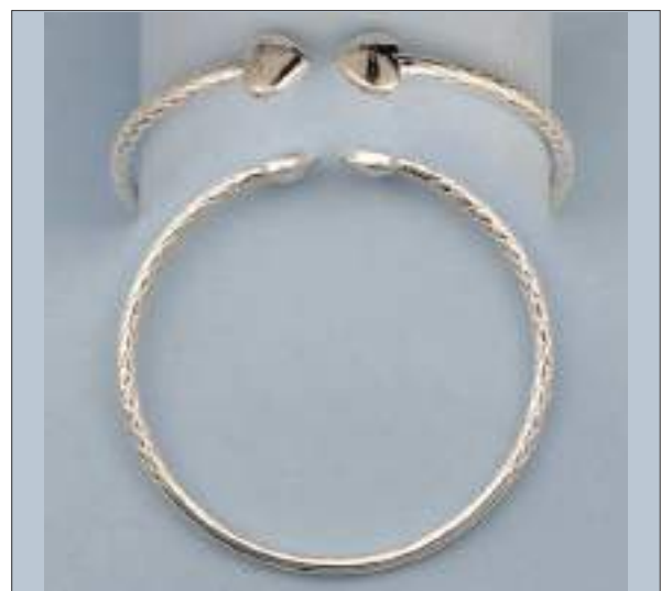
JBN110415D70MSL WT: 28.92 gm