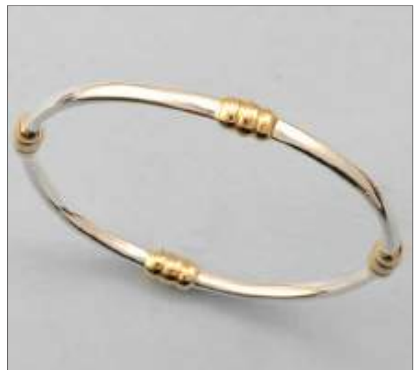
JBN110576D60M2T WT: 21.5 gm