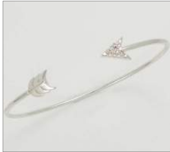
BG110955D51X60A18S WT: 0.06/3.14 gm