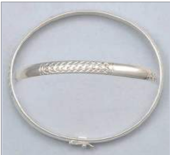
AF9006DC WT: 4.6 gm