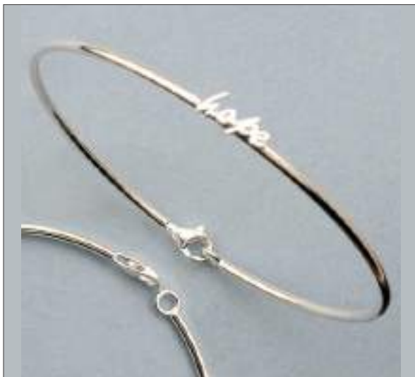
LZJBN110512D65MSL WT: 3.9 gm