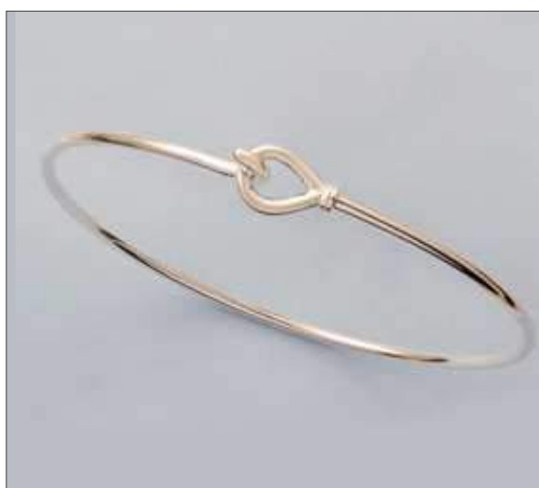
JBN110698D66MSL WT: 4.55 gm