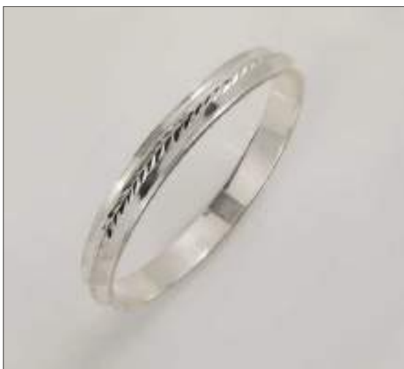
BG110847D51MDC WT: 21.9 gm