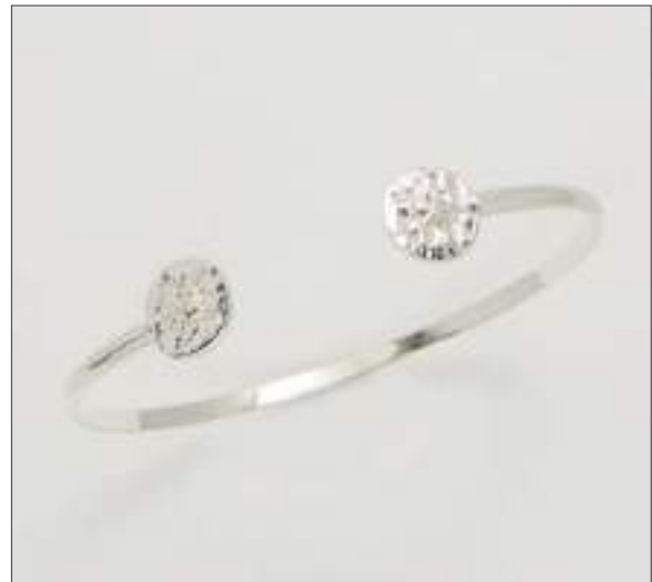
BG110995SL WT: 8.05 gm