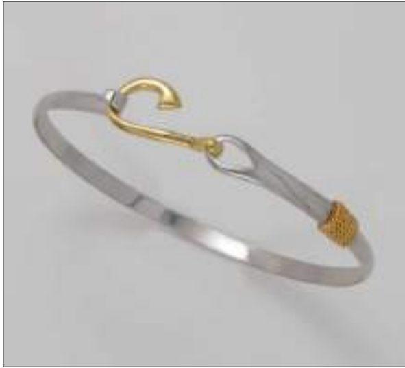
BG110877D52X64M2T WT: 9.85 gm