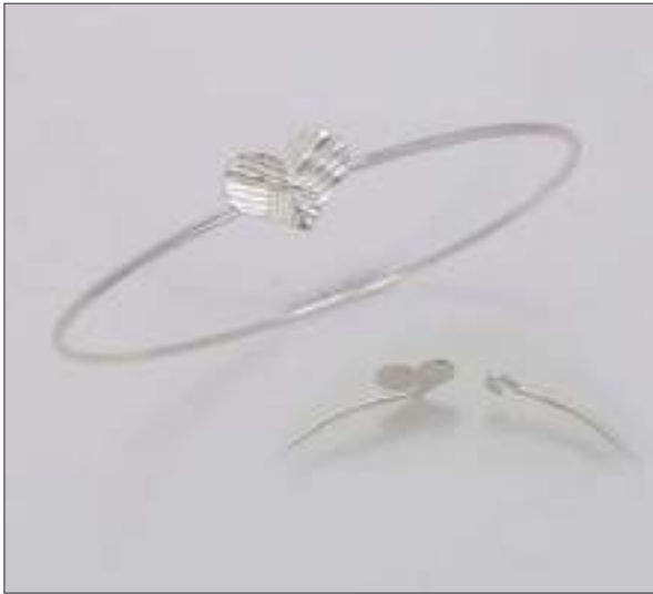
BG110888D65MDC WT: 4.55 gm