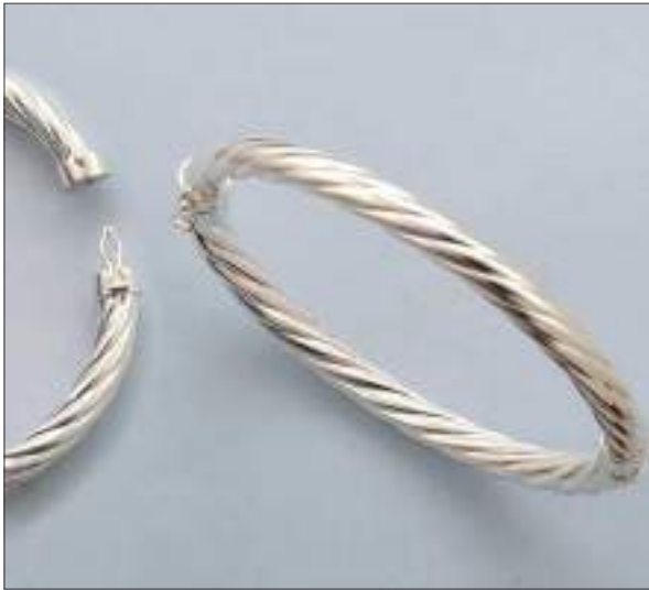
AF9266UF WT: 15.05 gm