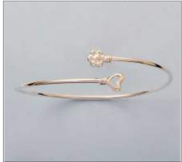
JBN110708D65MSL WT: 7.45 gm