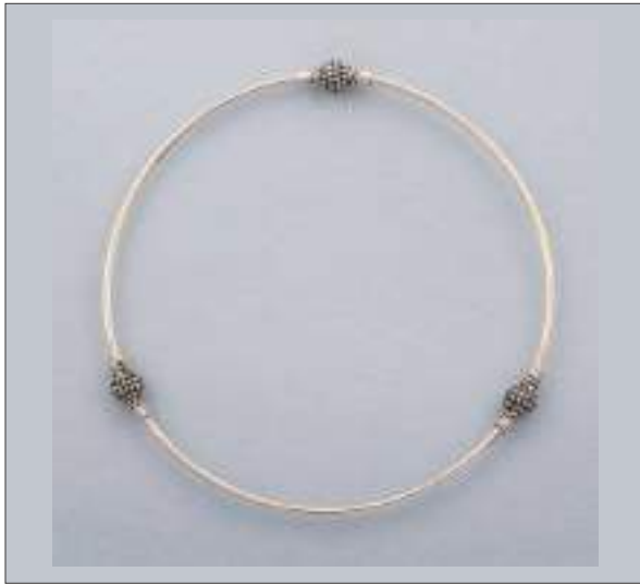
JBN110675D65MAT WT: 4.6 gm