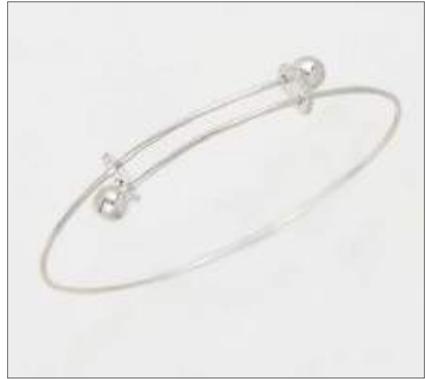
JBN110689D65MSL WT: 4.86 gm