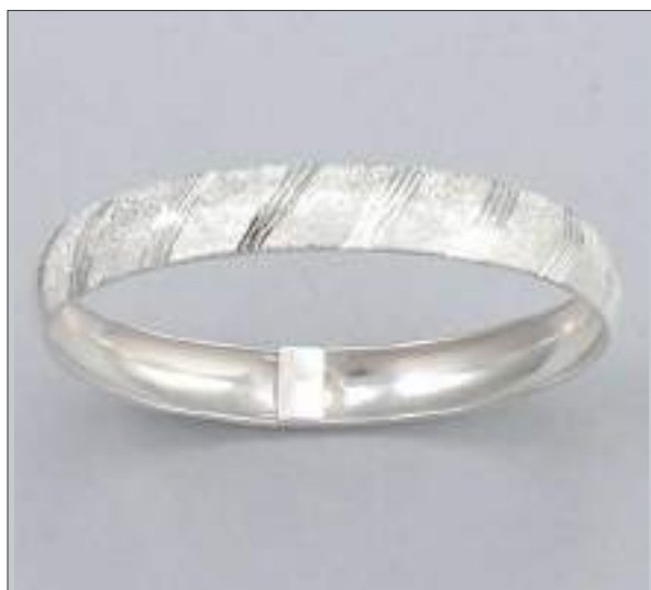
0000 WT: 0 gm