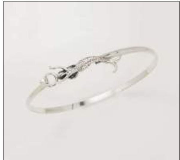
BG110979AT WT: 8.05 gm