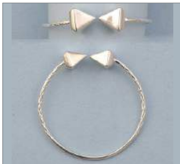
JBN110417D38MSL WT: 5.45 gm