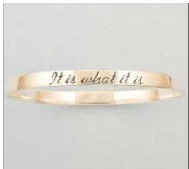
JBN110751D60MEN WT: 12.9 gm