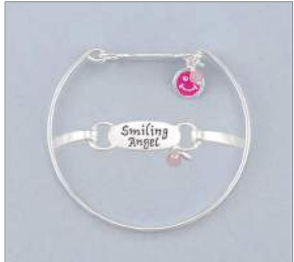
JBN11003069DPEN WT: 0.05/6.51 gm