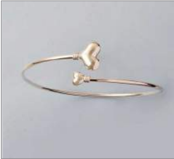
JBN110704D65MSL WT: 8.4 gm