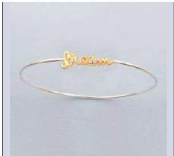
JBN110671D65M2T WT: 3 gm