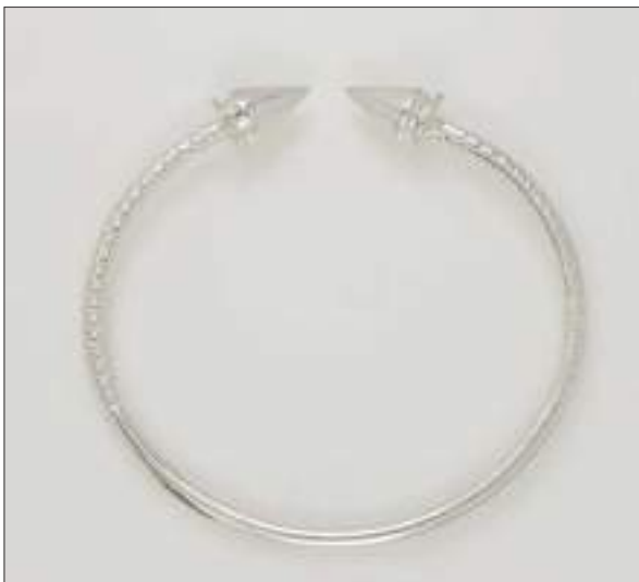
BG110938D66MSL WT: 36.2 gm