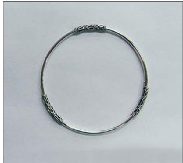
BG111059D61MAT WT: 5.13 gm