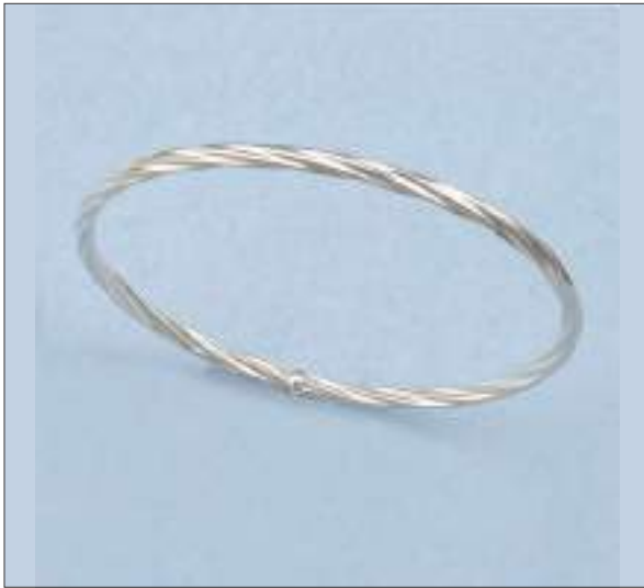
JBN110252D66MSL WT: 4.2 gm