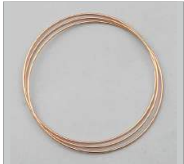
JBN110549D57MRG WT: 2.35 gm