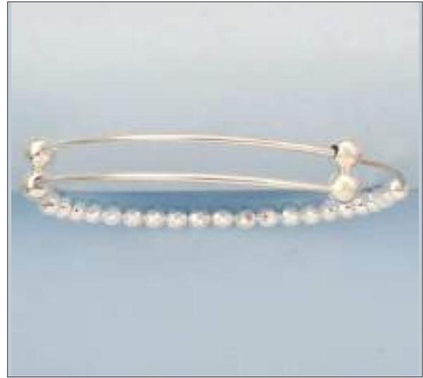
JBN110716D64MDC WT: 9.5 gm