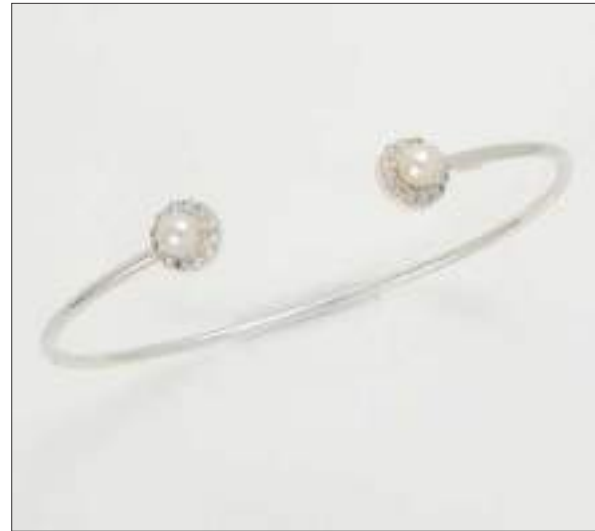
BG110942D51X60M1S WT: 0.32/3.08 gm