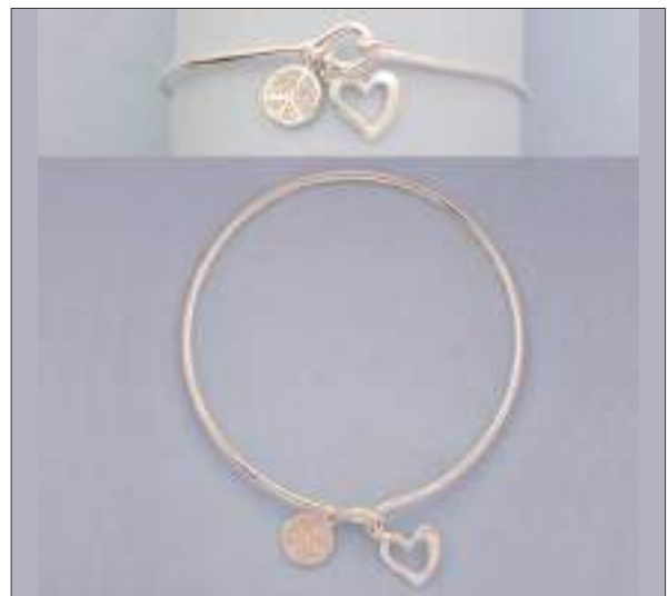
JBN110648D66MA18SL WT: 0.06/6.09 gm