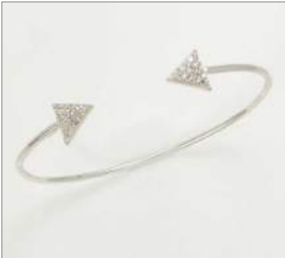
BG110943D51X60A18S WT: 0.18/3.32 gm