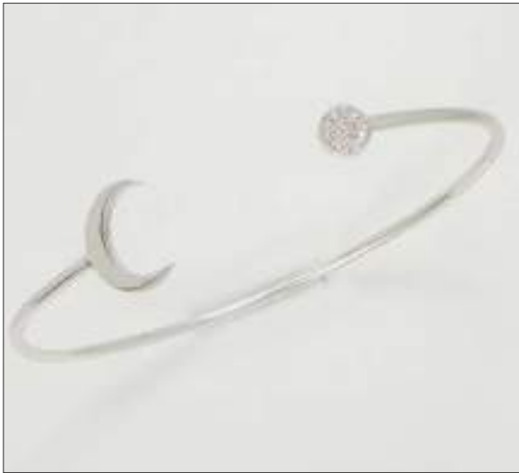
BG110954D51X60A18S WT: 0.06/3.14 gm