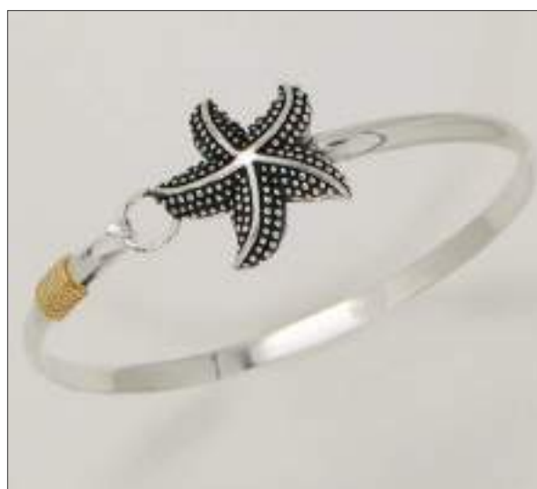
BG1110083T WT: 12.85 gm