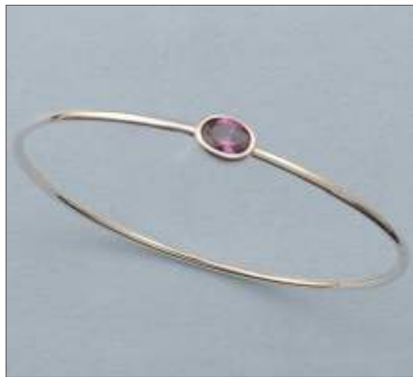
JBN110390D61MA47SL WT: 0.43/3.64 gm