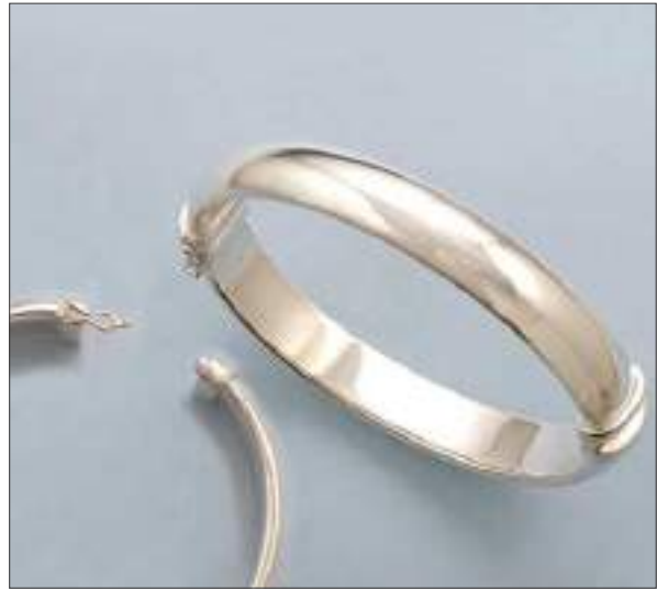
AF9267UF WT: 27.25 gm