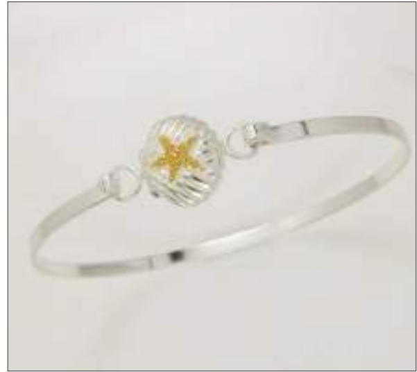
BG1110162T WT: 7.85 gm