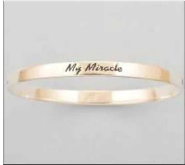
JBN110741D60MEN WT: 15.2 gm