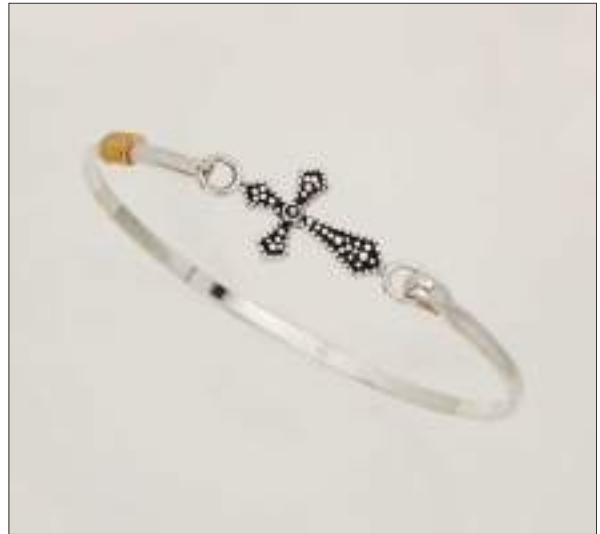
BG1110343T WT: 7.75 gm