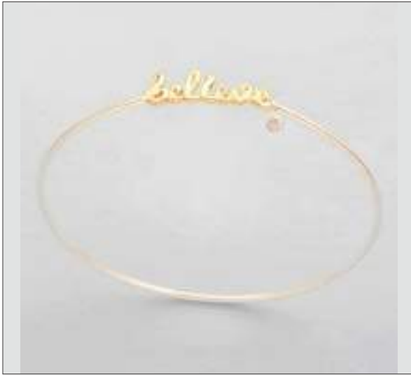
JBN110678D65MA182T WT: 0.04/3.38 gm