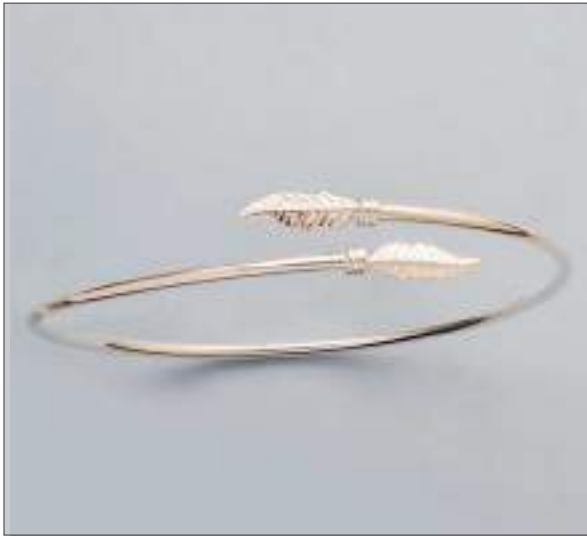
JBN110707D65MSL WT: 7.65 gm