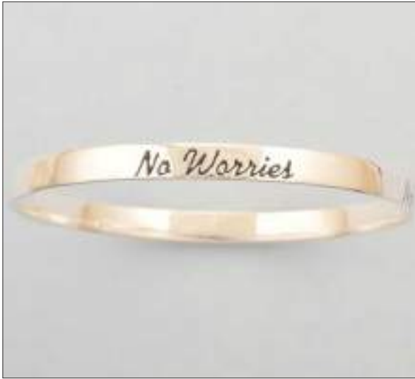
JBN110752D60MEN WT: 15.5 gm