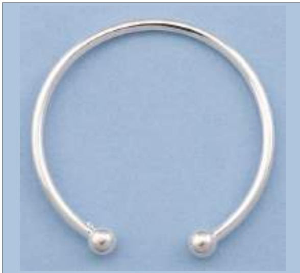
JBN110314D59MSL WT: 6.3 gm