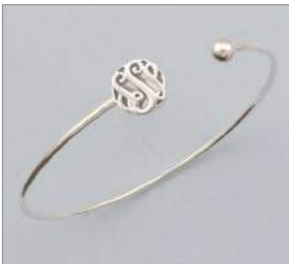
JBN110491D66MAT WT: 4.4 gm