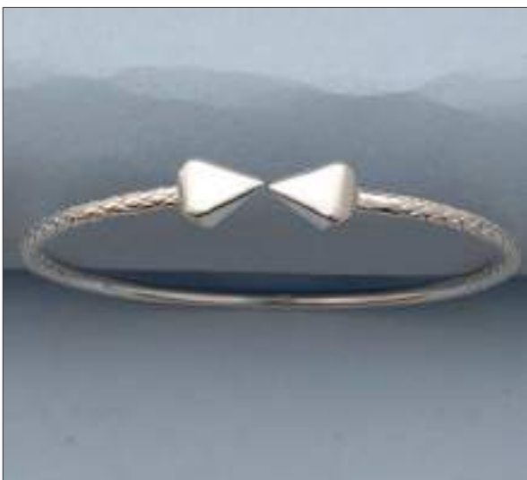
JBN110428D64MSL WT: 17.7 gm