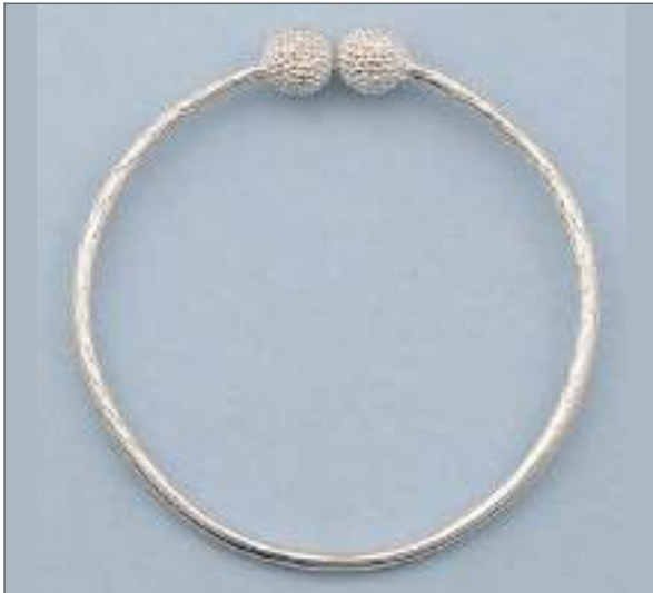
JBN110375D59MSL WT: 18.11 gm