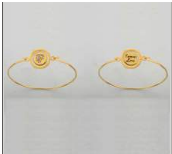
JBN110659D62MA182T WT: 0.04/7.41 gm