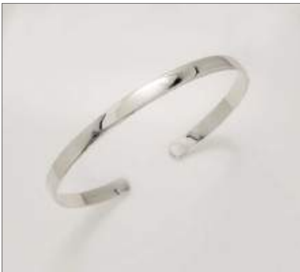
BG110982SL WT: 9.25 gm