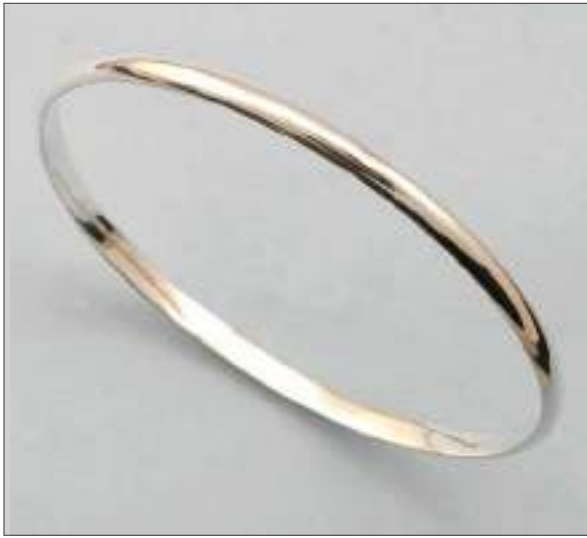
JBN110578D65MSL WT: 12.6 gm