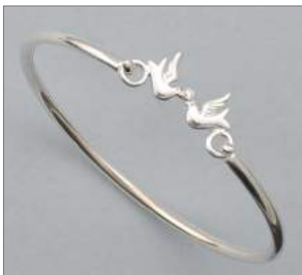
JBN110499D60MA18SL WT: 6.75 gm