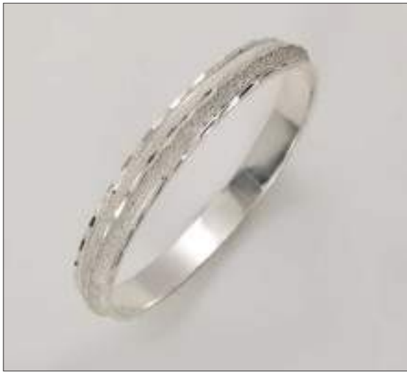
BG110844D51M3T WT: 22.6 gm