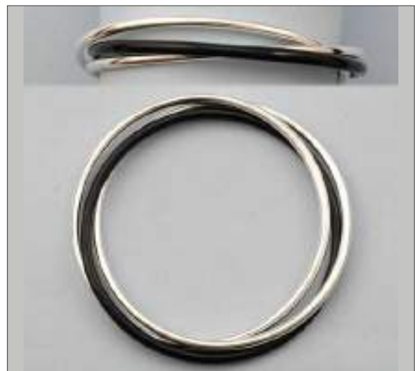
AF9254D65MEN WT: 15 gm