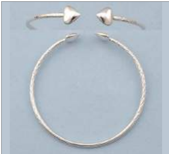
JBN110384D59MSL WT: 12.1 gm