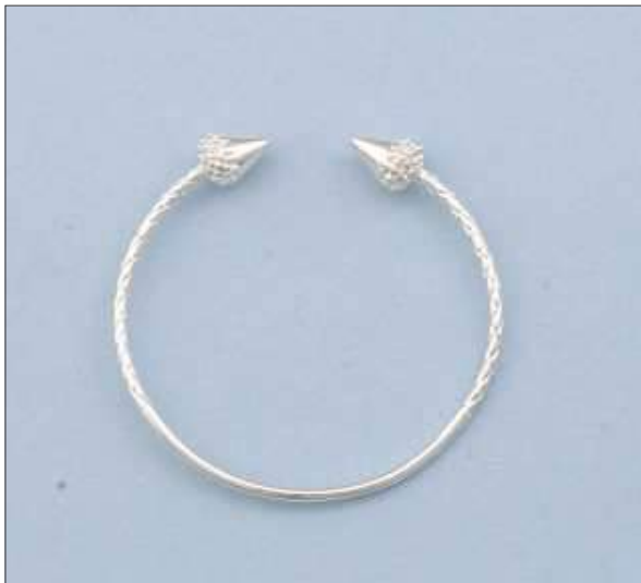
JBN110343D38MSL WT: 4.9 gm