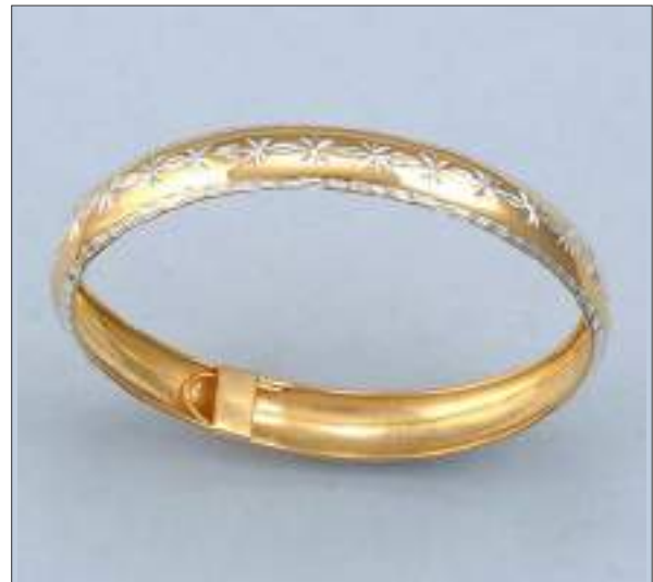
AF91372T WT: 7 gm