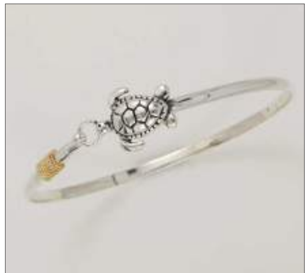
BG1110023T WT: 7.65 gm