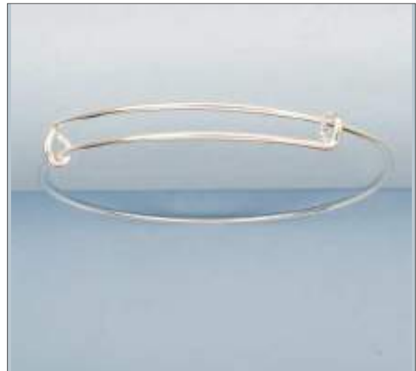
JBN110712D64MSL WT: 5.55 gm