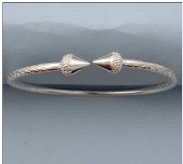
JBN110430D70MSL WT: 27.65 gm