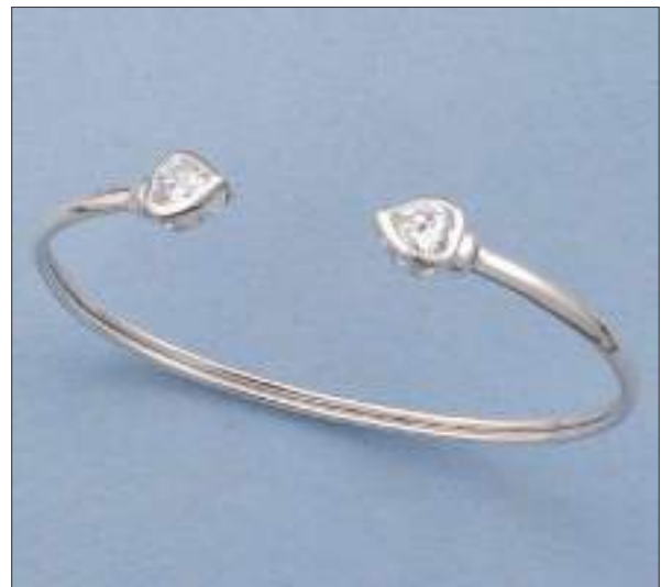
JBN110315A18SL WT: 0.62/4.68 gm