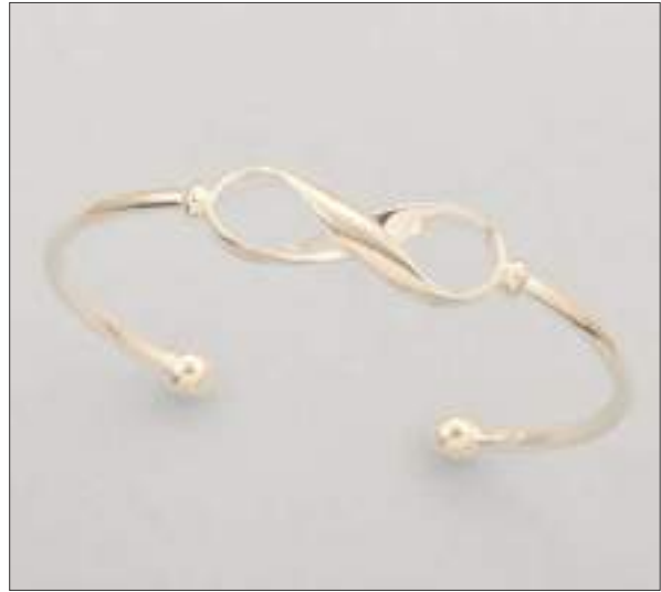
AF9295D44X60MSL WT: 7.5 gm