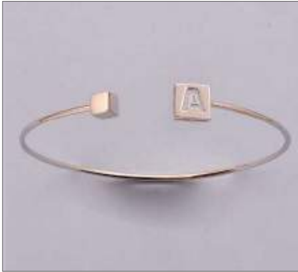
JBN110609D62MRH WT: 3.7 gm