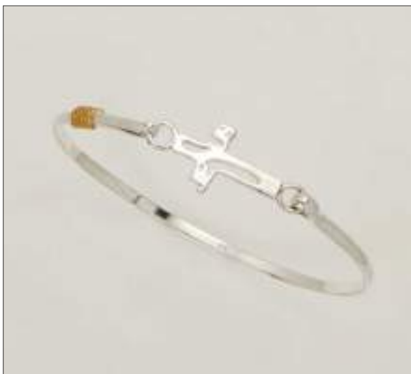
BG1110372T WT: 7.6 gm