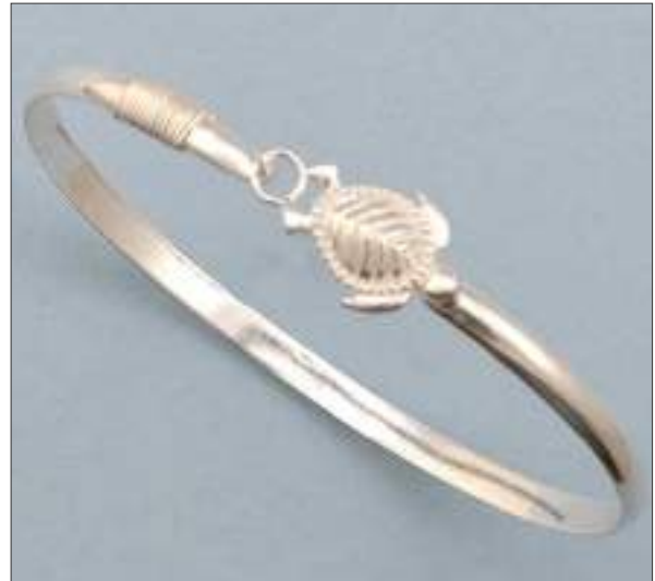
JBN110459S50X65MSL WT: 9.45 gm