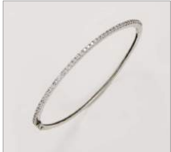
BG111047A18RH WT: 0.6/8.35 gm