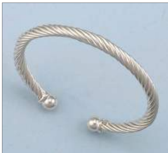
AF9140SL WT: 14.22 gm