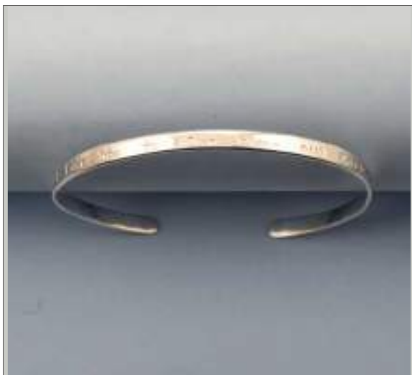
JBN110725D53X60MSL WT: 6.65 gm