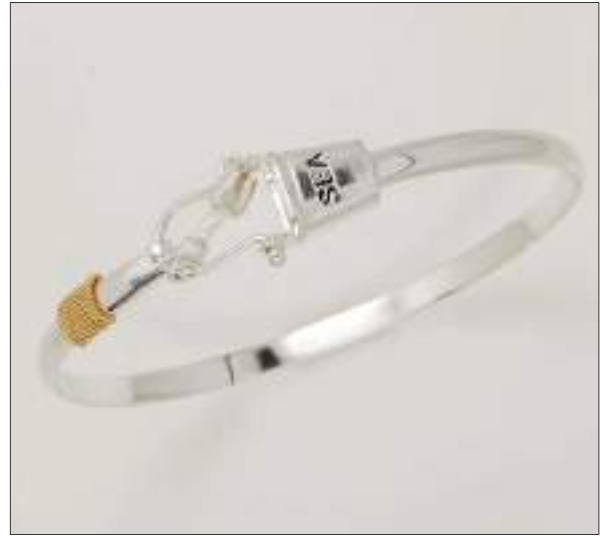
BG1110103T WT: 11.9 gm