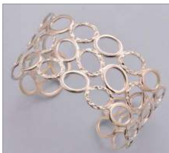
JBN110607D54X65MDC WT: 26.2 gm