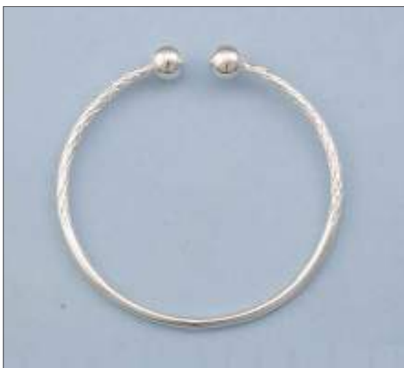
JBN110339D64MSL WT: 17.7 gm