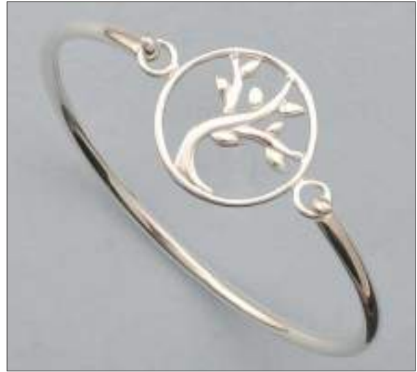
JBN110502D60MSL WT: 7 gm