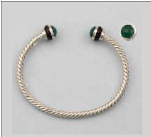
AF9260A252T WT: 0.7/21.25 gm