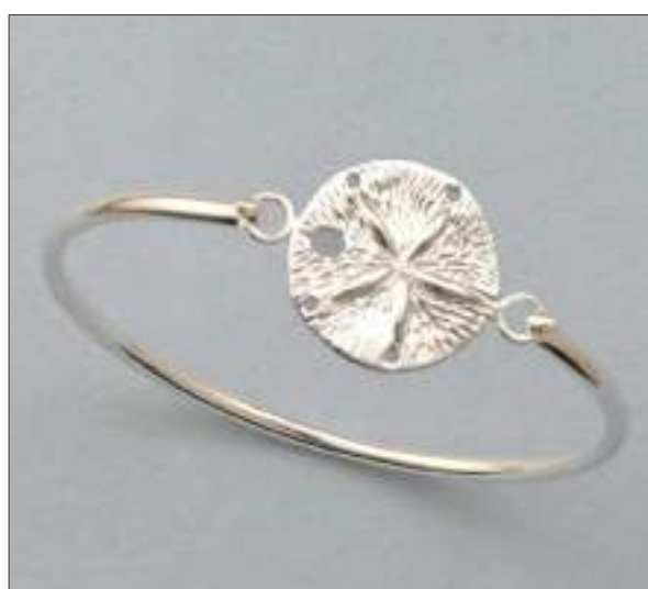
JBN110532D60MSL WT: 8.3 gm