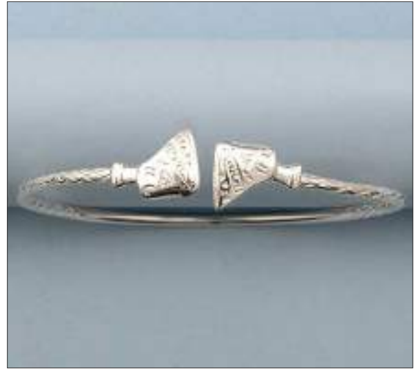
JBN110306D59MSL WT: 11.45 gm