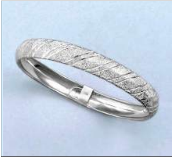
AF90992T WT: 6 gm