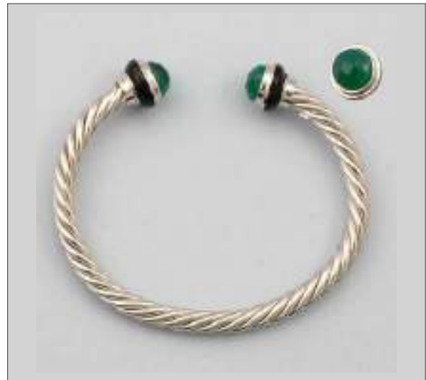
AF9261A252T WT: 1.1/32.75 gm