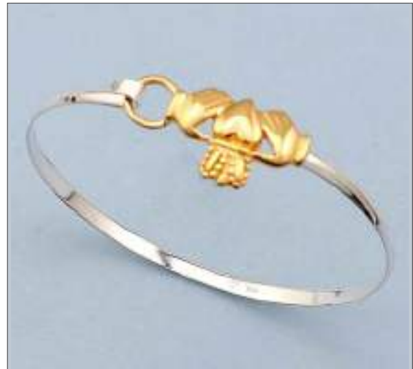
JBN110362D55M2T WT: 6.5 gm