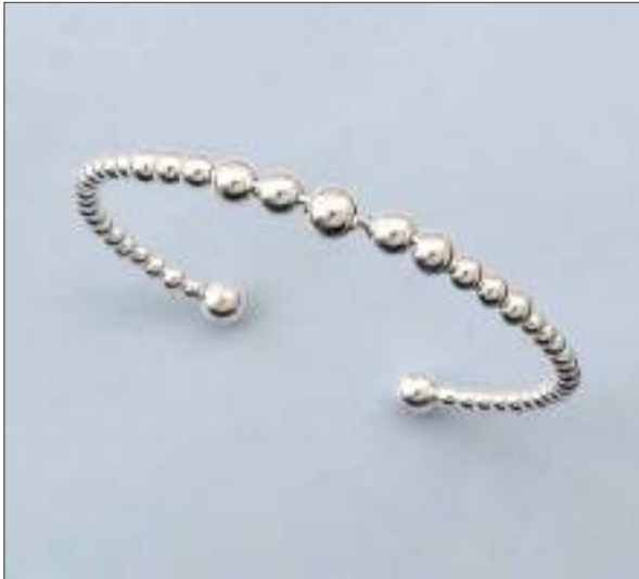
JBN110518D42X50MSL WT: 5.05 gm