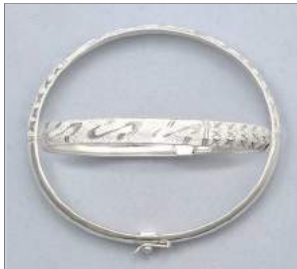
AF90112T WT: 3.9 gm