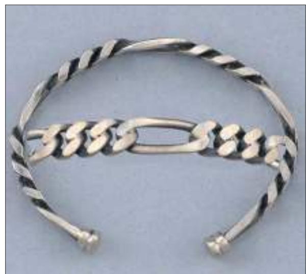
JBN1100052T WT: 22.9 gm