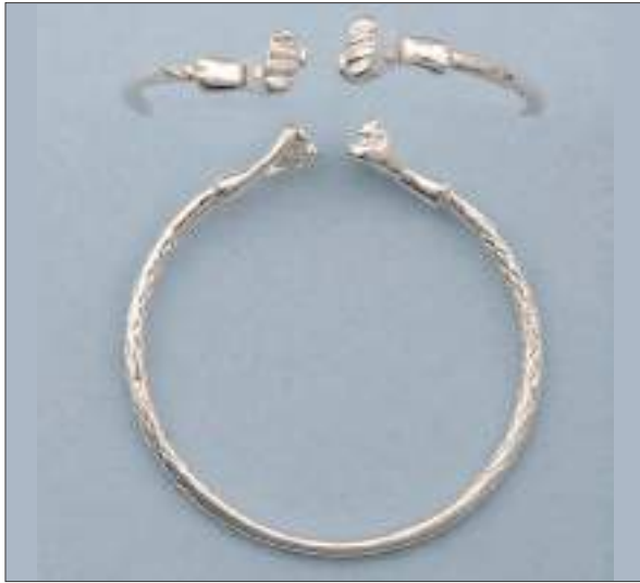
JBN110376D45MSL WT: 9.5 gm