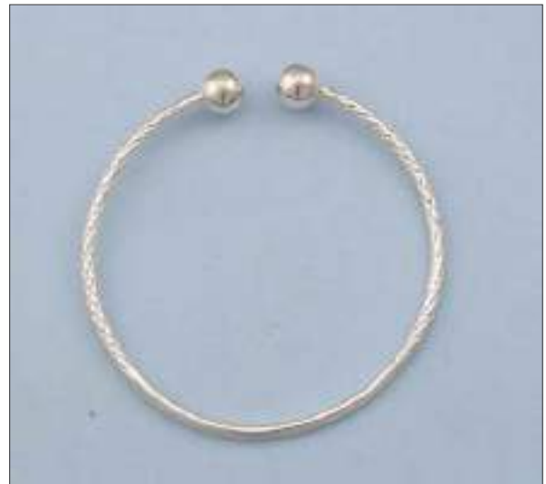
JBN110338D59MSL WT: 10.65 gm