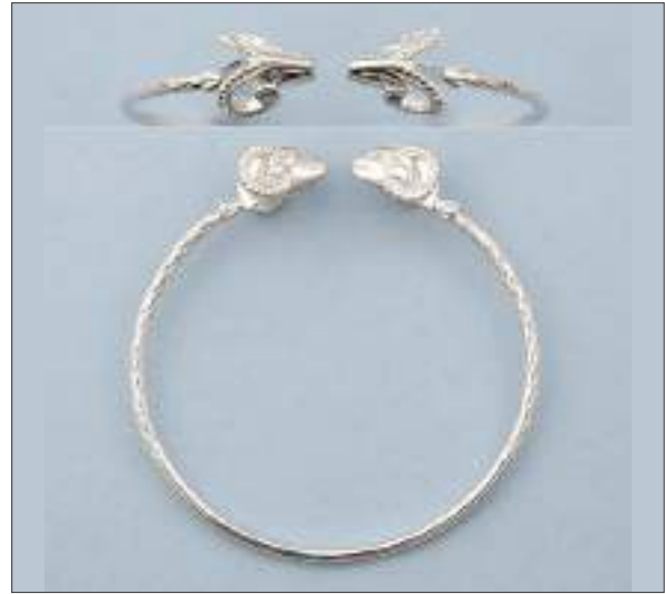
JBN110383D59MSL WT: 15.5 gm