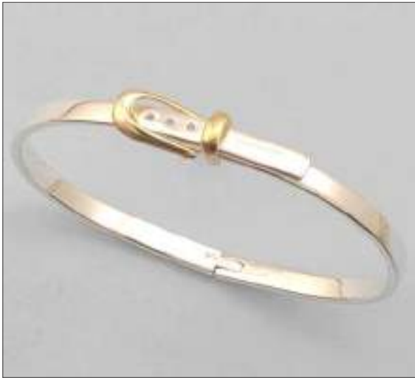
JBN1100112T WT: 16.97 gm