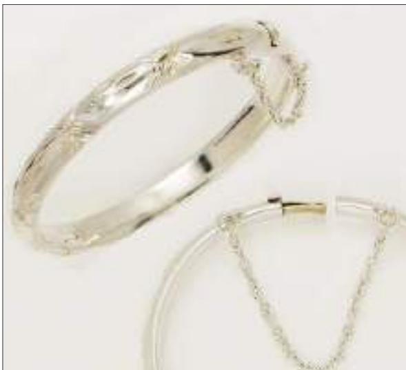
AFBG9333D40MDC WT: 5.4 gm