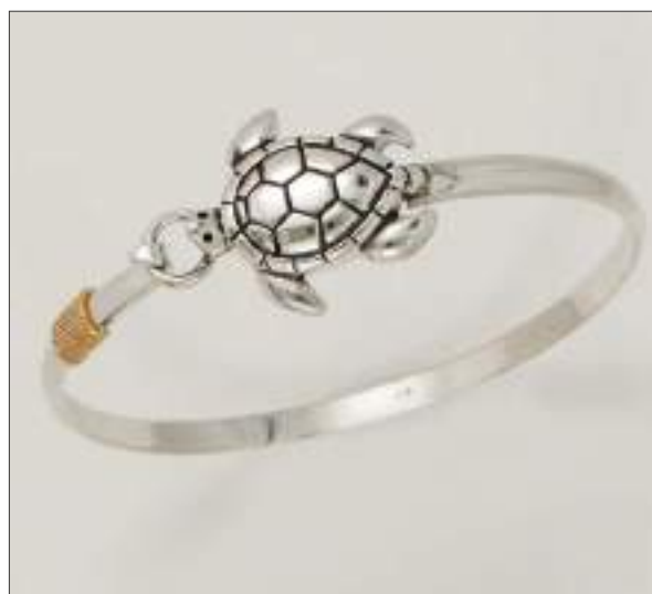
BG1110063T WT: 13.1 gm