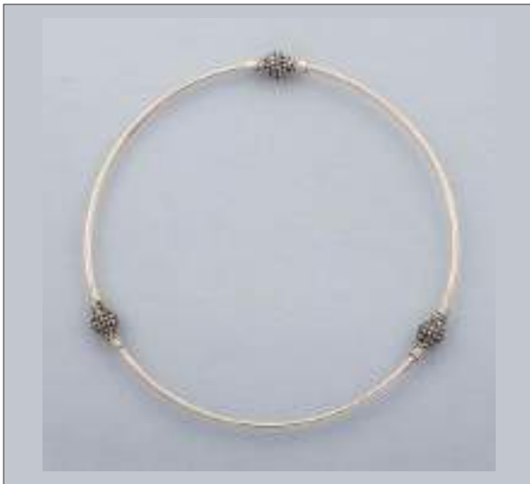
JBN110675D65MAT WT: 4.6 gm