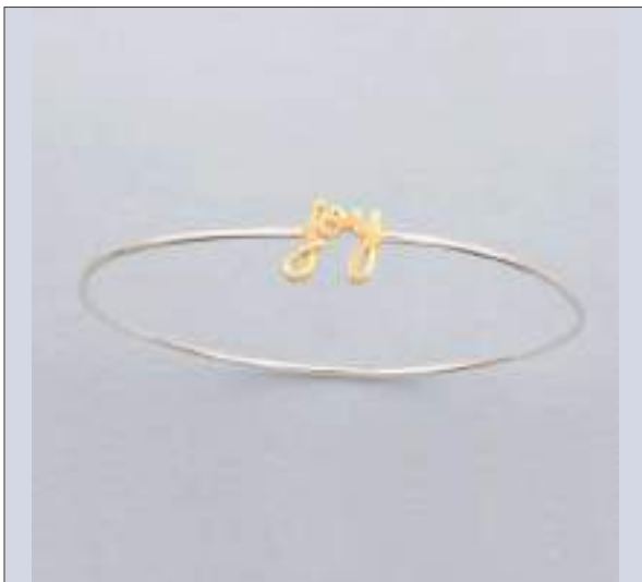
JBN110669D65M2T WT: 2.9 gm