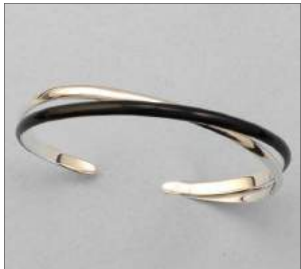
JBN110573EN WT: 12.95 gm