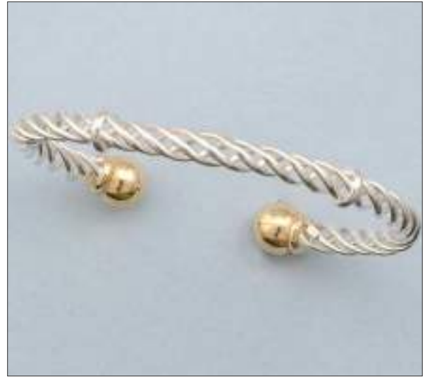
AF92342T WT: 10 gm