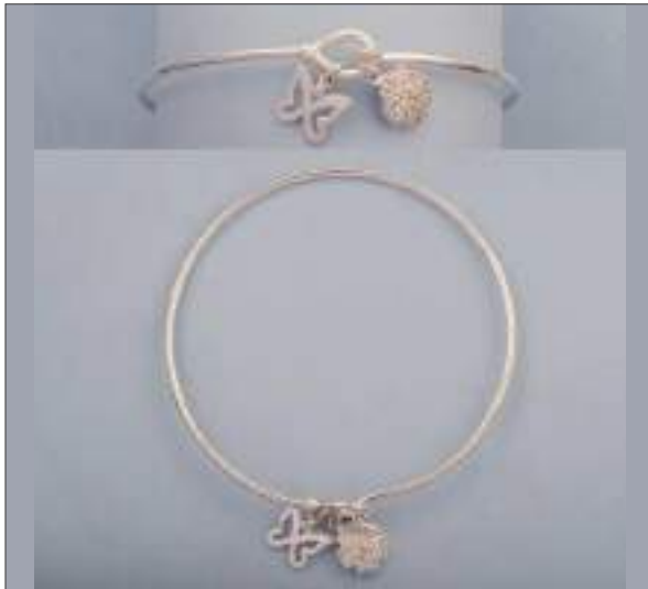
JBN110653D66MA18SL WT: 0.13/6.47 gm