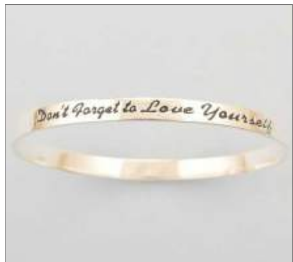
JBN110745D60MEN WT: 13 gm