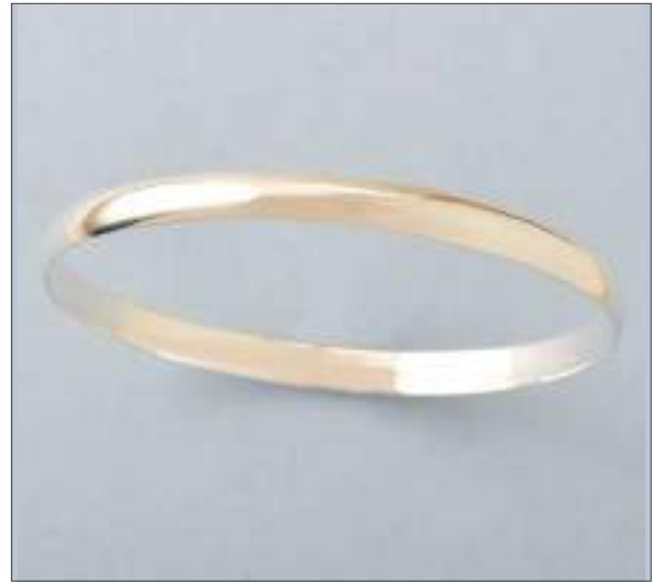
JBN110787D71MSL WT: 16.15 gm