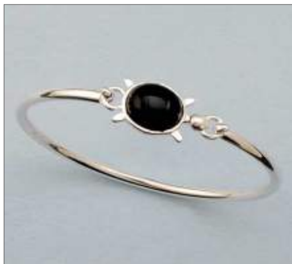
JBN110511D60MA2SL WT: 1.8/7.6 gm