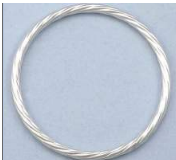
JBN110143D62MSL WT: 4.3 gm