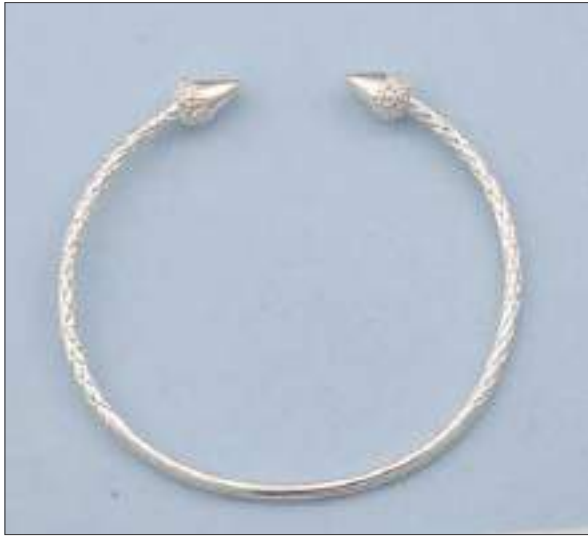
JBN110341D59MSL WT: 12.6 gm