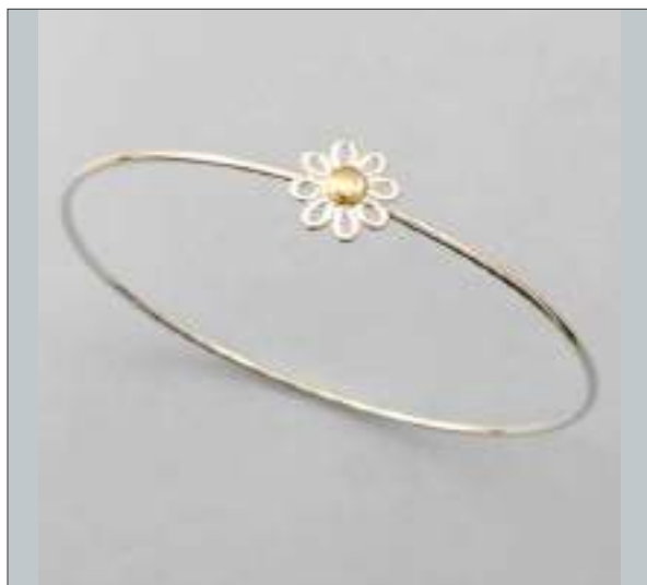
JBN110550D65M2T WT: 3.55 gm