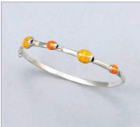
JBN110056EN WT: 9.62 gm