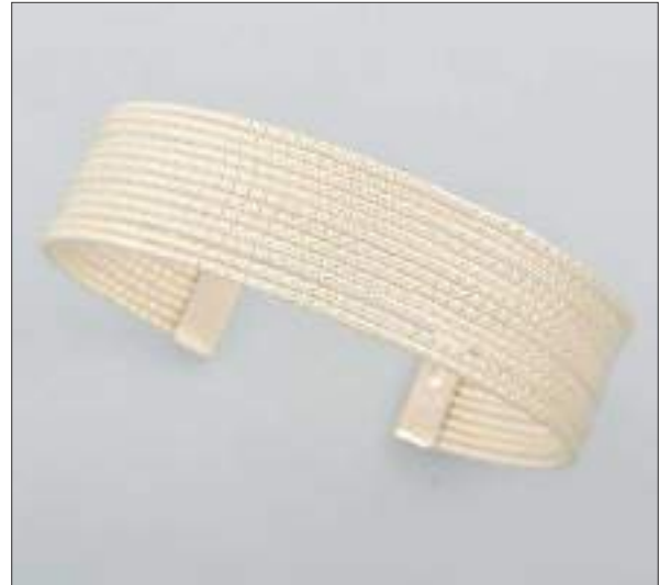
JBN110772D55X65MSL WT: 37.7 gm