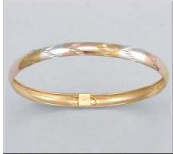
AF9023MF WT: 4.45 gm