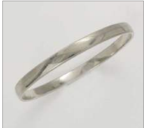
BG110963D66MSL WT: 7.9 gm