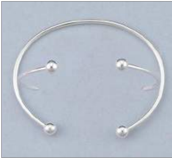
JBN110003SL WT: 7.42 gm