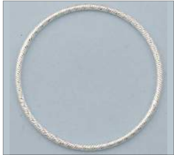
JBN110255D66MDC WT: 6.1 gm