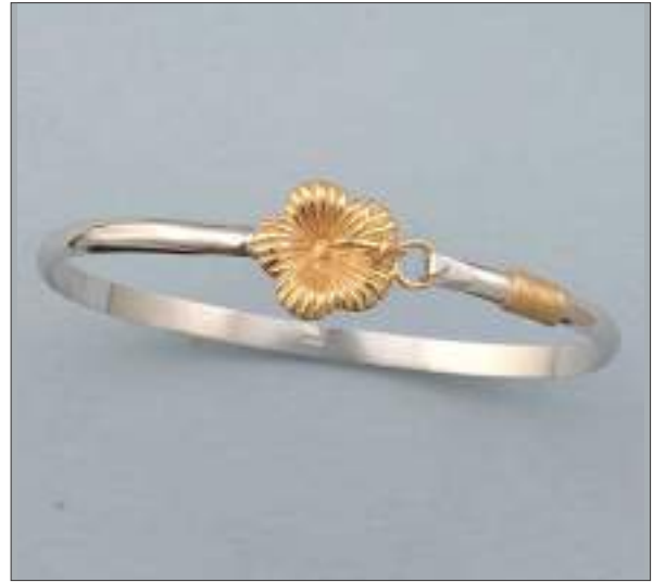
JBN1104442T WT: 10.3 gm