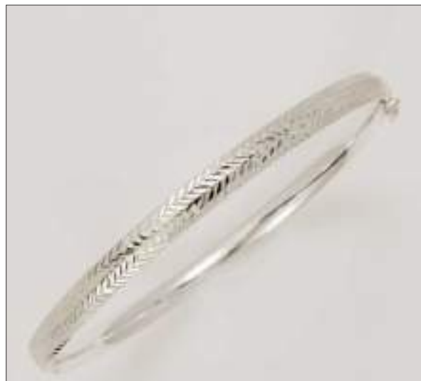
AF9315D65MDC WT: 6.7 gm