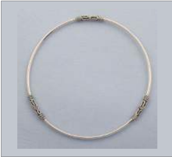
JBN110673D65MAT WT: 3.55 gm