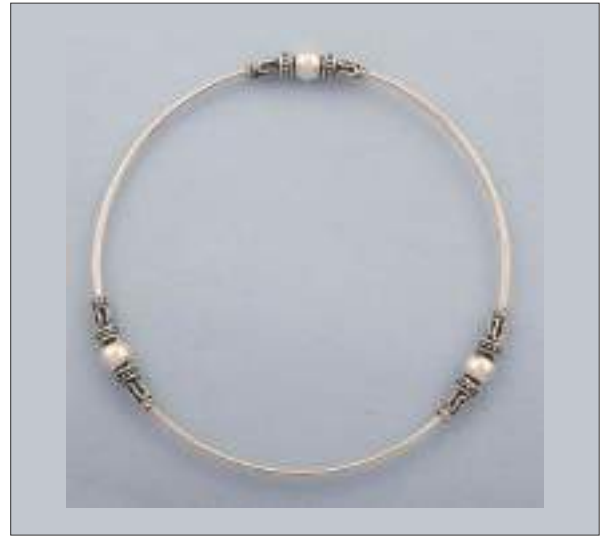
JBN110674D65MAT WT: 5 gm