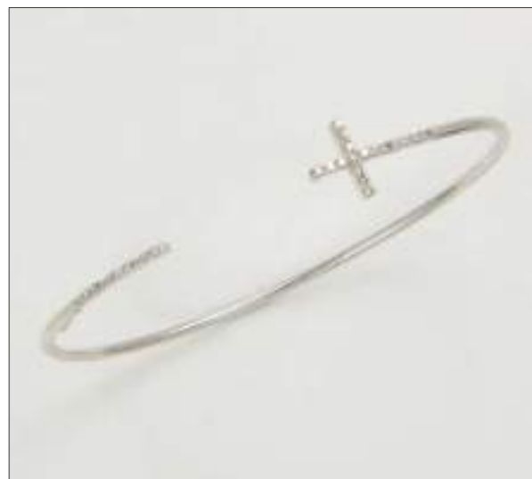
BG110953D51X60A18S WT: 0.11/2.44 gm