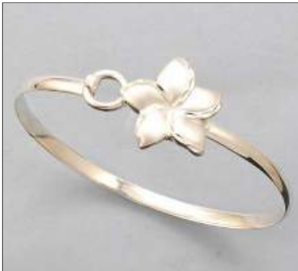
JBN110592D48X60M3T WT: 10.4 gm