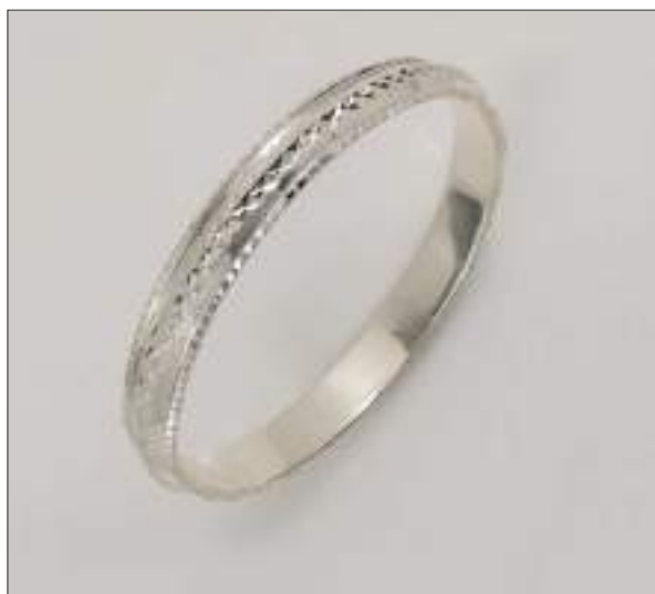
BG110846D51MDC WT: 21.35 gm