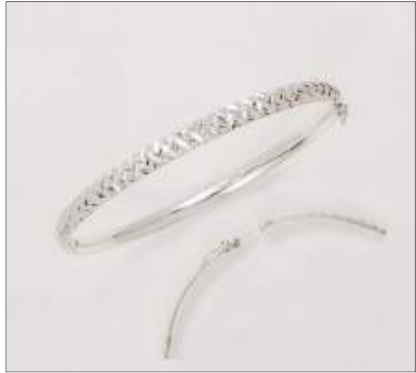
AFBG9337D65MDC WT: 7 gm