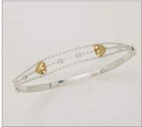
AFBG93253T WT: 6.8 gm