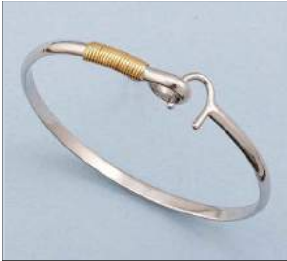
JBN1103512T WT: 13.65 gm