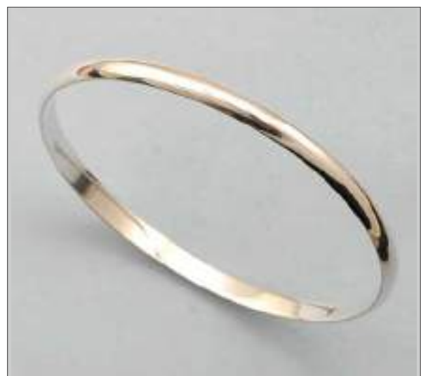
JBN110577D65MSL WT: 15.65 gm