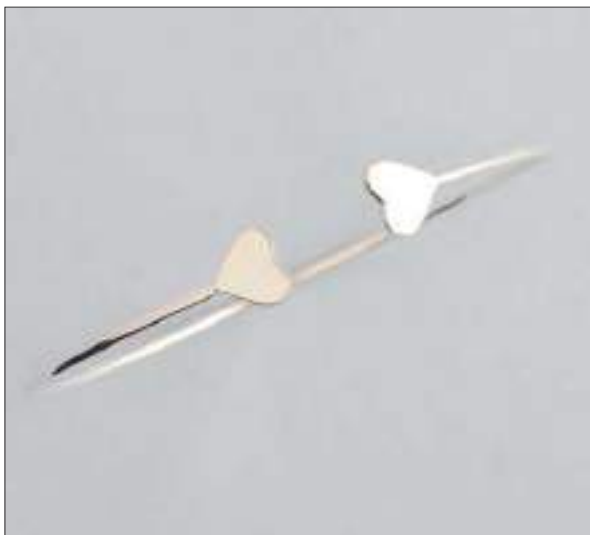
JBN110805D62MSL WT: 3.5 gm