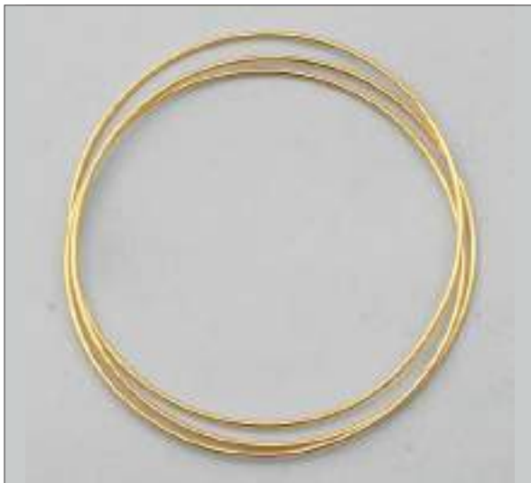
JBN110549D57MFG WT: 2.35 gm