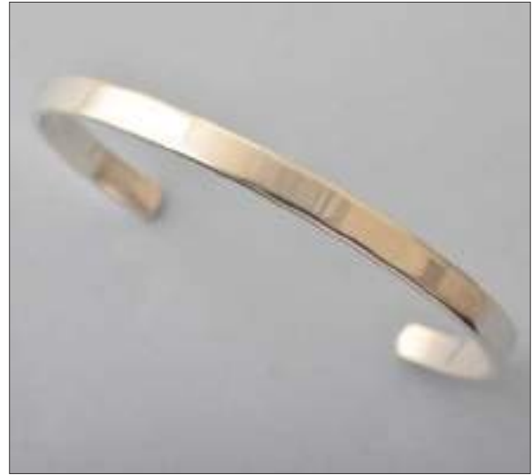
JBN110777D50X60MSL WT: 10.45 gm