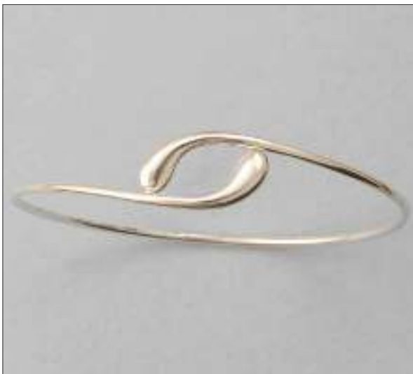
JBN110543D66MSL WT: 6.2 gm