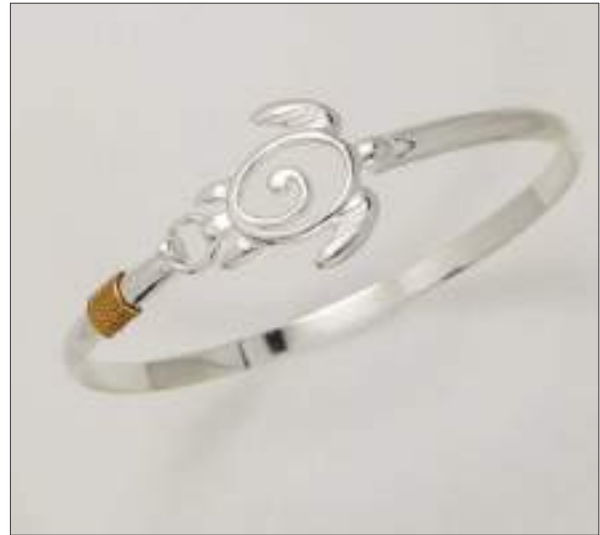
BG1110122T WT: 11.6 gm