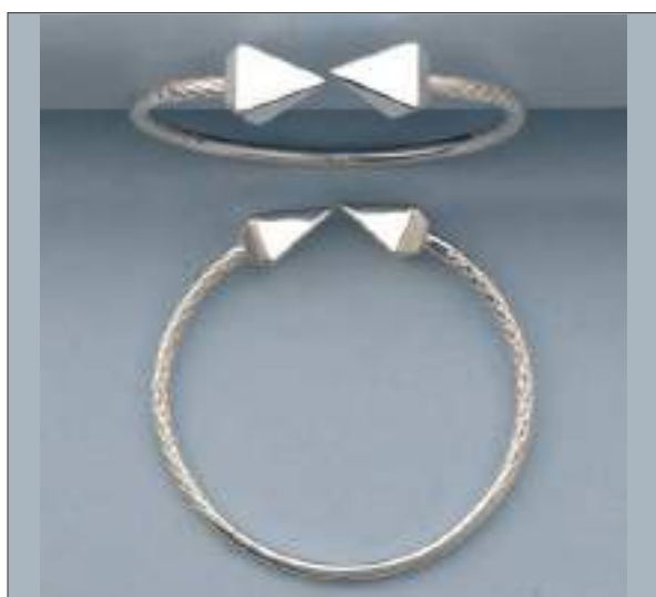
JBN110423D45MSL WT: 13.25 gm