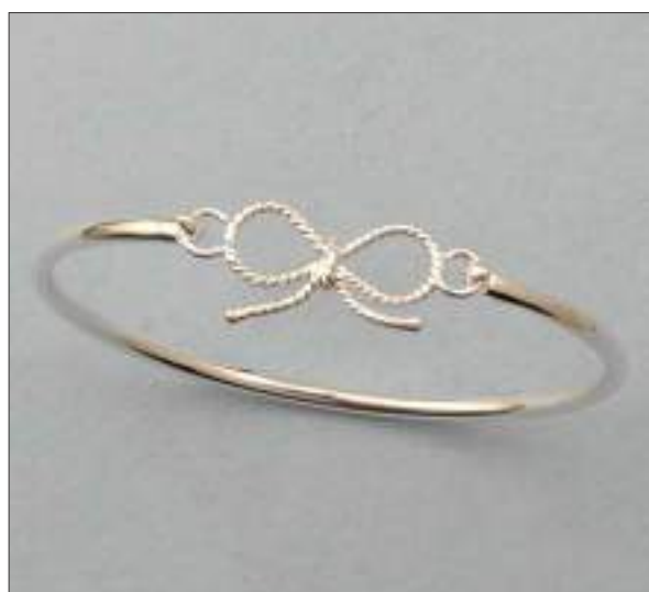
JBN110500D60MSL WT: 6.1 gm