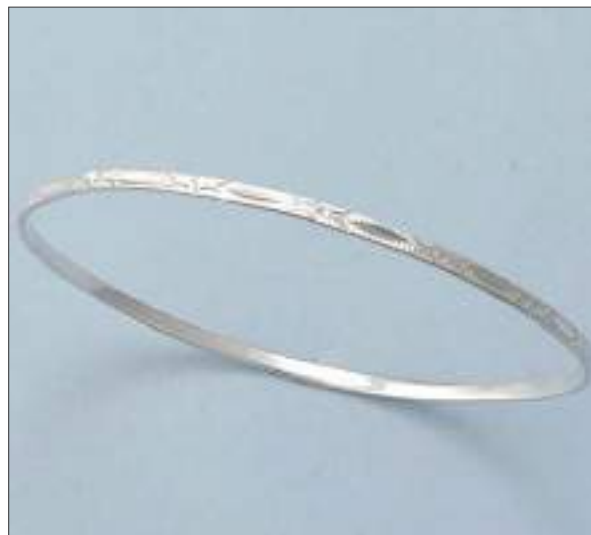
JBN110283D65MDC WT: 4.8 gm