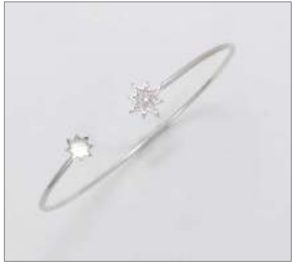
BG110874D62MA18SL WT: 0.02/2.83 gm