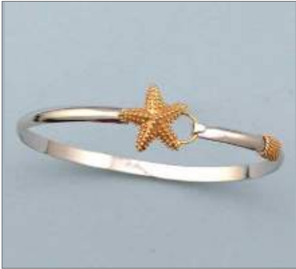
JBN1104392T WT: 9.6 gm