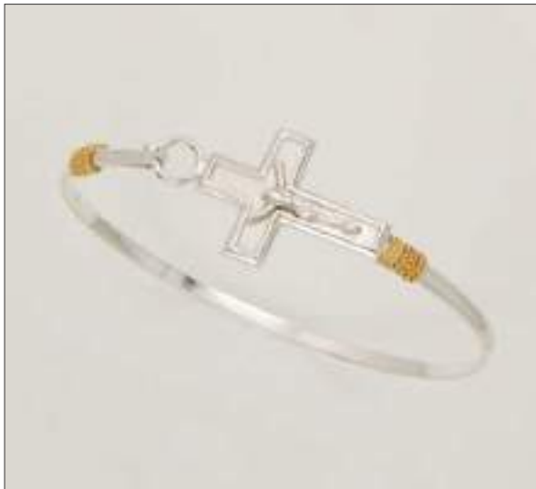
BG1110392T WT: 8.9 gm