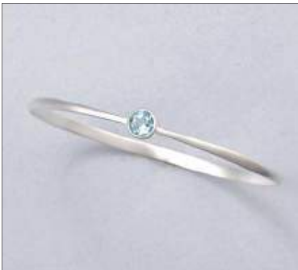
JBN110067A54SB WT: 0.37/6.28 gm