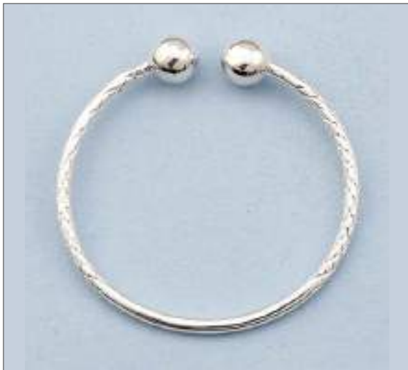
JBN110337D45MSL WT: 8.3 gm