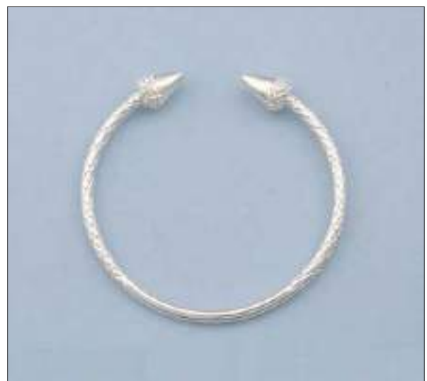
JBN110340D45MSL WT: 10.55 gm