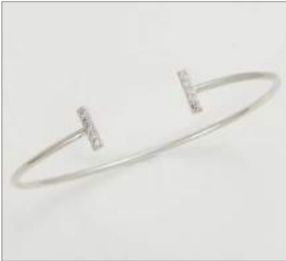
BG110939D51X60A18S WT: 0.06/2.79 gm