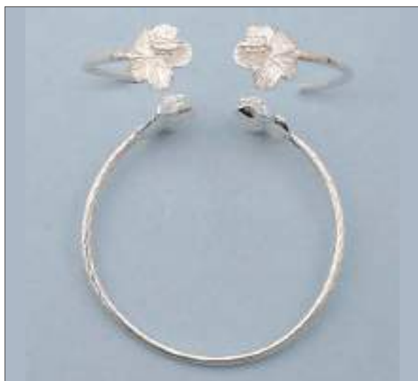
JBN110368D59MSL WT: 13.55 gm