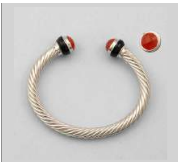
AF9262A322T WT: 1.8/45.5 gm