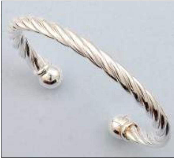
AF9235SL WT: 23.95 gm