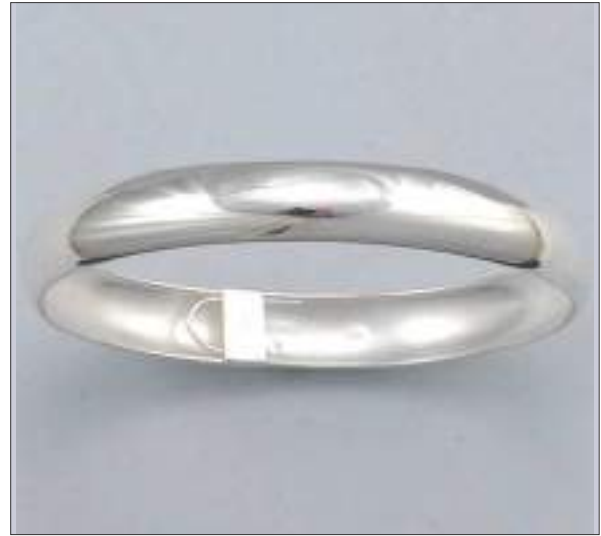
AF9036SL WT: 6.28 gm