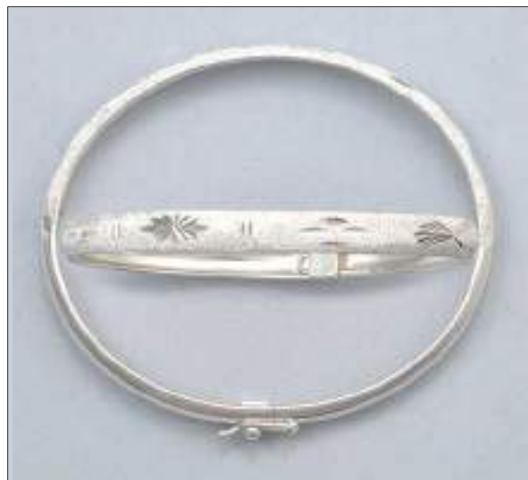
AF90092T WT: 4 gm