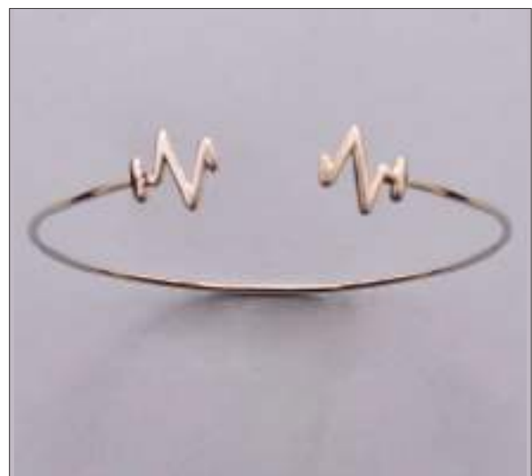
JBN110600D65MRH WT: 3.55 gm