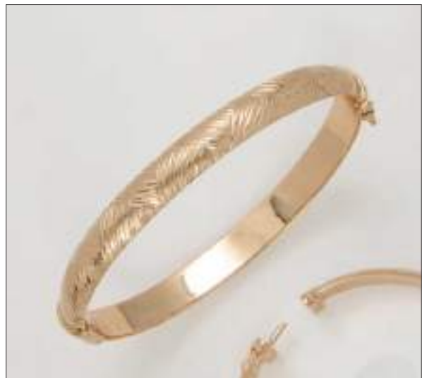
AFBG18522T WT: 10.8 gm