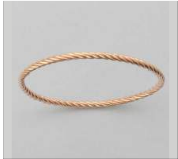
AF9265D60MRG WT: 11.7 gm