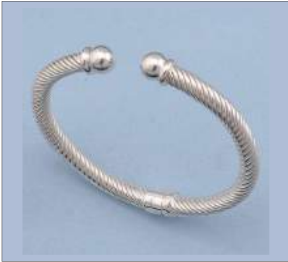
AF9154SL WT: 16.12 gm