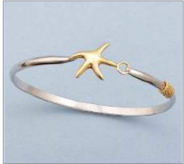
JBN1103572T WT: 13.15 gm