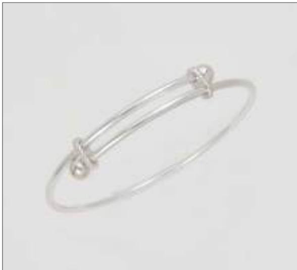
JBN110697D65MSL WT: 16.55 gm