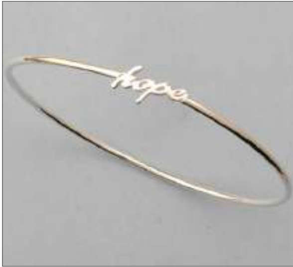
JBN110537D66MSL WT: 3.95 gm