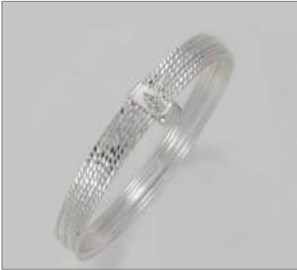
BG110843D66MDC WT: 16 gm