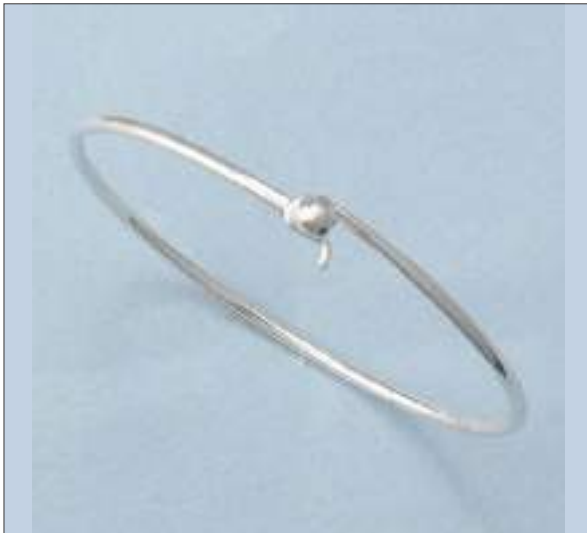
JBN110280D60MSL WT: 8 gm