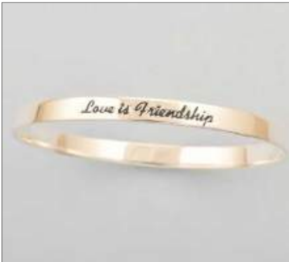
JBN110742D60MEN WT: 13.75 gm