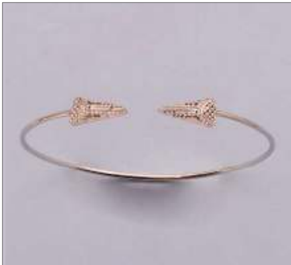
JBN110612D62MRH WT: 4.2 gm