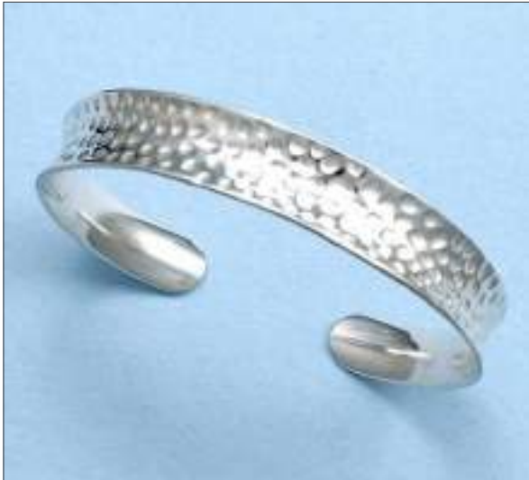
JBN110276SL WT: 22.55 gm