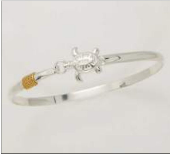
BG1110152T WT: 10.6 gm