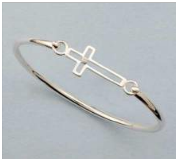
JBN110510D60MA18SL WT: 6.45 gm