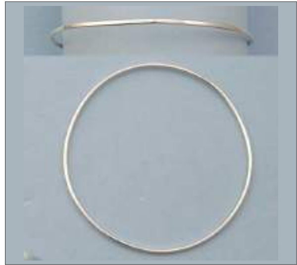
JBN110406D65MSL WT: 4.35 gm