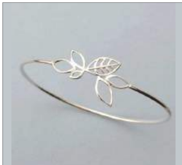
JBN110519D66MSL WT: 5.05 gm