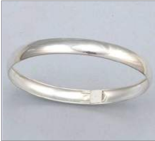
AF9001SL WT: 5.65 gm