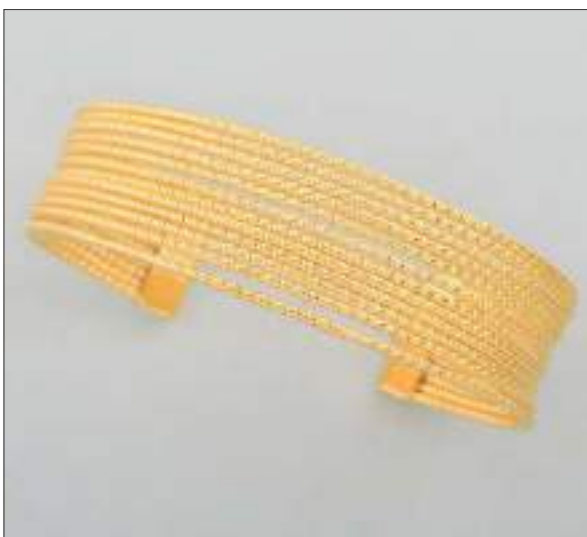
JBN11077255X65MHMG WT: 37.7 gm