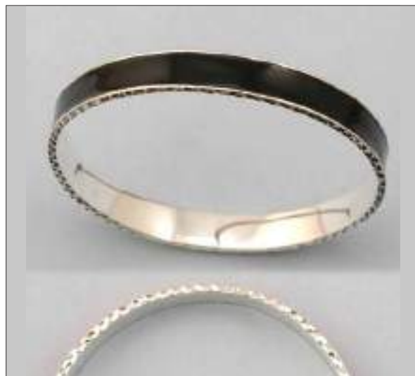
JBN110564D61M3T WT: 19.2 gm