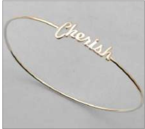
JBN110584D65MSL WT: 3.7 gm