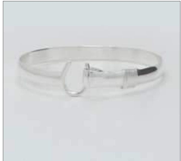
JBN110816D51X64MSL WT: 18.2 gm