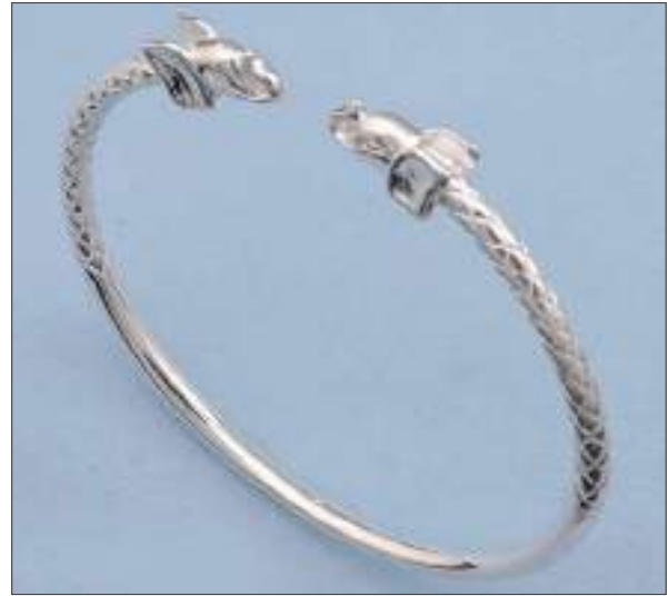
JBN110302D70MSL WT: 33.1 gm