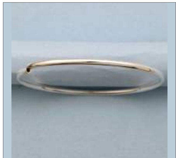
JBN110455S65MSL WT: 6.75 gm