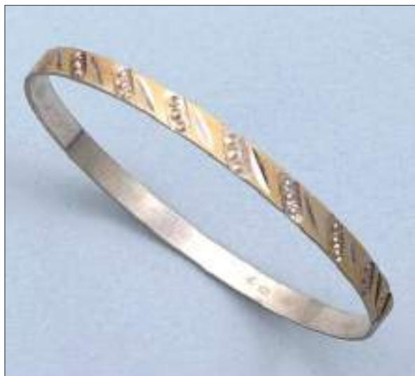
JBN110233D66MDC WT: 8 gm