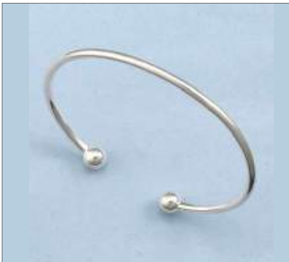
JBN110264SL WT: 15 gm