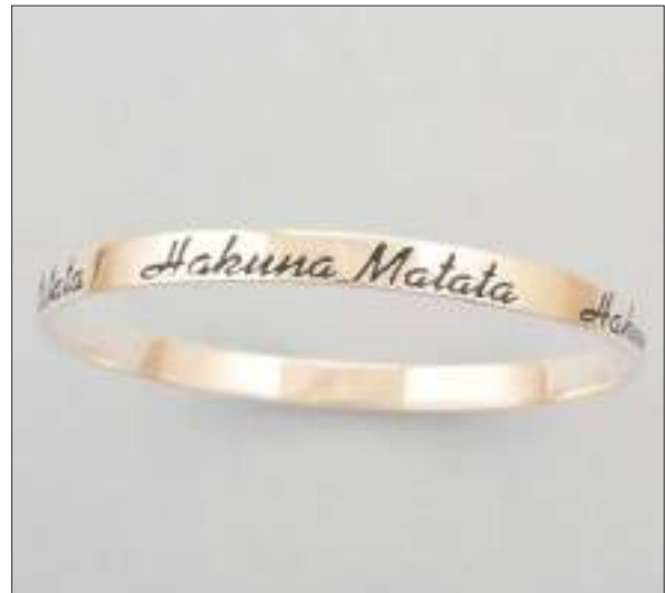
JBN110743D60MEN WT: 14.75 gm