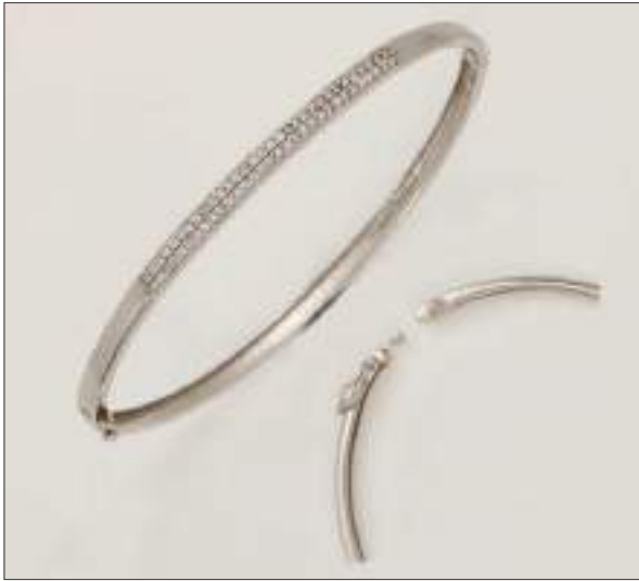
BG111042A18RH WT: 0.19/9.41 gm