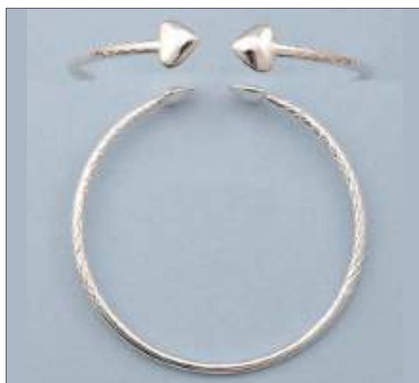
JBN110374D64MSL WT: 16.8 gm