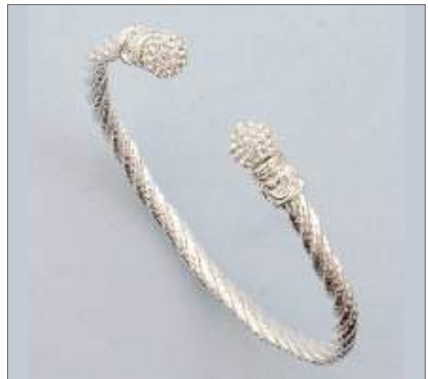
URAF9243SL WT: 15.1 gm