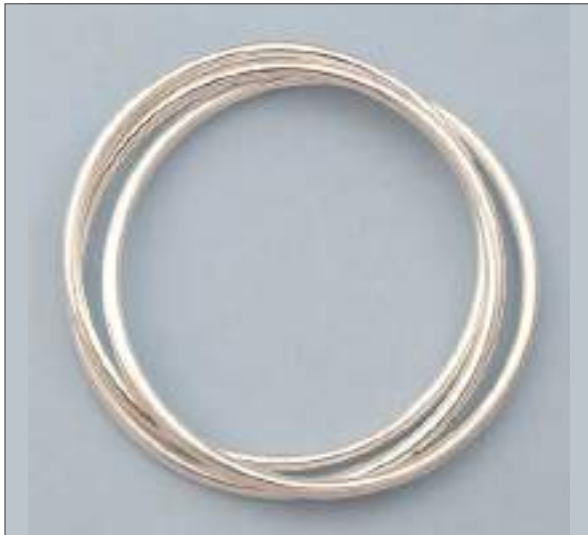
JBN110127S66MSL WT: 15.95 gm