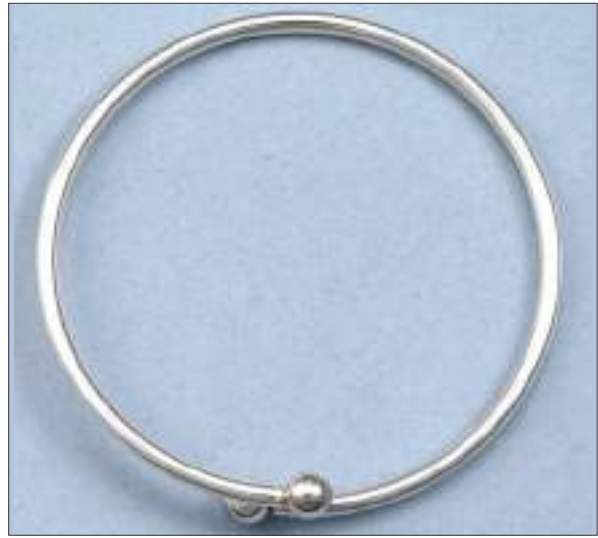
JBN110160SL WT: 7.42 gm