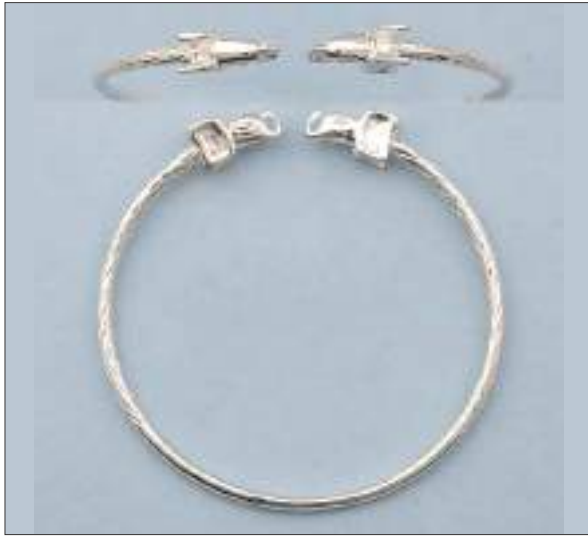
JBN110382D59MSL WT: 12.5 gm