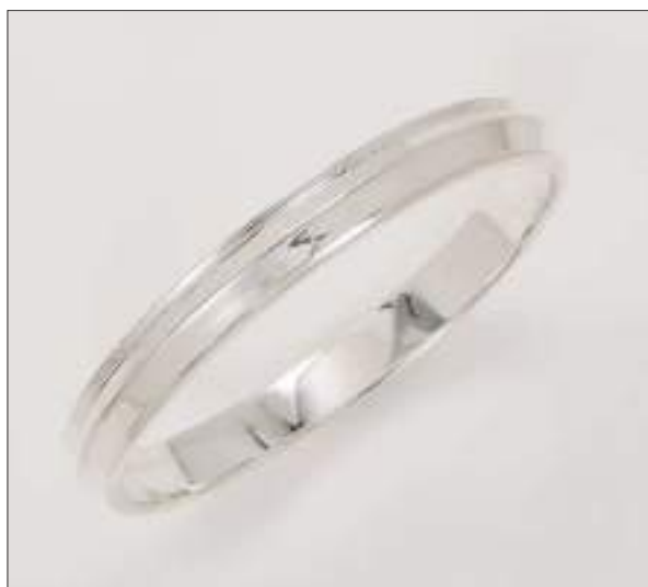
BG110203D51MSL WT: 23.25 gm