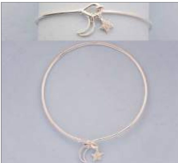
JBN110647D66MA18SL WT: 0.05/5.4 gm