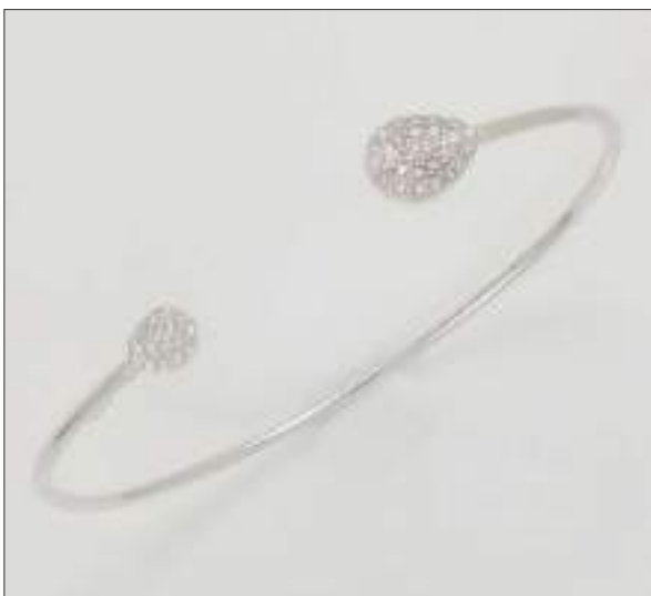
BG110941D53X60A18S WT: 0.2/3.25 gm