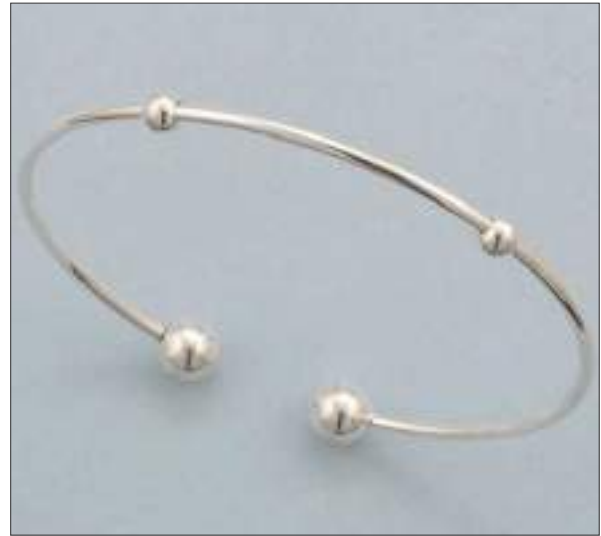
JBN110596D65MSL WT: 8.85 gm