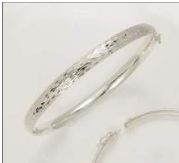
AF9314D65MDC WT: 8.55 gm