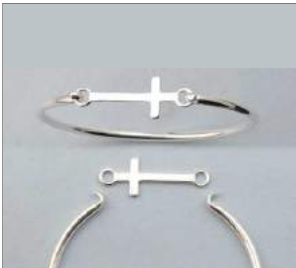
JBN110493D60MSL WT: 6.1 gm