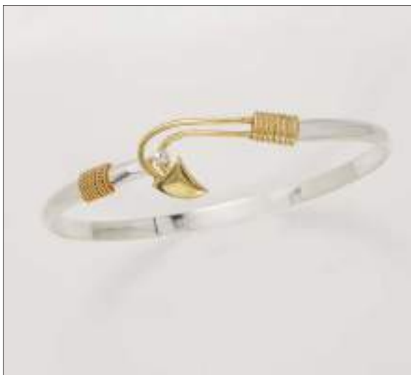
BG1110012T WT: 11.05 gm