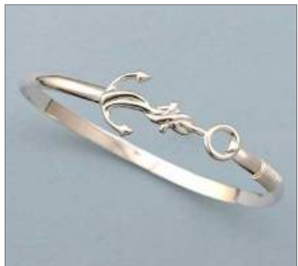
JBN110435SL WT: 9.9 gm