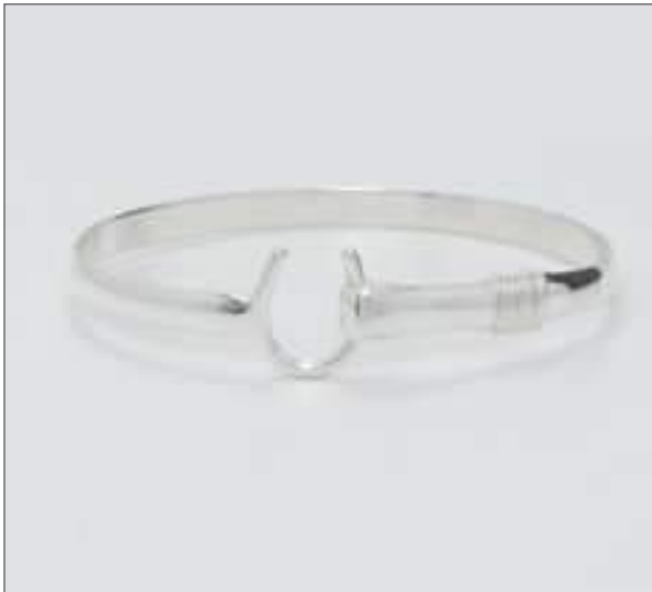
JBN110815D51X64MSL WT: 14.8 gm