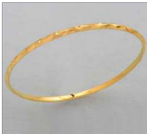
JBN110687D66M2T WT: 8.7 gm