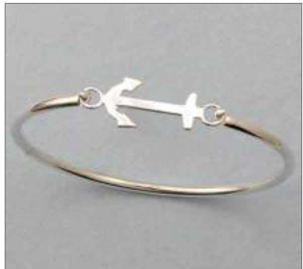
JBN110494D60MSL WT: 6.35 gm