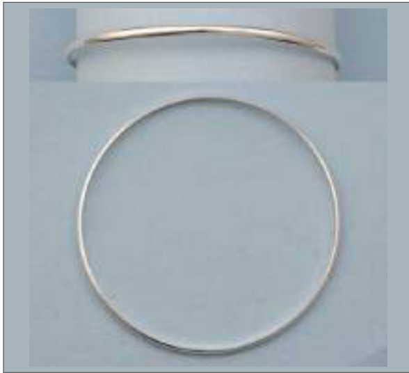
JBN110405D65MSL WT: 5.45 gm