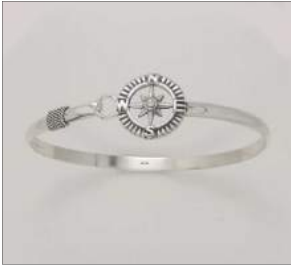
BG110988AT WT: 11.17 gm