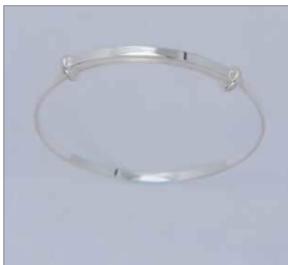
JBN110826D50MSL WT: 6.3 gm