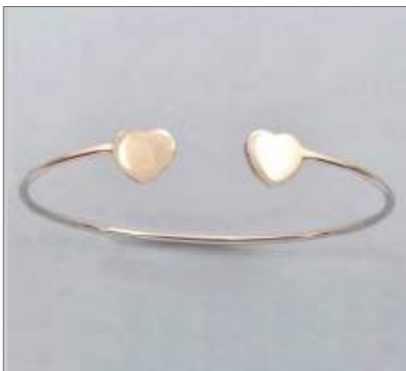
JBN110657D62MRH WT: 3.85 gm