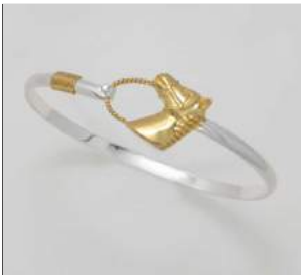
BG110875D56X68M2T WT: 12.8 gm