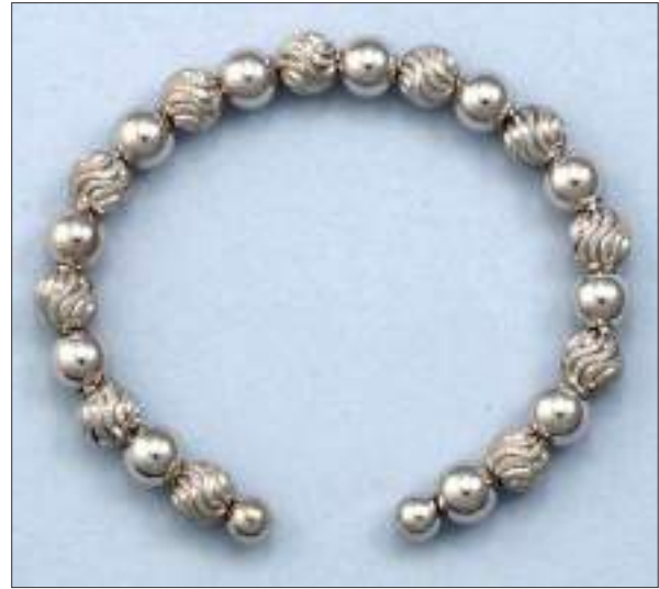
JBN1101643T WT: 23 gm