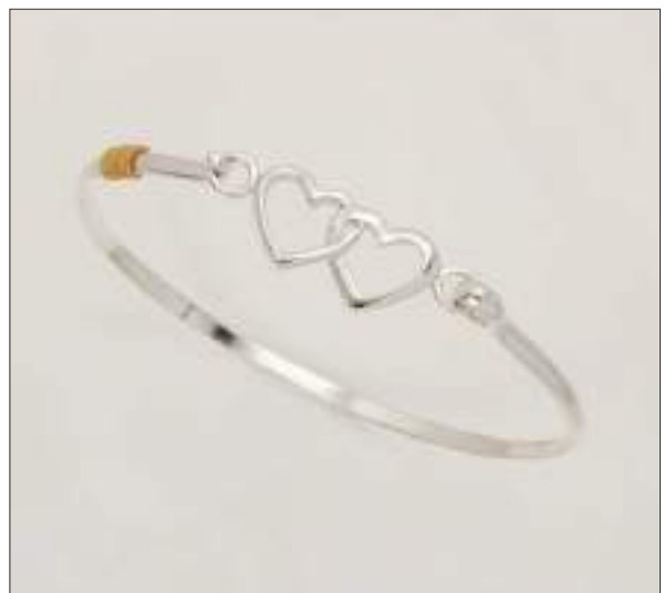
BG1110382T WT: 8.25 gm