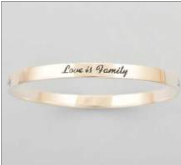
JBN110748D60MEN WT: 13.2 gm