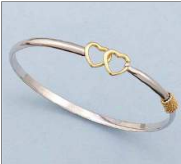
JBN1103582T WT: 13.1 gm