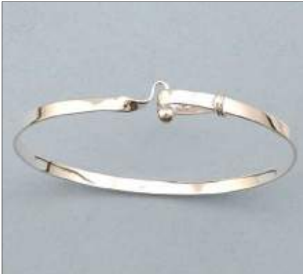
JBN110457S50X65MSL WT: 8.5 gm