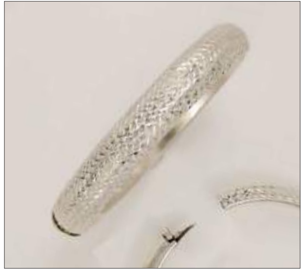
BG1110412T WT: 21.5 gm