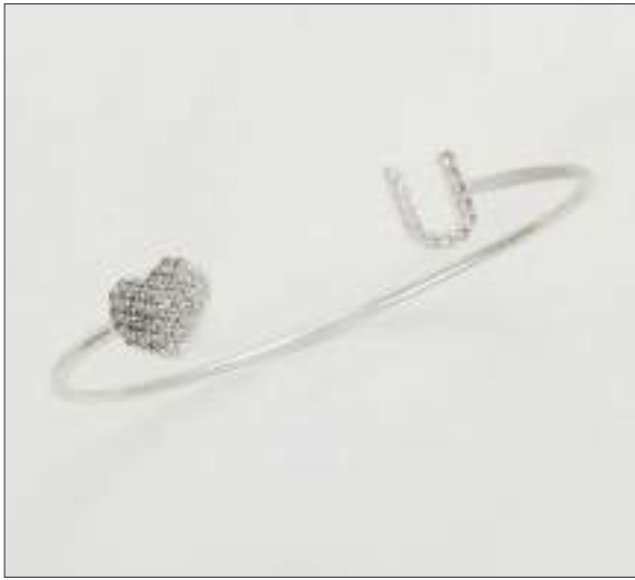
BG110947D51X60A18S WT: 0.27/4.18 gm