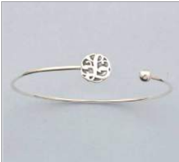
JBN110488D66MAT WT: 4.3 gm