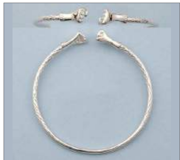
JBN110381D64MSL WT: 18 gm