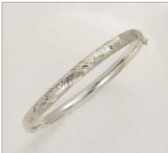
AF9313D65MDC WT: 8.2 gm