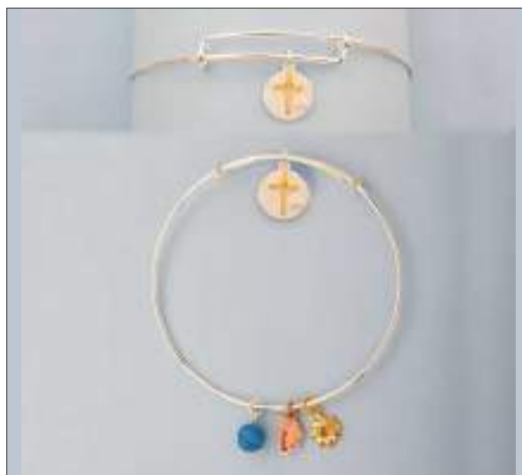
JBN110721D64MM1MF WT: 0.62/8.63 gm