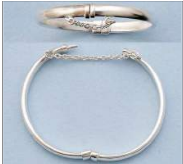
JBN110348D51M2T WT: 6.21 gm