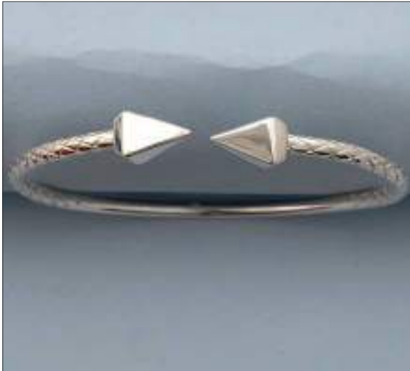
JBN110428D64MSL WT: 17.7 gm