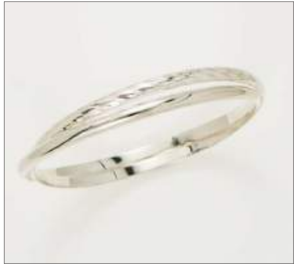
AFBG9331D63MSL WT: 8.7 gm