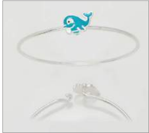
BG110890D45MEN WT: 3.45 gm