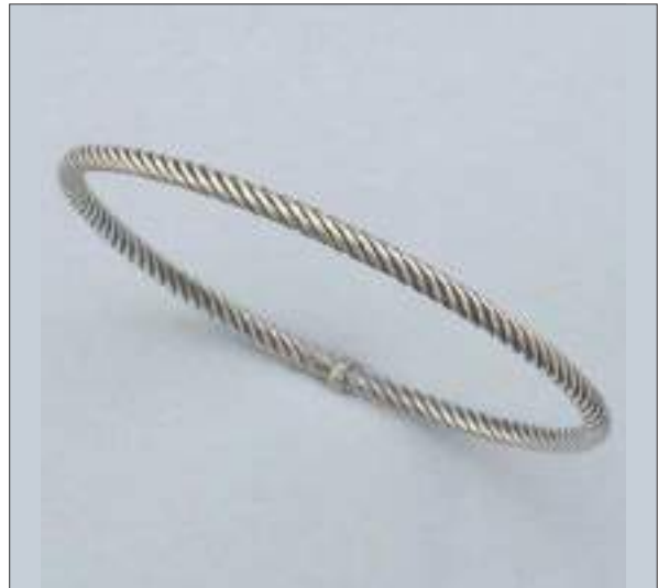
AF9210D66MAT WT: 10.4 gm