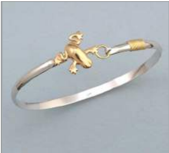
JBN1104452T WT: 10.05 gm