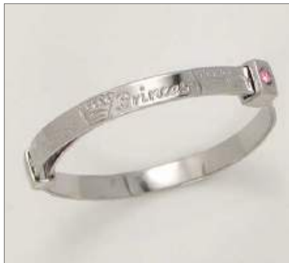
BG111031G38RH WT: 4.95 gm