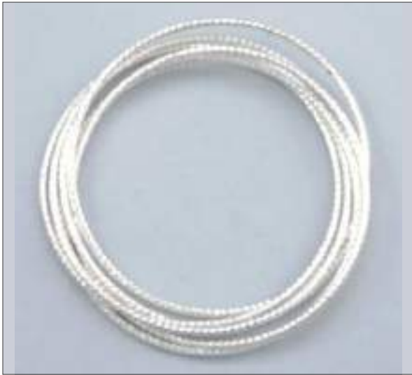
JBN110114DC WT: 14.75 gm