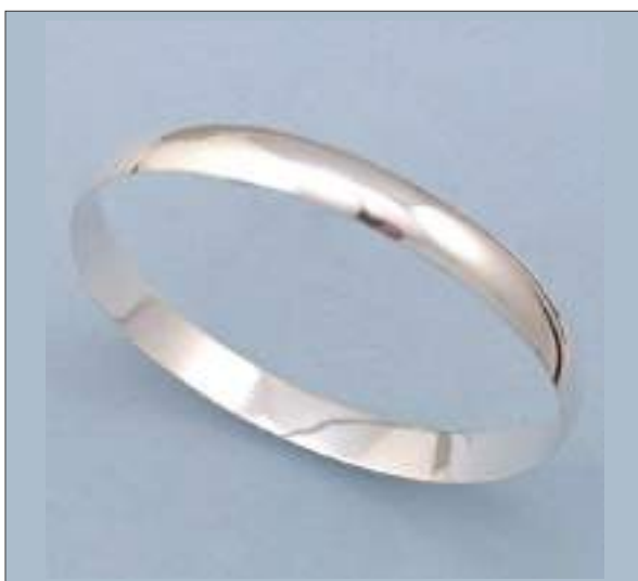
JBN110324D65MSL WT: 19.4 gm