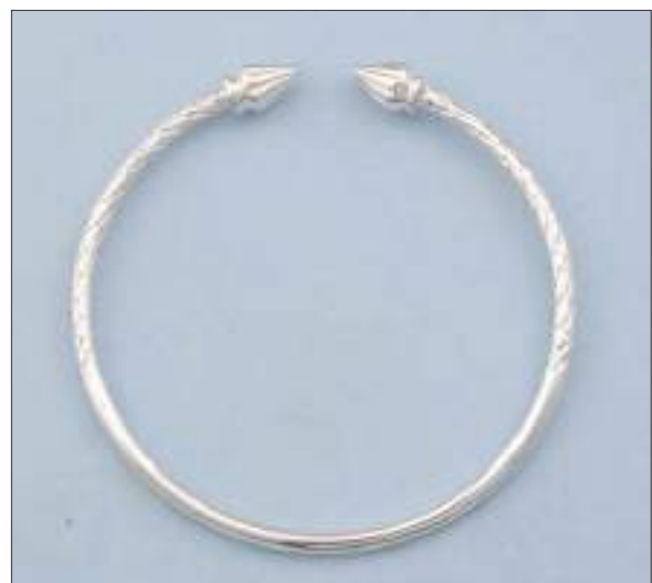
JBN110334D64MSL WT: 17.45 gm