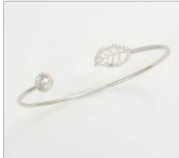
BG110944D51X60A18S WT: 0.22/2.78 gm