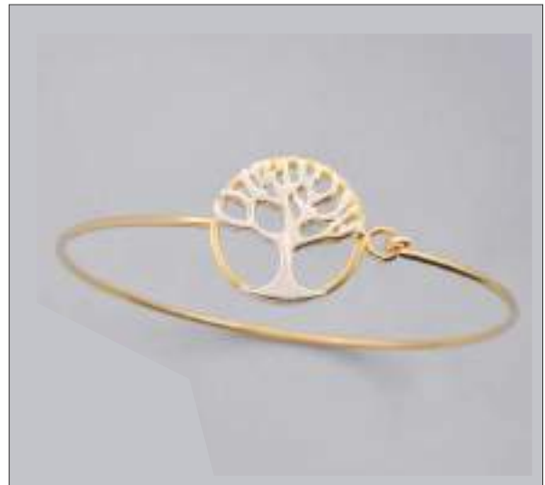
JBN110627D62M2T WT: 6.05 gm