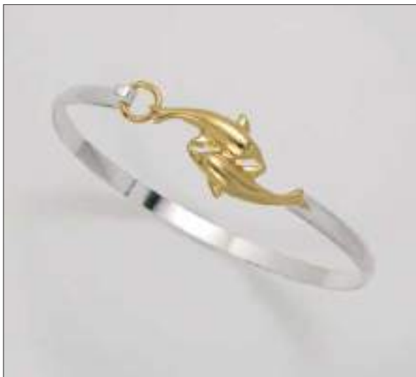
BG110889D52X61M2T WT: 8.95 gm