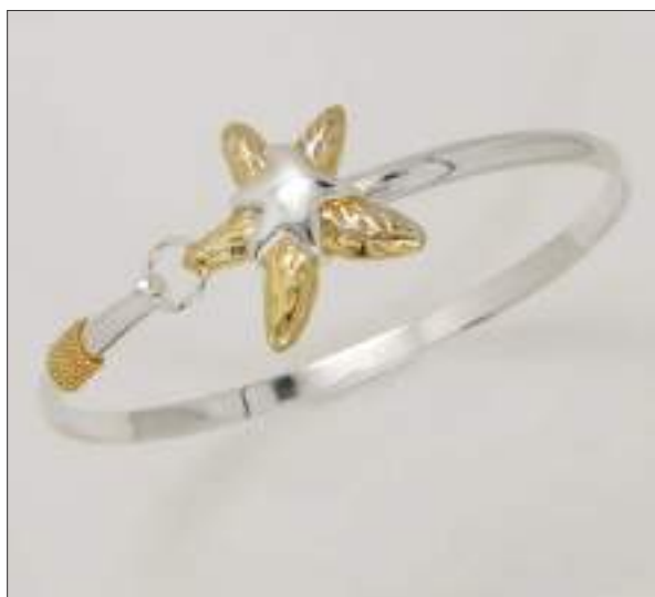
BG1110032T WT: 12.2 gm