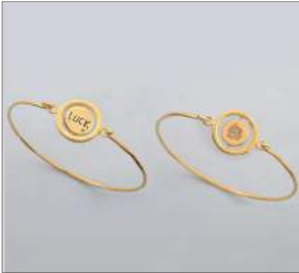
JBN110631D62MA182T WT: 0.04/7.2 gm