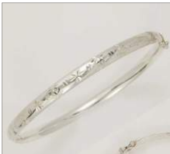
AF9316D65MDC WT: 6.8 gm