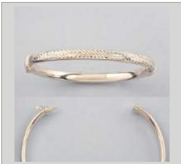
JBN1103052T WT: 10 gm