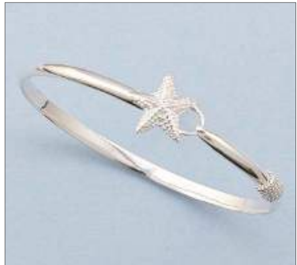
JBN110356SL WT: 13.35 gm