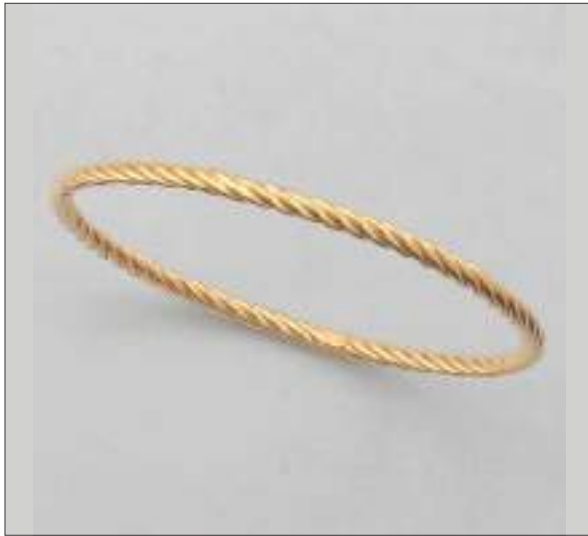
AF9265D60MHMG WT: 11.8 gm