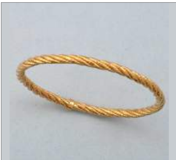
AF9219D65M2T WT: 13.86 gm