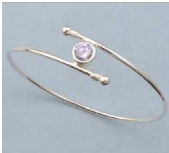
JBN110389D61MA41SL WT: 0.45/5.05 gm