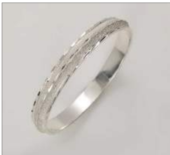
BG110844D51M3T WT: 22.6 gm