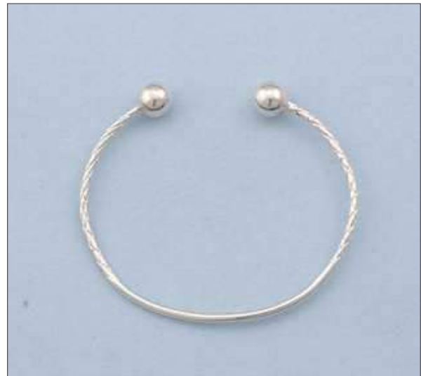
JBN110346D38MSL WT: 5.35 gm