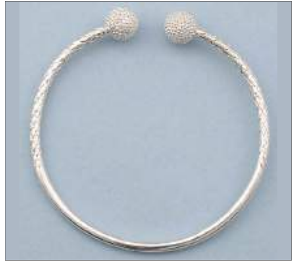
JBN110371D70MSL WT: 27.8 gm