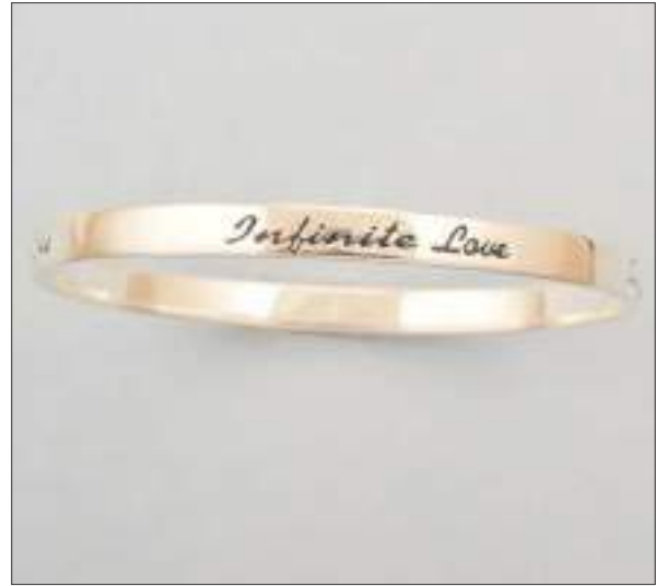
JBN110754D60MEN WT: 13.3 gm