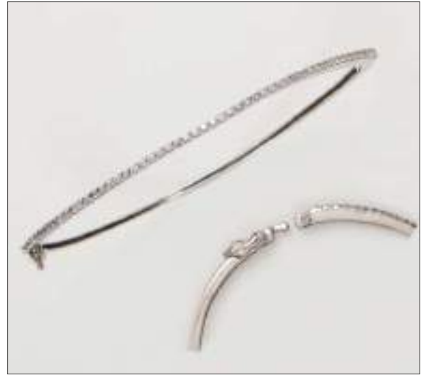
BG111045A18RH WT: 0.3/6.25 gm