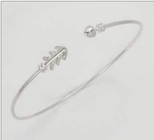
BG110872D62MA18SL WT: 0.13/3.47 gm