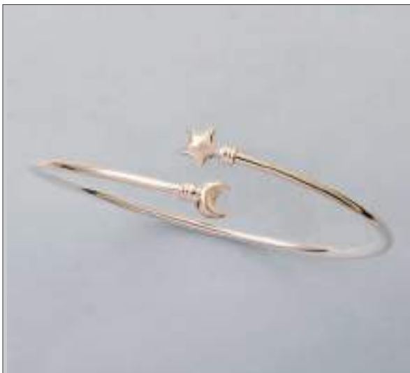
JBN110710D65MSL WT: 7.6 gm