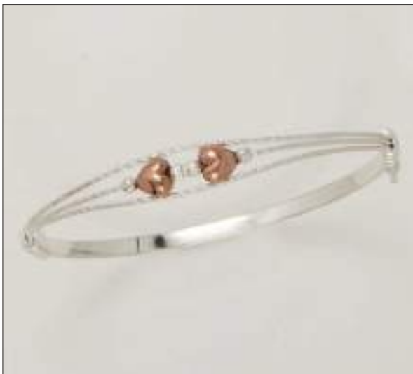
AFBG93263T WT: 6.95 gm