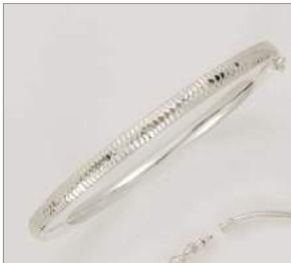
AF9317DC WT: 0 gm