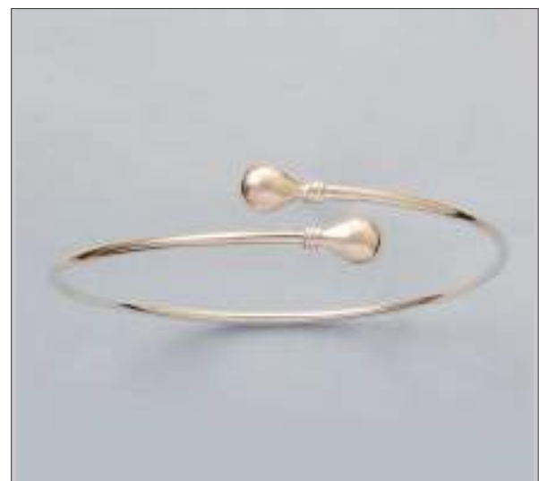
JBN110703D65MSL WT: 8.3 gm