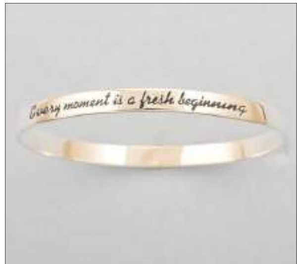
JBN110758D60MEN WT: 13.8 gm