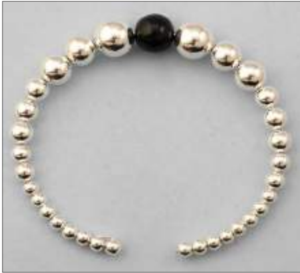
JBN110574EN WT: 13.65 gm