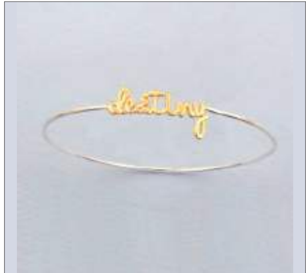
JBN110667D65M2T WT: 3.5 gm