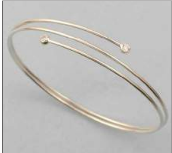
JBN110542D65MA18SL WT: 0.08/5.37 gm