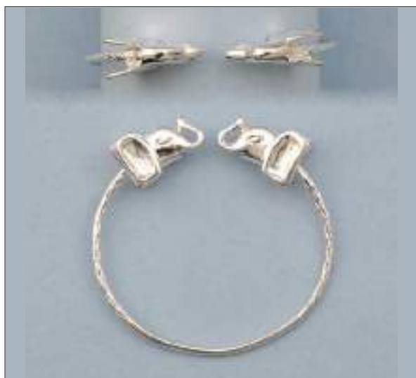
JBN110416D38MSL WT: 6.1 gm