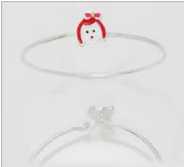
BG110891D45MEN WT: 3.85 gm