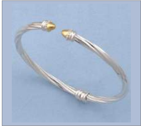
AF9155D59M2T WT: 6.8 gm