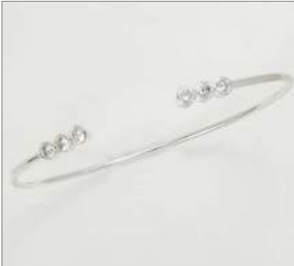
BG110956D51X60A18S WT: 3.25 gm