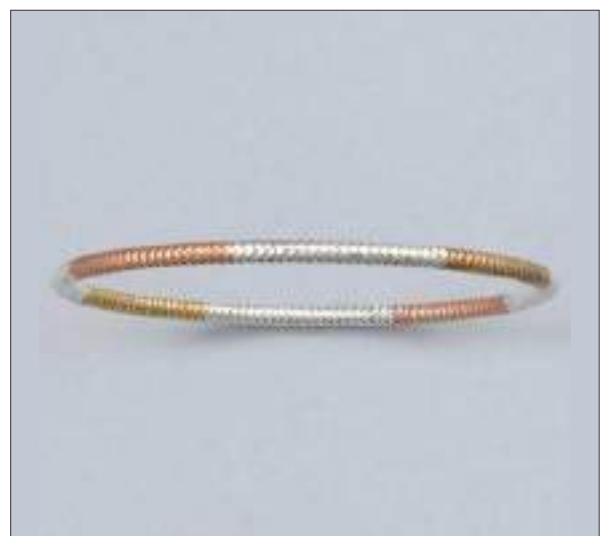
JBN110116MF WT: 5 gm