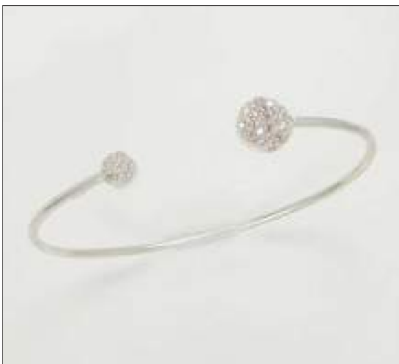
BG110945D51X60A18S WT: 0.49/3.31 gm