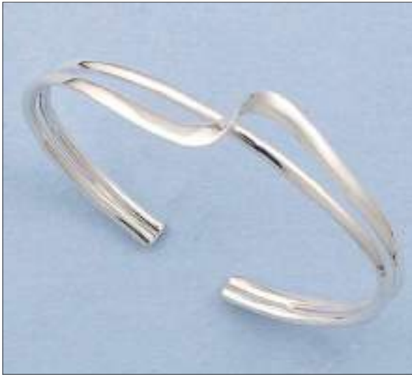
JBN110313SL WT: 11.25 gm