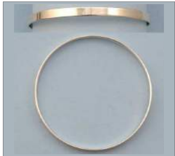
JBN110404D65MSL WT: 11.5 gm