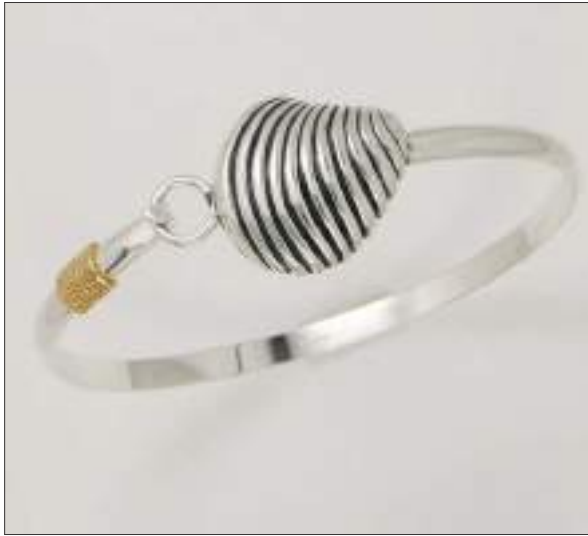
BG1110093T WT: 13.95 gm