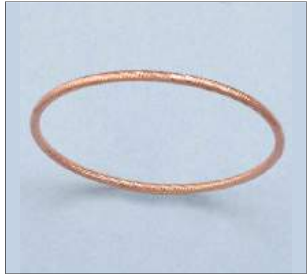
JBN110255D66M2T WT: 5 gm