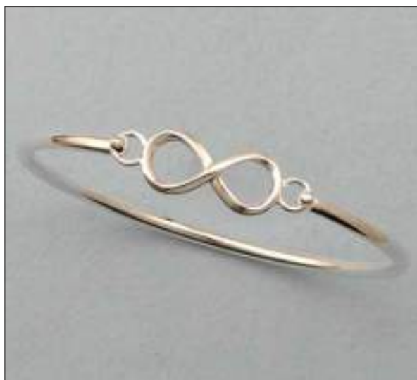
JBN110495D60MSL WT: 7.2 gm