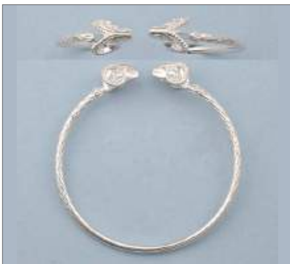
JBN110380D64MSL WT: 20.85 gm