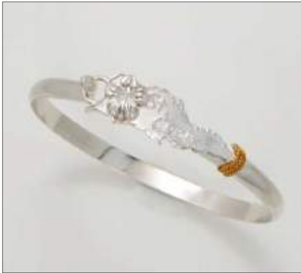
BG110887D54X61M3T WT: 18.1 gm