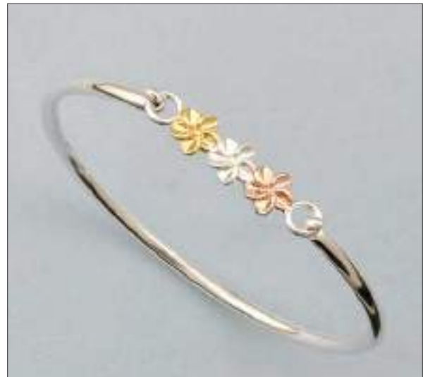
JBN110515D60M3T WT: 6.5 gm