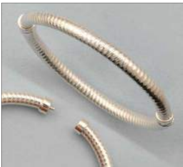
JBN110535D65MDC WT: 28.15 gm