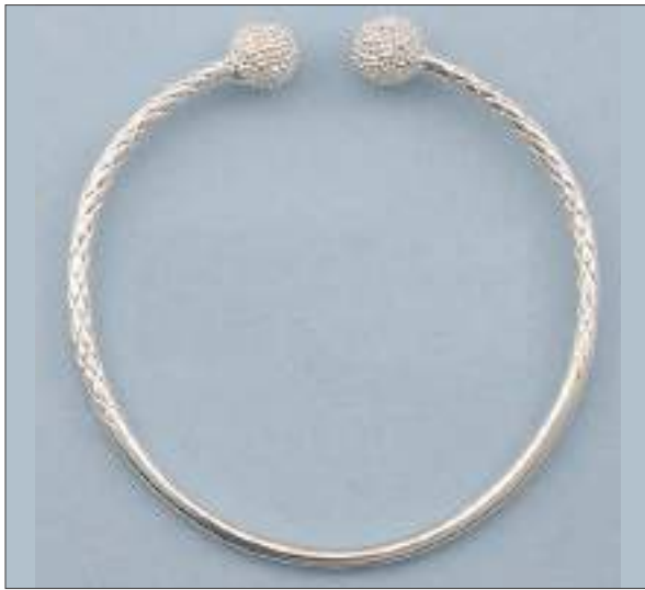
JBN110367D64MSL WT: 21.8 gm