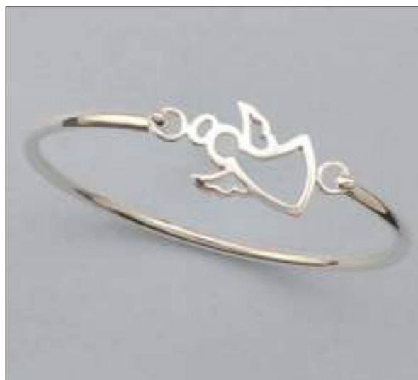
JBN110498D60MSL WT: 7.2 gm