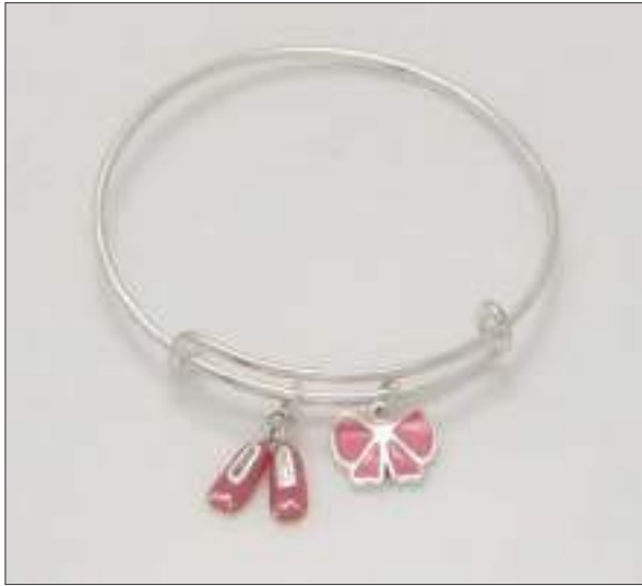
BG110855D45MEN WT: 5.75 gm