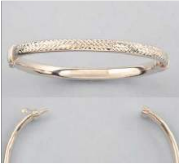
JBN1103052T WT: 10 gm