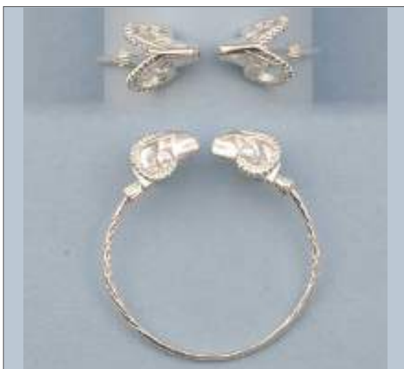
JBN110414D38MSL WT: 5.25 gm