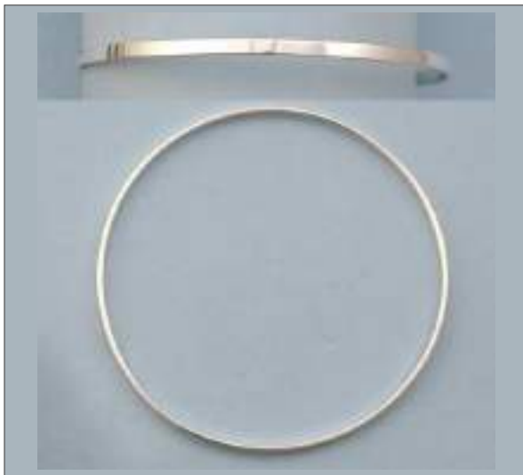
JBN110407D65MSL WT: 6.8 gm