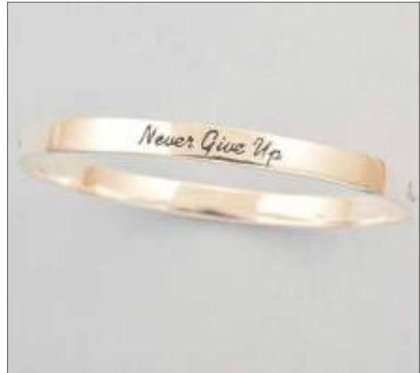
JBN110756D60MEN WT: 13.65 gm