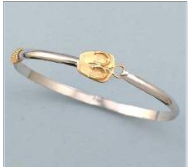
JBN1104362T WT: 9.1 gm