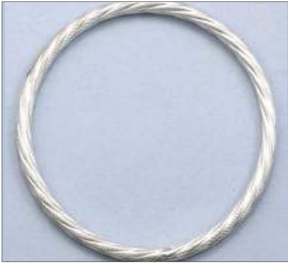
JBN110145D62MSL WT: 4.12 gm