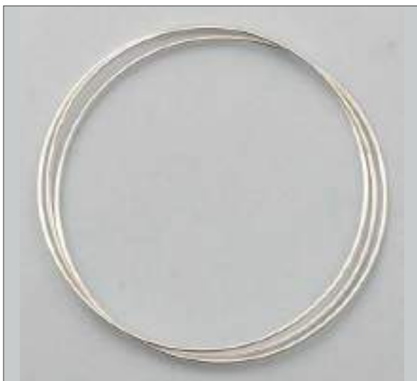
JBN110549D57MSL WT: 2.35 gm