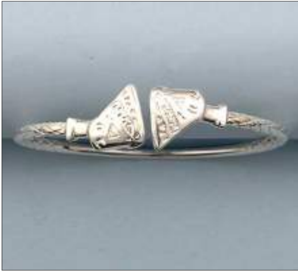
JBN110306D45MSL WT: 10 gm