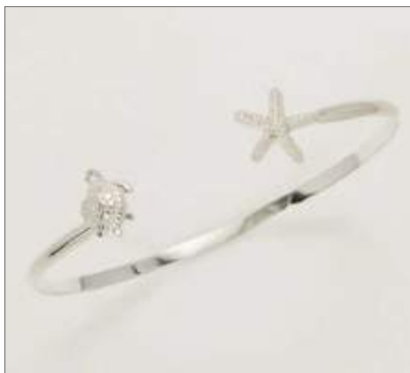
BG110999SL WT: 7.4 gm