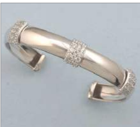
AF9199A18RNP WT: 0.63/7.57 gm