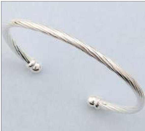
AF9237SL WT: 7.43 gm