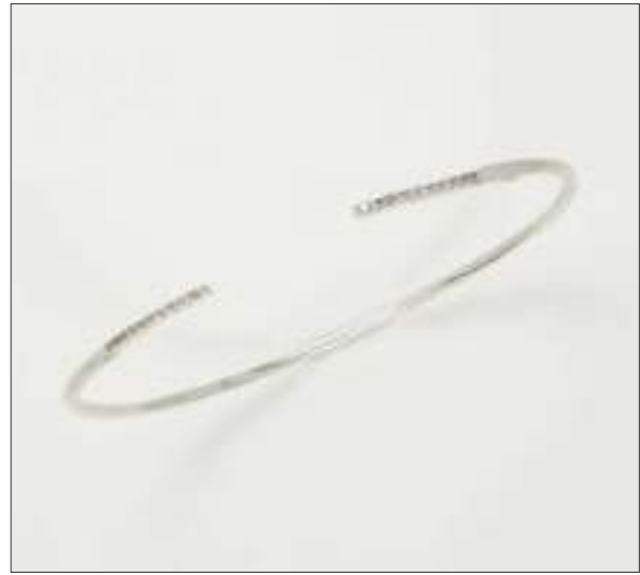
BG110948D51X60A18S WT: 0.18/2.32 gm