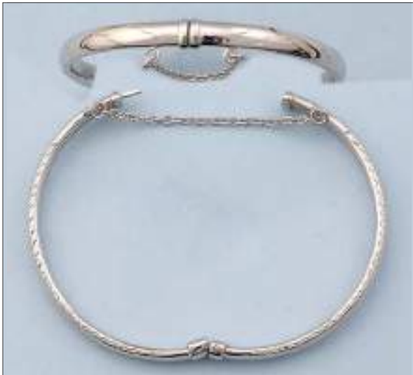
JBN110331D45MSL WT: 5.85 gm