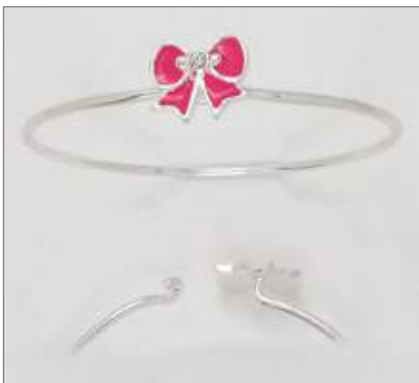
BG110893D45MG18EN WT: 0.01/3.69 gm