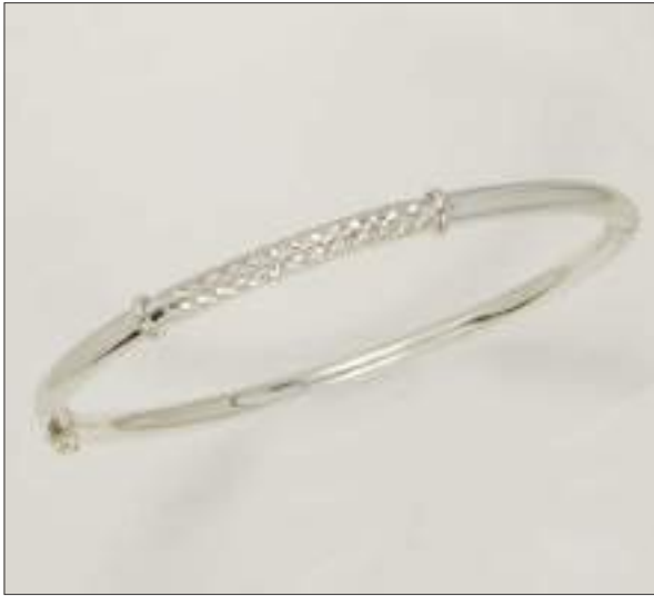
AF9328DC WT: 7.3 gm