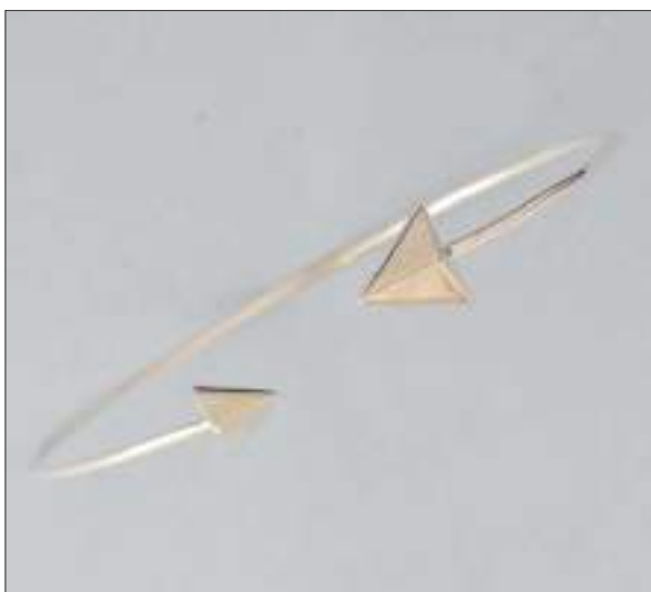
JBN110806D62MSL WT: 3.6 gm