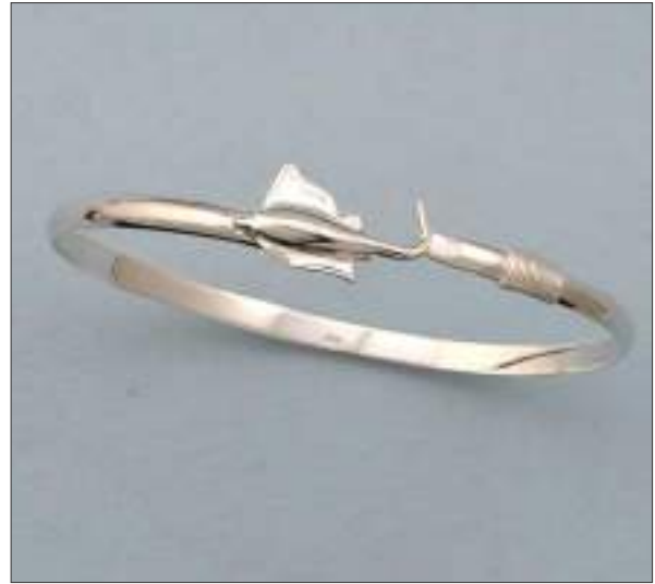
JBN110443SL WT: 9.2 gm