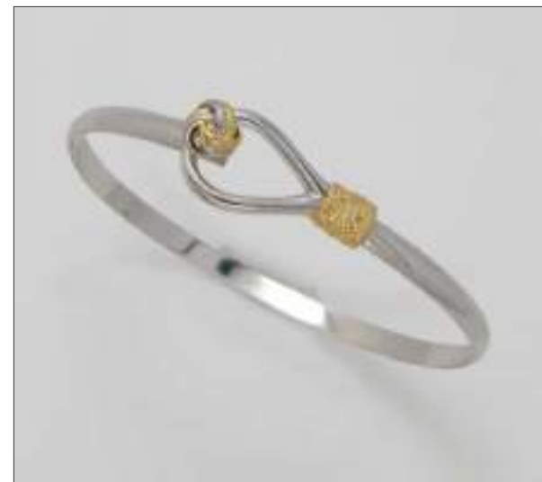
BG110876D54X64M2T WT: 11.25 gm