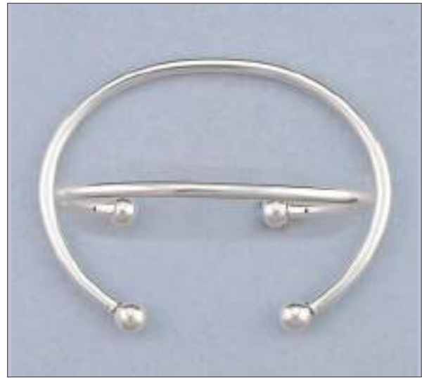
JBN110008SL WT: 5.97 gm