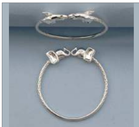
JBN110425D45MSL WT: 10.8 gm