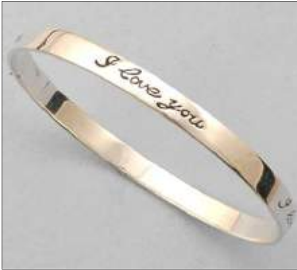
JBN110575D60MEN WT: 16.5 gm