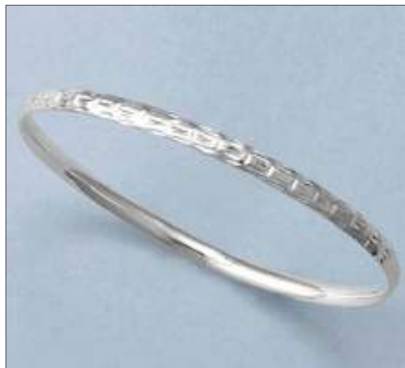
JBN110248D62MDC WT: 3.8 gm