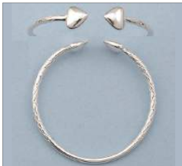
JBN110371D45MSL WT: 10.2 gm