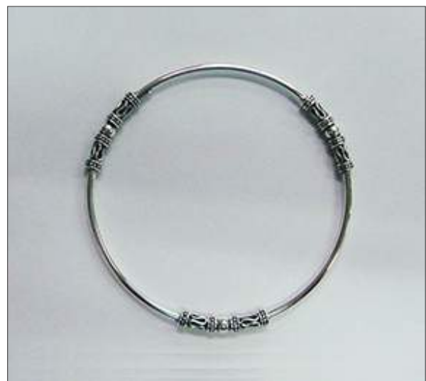
BG111060D61MAT WT: 6.21 gm