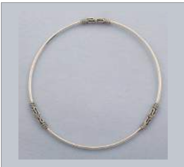
JBN110673D65MAT WT: 3.55 gm