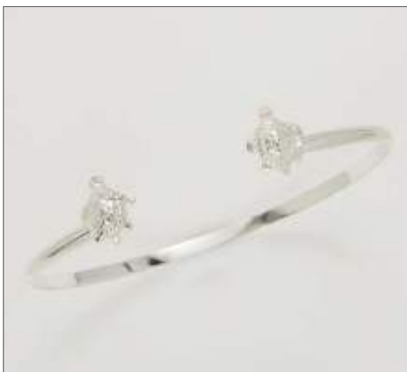
BG110996SL WT: 7.6 gm