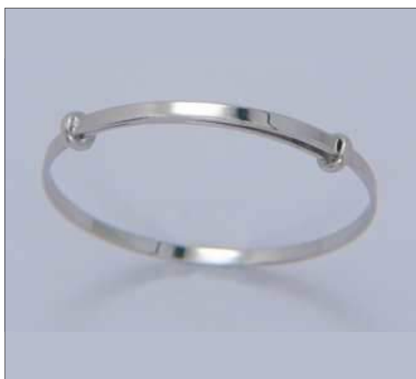
JBN110826D50MRH WT: 6.3 gm