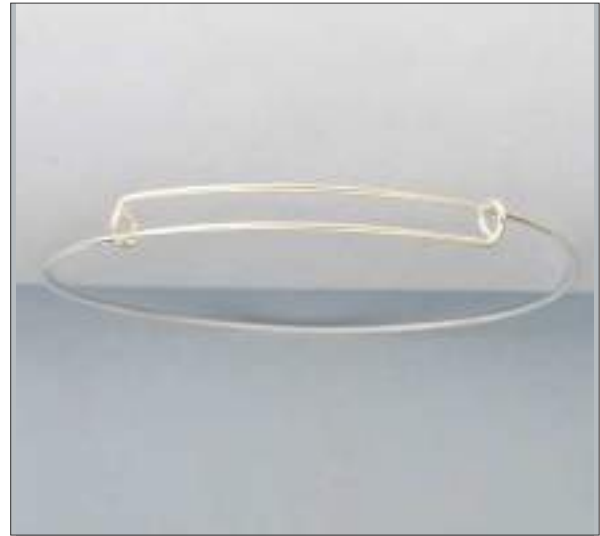
JBN110783D66MSL WT: 2.45 gm