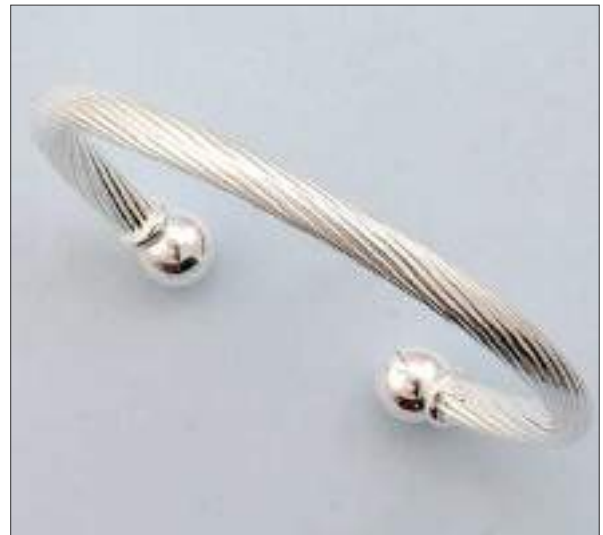
AF9238SL WT: 12.7 gm