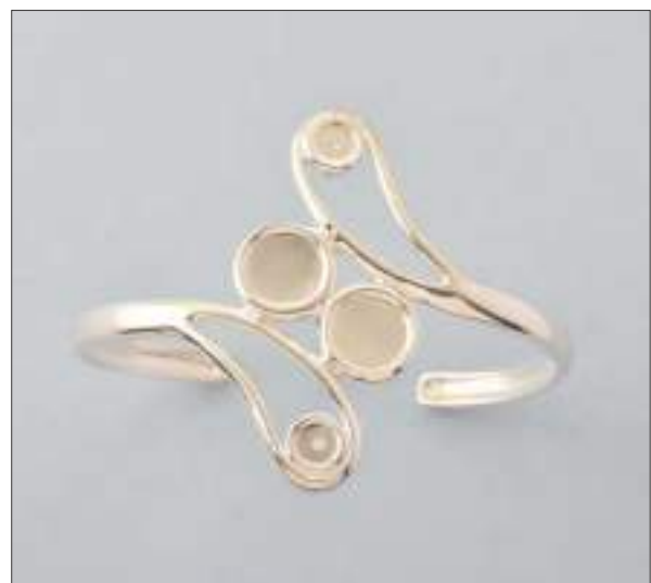
JBN110782D42X60MSL WT: 21.85 gm