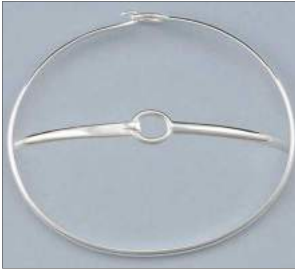
JBN110025SL WT: 7.39 gm