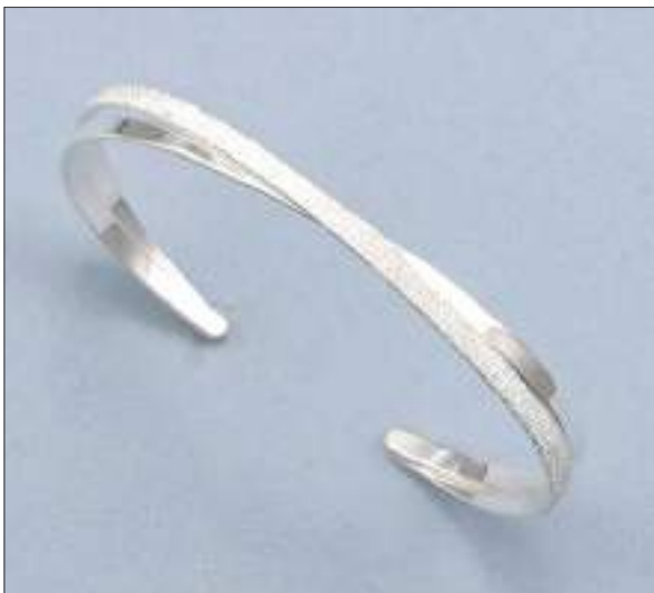
JBN1101472T WT: 9.85 gm