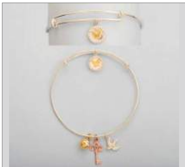
LZJBN110695D64M1MF WT: 0.07/9.53 gm