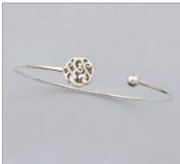
JBN110485D66MAT WT: 4.3 gm