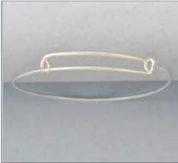
JBN110783D51MSL WT: 1.95 gm