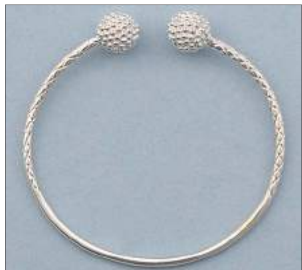
JBN110366D38MSL WT: 4.9 gm