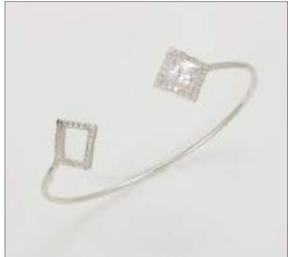
BG110950D51X60A18S WT: 0.88/4.02 gm