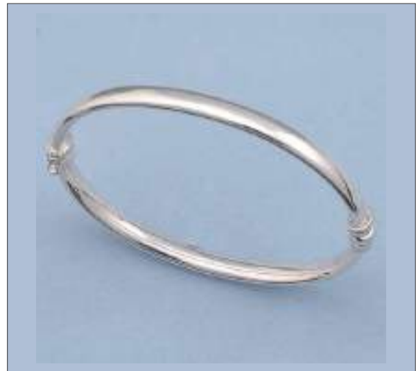
JBN110305SL WT: 15.88 gm