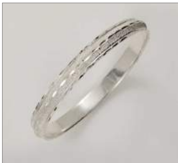
BG110844D60HM3T WT: 24.1 gm