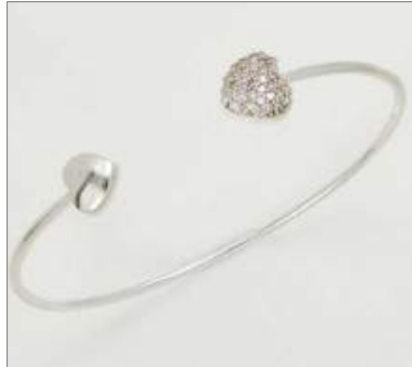
BG110957D51X60A18S WT: 0.15/3.95 gm