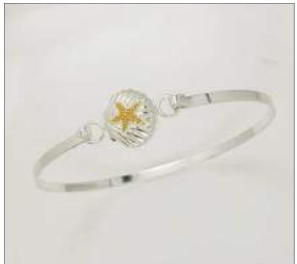
BG1109862T WT: 8 gm