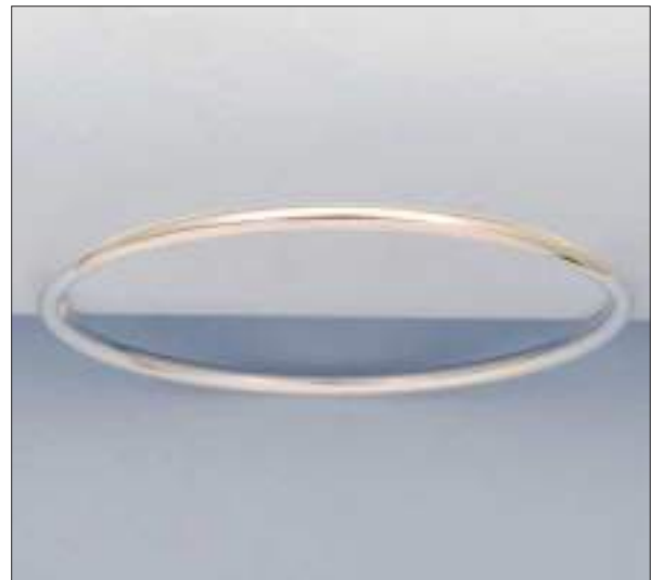
AF9293D65MSL WT: 4.3 gm