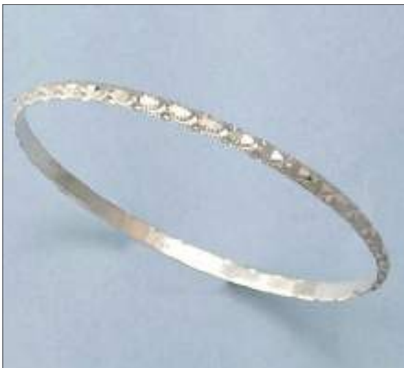
JBN110231D66MDC WT: 9.65 gm