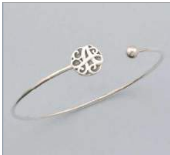
JBN110481D66MAT WT: 4.6 gm