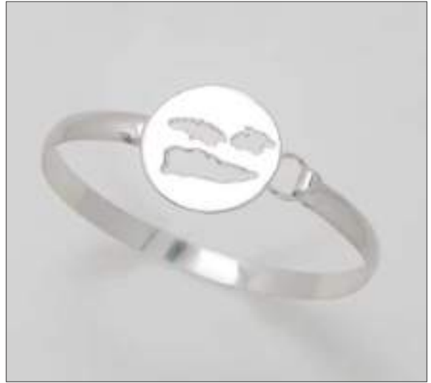
BG110878D56X62MSL WT: 12.45 gm