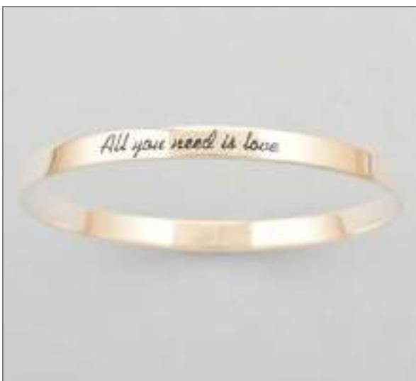
JBN110750D60MEN WT: 14 gm