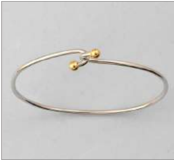
JBN110555D45X60M2T WT: 6.35 gm