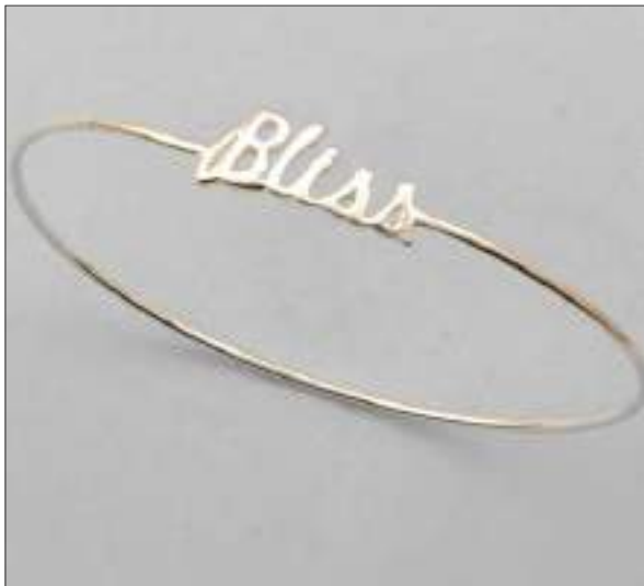
JBN110585D65MSL WT: 3.5 gm