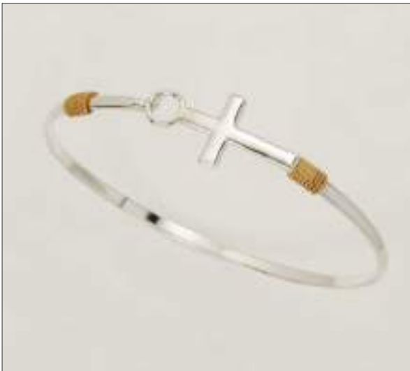
BG1110402T WT: 7.6 gm