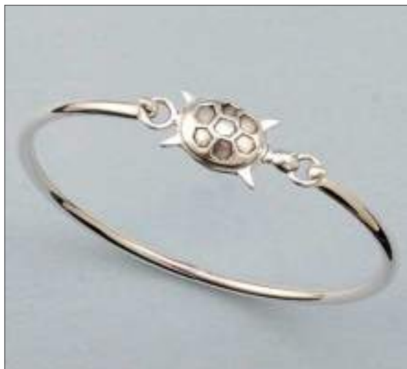
JBN110508D60MAT WT: 7.2 gm