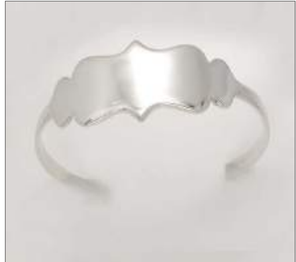
BG110961SL WT: 23.05 gm