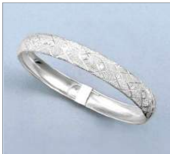
AF90972T WT: 6.6 gm