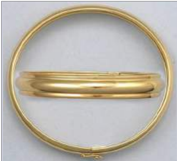
AF9004FG WT: 9.5 gm