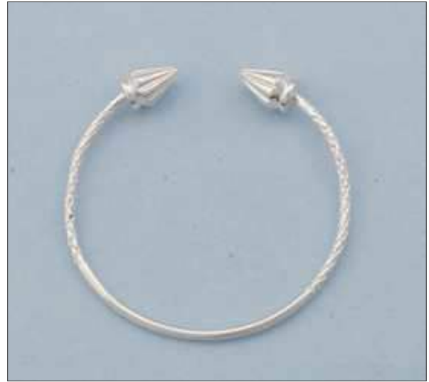
JBN110336D38MSL WT: 5 gm