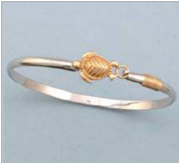
JBN110459S50X65M2T WT: 9.55 gm