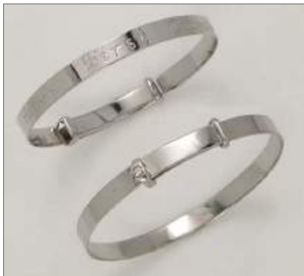
BG111030RH WT: 3 gm