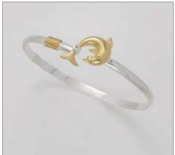
BG110883D52X64M2T WT: 10.65 gm