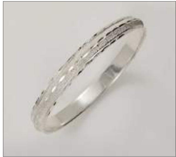
BG110844D60HM3T WT: 24.1 gm