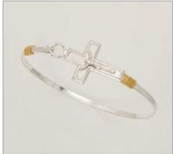
BG1110392T WT: 8.9 gm