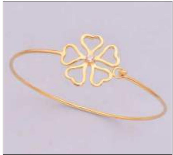
JBN110623D62MA18FG WT: 0.04/5.16 gm