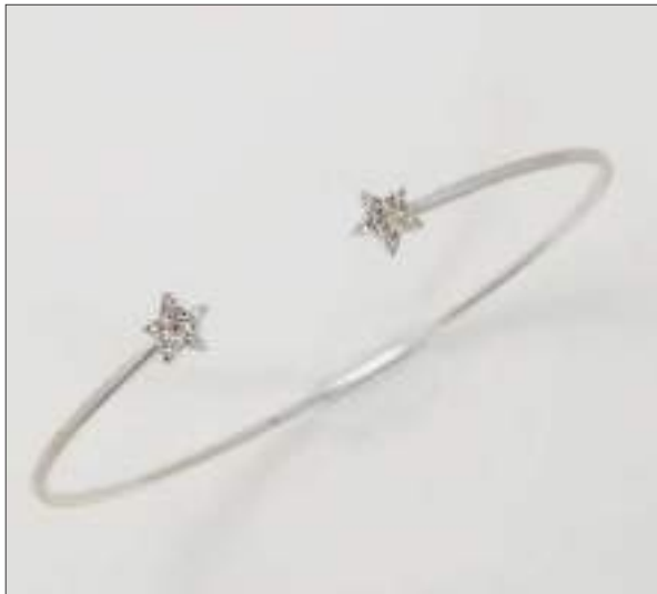
BG110884D62MA18SL WT: 0.08/2.37 gm