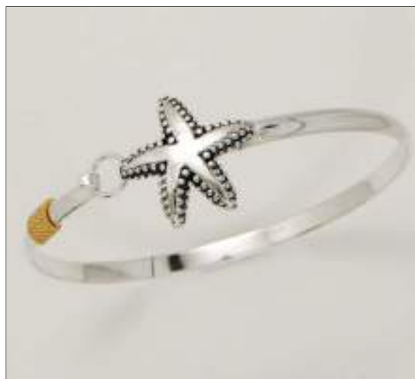
BG1110043T WT: 11.75 gm