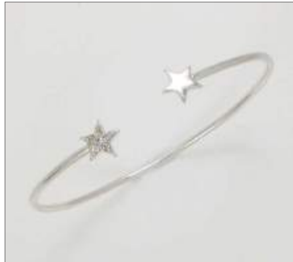
BG110940D53X60A18S WT: 0.04/2.81 gm