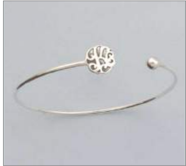
JBN110487D66MAT WT: 4.4 gm