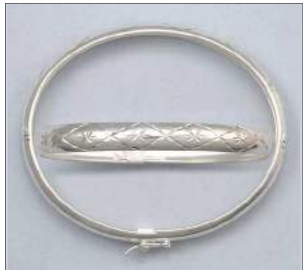
AF9007DC WT: 4.7 gm