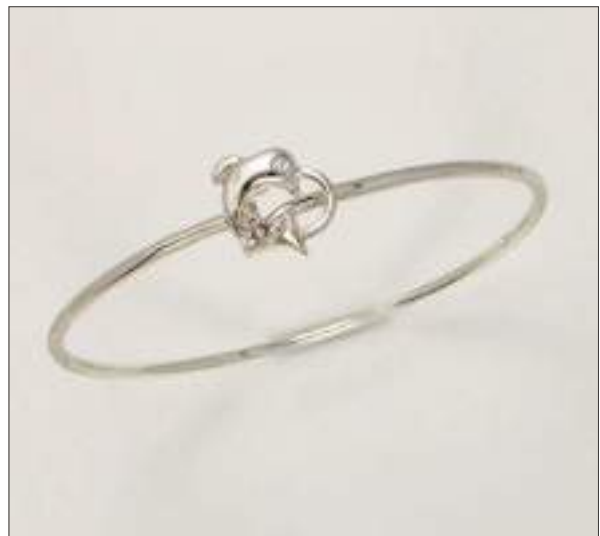
BG110907D45MA18SL WT: 0.02/3.48 gm