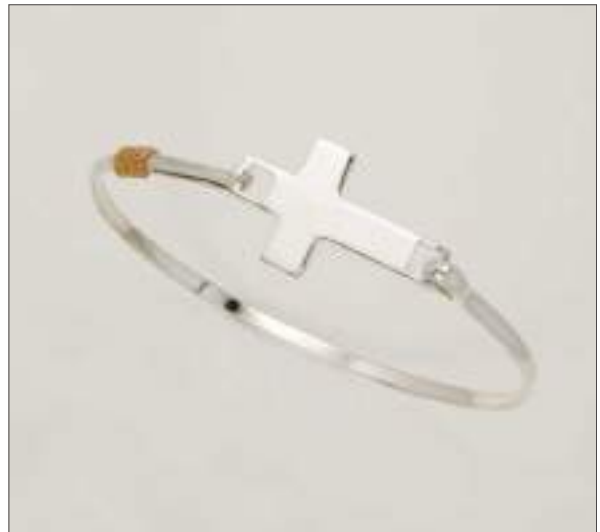
BG1110362T WT: 8 gm