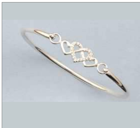
JBN110496D60MA18SL WT: 6.85 gm