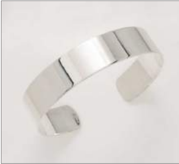
BG110984SL WT: 25.35 gm