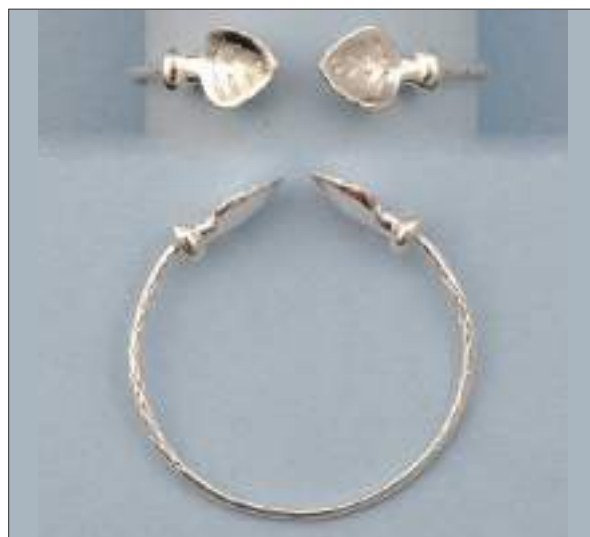
JBN110419D38MSL WT: 4.15 gm