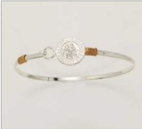
BG1110332T WT: 9.2 gm