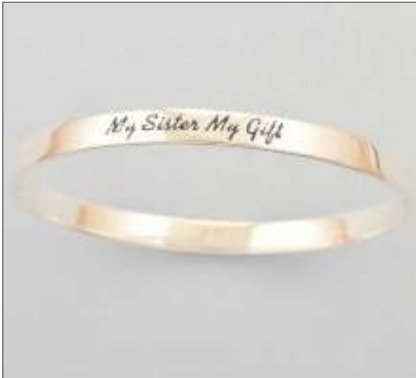
JBN110755D60MEN WT: 14.35 gm