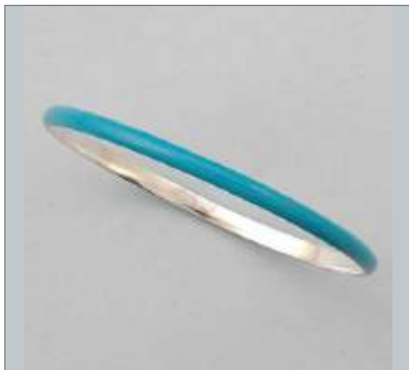
JBN110540D66MEN WT: 11.4 gm