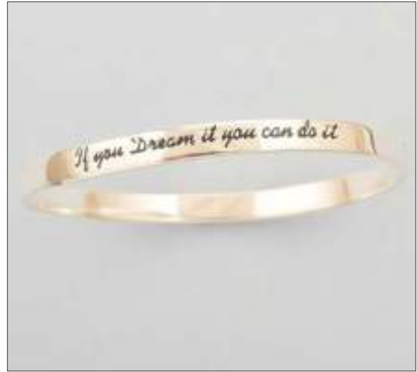
JBN110747D60MEN WT: 13.75 gm