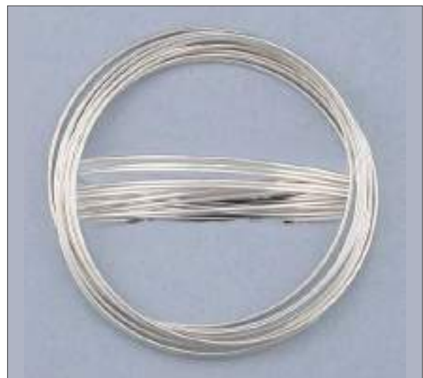
JBN110001SL WT: 18.12 gm