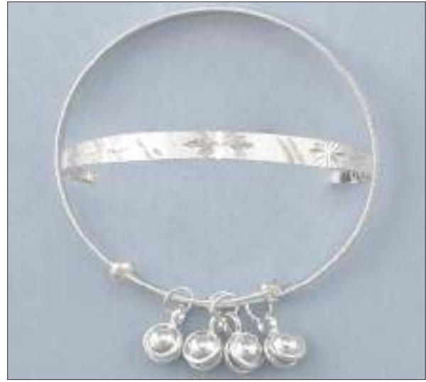
JBN110026DC WT: 6.1 gm