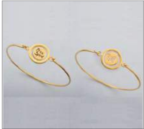
JBN110654D62MA182T WT: 0.04/7.51 gm