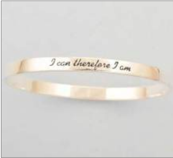
JBN110746D60MEN WT: 13.8 gm