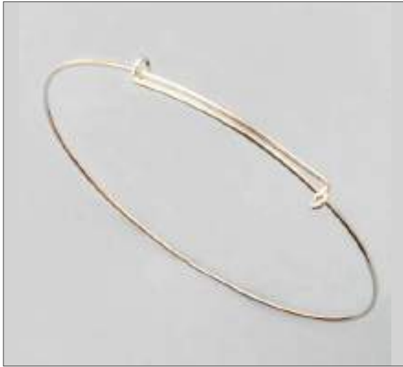
JBN110580D60MSL WT: 2.1 gm