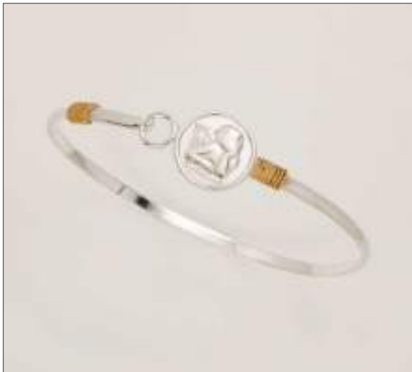
BG1110352T WT: 8.95 gm