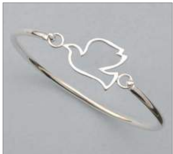
JBN110506D60MSL WT: 6.5 gm