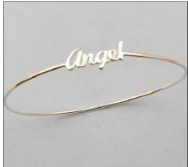
JBN110586D65MSL WT: 3.55 gm