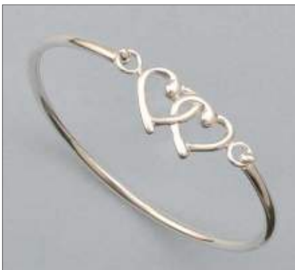
JBN110505D60MSL WT: 7.35 gm