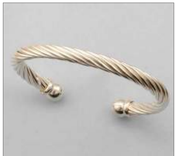
AF9256SL WT: 22 gm