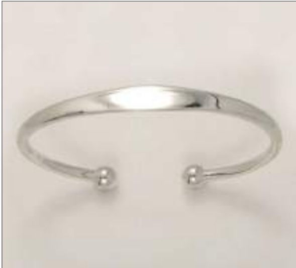
BG110920D45X70MSL WT: 20 gm