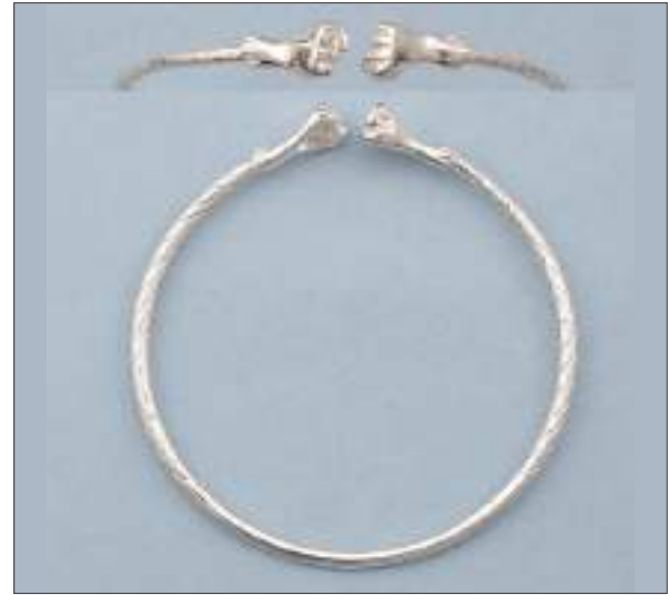
JBN110377D59MSL WT: 12.15 gm