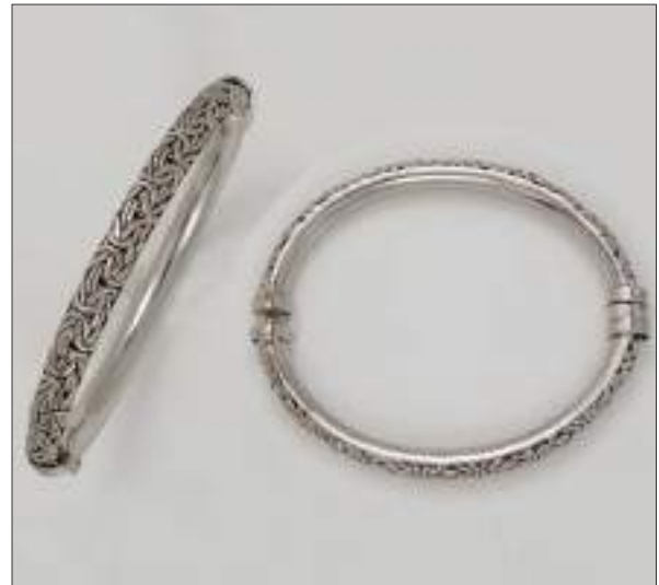
BG110863RH WT: 29.05 gm