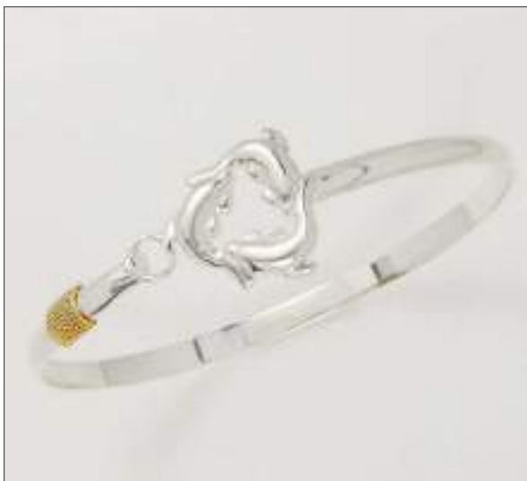
BG1110132T WT: 11.25 gm