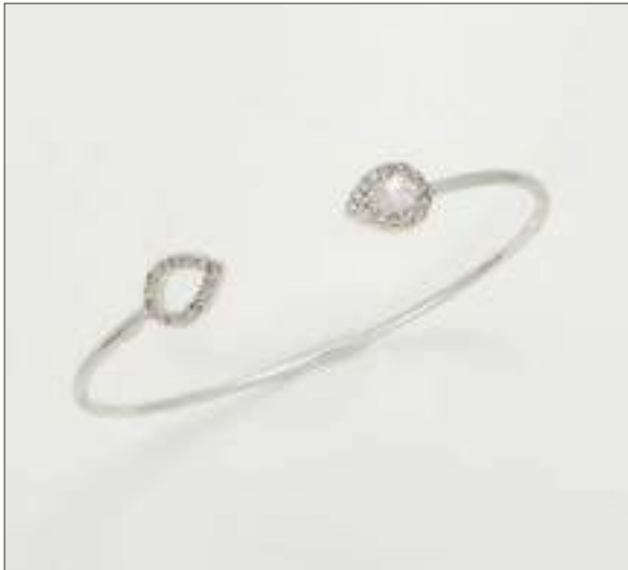
BG110949D51X60A18S WT: 0.31/3.09 gm