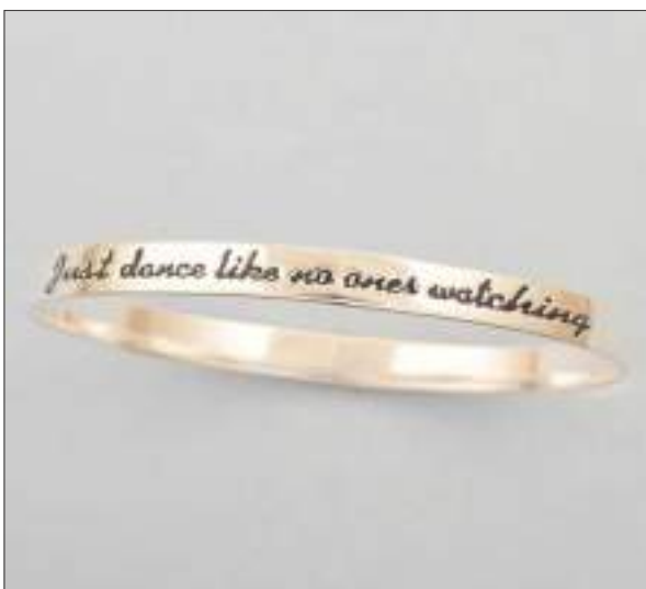
JBN110744D60MEN WT: 14.85 gm