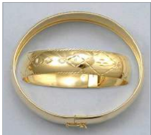
AF90122T WT: 7.8 gm