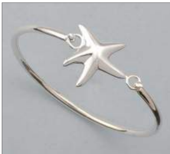
JBN110497D60MSL WT: 9.5 gm