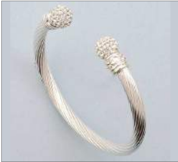
URAF9240SL WT: 15.9 gm