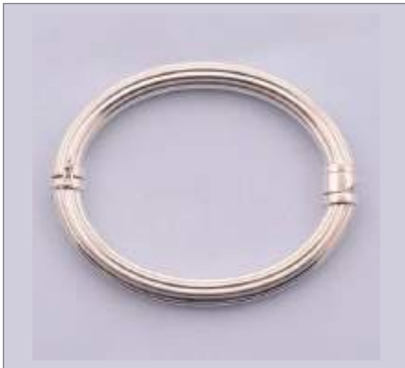
AF9272SL WT: 24.4 gm