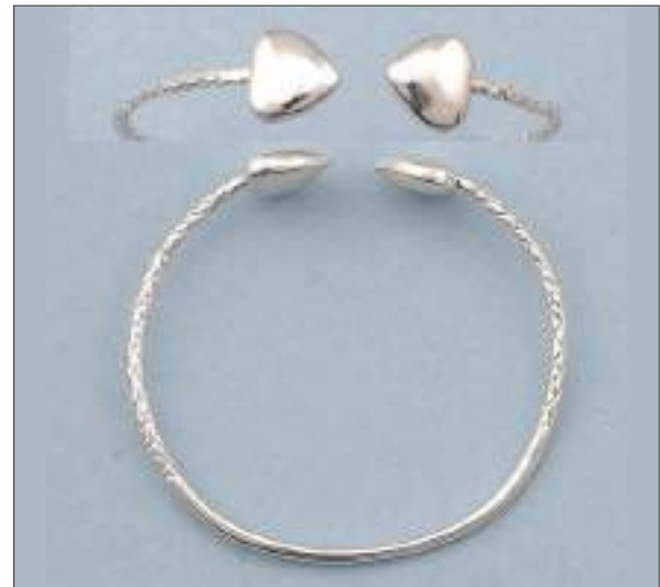
JBN110379D38MSL WT: 4.8 gm