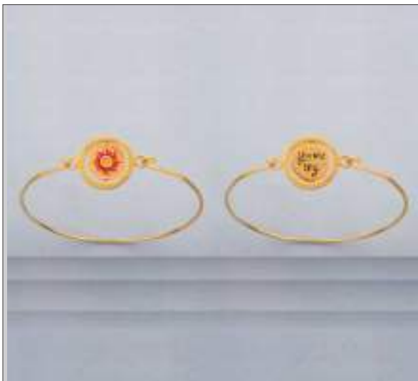
JBN110658D62MG182T WT: 7.52 gm