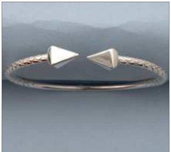
JBN110431D70MSL WT: 29.75 gm