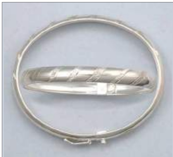
AF9008DC WT: 4.5 gm