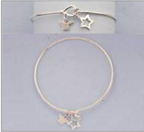
JBN110649D66MA18SL WT: 0.09/5.76 gm