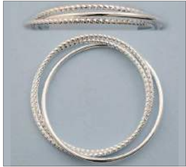
JBN110478D63MSL WT: 18.3 gm