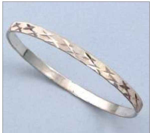
JBN110232D66MDC WT: 9.12 gm