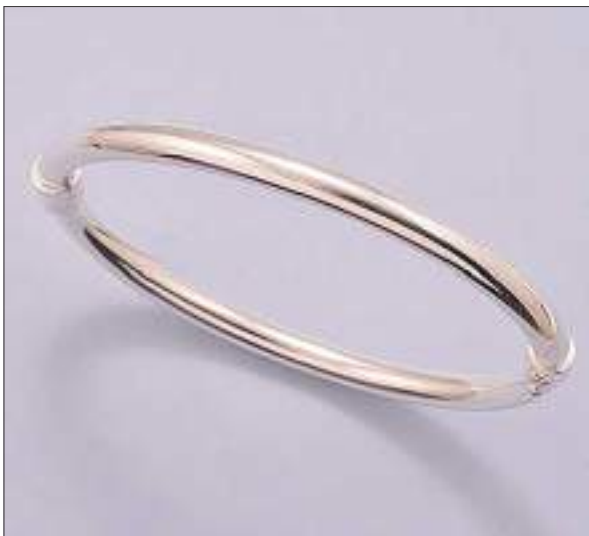
AF9268SL WT: 11 gm