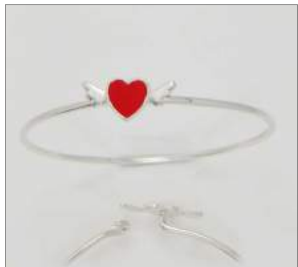
BG110894D45MEN WT: 3.45 gm