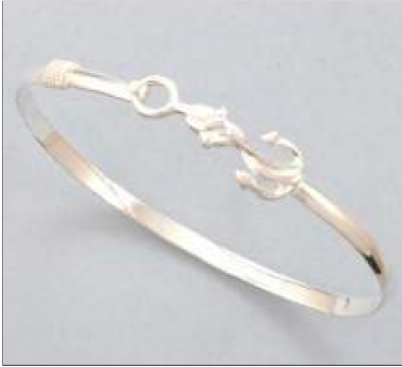
JBN110591D54X70MSL WT: 10.9 gm