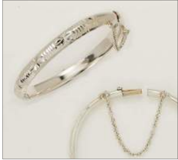
AFBG9334D40MDC WT: 5.7 gm