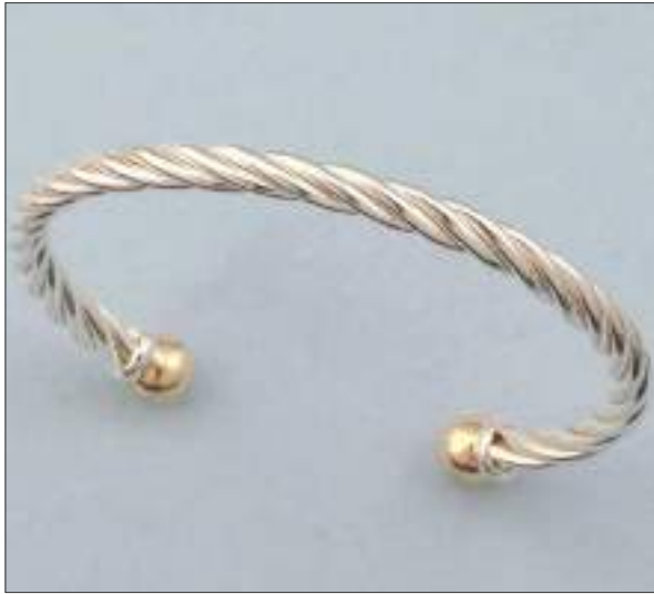
AF92062T WT: 16.6 gm