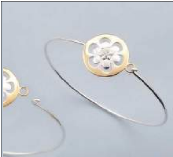
JBN110626D62MA182T WT: 6.4 gm