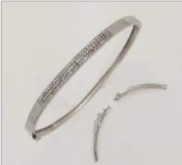
BG111046A18RH WT: 0.28/10.82 gm