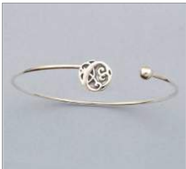
JBN110483D66MAT WT: 4.4 gm