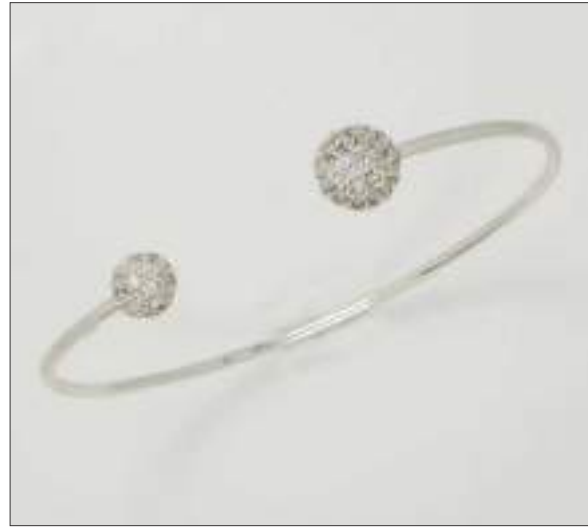
BG110962D51X60A18S WT: 0.44/3.71 gm