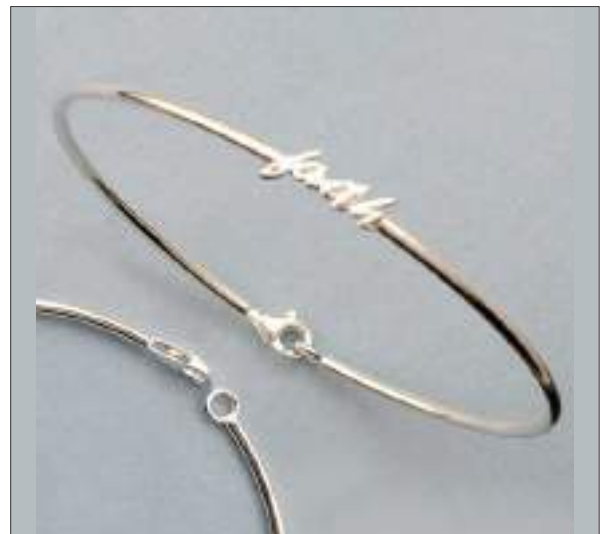
LZJBN110513D65MSL WT: 3.95 gm