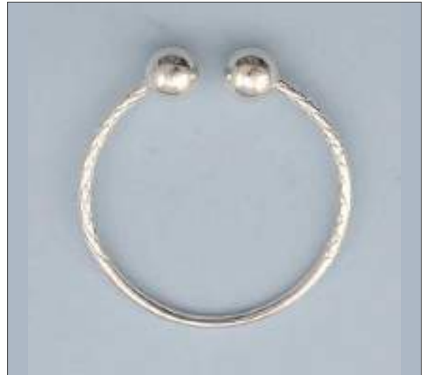
JBN110394D40MSL WT: 7.7 gm