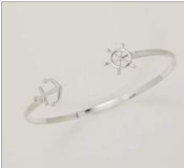
BG110993SL WT: 6.8 gm