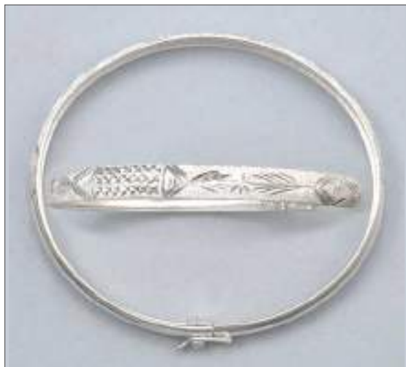
AF90102T WT: 4 gm