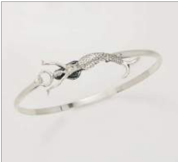
BG110978AT WT: 9.35 gm