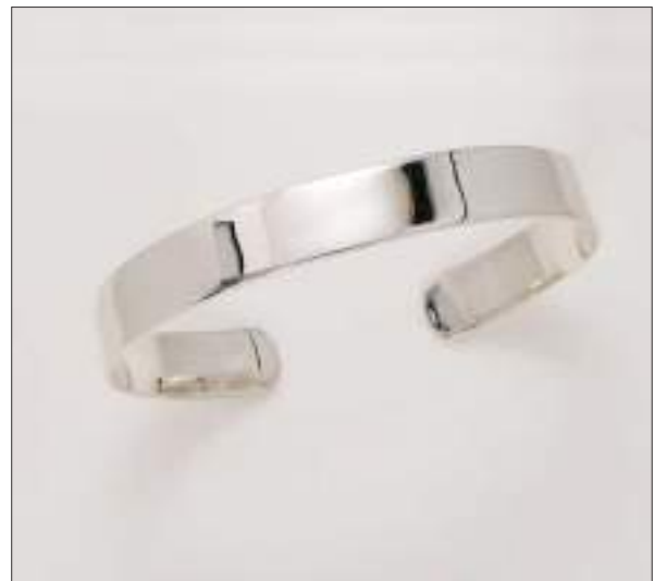
BG110983SL WT: 18.6 gm