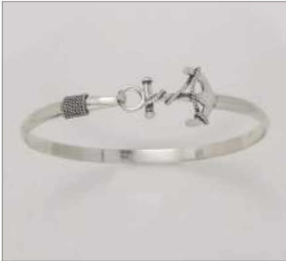
BG110990AT WT: 10.6 gm