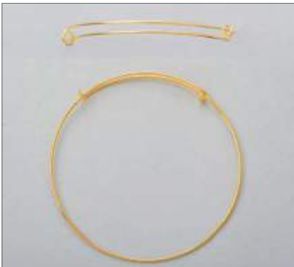
JBN110702D66MFG WT: 2.85 gm