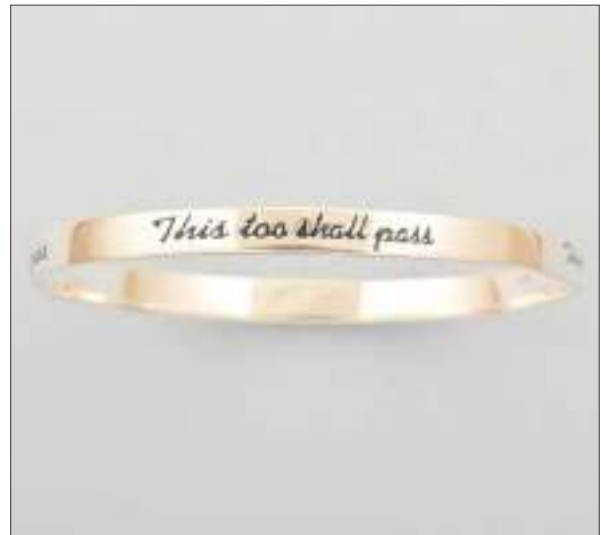
JBN110749D60MEN WT: 16.05 gm