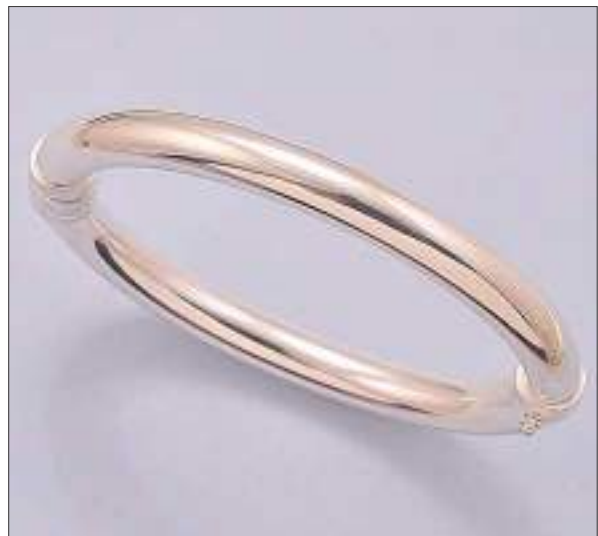
AF9269SL WT: 38 gm