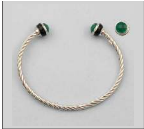
AF9259A252T WT: 0.48/13.22 gm