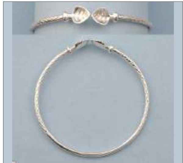
JBN110410D64MSL WT: 15.4 gm