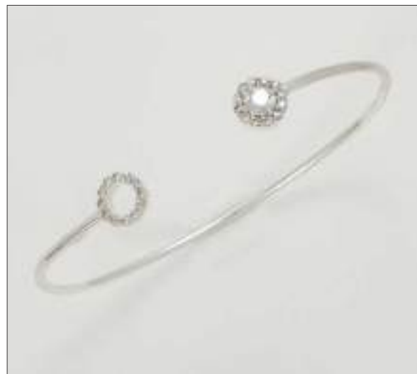
BG110959D51X60A18S WT: 0.28/2.97 gm