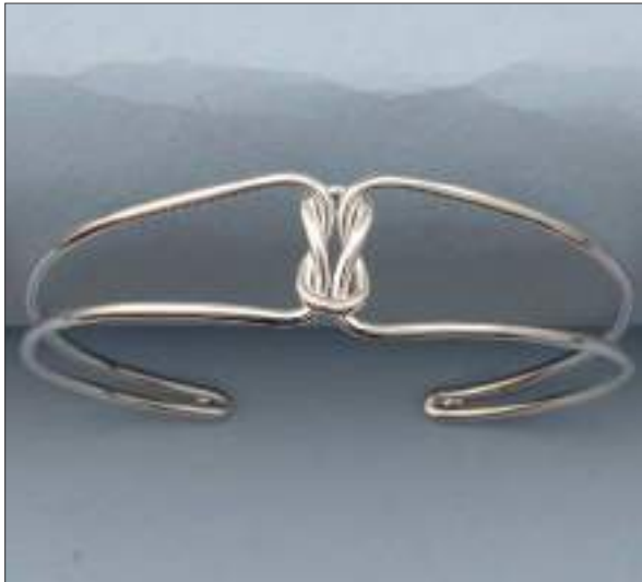
JBN110432SL WT: 10.45 gm