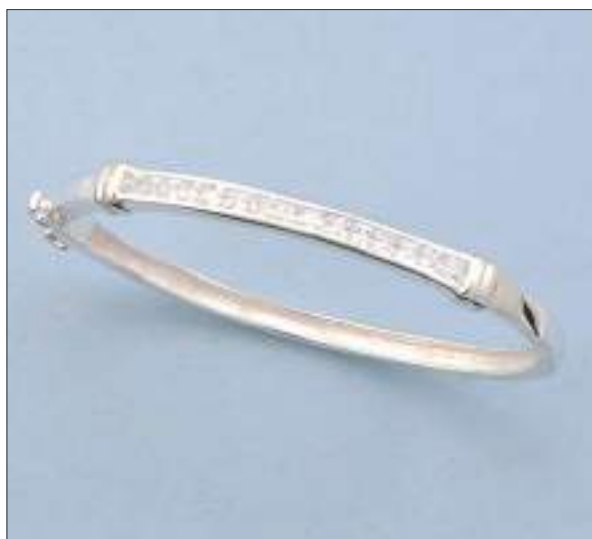
JBN110318A18SL WT: 0.83/15.17 gm