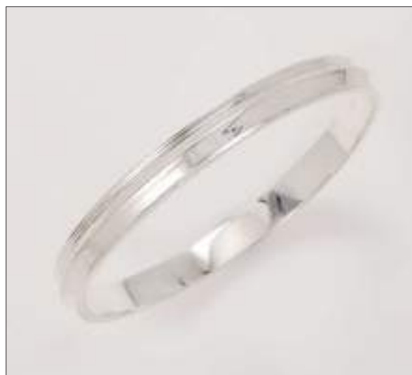
BG110203D60HMSL WT: 26 gm