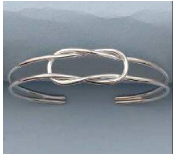
JBN110433SL WT: 11.1 gm