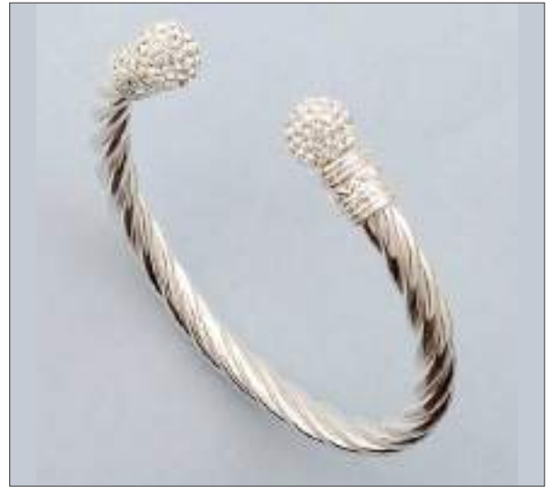
URAF9241SL WT: 25.1 gm