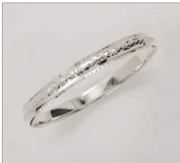
BG110846D60HMDC WT: 22.8 gm