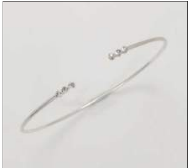
BG110885D62MA18SL WT: 0.02/2.32 gm