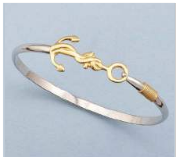
JBN1103502T WT: 13.75 gm