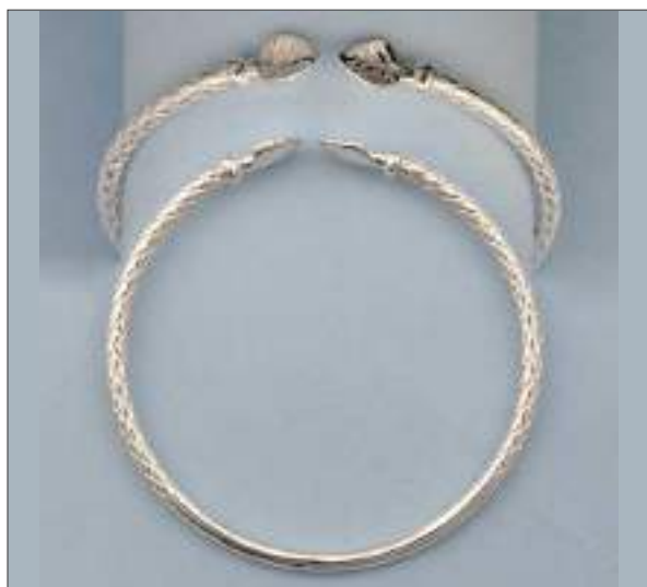
JBN110418D70MSL WT: 25.15 gm