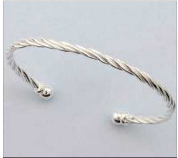
AF9236SL WT: 10 gm