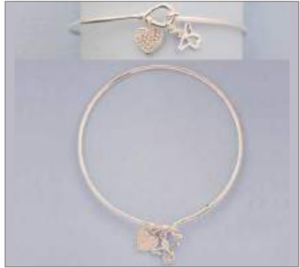
JBN110650D66MA18SL WT: 0.01/5.8 gm