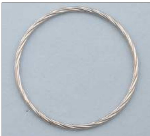
AF9166D66MRH WT: 5.5 gm