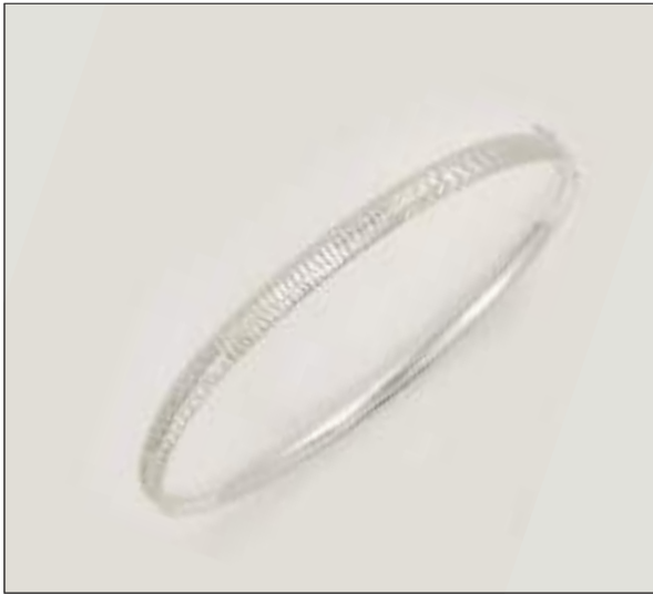
AFBG9332DC WT: 6 gm