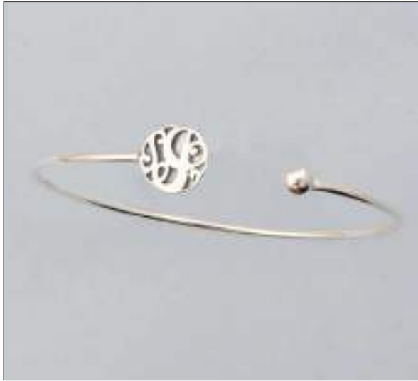
JBN110486D66MAT WT: 4.55 gm