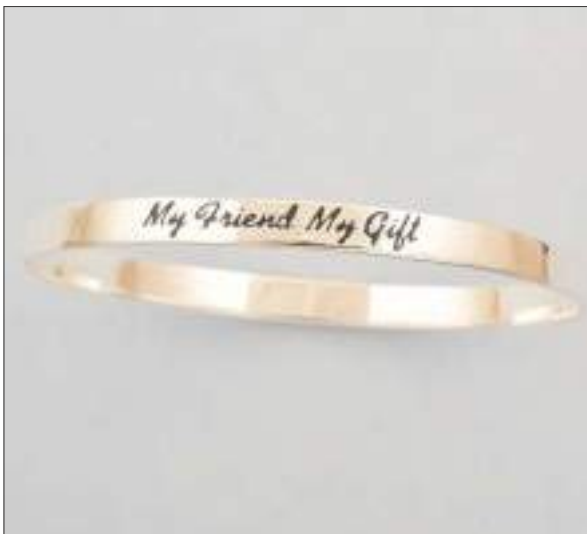
JBN110757D60MEN WT: 13.65 gm