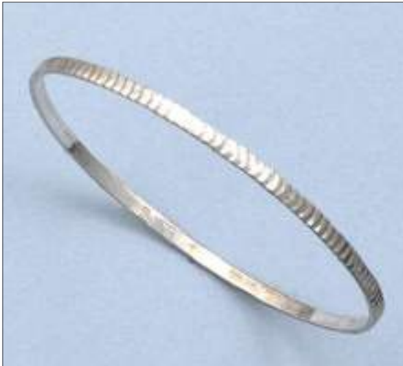
JBN110228D66MDC WT: 5.4 gm