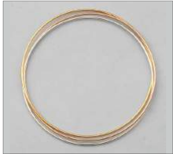
JBN110549D57M3T WT: 2.35 gm