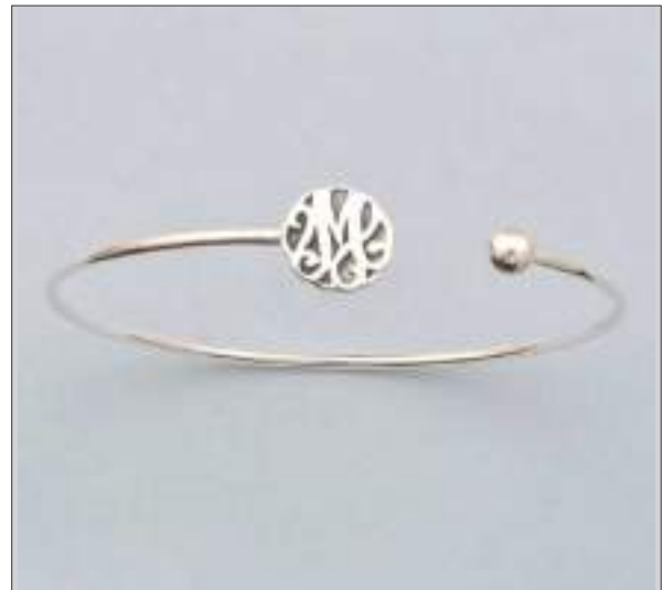
JBN110489D66MAT WT: 4.25 gm