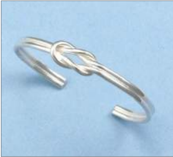
JBN110224S57X49MSL WT: 15 gm