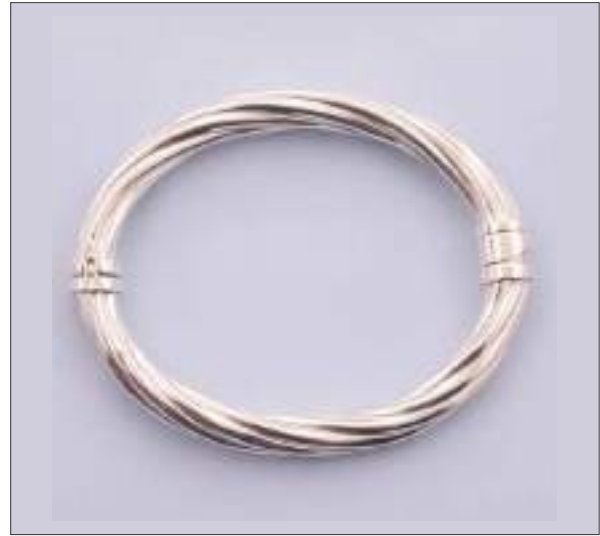
AF9271SL WT: 31 gm