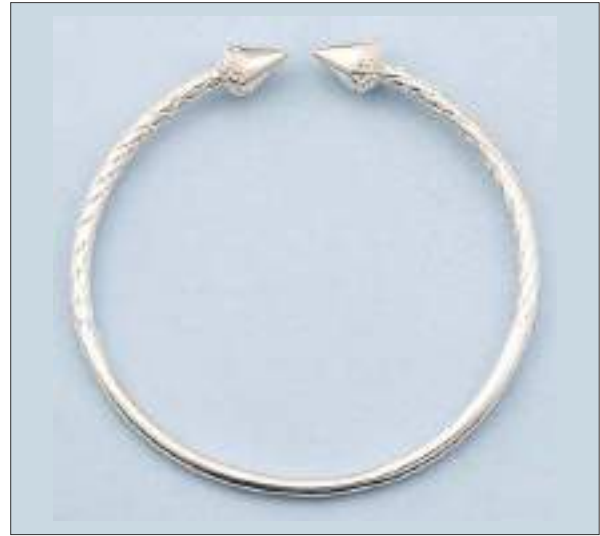
JBN110342D64MSL WT: 19 gm