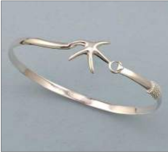
JBN110441SL WT: 9.5 gm