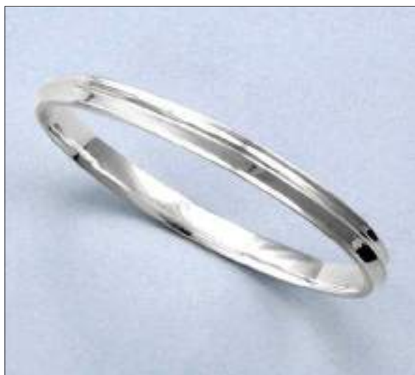
JBN110203D65MSL WT: 28.5 gm