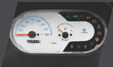
Advance information display