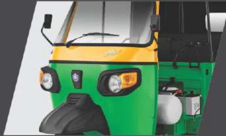
Attractive design and looks