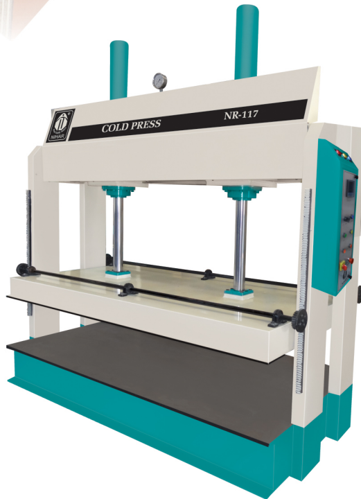
Cold Press (50 Ton) NR - 117 - 2C