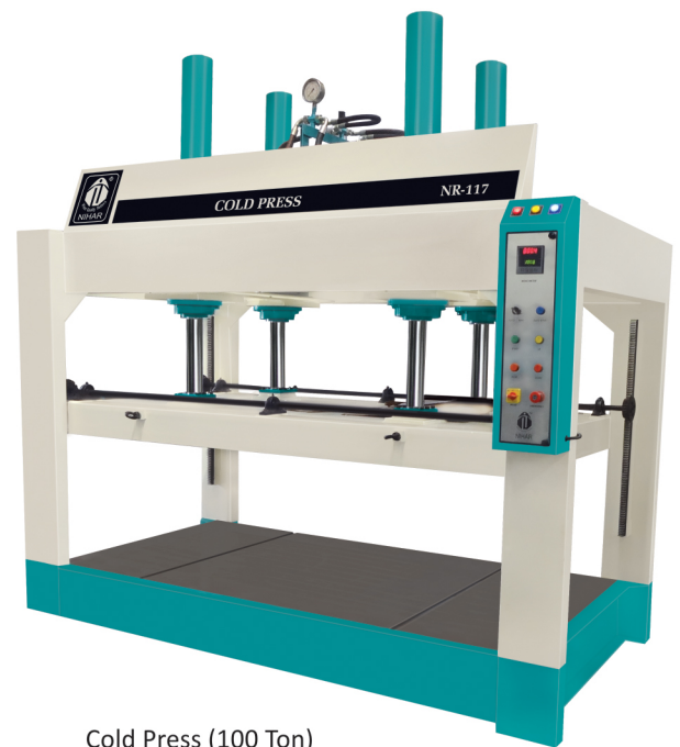
Cold Press (100 Ton) NR - 117 - 4C