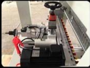
Horizontal drilling height regulator