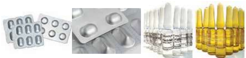
COMPACT MACHINE, STURDY DESIGN, EASY TO OPERATE