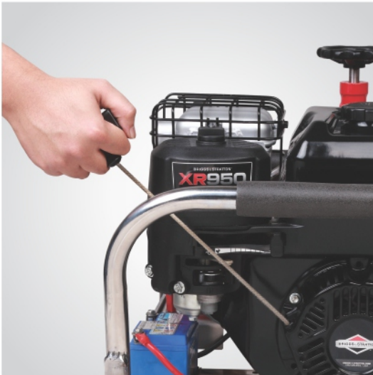
Recoil type Rope Start