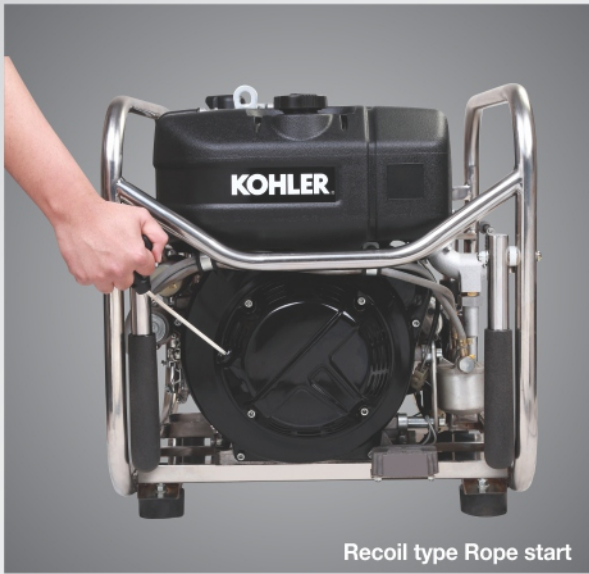
Recoil type Rope start