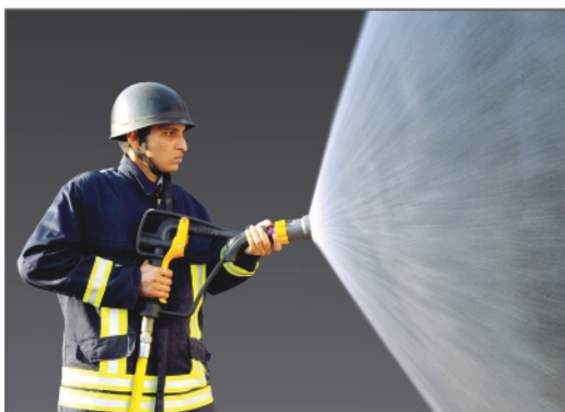
Protective Shield 120°