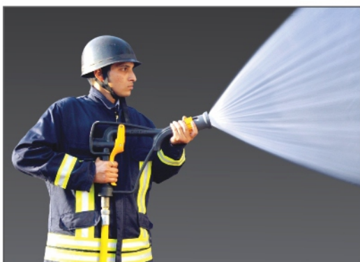
60° Attack Position