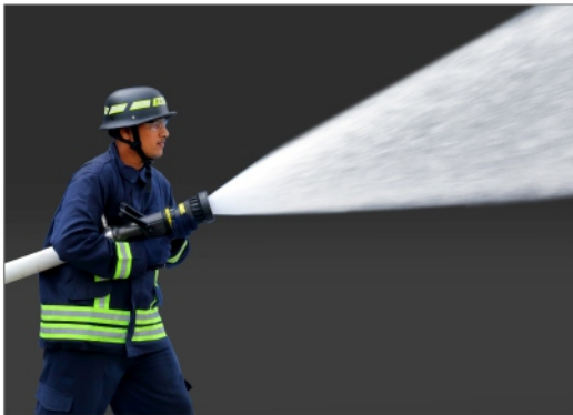
30° Attack Position