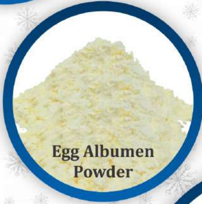
Egg Albumen Powder