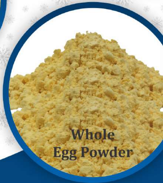
Whole Egg Powder