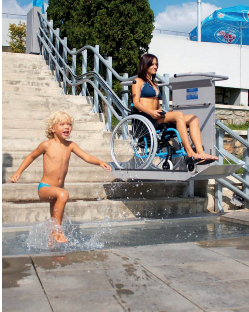
Robust platform mechanics allow installation in cold or wet locations

Fully automatic platform functions and ergonomic controls allow a simple and comfortable control of the platform.