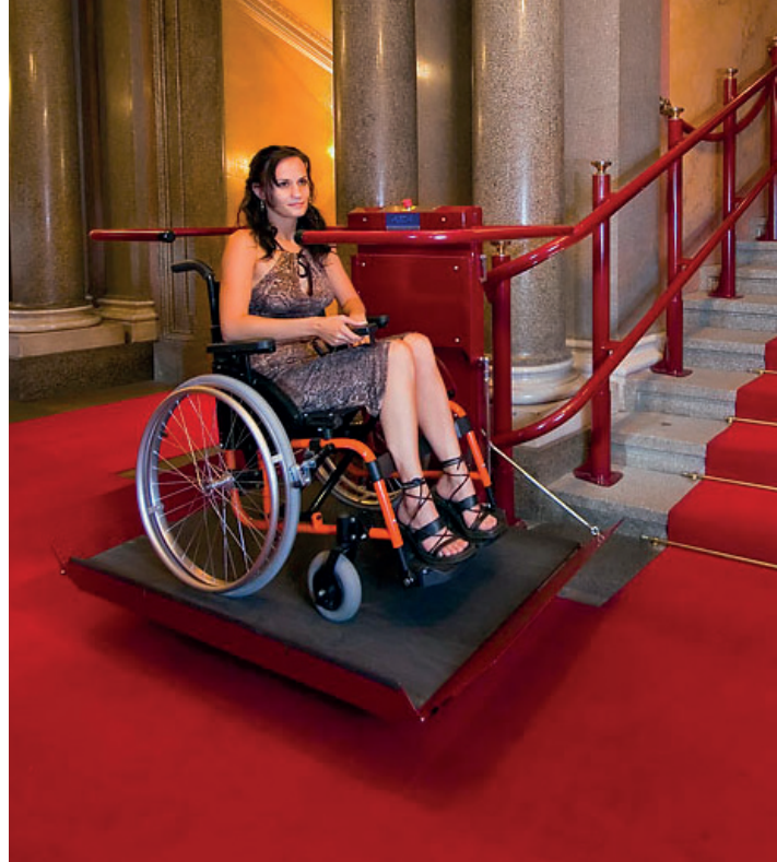
Available in any RAL colour , the platform can blend elegantly into any surrounding