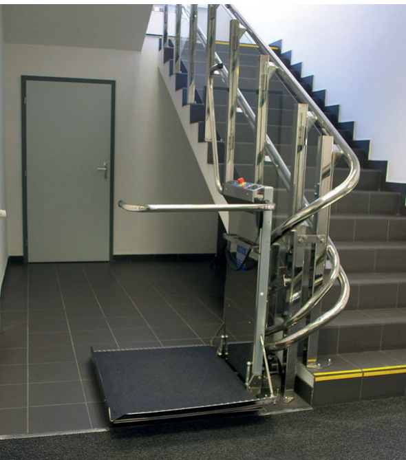
Available in a stainless steel version , the platform fulfils highest architectural standards