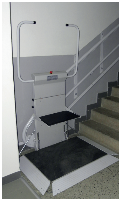
Special platform sizes and asymmetrical shapes to custom fit any staircase and maximize user friendliness!