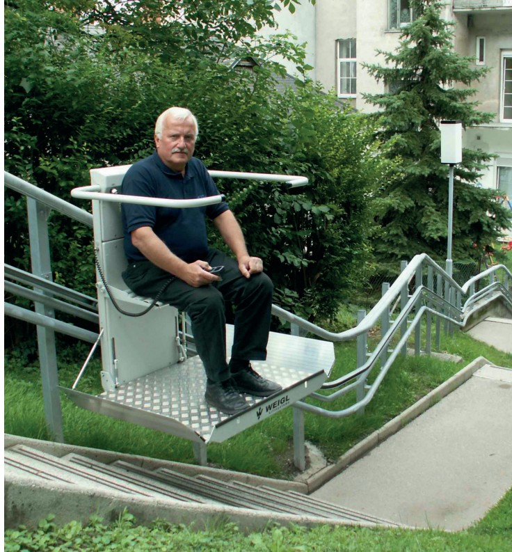
The drive without batteries allows for very long rail lengths