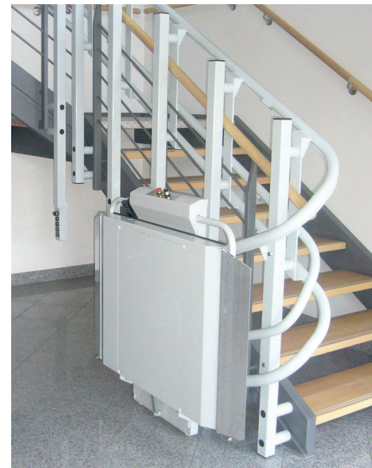
Very slim platform – The folded platform allows to comfortably store away the platform