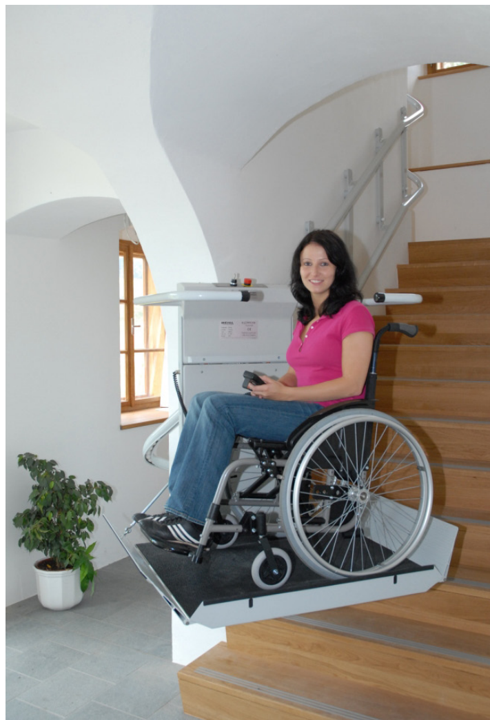
Rail fixing directly to the wall allows for a maximum platform size