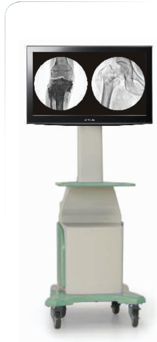
Mobile Trolley with 32" LCD HD Monitor