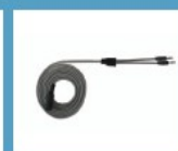
Bipolar Forcep Cable