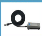
Single Foot Switch