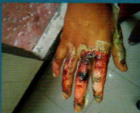
On application of ColloGraft (Day 1)

Available Sizes | 5 X 5 cms | 10 X 10 cms | 10 X 25 cms | 15 X 30 cms