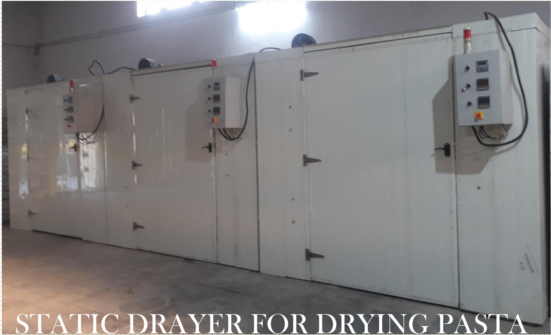
STATIC DRAYER FOR DRYING PASTA