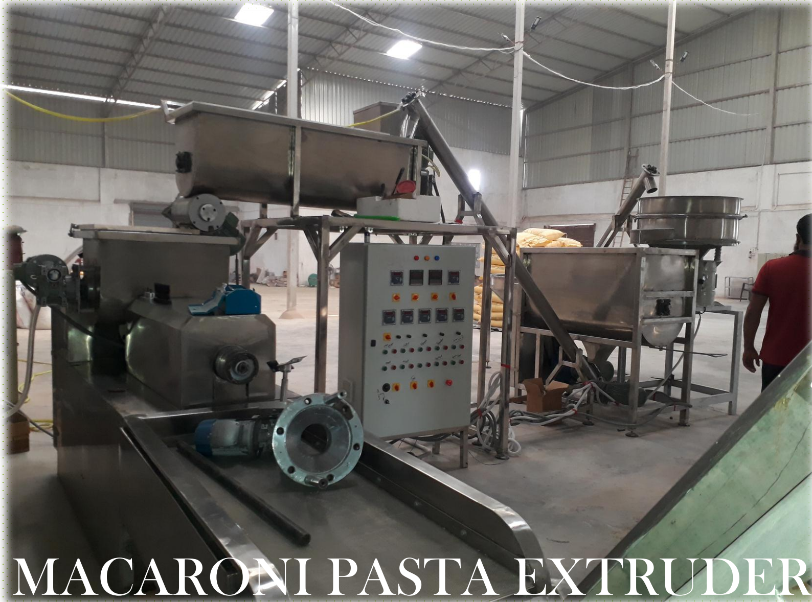
MACARONI PASTA EXTRUDER