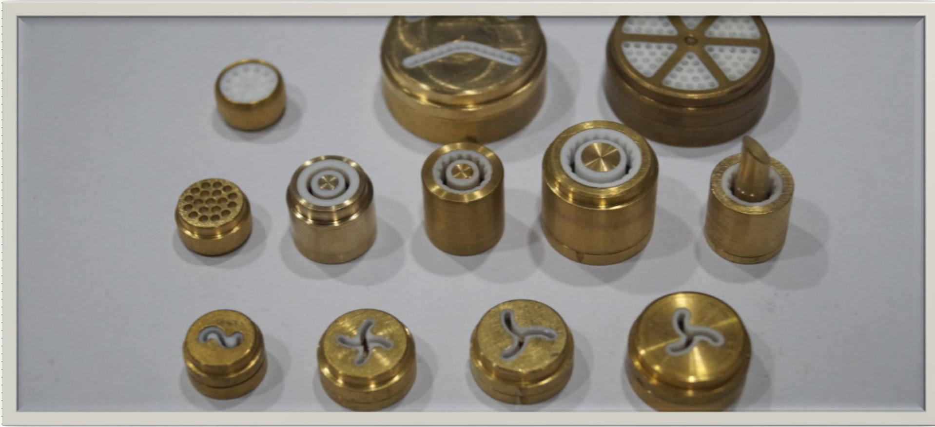
INSERTS OF MACARONI PASTA MACHINE