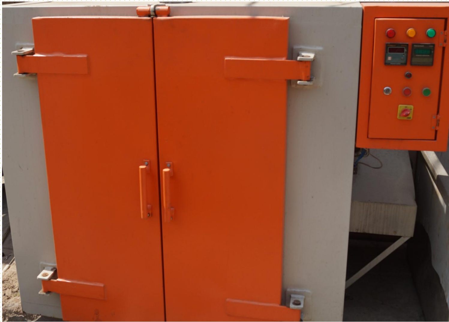
TRAY DRYER 50KG/BATCH