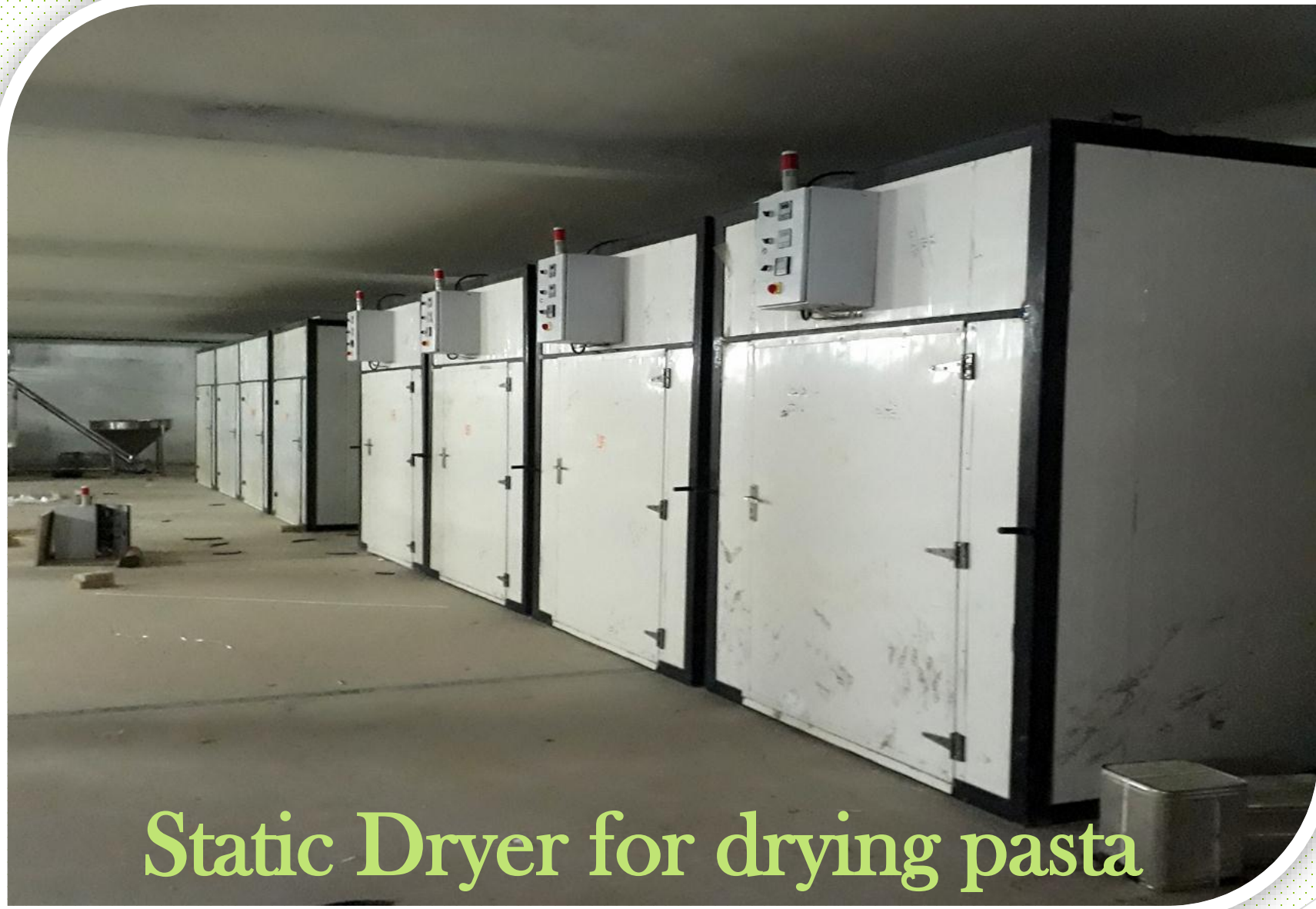
Static Dryer for drying pasta